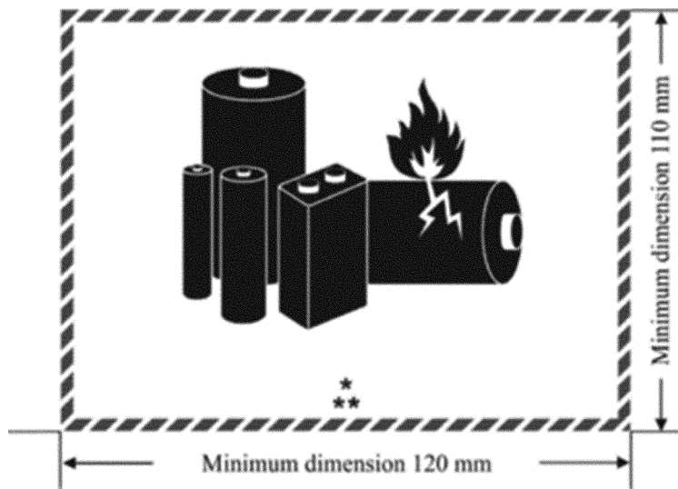
Figure 1 to paragraph (c)(3)(i)

(A) The mark must be in the form of a rectangle with hatched edging. The mark must be not less than 120 mm (4.7 inches) wide by 110 mm (4.3 inches) high and the minimum width of the hatching must be 5 mm (0.2 inches), except marks of 105 mm (4.1 inches) wide by 74 mm (2.9 inches) high may be used on a package containing lithium batteries when the package is too small for the larger mark;