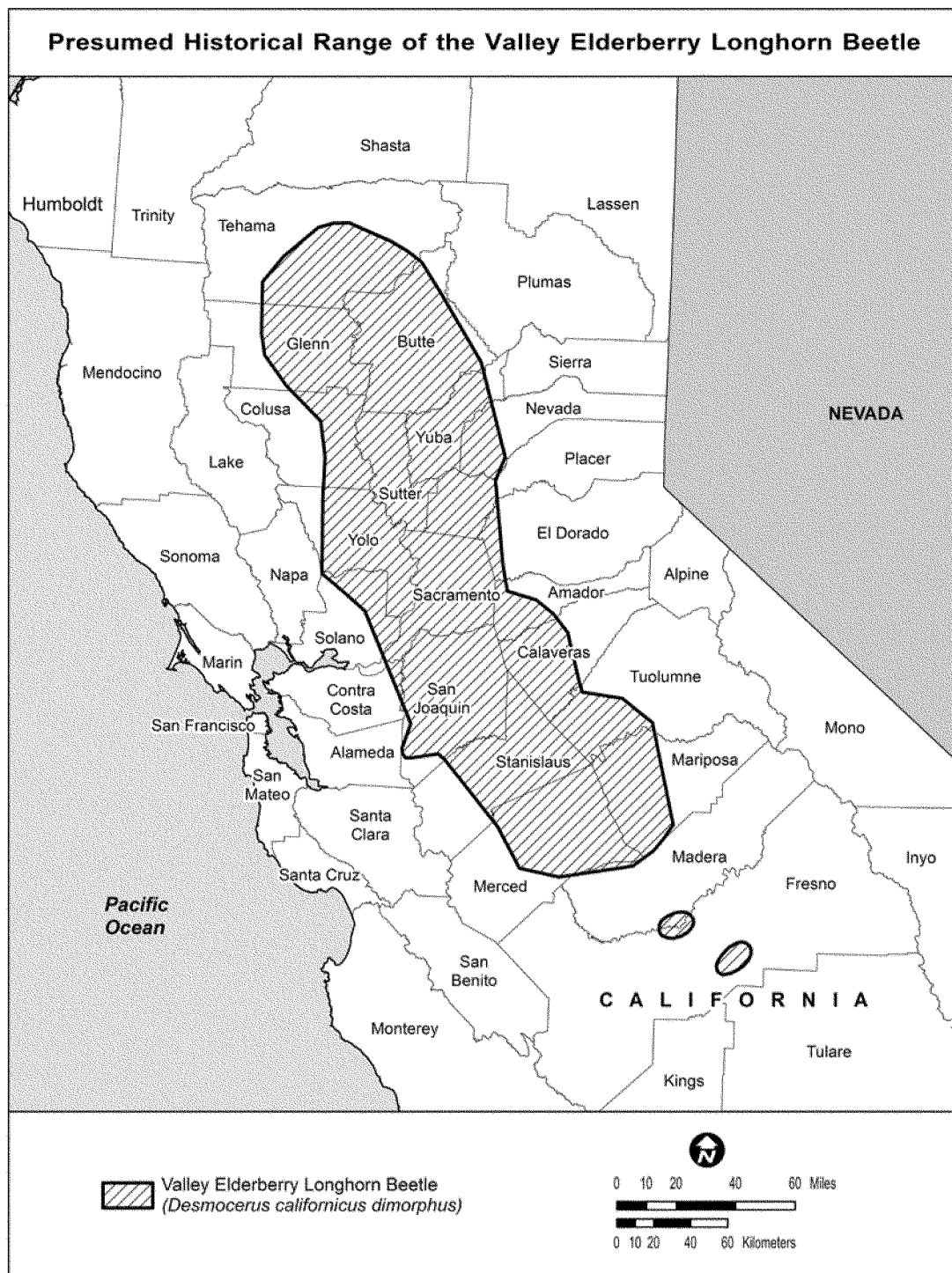
Figure 1. Presumed historical range of the valley elderberry longhorn beetle, California. Sources: Halstead and Oldham 1990, Chemsak 2005, Talley et al. 2006a, River Partners 2010, CNDDDB 2013, Arnold 2014a.

The most recent, comprehensive rangewide survey by observers known to be qualified to detect occupancy of