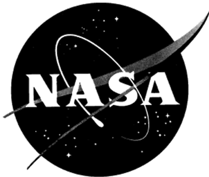
The NASA Insignia

The official insignia of the National Aeronautics and Space Administration is a dark blue disc with white stars. The white hand-cut letters "NASA" are in the center of the disc and are encircled by a white diagonal orbit. A solid red vector symbol also appears behind and in front of the letters.