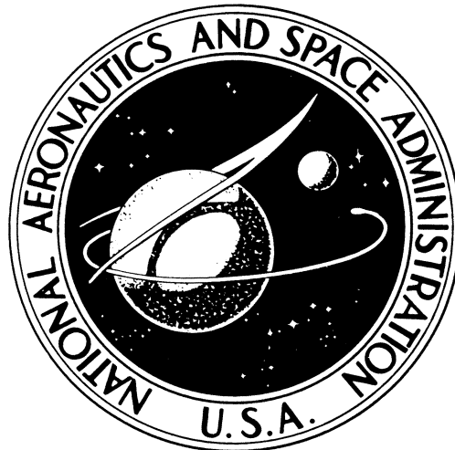
The NASA Seal

The official seal of the National Aeronautics and Space Administration is a disc of blue sky strewn with white stars. To the left, there is a large yellow sphere bearing a red flight vector symbol. The wings of the vector symbol envelope and cast a brown shadow upon it. A white horizontal orbit also encircles the sphere. To the right, there is a small light blue sphere. A white band which circumscribes the disc is edged in gold and is inscribed with "National Aeronautics and Space Administration U.S.A." in red letters.