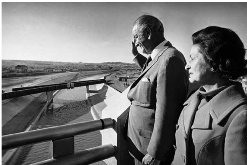
Figure 2. President Lyndon Johnson and Mrs. Lady Bird Johnson view the new channel.