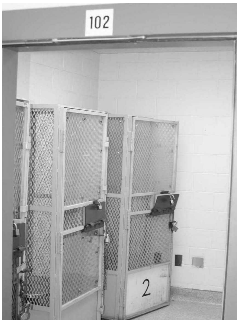
Salinas Valley State Prison July 29, 2008

Correctional Treatment Center (dry cages/holding cells for people waiting for mental health crisis bed)