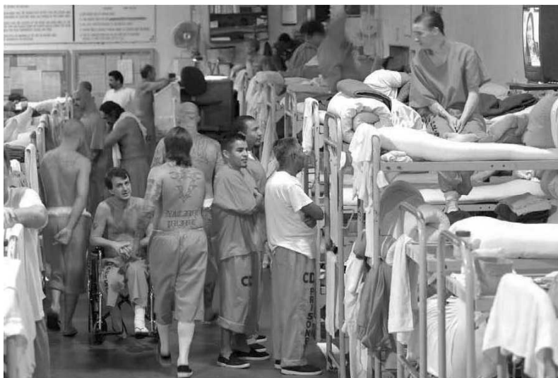
California Institution for Men Aug. 7, 2006