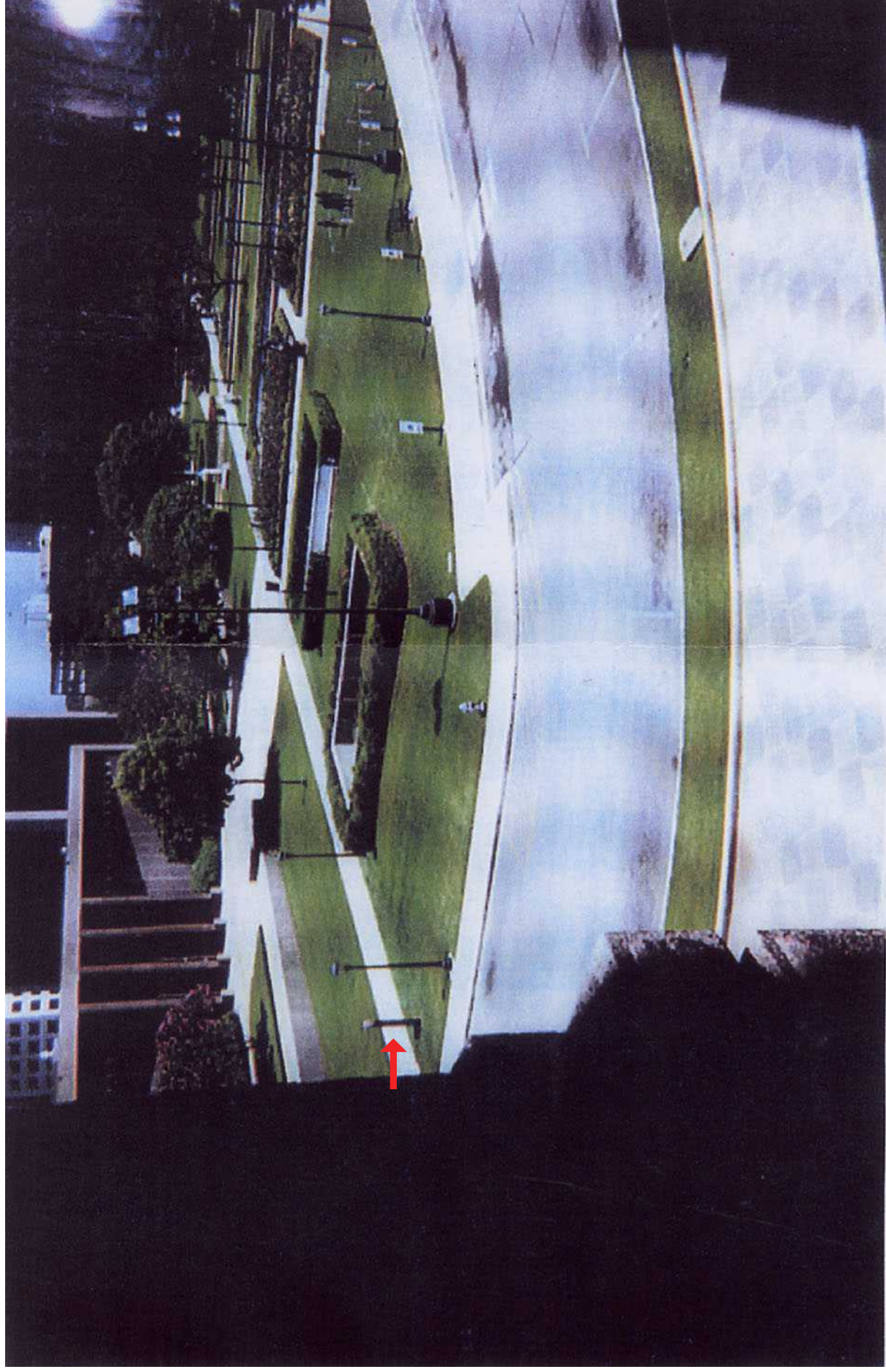
Red arrow points to Ten Commandments Monument.