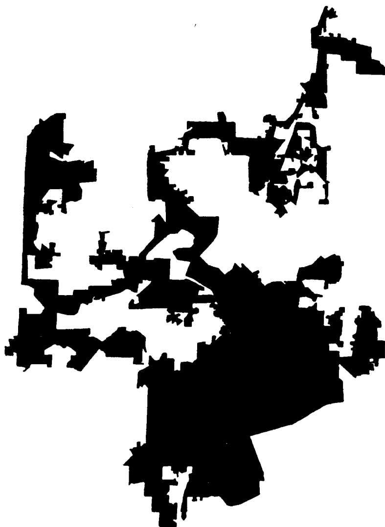
TEXAS CONGRESSIONAL DISTRICT 30