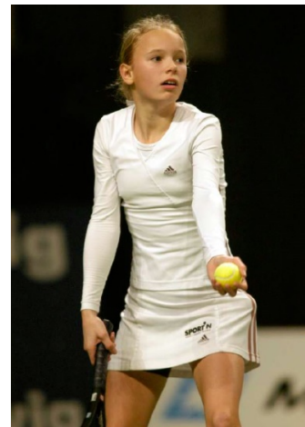
Figure 1: Wozniacki's December 6, 2019 Instagram Post. Figure 2: Plaintiff's Original Photograph.

That same day, defendant, United Sports Publications Ltd., a sports news publisher, ran an article on the Long Island Tennis Magazine website covering Wozniacki's retirement announcement. Am. Compl. ¶¶ 9, 17; Article, ECF No. 20-5 (annexed as Ex. E to Am. Compl.). The article quoted the text of the Instagram post and summarized Wozniacki's career. See Article. It noted she "ha[d] accumulated more than 630 singles victories and 30 titles, including her lone