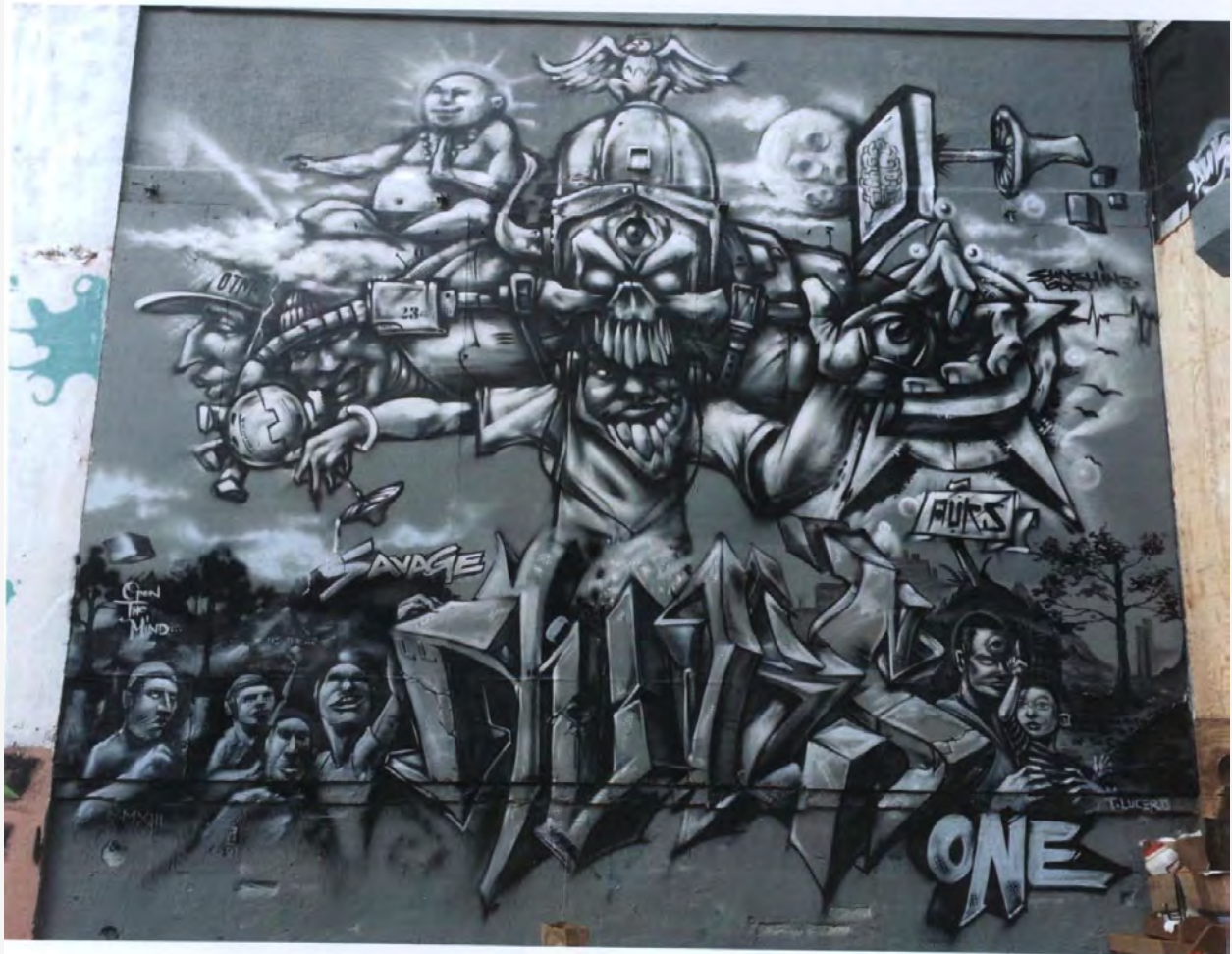
Thomas Lucero - Black Creature