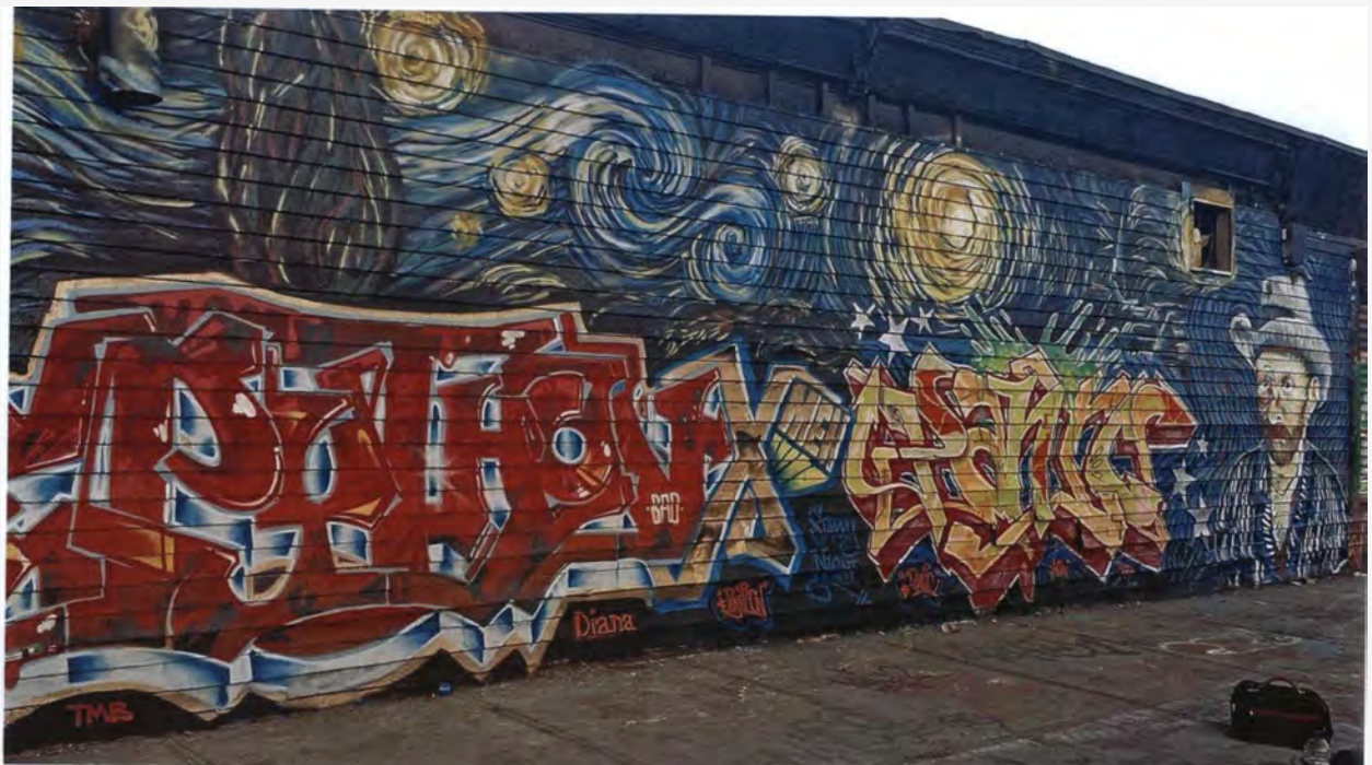
Kenji Takabayashi - Starry Night