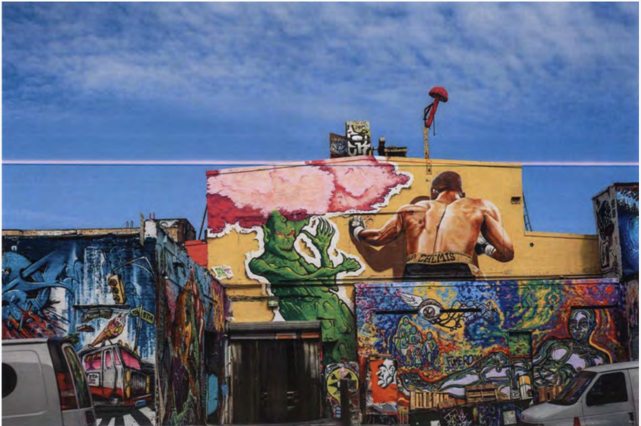
Rodrigo Henter de Rezende - Fighting Tree