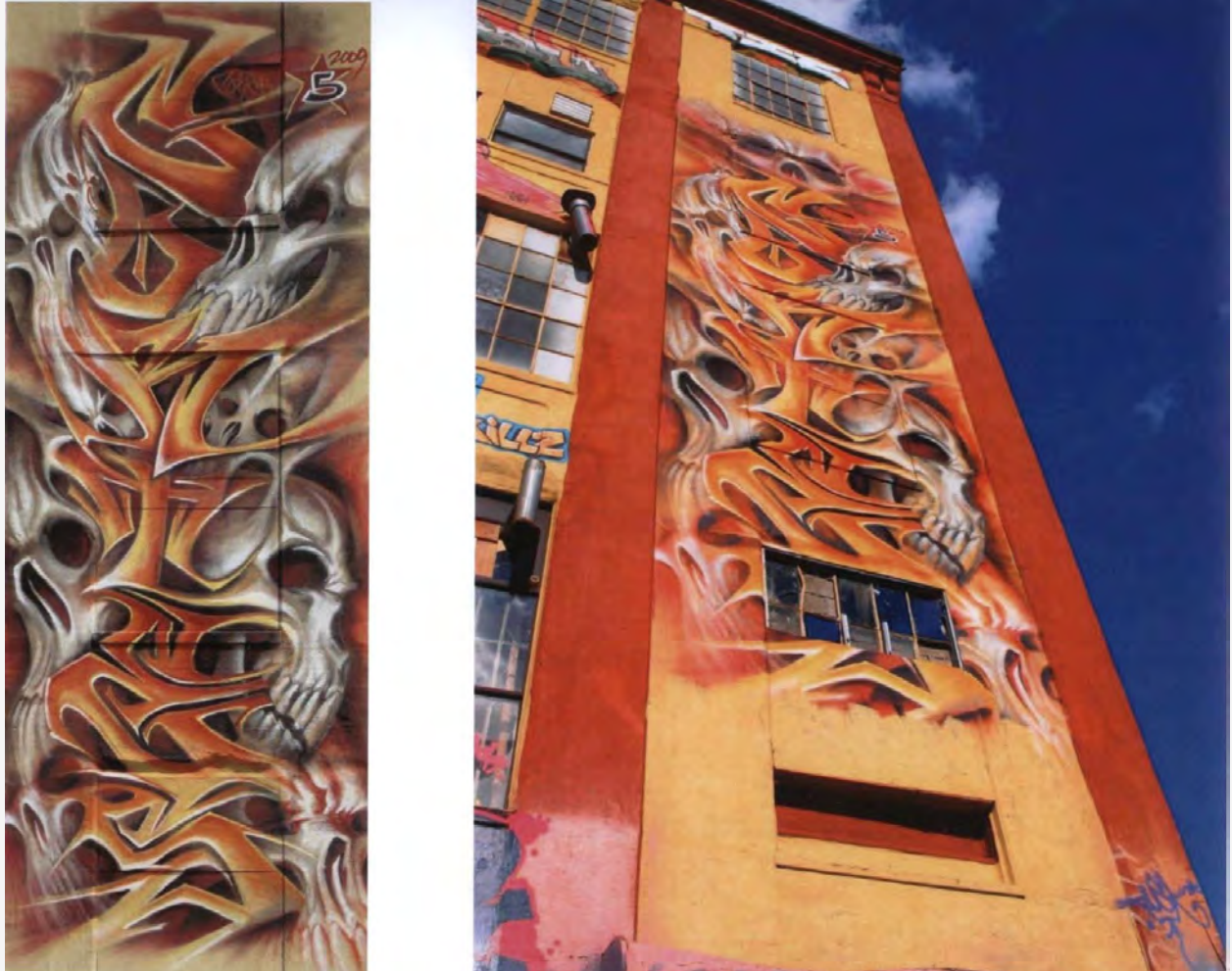
Christian Cortes - Up High Orange Skulls