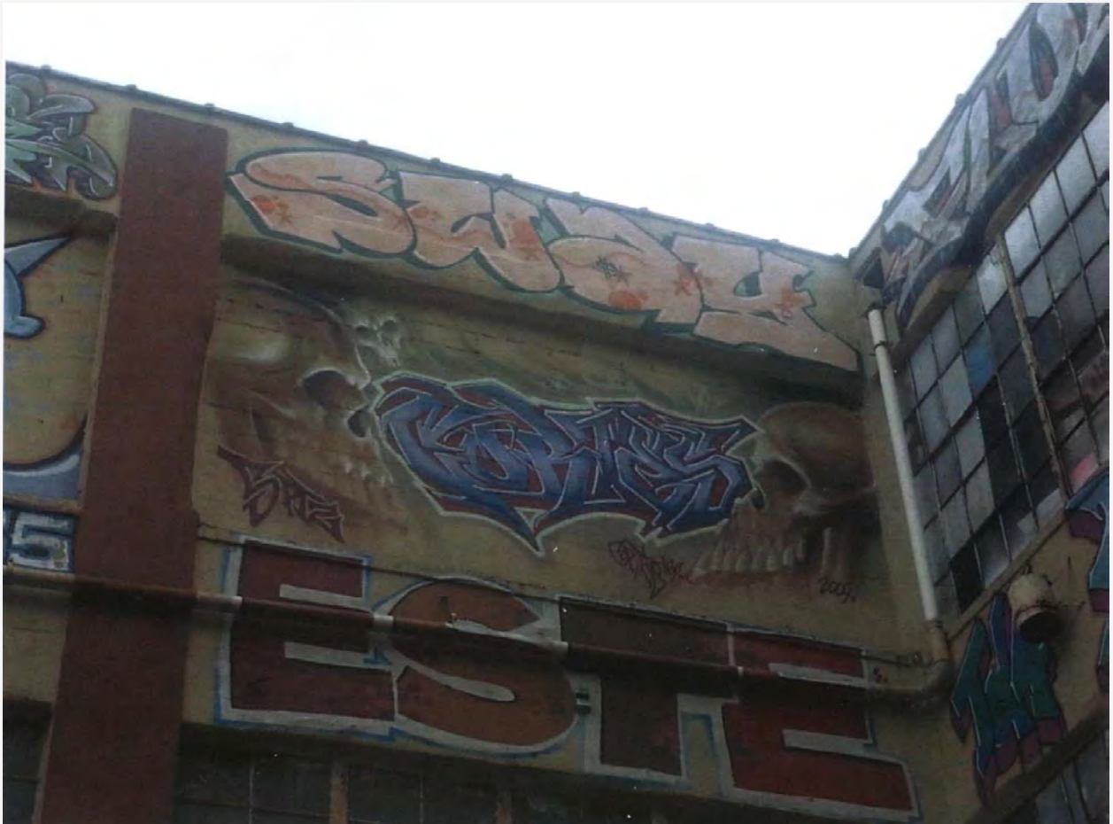
Christian Cortes - Up High Skulls