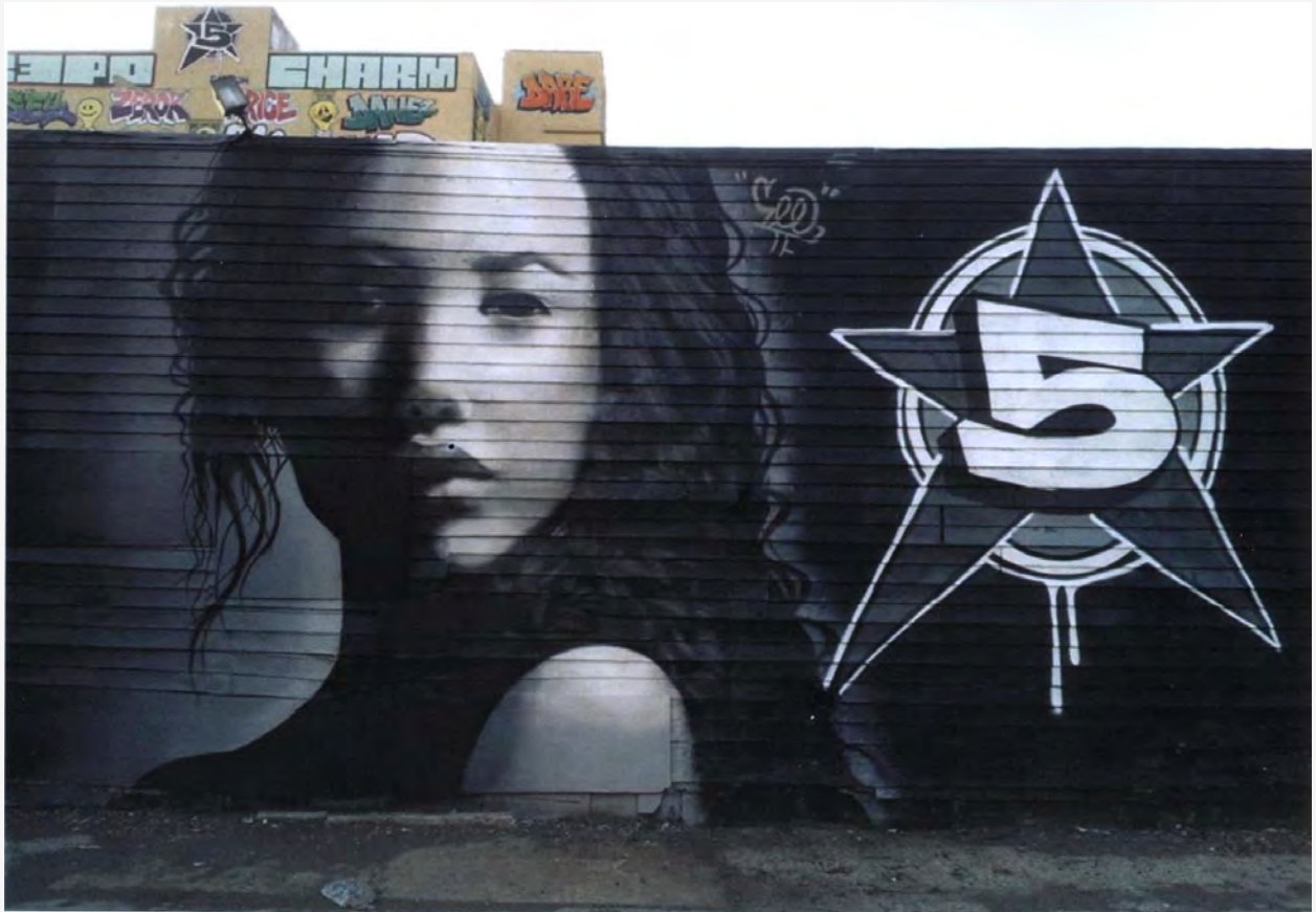
Carlos Game - Black and White 5Pointz Girl