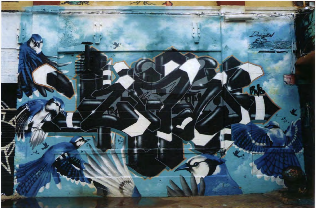
Luis Lamboy - Blue Jay Wall