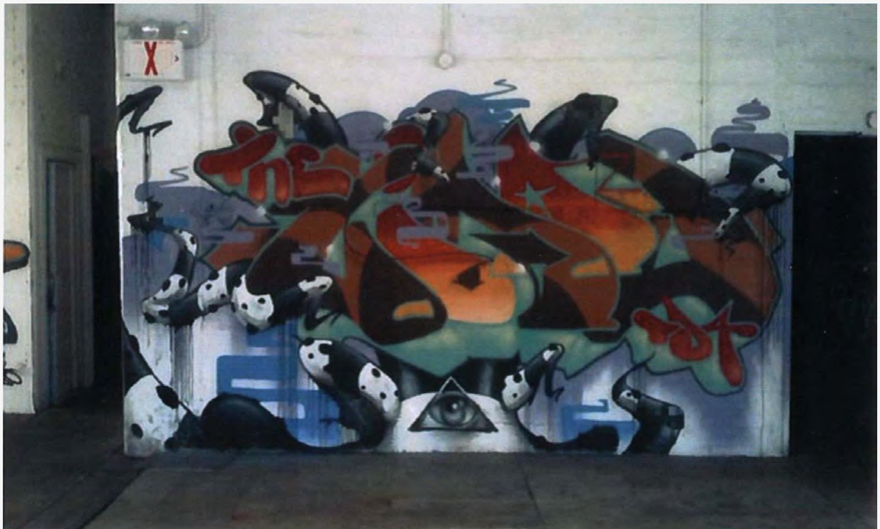
Luis Lamboy - Inside 4th Floor