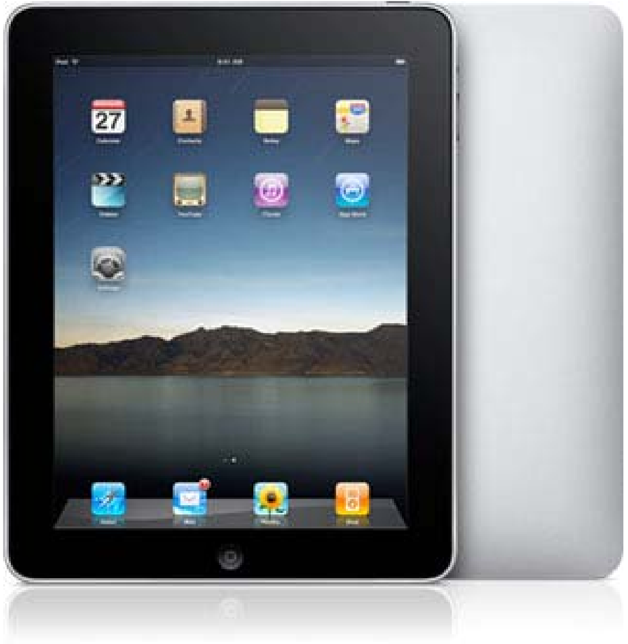
EXHIBIT A COPYRIGHTED WORKS

1 2 3 4 5 6 7 8 9 10 11 12 13 14 15 16 17 18 19 20 21 22 23 24 25 26 27 28