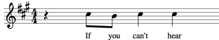
Theme X in "Blurred Lines"