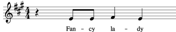
Theme X in "Got to Give It Up"

can't hear.” Like the Hook Phrase, Theme X is both unprotectable and objectively dissimilar in the two songs.