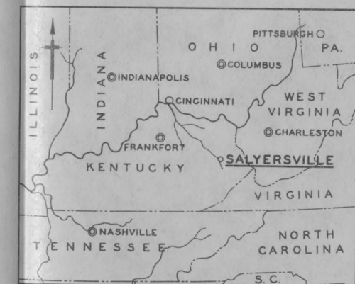
LOCATION MAP SCALE OF MILES