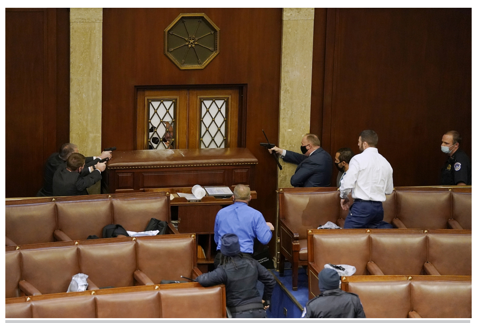
Guns are drawn in the House Chamber on January 6th as rioters attempt to break in.

I am asking for everyone at the U.S. Capitol to remain peaceful. No violence! Remember, WE are the Party of Law & Order—respect the Law and our great men and women in Blue. Thank you!<sup>244</sup>