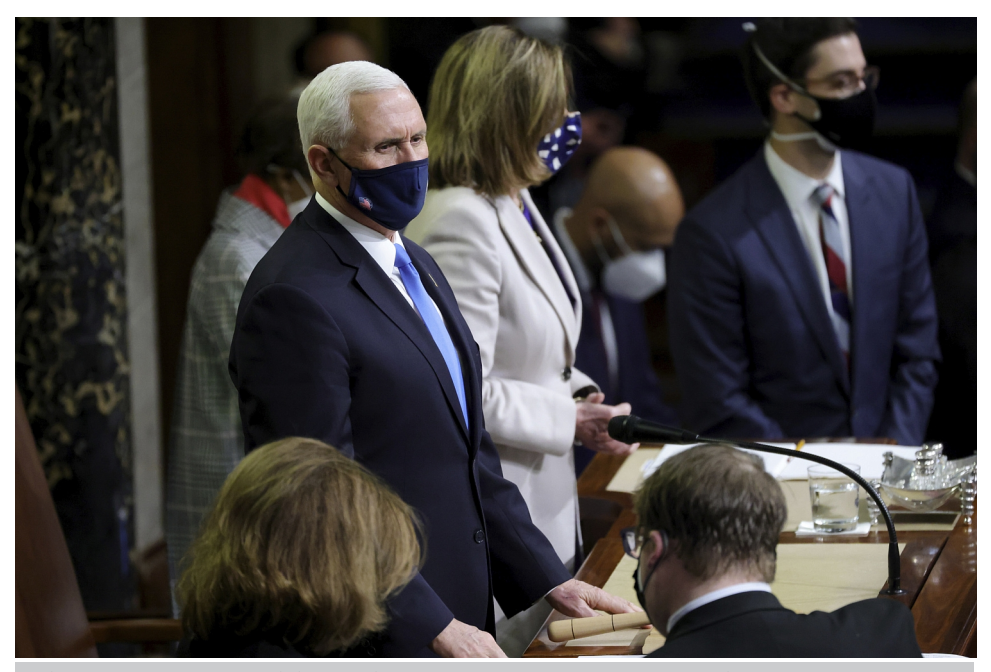
Mike Pence reopens the joint session of Congress and resumes counting electoral votes.

The President, too, was at home, but he remained focused on his goal. Between 6:54 p.m. and 11:23 p.m., he spoke with 13 people, some more than once.<sup>310</sup> Of the 13, six ignored or expressly refused to comply with Select Committee requests for their testimony.<sup>311</sup> Two agreed to appear but refused to answer questions about their phone calls with the President, citing executive privilege.<sup>312</sup> Two more refused to answer questions, claiming attorney-client privilege.<sup>313</sup>