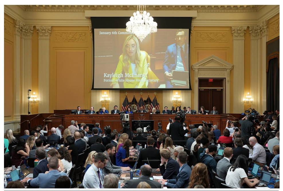
Testimony footage of former White House Press Secretary Kayleigh McEnany is played during a January 6th Select Committee hearing.