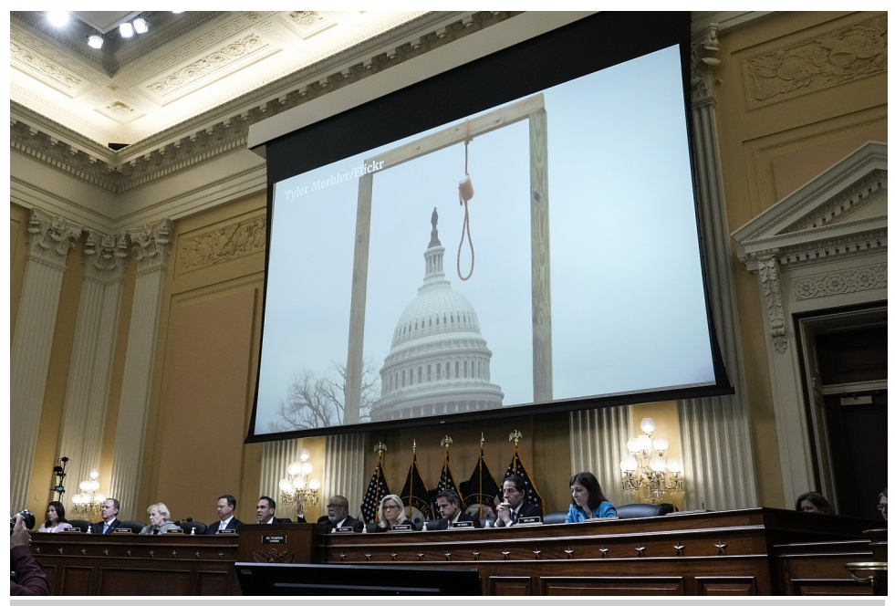
Noose set up outside of the Capitol on January 6, 2021.