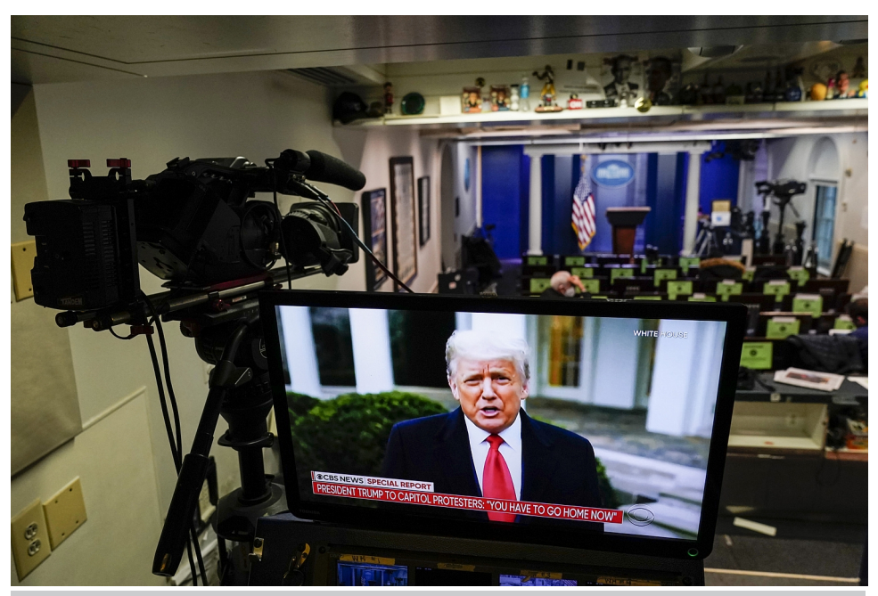
President Trump appears on a monitor in the White House briefing room depicting a video he released instructing rioters to go home.