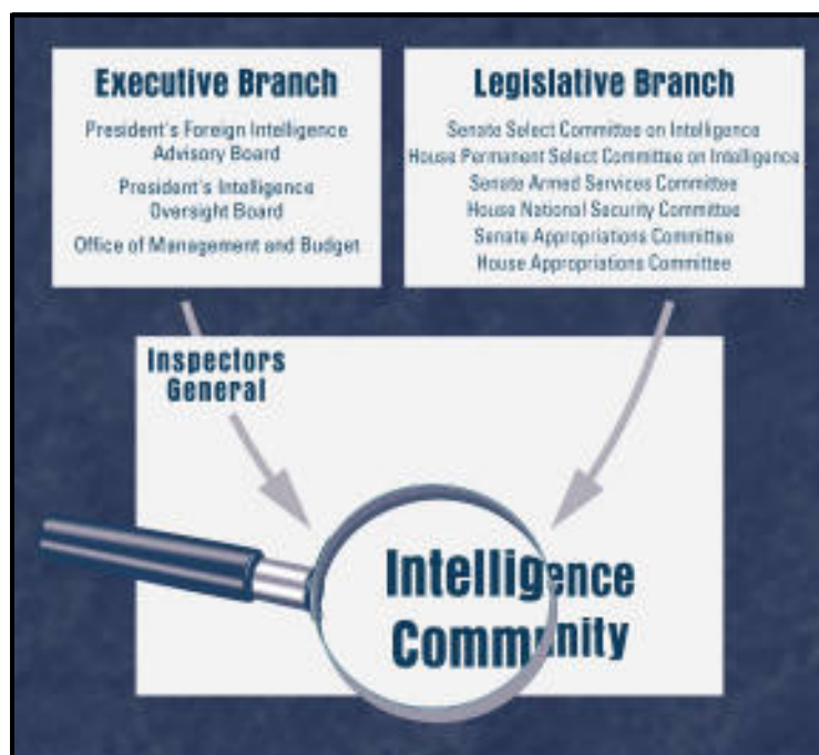
Figure A:3 Intelligence Community Oversight

Each element of the Intelligence Community is subject to the jurisdiction of an Inspector General, either within their own organization or within their parent organization.