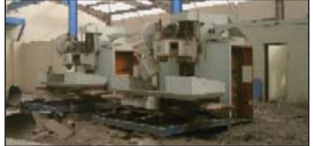
Tuwaiitha Tools Workshop—stripped Chen Ho Machine Tools.