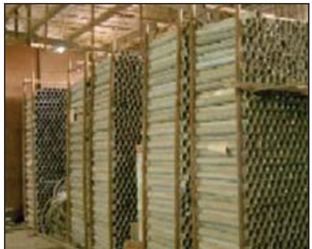
81-mm aluminum tubes in a second Dhu al-Fiqr Factory warehouse.

pieces might have been disassembled for valuable subassemblies such as motors and condensers. Still others could have been taken intact to preserve their function.