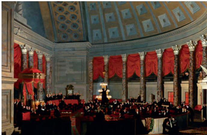
The Old House of Representatives , painted by Samuel F.B. Morse in 1822, was the artistic precedent for Adèle Fassett's Electoral Commission .

The Electoral Commission held its first public hearing on February 1, 1877, and deliberations continued for nine days. Legislators, cabinet members, the press, and prominent men and women of Washington society crowded into the Capitol's Old Senate Chamber (then serving as the Supreme Court's regular meeting place). The long and bitter debate began with the Florida case. Although Tilden had almost certainly won in the electoral balloting, Republicans prevailed and the commission's vote went to Hayes. Subsequent voting also followed party lines, with Bradley, the "independent" justice, joining the Republicans. By the findings of the commission, Rutherford B. Hayes received all of the disputed votes, and thus the required one-vote margin over Tilden. Though Democrats at first protested, they ultimately accepted the decision on the promise that federal troops would be removed from the South and Reconstruction brought to an end. Congress declared Hayes the victor on March 2, just two days before his term began.