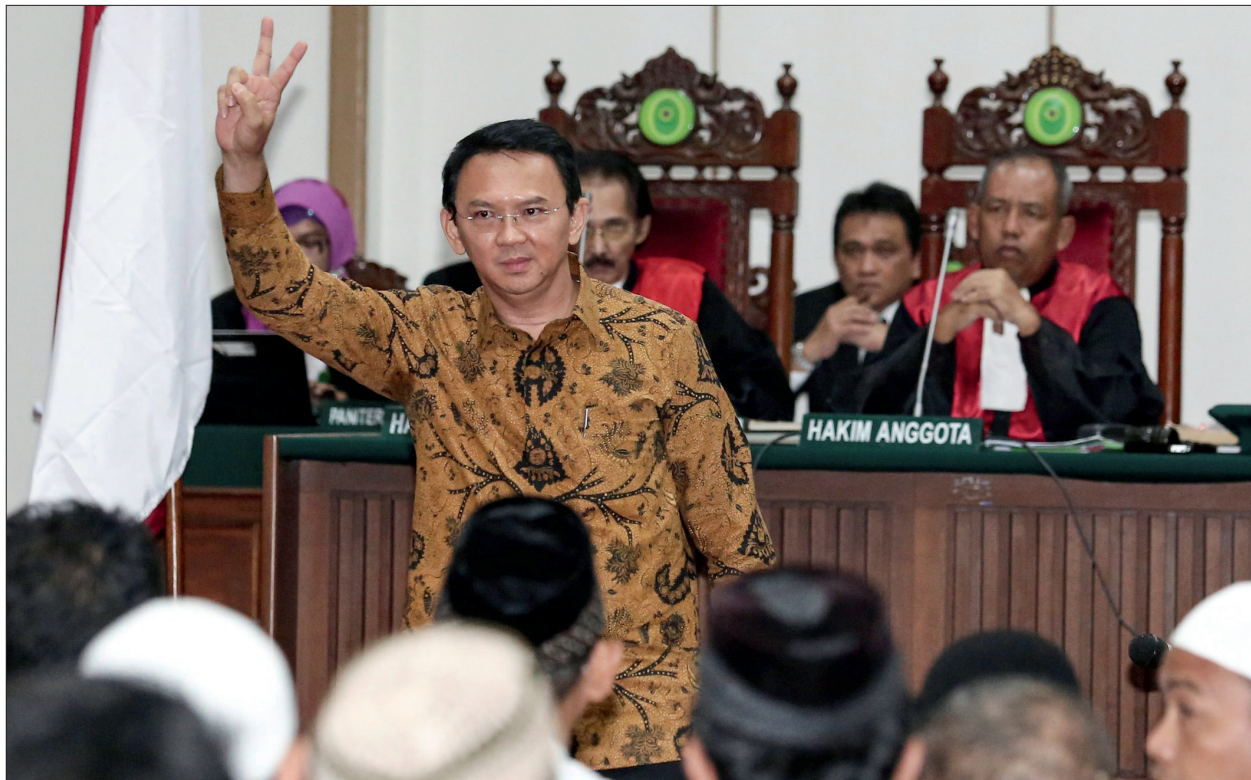
Jakarta's Governor Basuki Tjahaja Purnama, also known as Ahok, gestures inside the courtroom during his blasphemy trial at the auditorium of the Agriculture Ministry in Jakarta, Indonesia, January 3, 2017. [In May 2017, Ahok was convicted of blasphemy and sentenced to two years in prison.]

belief—transcend borders. (For more information, refer to the “Common and Crosscutting Challenges” section.) In short, a note from the secretary-general for the 71st session of the UN General Assembly about the elimination of all forms of religious intolerance succinctly captures the responsibilities countries have to the international community: