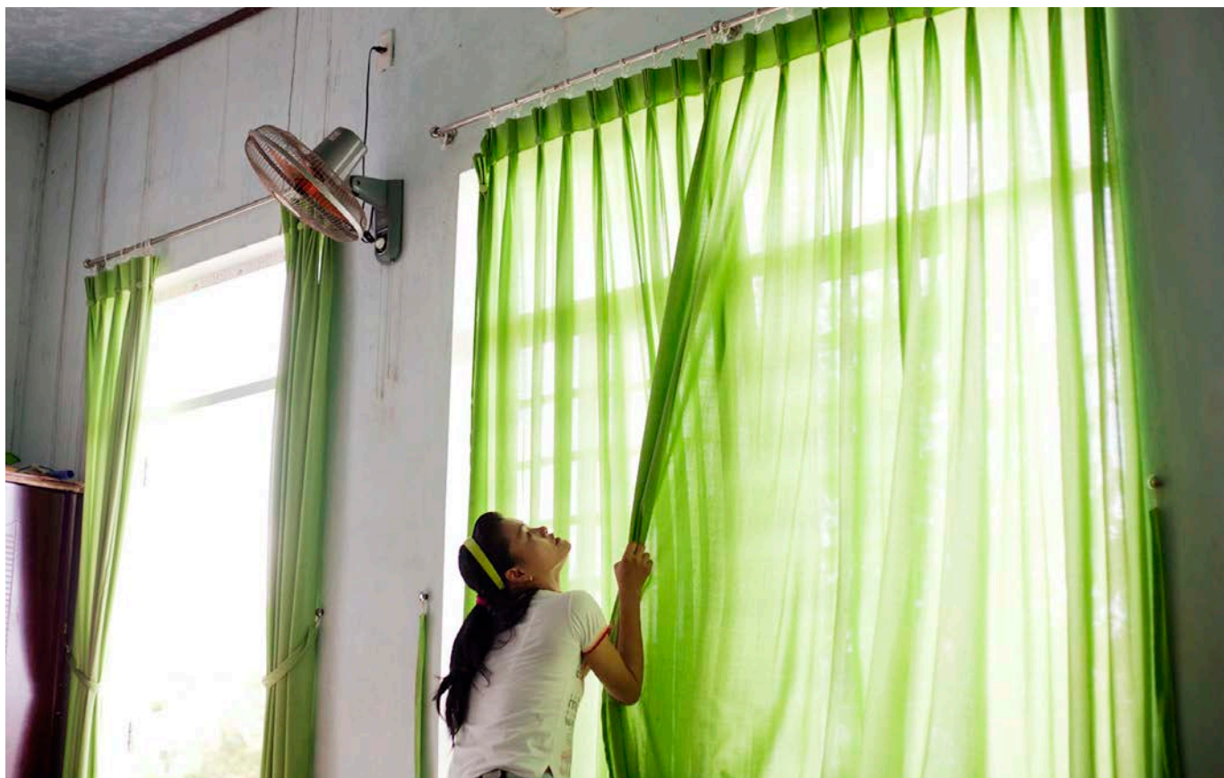
A woman adjusts curtains at a rehabilitation center in Danang, Vietnam, on August 8, 2021, where children with mental and physical disabilities are cared for. The center's director says the children's disabilities were caused by their parents' exposure to dioxin in Agent Orange.

As noted above, VAVA's mission when founded was to seek justice and compensation for Vietnamese nationals affected by Agent Orange. However, the organization's mission has since expanded to include social services and assistance. VAVA affiliates are now present in all of the country's 63 provinces and claim over 400,000 members. VAVA prioritizes meeting the basic needs of victims, such as housing, food, medicine, and wheelchairs. Additionally, it provides physical therapy, rehabilitation, education, and vocational training. To this end, VAVA frequently organizes charitable and philanthropic activities to mobilize assistance for Agent Orange victims and their families at the local and national levels. As of 2020, VAVA chapters at all levels have raised a total of 2.6 trillion dong (nearly $113.7 million) in funds for victims. 42 VAVA also partners with various international organizations, donors, philanthropists, and individuals seeking to contribute to improving the lives of those affected by Agent Orange in Vietnam.