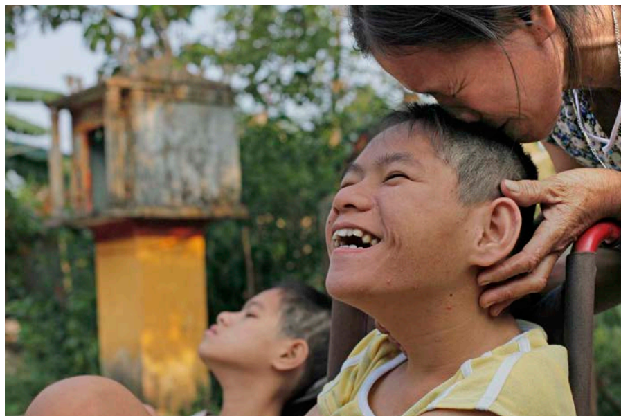
A woman with profound physical and mental disabilities attributed to Agent Orange is pictured on October 5, 2009, in Cam Tuyen, Vietnam.