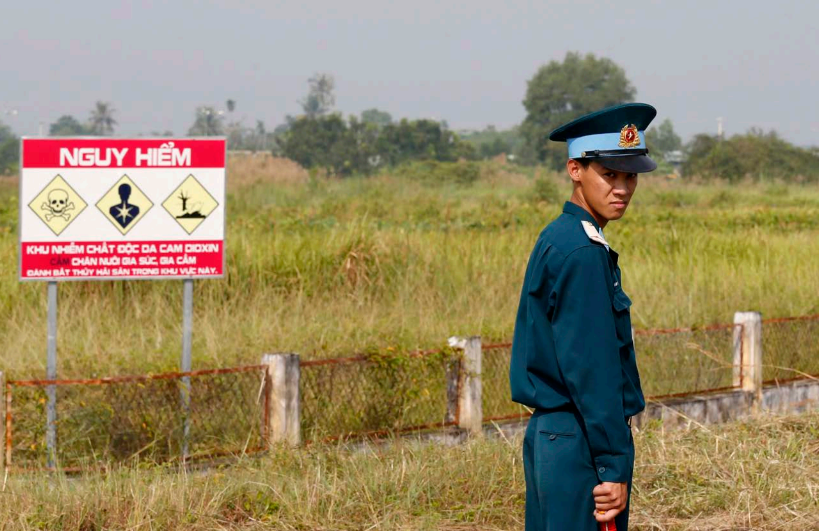
A Vietnamese soldier stands guard at a dioxin-contaminated area at the Biên Hòa Air Base near Ho Chi Minh City during a visit by US Secretary of Defense Jim Mattis on October 17, 2018.