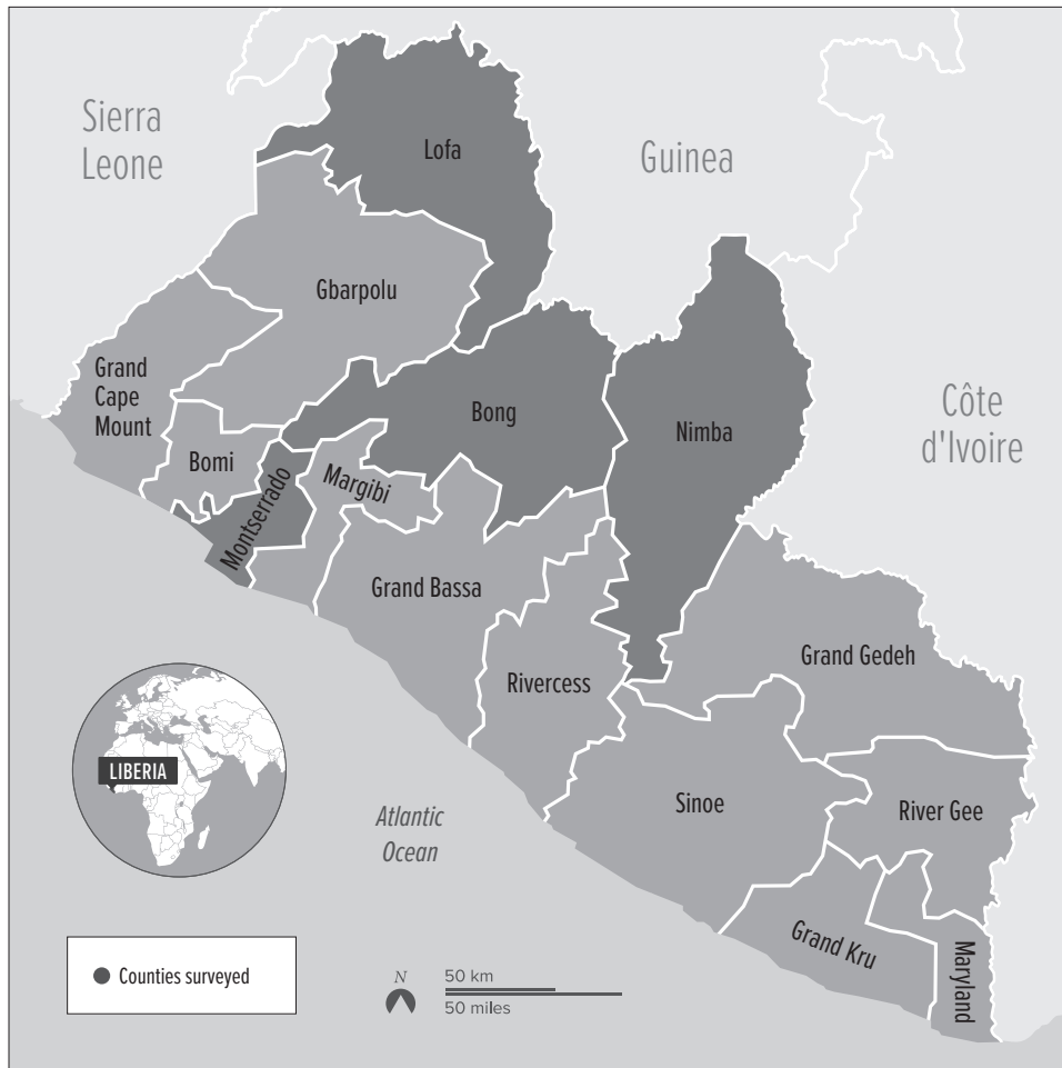
Map 1. Liberia's counties