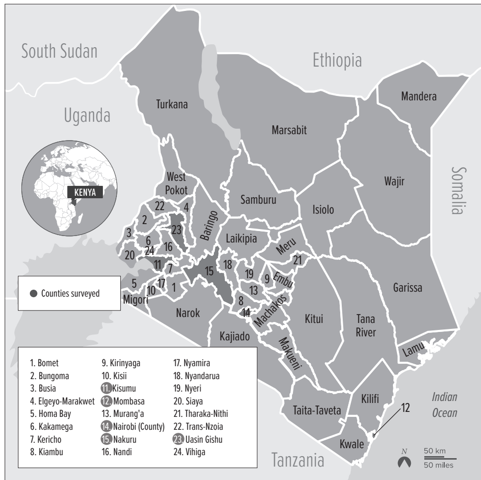
Map 2. Kenya's counties