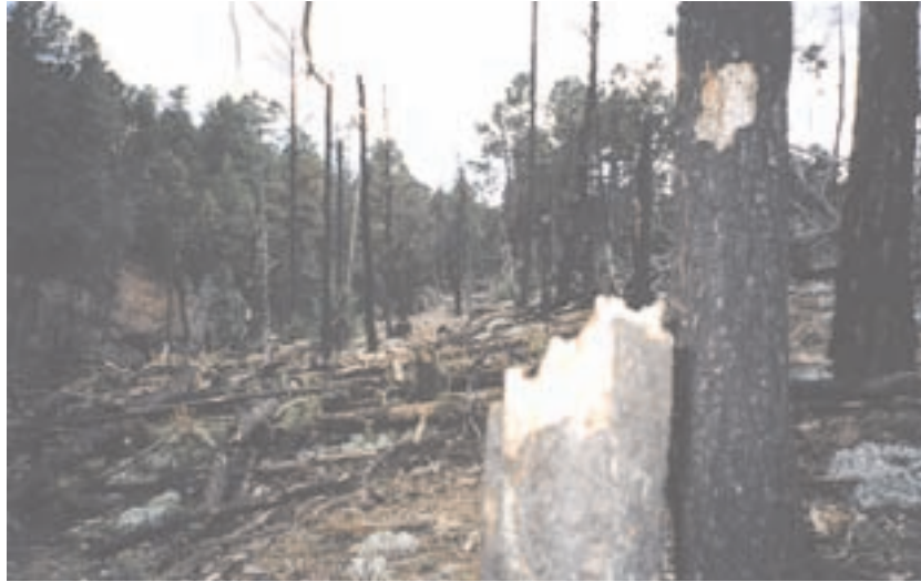
Photo 2: Lot adjacent to Ciénega de Guacayvo Ejido that was the subject of a complaint included in the submission (14 October 2003)