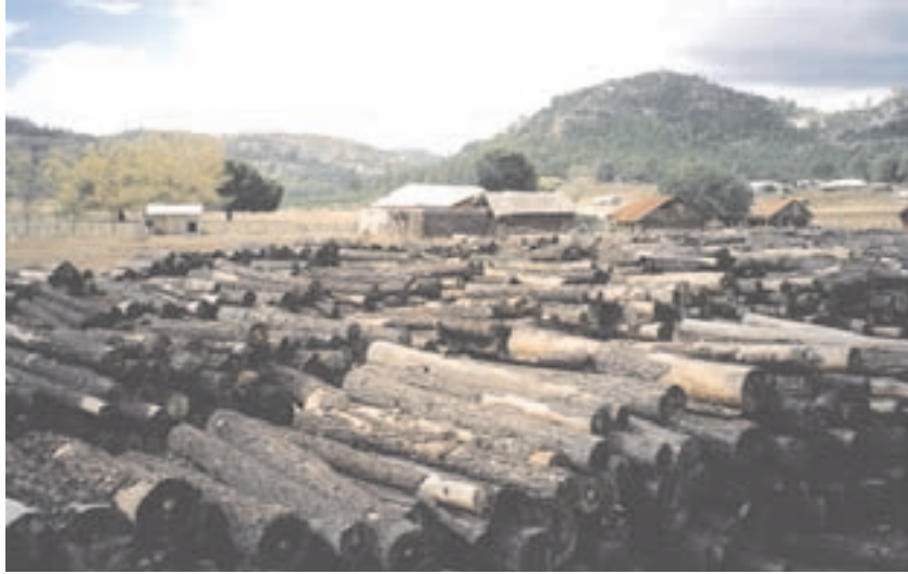
Photo 4: Product of illegal logging on a lot in the ejido of Ciénega de Guacayvo since 1999 (14 October 2003)