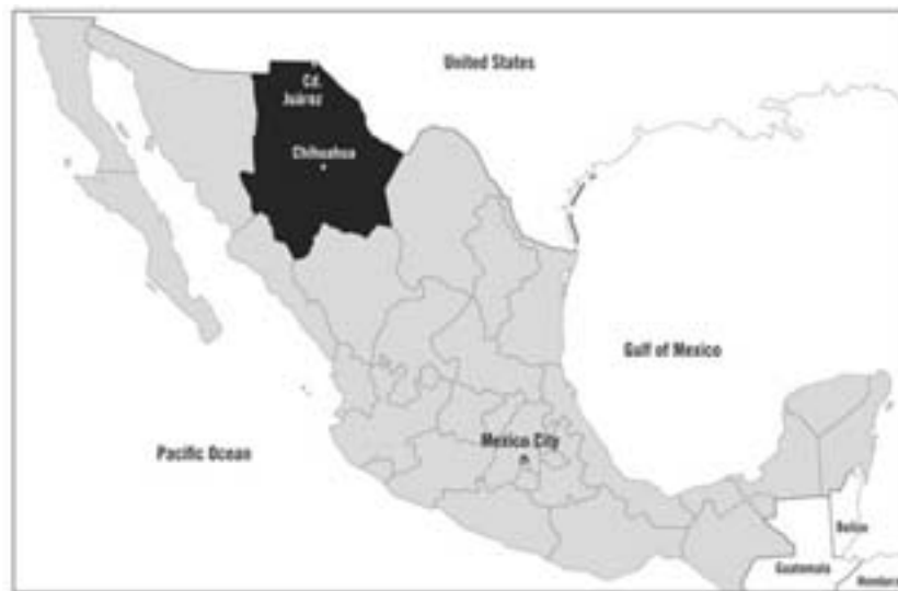
Figure 1. Map of Mexico Locating the State of Chihuahua

and often remote. The submission involves 19 communities distributed among 8 municipalities. Figure 1 is a map of Mexico showing the location of the state of Chihuahua. Figure 2 shows the location of the communities that filed the complaints which are covered in the factual record.