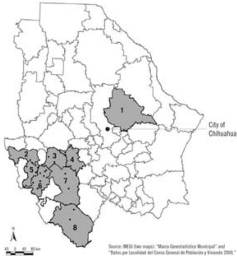
List of Municipalities and Communities Identified in the Submission