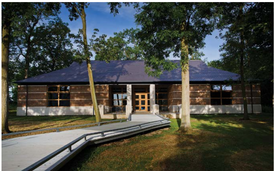
The visitor center is located convenient to the cemetery entrance.