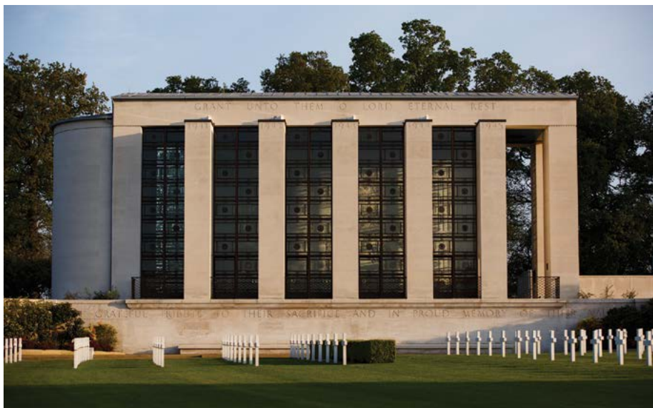
The north face of the memorial building.