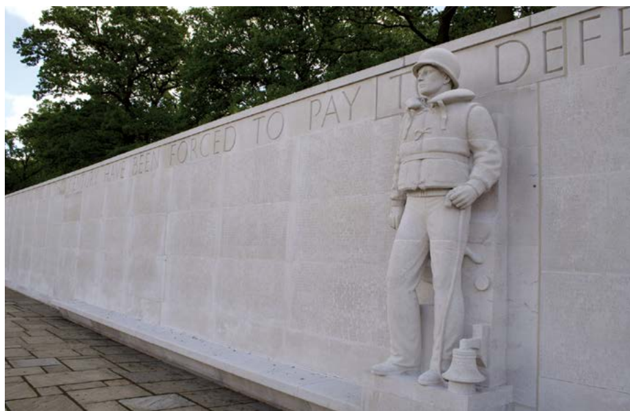
The statue of a Coast Guardsman is one of four standing watch over the Wall of the Missing.

Four statues - a soldier, airman, sailor, and Coast Guardsman - stand guard over the Wall of the Missing.