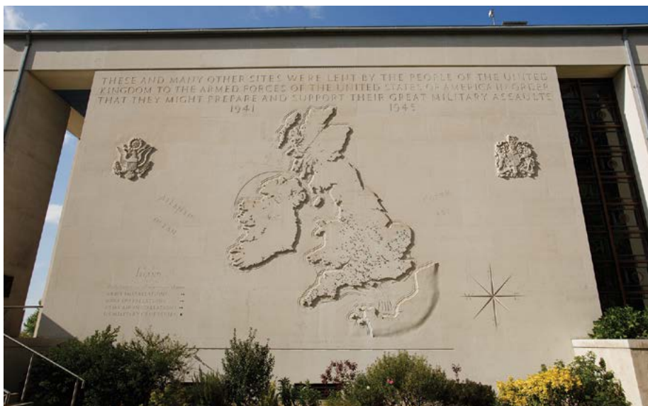
The map displays locations of American units in the United Kingdom during World War II.