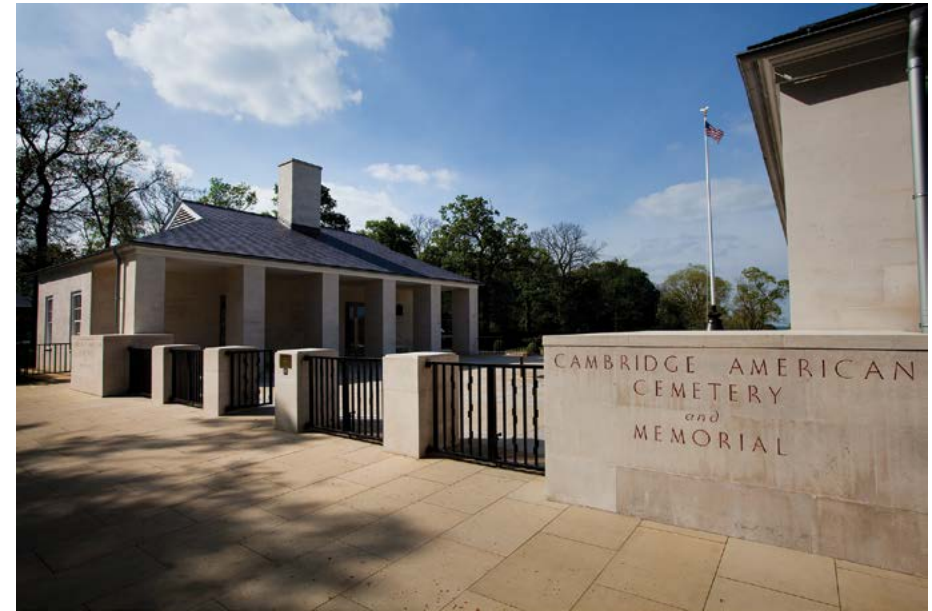
The entrance welcomes visitors to Cambridge American Cemetery.

The cemetery is situated on the north slope of a hill from which Ely Cathedral, 14 miles in the distance, can be seen on a clear day. It is framed by woodland on the west and south. The road to Madingley runs along the cemetery's northern border.