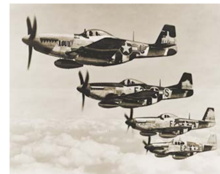
North American P-51 Mustangs of the 361st Fighter Group fly in formation over England in 1944.

Deep American daylight raids, such as one on Schweinfurt on October 14, 1943, proved prohibitively costly until the Americans perfected a long-range fighter to escort their bombers to distant targets. This capability was achieved in December 1943 with the P-51 Mustang, upgraded for a considerably greater range. Lieutenant Colonel Thomas Hitchcock, Jr. of the U.S. Army Air Forces participated as a pilot in the improvement program of the P-51. He had also flown in World War I as a volunteer pilot in the Lafayette Flying Corps. He was killed in the crash of a P-51 in England on April 18, 1944. He is buried at the Cambridge American Cemetery at Plot A Row 6 Grave 21.