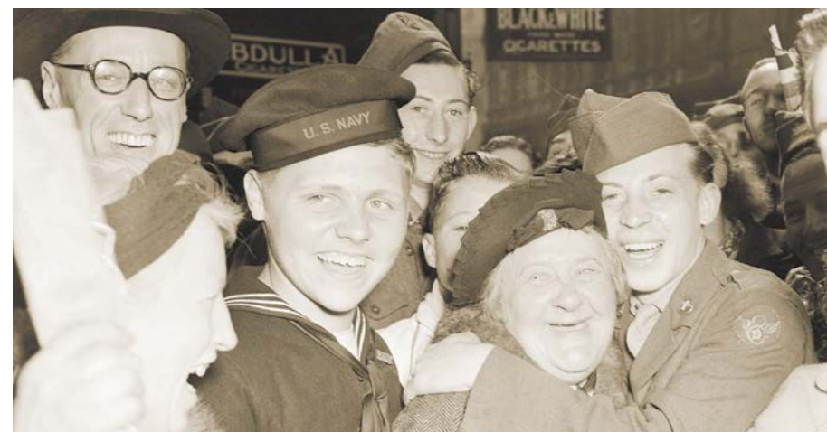
American servicemen and British civilians in London celebrate Germany's surrender. May 8, 1945.