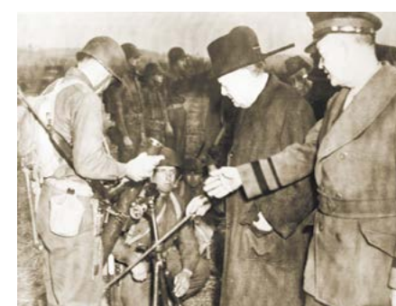
Prime Minister Winston Churchill and General Dwight D. Eisenhower inspect a mortar crew during a tour of an American Army base in England before D-Day, 1944.

American forces that had been building in England since mid-to-late 1942 were committed into Operation TORCH. American task forces landed on beaches flanking Casablanca, Morocco. Combined