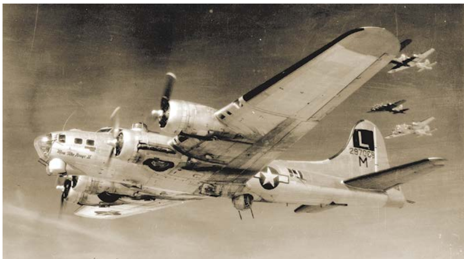
The B-17G Flying Fortress “Mon Tete Rouge II,” and other bombers of the 452nd Bomb Group, flying on a mission to bomb German targets in France on March 28, 1944.

By mid-1943 the Allies formally launched the Combined Bomber Offensive, which achieved a division of labor wherein the Americans conducted precision bombing during daylight with the British bombing at night, hammering the Germans around the clock.