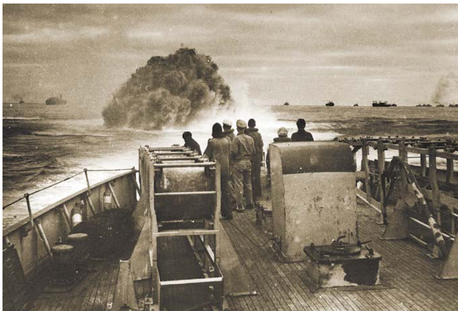
Coast Guardsmen of the U.S. Coast Guard Cutter Spencer watch the explosion of a depth charge blasting German submarine U 175 about to attack a convoy in the North Atlantic. April 17, 1943.

The success of the Allied war effort depended on moving troops and supplies across vast oceans. Naval operations prioritized escort, armed guard, and antisubmarine operations. New technologies like radar, sonar and improved depth charges entered service, and merchant ships increasingly traveled in convoys protected by combatant escorts.