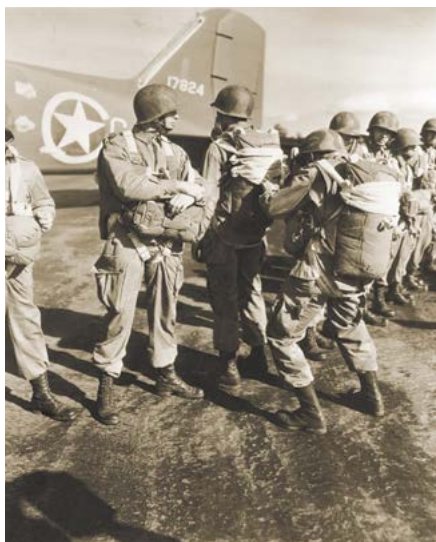
U.S. Army paratroopers of the 2nd Battalion, 503rd Parachute Infantry, inspect equipment before a training jump in England, 1942.

Anglo-American task forces similarly attacked Oran and Algiers, Algeria. Near Casablanca and Oran, resistance was significant at first, but force and diplomacy induced the Vichy French to surrender. In Algiers, a pro-Allied uprising enabled the landing force to take the city with minimal conflict.