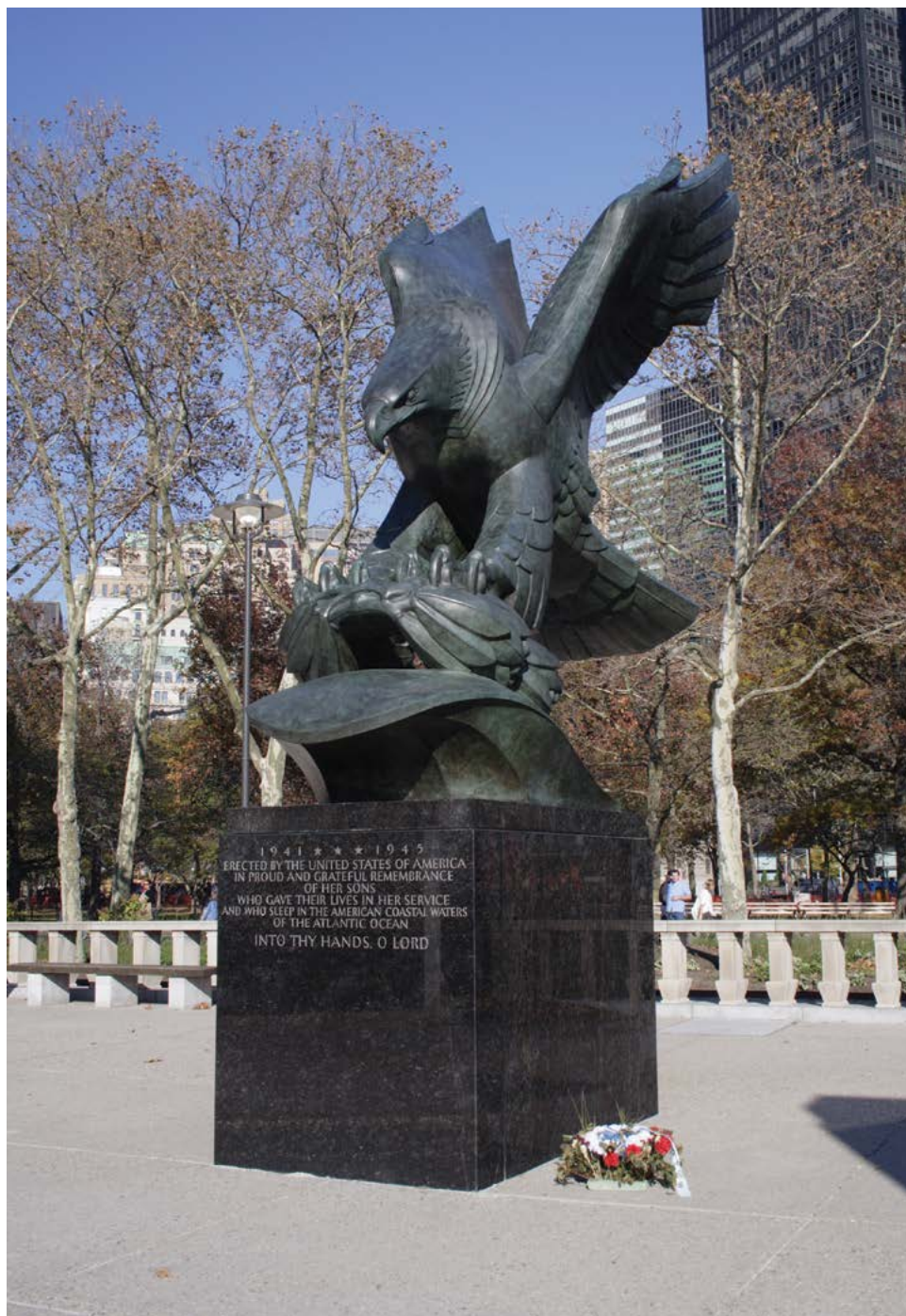
The eagle atop the base points southwest to the Statue of Liberty.

The East Coast Memorial is located in Battery Park in New York City at the southern end of Manhattan Island. It is about 150 yards from the South Ferry subway station on the IRT Lines and stands just south of historic Fort Clinton, on a site furnished by the Department of Parks of the City of New York.