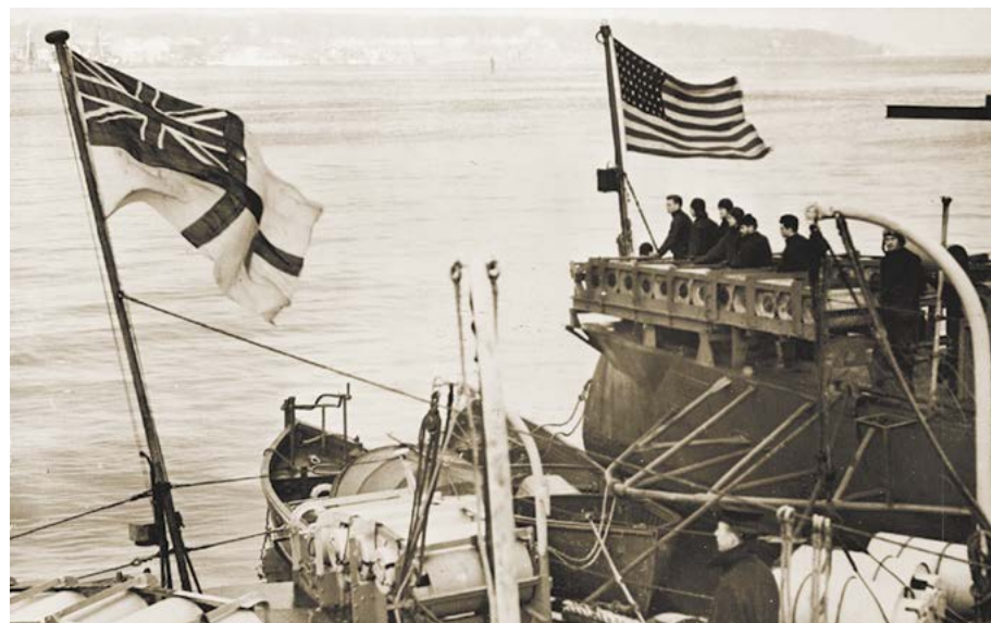
British and American warships lie alongside each other at the U.S. naval base in Londonderry, Ulster. The American warships had escorted a convoy across the Atlantic, and arrived at Londonderry in January 1942.

Through 1942 the balance poised precariously, with the Allies losing 800,000 tons of shipping more than they replaced with new construction that year. In May 1943 the balance finally tipped decisively in favor of the Allies. In that month, increasingly effective Allied forces sank 41 of 240 German U-Boats, while losing fewer than 300,000 tons of shipping to them.