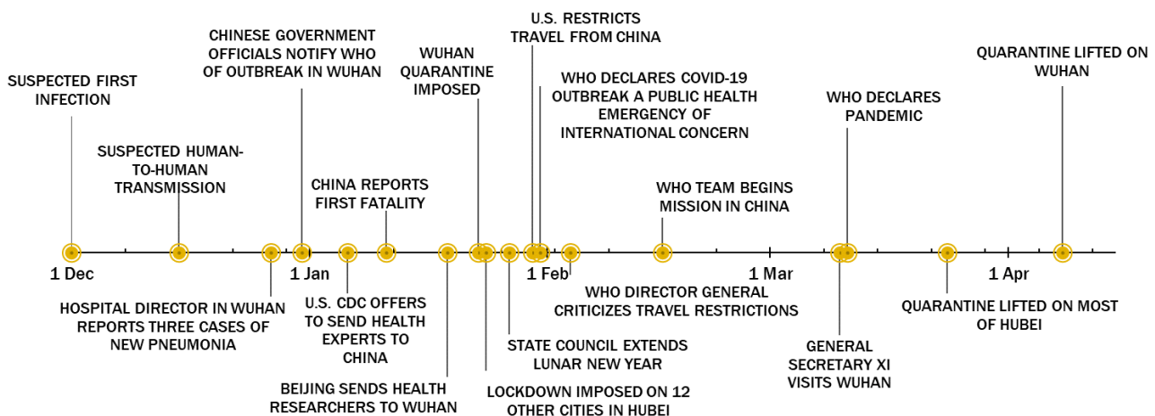
Figure 1: Coronavirus Outbreak and Official Action Taken

Note: The precise date of first infection is unknown, but medical research has posited early December. Qun Li et. al., “Early Transmission Dynamics in Wuhan, China, of Novel Coronavirus-Infected Pneumonia,” New England Journal of Medicine , January 29, 2020. 17