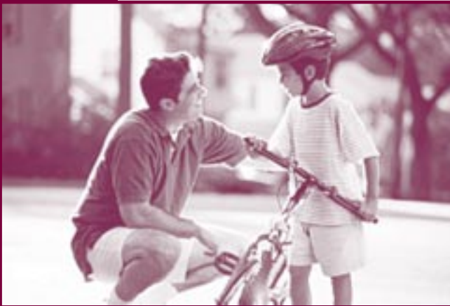
Adults should encourage safe-bicycling practices.