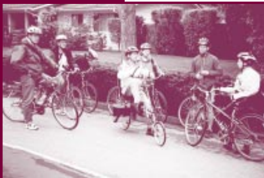
Instructor trainees should bike and discuss different types of crash scenarios.

Approximately 60 instructors are trained in this course per year. Verbal and written participant feedback has shown that the course has been very well received. In addition, many successful bicycle rodeos have been conducted by TSB course participants.