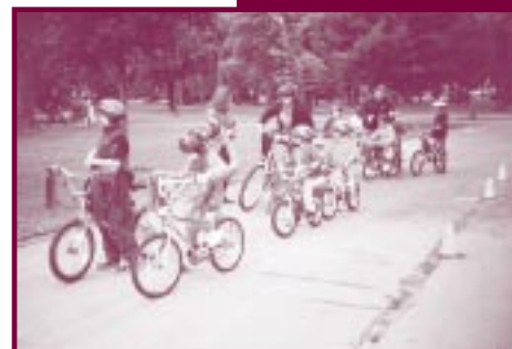
Bike rodeos are a safe way to teach bike handling skills.

Materials in the program include an instructor manual, the videotape First Gear (covering traffic laws in depth), helmet fitting brochure, Guide to Biking in the City brochure and booklet, bicycle maintenance/repair tools, traffic cones, reflective vests, helmets (for borrowing or buying), and 25 loan bicycles.