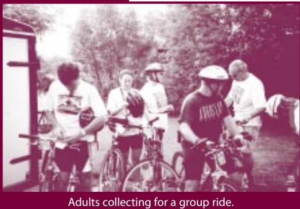
Adults collecting for a group ride.

signals. Traffic laws and road positioning are also taught. Everyday the group goes for a ride and stops frequently to discuss the situations encountered.