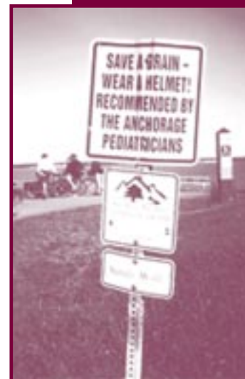
Trail sign in Alaska – bicycle helmet awareness is spreading across the nation.

The most important aspect of this program is that everyone involved is giving students the same consistent message about helmets. The program creates "helmet experts" who spread the helmet safety message.