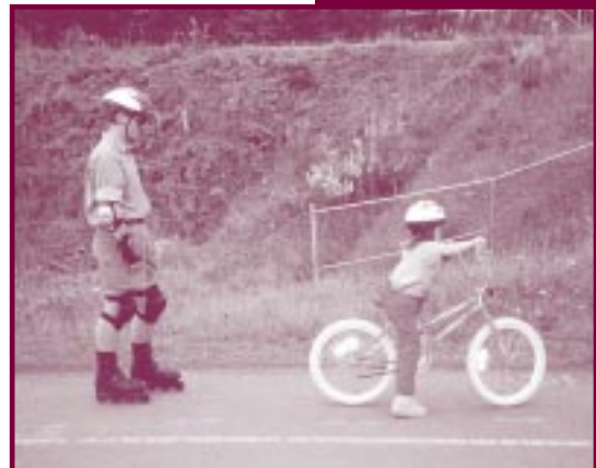
Helmets should be worn while biking, rollerblading, and scootering.

The interactive Helmet Your Brain – Avoid the Pain® program materials are contained in a box and include everything a presenter needs to prepare for and conduct a class. The program consists of the curriculum and work sheets, a brain gelatin mold, a model of a skull, two safety videos, a bicycle helmet, program stickers, Phoenix Children’s Hospital Bike Safety brochures, and a brain book reference guide. There is also a Spanish language version and an abridged version.