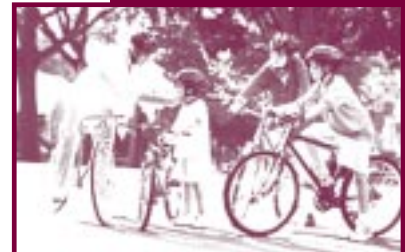
Proper helmet use is always included in bike safety education.