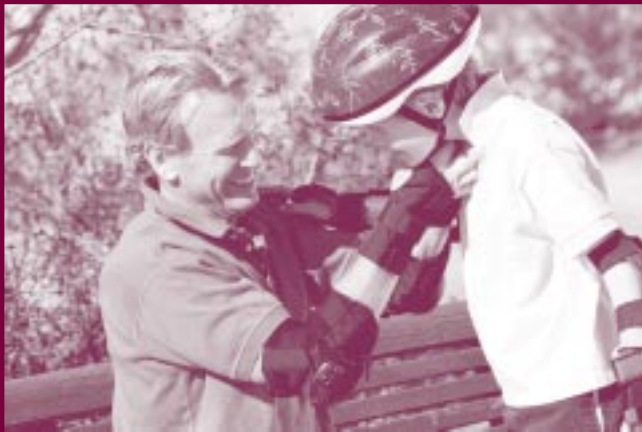
Proper helmet fitting is a critical skill.

instructions on proper helmet fitting as well as additional resources such as a bicycle events calendar and bicycle-related classroom activity suggestions that could be used in other curriculum topics. Suggestions for follow-up activities include a poster drawing, science fair projects, and writing assignments relating to bicycling.