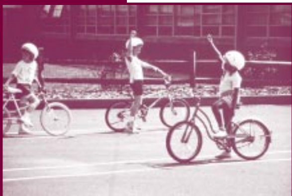
Simulated road courses are a safe way to introduce bicyclists to the skills required for riding in traffic.

The following skills are taught in Module 5: