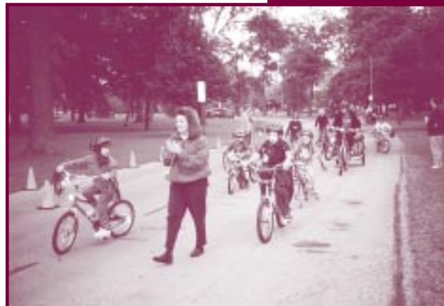
Children demonstrate safe biking skills in a bike rodeo course.

Other benefits for participants are community service education and skills in operating a business, repairing bicycles, overcoming the psychological barriers of geography, and riding a bike safely.