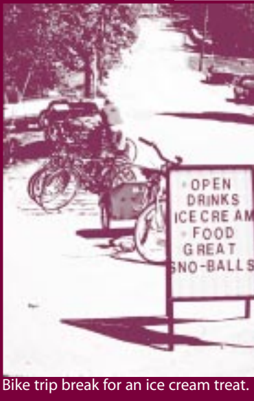
Bike trip break for an ice cream treat.

Days 5 to 8 consist of longer distance rides and riding in more complex traffic patterns. During a rainy day or riding break, students are taught to fix a flat tire, plan routes, and read maps. A long, fun trip is taken on the last day, and more adult volunteers are invited. For example, it may consist of a 12-mile trip around a lake, ending at an ice cream store.