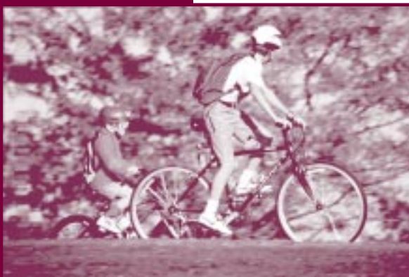
Children need helmet-wearing adults as role models.

The challenges are to educate more children to wear helmets as well as to convince adults to wear helmets so they are good role models for the children. The Kids on Bikes program has not yet been incorporated in public schools.