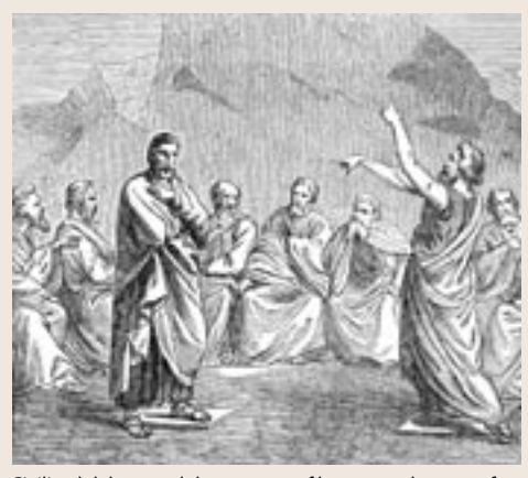
Civilized debate and due process of law are at the core of democratic practice. This woodcut imagines an ancient Greek court on the Areopagus outcrop in Athens.

Democracy, which derives from the Greek word "demos," or "people," is defined, basically, as government in which the supreme power is vested in