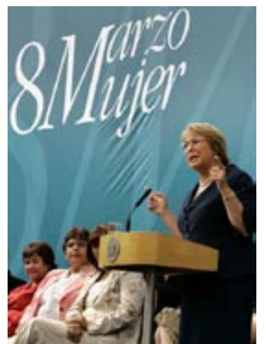
The more self-confident the democracy, the greater the variety of candidates. Michelle Bachelet's election as Chilean president expanded political horizons for women.

Democratic elections are competitive. Opposition parties and candidates must enjoy the freedom of speech, assembly, and movement necessary to voice their criticisms of the government openly and to bring alternative policies and candidates to the voters. Simply permitting the opposition access to the ballot is not enough. The party in power may enjoy the advantages of incumbency, but the rules and conduct of the election contest must be fair. On the other hand, freedom