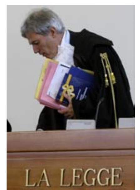
A judge leaves his bench during a criminal trial in Rome, 2005. The judge's costume reflects centuries of legal tradition.

Whether elected or appointed, judges must have job security or tenure, guaranteed by law, in order that they can make decisions without concern for pressure or attack by those in