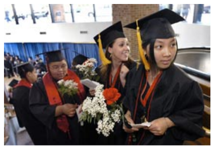
An educated citizenry is the best guarantee for a thriving democracy.

characterizes all modern democracies, no matter how varied in history, culture, population, and economy.