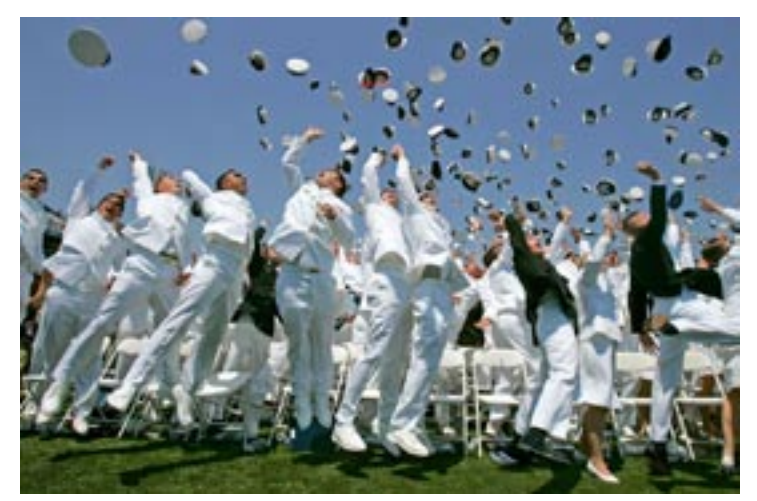
U.S. military cadets throw their hats in the air upon graduation. A professional military needs to be as well educated as its civilian overlords.

before becoming involved in politics; armed services must remain separate from politics. The military are the neutral servants of the state and the quardians of society.