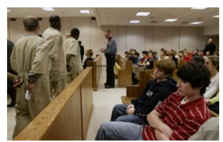
In democracy, trials are open to the public. Here, a group of American teens gets a civics lesson and a symbolic choice.

The rule of law protects fundamental political, social, and economic rights and defends citizens from the threats of both tyranny and lawlessness. Rule of law means that no individual, whether president or private citizen, stands above the law. Democratic governments exercise authority by way of the law