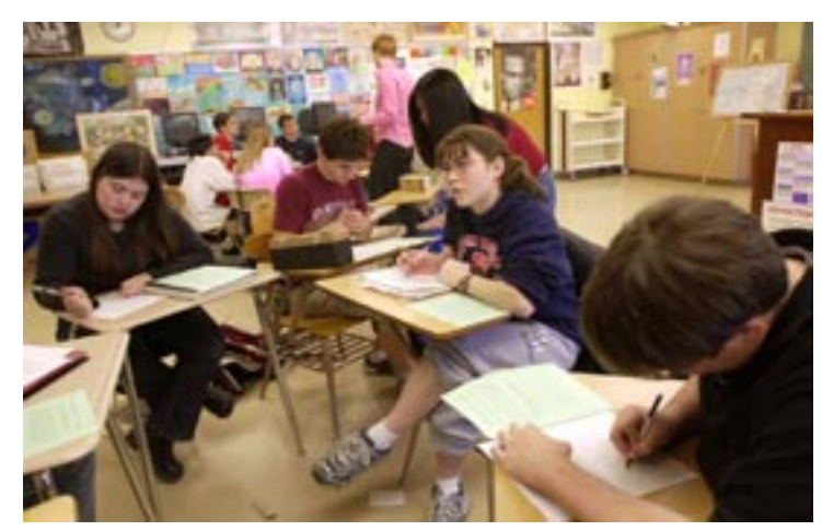
In the U.S. federal system, institutions such as the police and schools are largely funded and managed at the local level.

The United States, for example, is a federal republic with states that have their own legal standing and authority independent of the federal government. Unlike the political subdivisions in nations such as Britain and France, which have a unitary political structure, American states cannot be abolished or changed by the federal government. Although power at the national level in the United States has grown significantly,