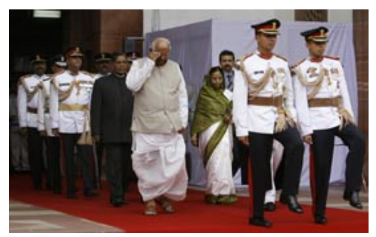
Some democracies combine elements of presidential and parliamentary systems: above, Indian President Pratibha Patil arrives at swearing-in ceremony, 2007.

For authoritarians and other critics, a common misapprehension is that democracies, lacking the power to oppress, also lack the authority to govern. This view is