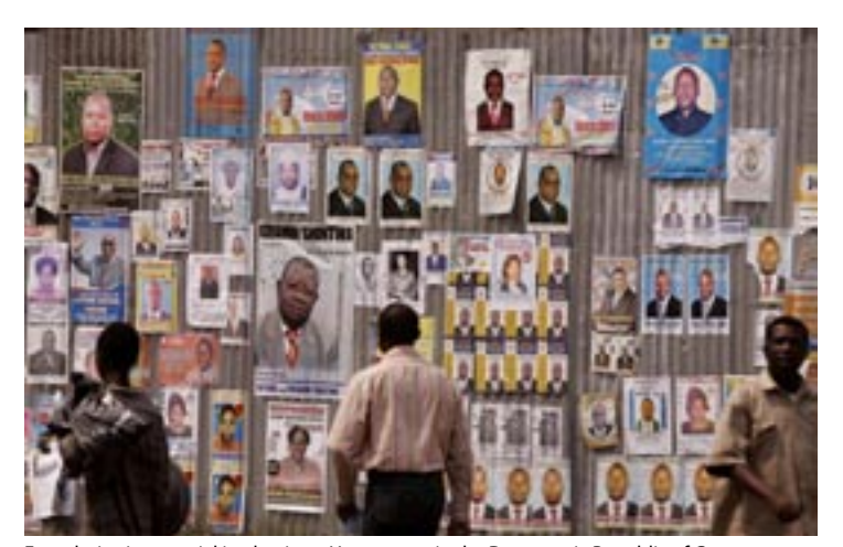
Free choice is essential in elections. Here, voters in the Democratic Republic of Congo peruse choices in 2006.

chief decision-makers in a government are selected by citizens who enjoy broad freedom to criticize government, to publish their criticism, and to present alternatives."