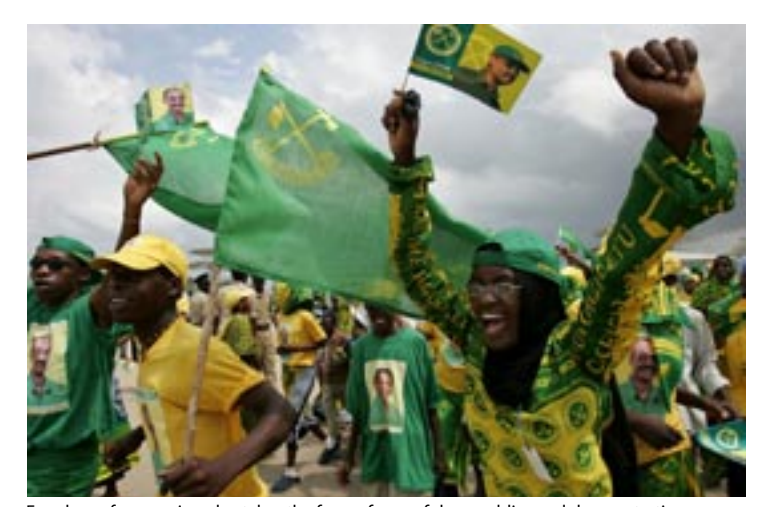
Freedom of expression also takes the form of peaceful assemblies and demonstrations. Above: political rally, Zanzibar, 2005.

Citizens of a democracy live with the conviction that through the open exchange of ideas and opinions, truth will eventually win out over falsehood, the values of others will be better understood, areas of compromise more clearly defined, and the path of progress opened. The greater the volume of