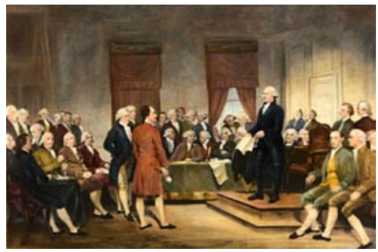
Signing of the U.S. Constitution, Philadelphia, 1787.

A constitution defines the basic purposes and aspirations of a society for the sake of the common welfare of the people. All citizens, including the nation's leaders, are subject to the nation's constitution, which stands as the supreme law of the land.