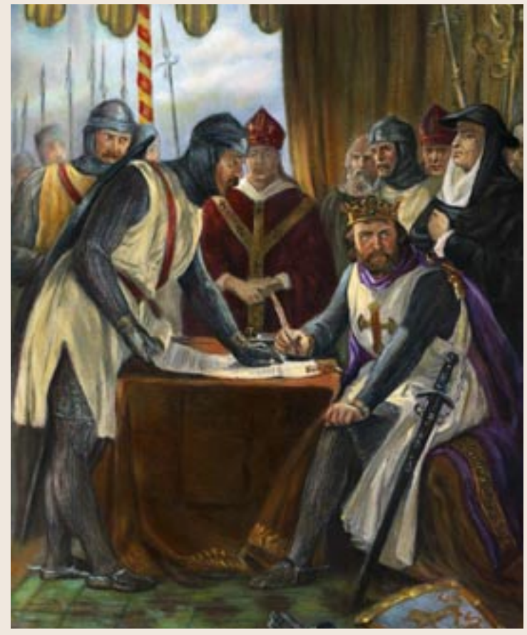
In 1215, English nobles pressured King John of England to sign a document known as the Magna Carta, a key step on the road to constitutional democracy. By doing so, the king acknowledged he was bound by law, like others, and granted his subjects legal rights.

Abraham Lincoln, democracy is government "of the people, by the people, and for the people."