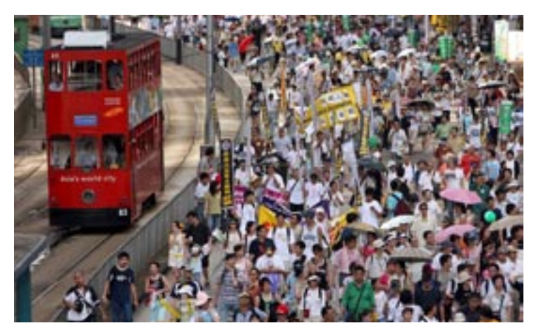
Democracy as hope: In 2006, 20,000 people marched in Hong Kong carrying banners reading "Justice, Equality, Democracy, and Hope."

of speech and assembly while countering speech that truly encourages violence, intimidation, or subversion of democratic institutions. One can disagree forcefully and publicly with the actions of a public official; calling for his (or her) assassination, however, is a crime.