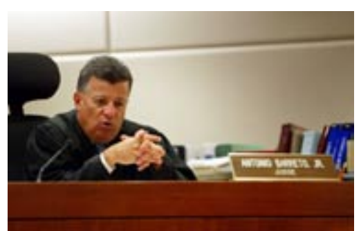
The professionalism of judges is one of their best defenses against social and political pressure.

In democracies, the protective constitutional structure and prestige of the judicial branch of government guarantees independence from political pressure. Thus, judicial rulings can be impartial, based on the facts of a case, legal arguments, and relevant laws — without restrictions or improper influence by the executive or legislative branches. These principles ensure equal legal protection for all.