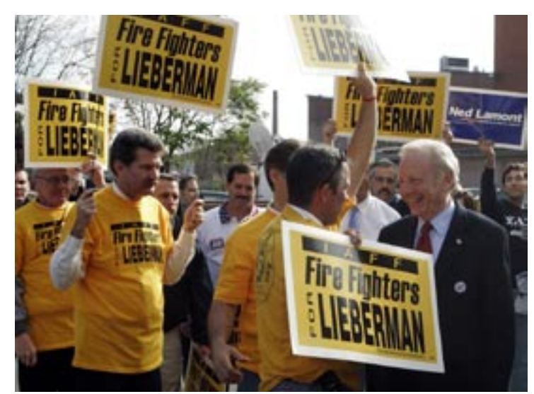
Connecticut senatorial candidate Joseph Lieberman courts firefighters in 2006. Interest groups are wooed and won by politicians one at a time.

where rival Republican and Democratic parties are decentralized organizations functioning largely in Congress and at the state level — which then coalesce into active national organizations every four years to mount presidential election campaigns. Election campaigns in a democracy are often elaborate, time-consuming, and sometimes silly. But their function is serious: to provide a peaceful and fair method by which the people can select their leaders and determine public policy.