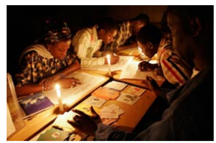
Election workers count votes by candlelight in Dakar, Senegal.

society. The opposition continues to participate in public life with the knowledge that its role is essential in any democracy. It is loyal not to the specific policies of the government, but to the fundamental legitimacy of the state and to the democratic process itself.