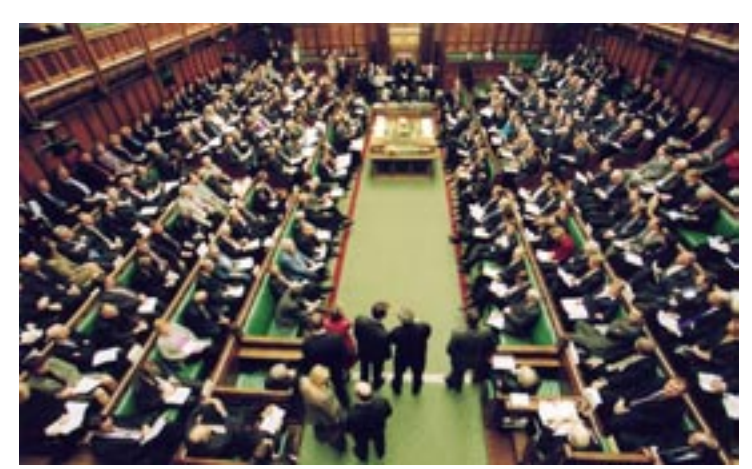
England's House of Commons, the lower chamber of the British Parliament, is one of the world's oldest and most successful democratic institutions.

In a presidential system, by contrast, the president usually is elected separately from the members of the legislature. Both the president and the legislature have their own power bases and political constituencies, which serve to check and balance each other.