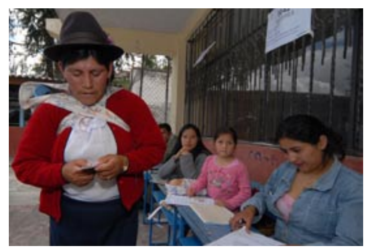
Citizens vote on laws and issues as well as candidates for office. This 2007 photo shows an Ecuadorian woman voting on constitutional reform.

leadership of the government for a set period of time. Popularly elected representatives hold the reins of power; they are not simply figureheads or symbolic leaders.