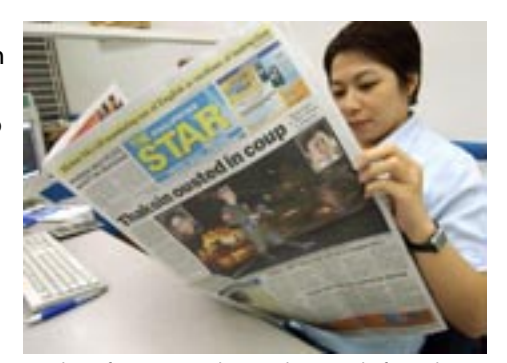
Freedom of expression relies on vibrant, multi-faceted press and information services.

but distinctive functions that remain fundamentally unchanged. One is to inform and educate. To make intelligent decisions about public policy, people need accurate, timely, unbiased information. However, another media function may