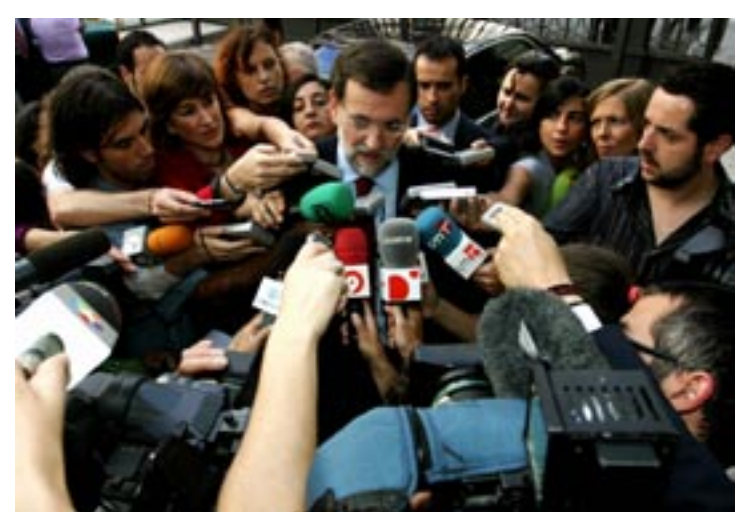
When out of office, the "loyal opposition" criticizes and checks the government. Spain's opposition party leader speaks to the press.

Legislators have a responsibility to articulate their views as effectively as possible. But they must work within the democratic ethic of tolerance, respect, and compromise to reach