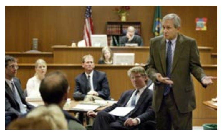
Rule of law can be complicated: above, a lawsuit alleging wrongful employment termination begins in court in the State of Washington, 2005.

time if they have once been acquitted of it in a court of law.