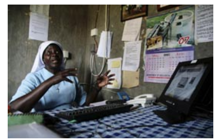
Non-governmental organizations work worldwide. Here, a Uganda aid worker uses a solar-powered computer provided by an American NGO.

Governments and NGOs frequently work as partners.