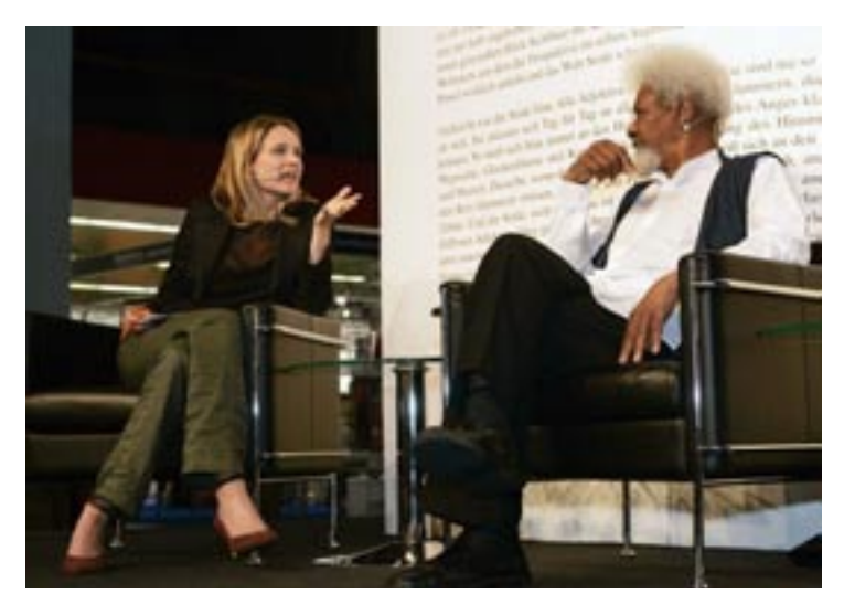
Public discussion on all kinds of topics – personal, cultural, political – is the lifeblood of democracy. Above: Nigerian Nobel-prize winner Wole Soyinka at a Swiss book fair.

can explore the possibilities of peaceful self-fulfillment and the responsibilities of belonging to a community — free of the potentially heavy hand of the state or the demand that they adhere to views held by those with influence or power, or by the majority.