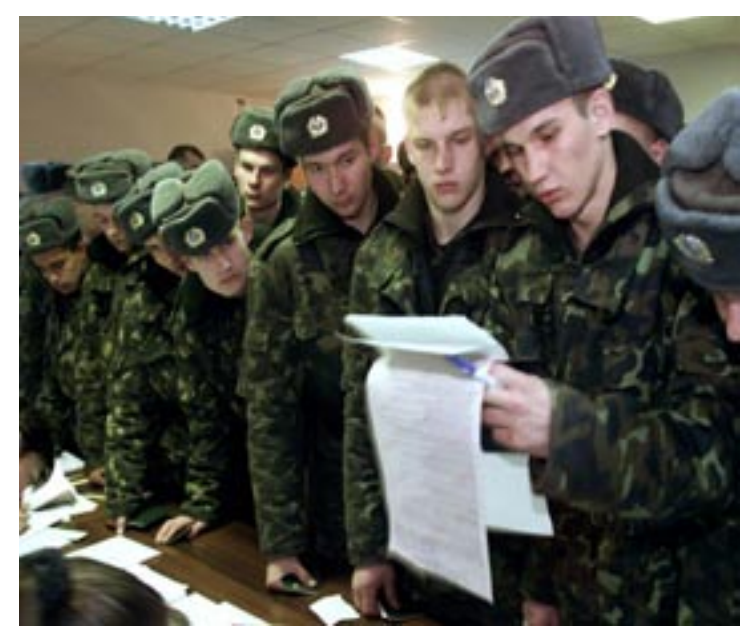
Ukranian soldiers examine ballots in Kiev in 2002

In democracies, defense issues and threats to national security must be decided by the people, acting through their elected representatives. A democracy's military serves its nation