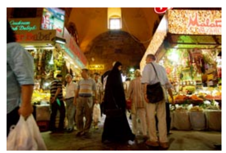
Democratic development and economic prosperity often go hand in hand: above, a market in Istanbul.