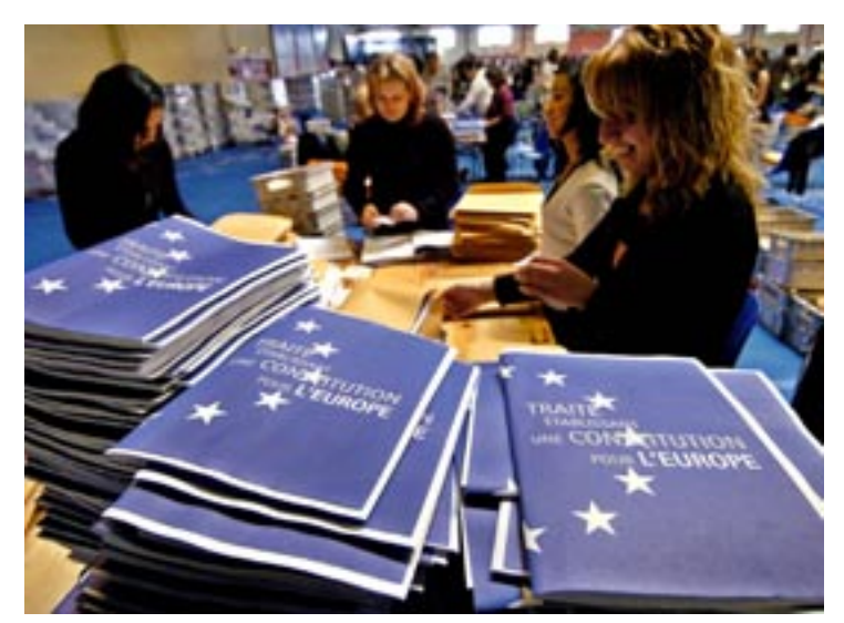
As democracies become stable, they permit more freedoms. When French voters were given the right to vote by referendum on the proposed European Constitution (here being mailed to them in May 2005), they expressed their binding opinion by rejecting it.

Citizenship in a democracy requires participation, civility, patience — rights as well as responsibilities. Political scientist Benjamin Barber has noted, "Democracy is often understood as the rule of the majority, and rights are understood more and more as the private possessions of individuals. ... But this is to misunderstand both rights and democracy." For democracy to succeed, citizens must be active, not passive, because they know that the success or failure of the government is their responsibility, and no one else's.