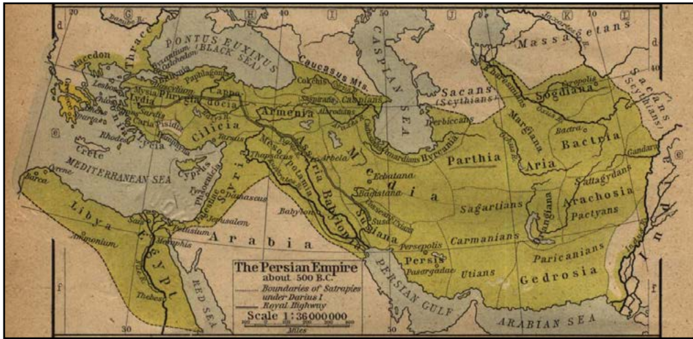
The Persian Empire, ca 500 BCE