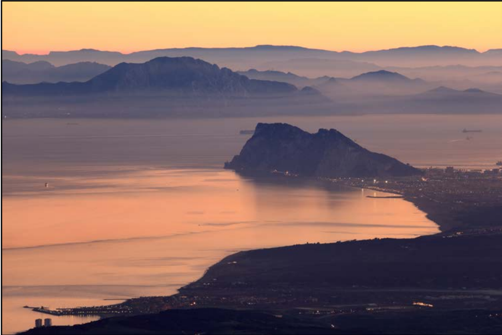
Looking down at the Rock of Gibraltar and the North African coast.