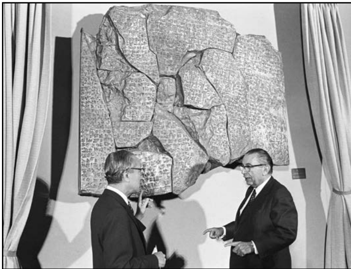
A replica (enlarged) of the Treaty of Kadesh presented in 1970 by the Turkish government to the United Nations.