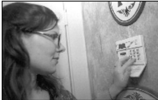
User errors account for a high percentage of false burglar alarms.