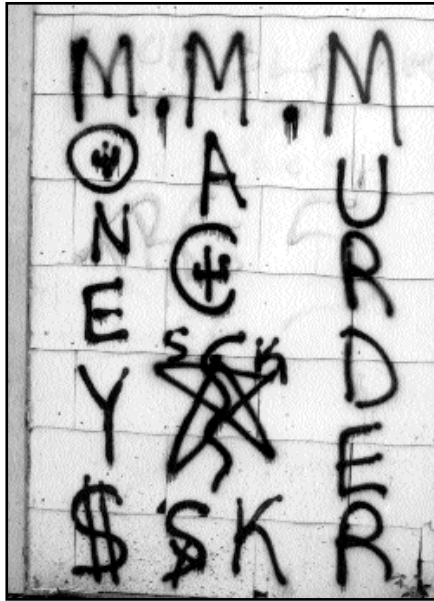
Gang graffiti marks territory and conveys threats.

In areas where graffiti is prevalent, gang and tagger graffiti are the most common types found. While other forms of graffiti may be troublesome, they typically are not as widespread. The proportion of graffiti attributable to differing motives varies widely from one jurisdiction to another. § The major types of graffiti are discussed later.