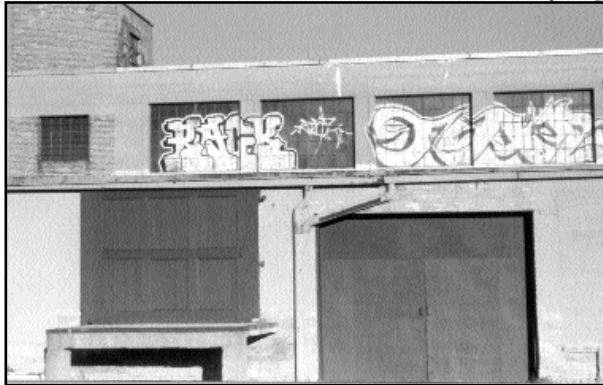
Graffiti often appears in hard-to-reach yet highly visible locations, such as on the upper-story windows of this warehouse.

In addition, two types of surfaces attract graffiti: