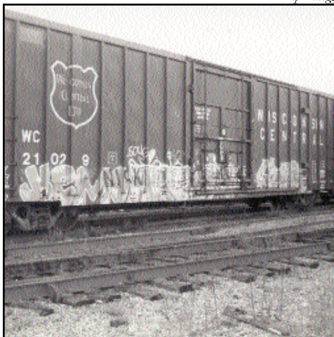
Graffiti is commonly found in transportation systems, such as on the side of this railroad car.

§ Most sources suggest that paint-over colors should closely match, rather than contrast with, the base. Contrasting paint-overs are presumed to attract or challenge graffiti offenders to repaint their graffiti; the painted-over area provides a canvass to frame the new graffiti.