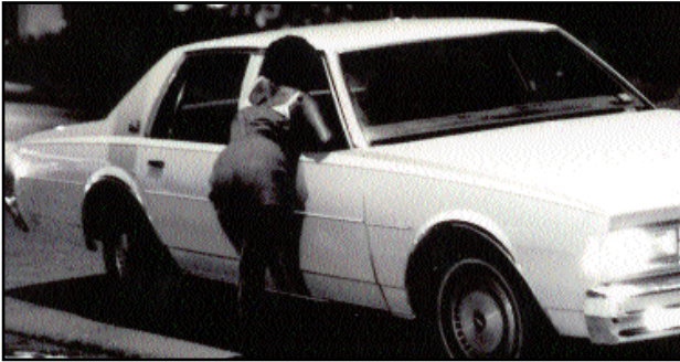
Street prostitution thrives along roads where prostitutes can talk to drivers from the curbside.

Prostitutes usually take clients to places that minimize the risk of violence and ensure that transactions occur without incident. 21 These places are often near the street where the negotiation occurred so that the amount of time required for each transaction is limited. Most are out of sight of passersby but not so secluded that prostitutes will be unable to attract attention if they need help.