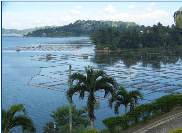
A fish farm in Lake Sebu, Philippines. Fish farming offers one way to meet growing demand for food. However, it also can lead to the eutrophication of lakes and bays.

immensely—both directly and indirectly—to global food security, and water resources play a central role in keeping these healthy. More than 1 billion people in the developing world, for example, rely on fish as their principal source of animal protein. Abundant supply of good-quality fresh water is of course essential to inland freshwater fisheries, but the same is true for as much as 75 percent of commercially important marine fisheries. This is because these species are dependent, for at least part of their lifecycles, on estuaries, and nothing is more fundamental to the health of an estuary than the inflow of fresh water. Clearly, water resource planners and those responsible for global food security must work together closely to ensure understanding of a common agenda.