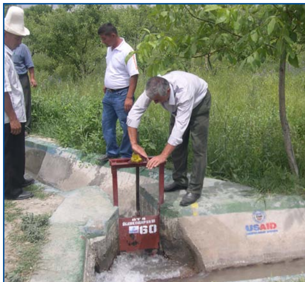
Water user association members checking control gates in an irrigation system in Kyrgyzstan. Water user associations have often proven effective managers of irrigation infrastructure and scarce water resources.

The food crisis has many dimensions, however, and it would be short-sighted to focus solely on increased agricultural production. In fact, ecosystem goods and services contribute