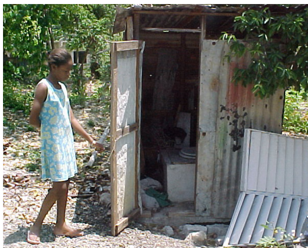
A common solution for household sanitation in rural Jamaica – a dry-pit latrine. Latrine pits in this limestone coastline often penetrate fissures, contaminating ground and coastal water.

Ultimately, achieving the internationally agreed goals requires expanding the pool of capital available to utilities, communities, and households to expand coverage, improve services, and upgrade household sanitation. In conjunction with efforts to improve the creditworthiness of water and sanitation utilities, the U.S. Government is increasingly focused on mobilizing private sector capital from domestic markets for investments in water and sanitation system expansions and upgrades. In many cases, this involves helping governments put in place favorable policies and regulations and establishing financing mechanisms such as pooled financing facilities, revolving funds, and urban infrastructure funds that serve as financial intermediaries for a broader number of credit-worthy utilities. Combining these mechanisms with credit enhancements such as USAID's Development Credit Authority (DCA) lowers risks to private sector investors and encourages their investment in the sector. DCA guarantees are also being used to leverage financing through microfinance institutions for small-scale systems and to fund household connection fees and sanitation upgrades.