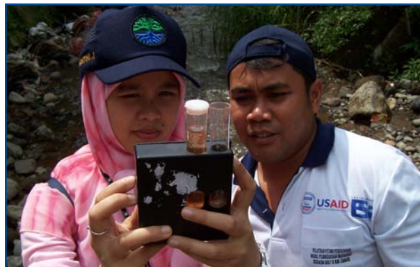
Monitoring water quality in Indonesia. Linking water quality monitoring with public outreach has improved support for investments in wastewater collection and treatment infrastructure.

Beyond the domain of U.S.-funded activities, there is recognition of the need to improve information about water resources management,