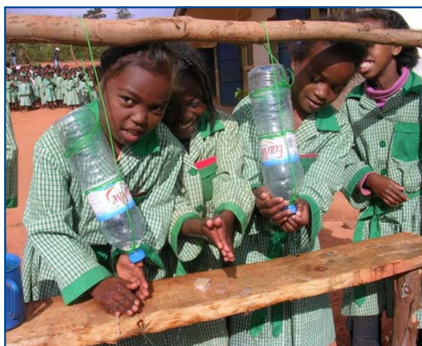
Children line up to wash hands on Global Hand Washing Day in Madagascar. School-based programs contribute to improved community hygiene behaviors.