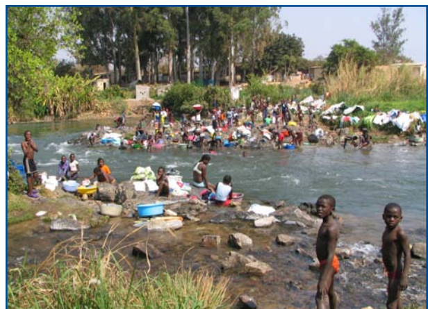
Washing near Menongue, Angola, in the Cueba River, in the upper Okavango River Basin. Rivers and other water sources are under increasing pressure to meet household, agricultural, and industrial development demands.