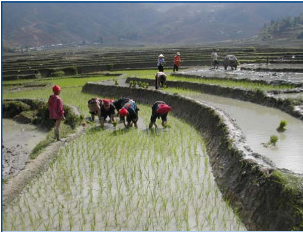
Rice farmers in Vietnam. Increasing food production depends upon reliable sources of fresh water in addition to improved seed varieties, fertilizers, and farm management technologies.

U.S. Government to leverage its efforts for greater impact by coordinating with ongoing or new programs funded by these donors.