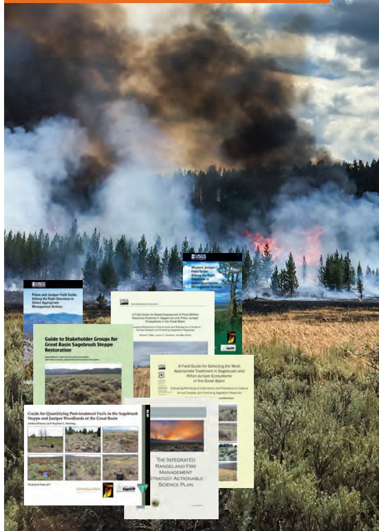
Figure 1. A sample of the science from SageSTEP appearing in planning and policy documents and tools. Groups and teams using these guides include, but are not limited to, the following: Fire and Invasive Species Assessment Teams to develop strategies to reduce the impacts of annual grasses and frequent fire; Agricultural Research Service and its private landowner customers to model and predict erosion potential; and U.S. Forest Service to develop risk assessments to protect sagebrush sites free of nonnative grasses.

Information gathered and synthesized from SageSTEP has removed much of the guesswork associated with vegetation treatments, provided the knowledge to weigh treatment options, and allowed for more educated evaluation of tradeoffs in sagebrush management.