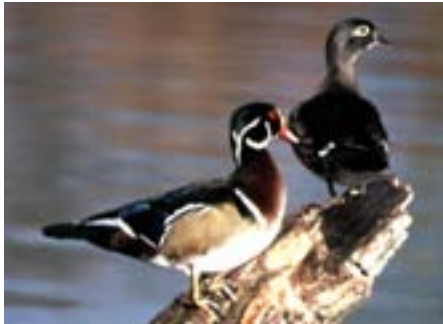
Wood duck pair

regeneration are a few of the forestry management techniques utilized to improve wildlife habitat. Mature forests are also being preserved and left intact for species which require this habitat.