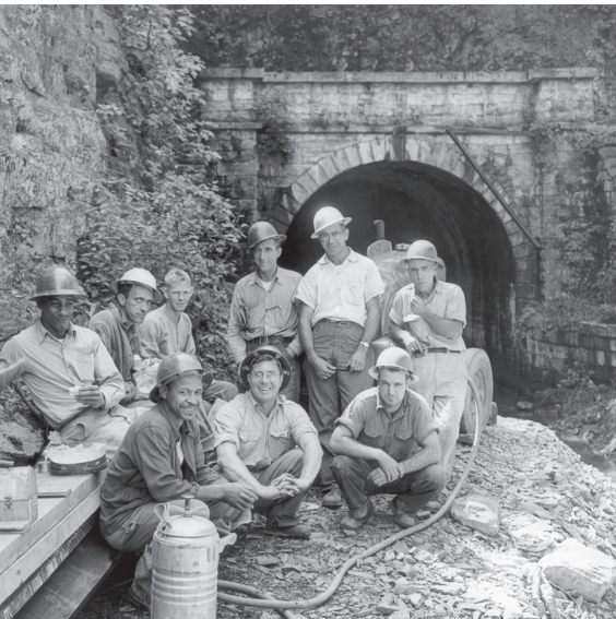
The National Park Service conducted repairs to the tunnel in 1956, 1979, and 2007. Above, craftsmen repairing the tunnel take a lunch break.

Throughout the canal’s history, numerous floods damaged the towpath, culverts, locks, and tunnel. As competition from the railroad increased, repairing the canal structures proved unprofitable. In 1924, the canal closed to commercial shipping. In 1938, the federal government acquired the canal for two million dollars. In 1950, the Bureau of Roads and the National Park Service proposed a parkway along the canal from Georgetown to Cumberland, including a section through the Paw Paw Tunnel. Opposition convinced the federal government to support a non-motorized recreational trail along the old towpath. The tunnel was badly deteriorated. The National Park Service made major repairs to the tunnel, including replacing fallen bricks, filling cavities along the towpath, stabilizing rock slides, and repairing the façade of the downstream portal. Maintenance work continues to allow safe passage for today’s hikers and bikers.