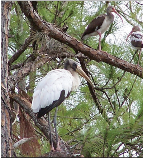
Wood stork (foreground) and immature white ibis resting in a slash pine tree.

Getting the most from your bill doesn't just apply to the dollar. As adults, the white ibis ( Eudocimus albus ) display a white body and brilliantly orange beak with a noticeable downward curve. The immatures have brown wings. These birds forage in the ground and water, using their beak like a needle of a sewing machine. Each stitch probes the ground, providing an opportunity to capture aquatic insects, crustaceans, small fish or amphibians.