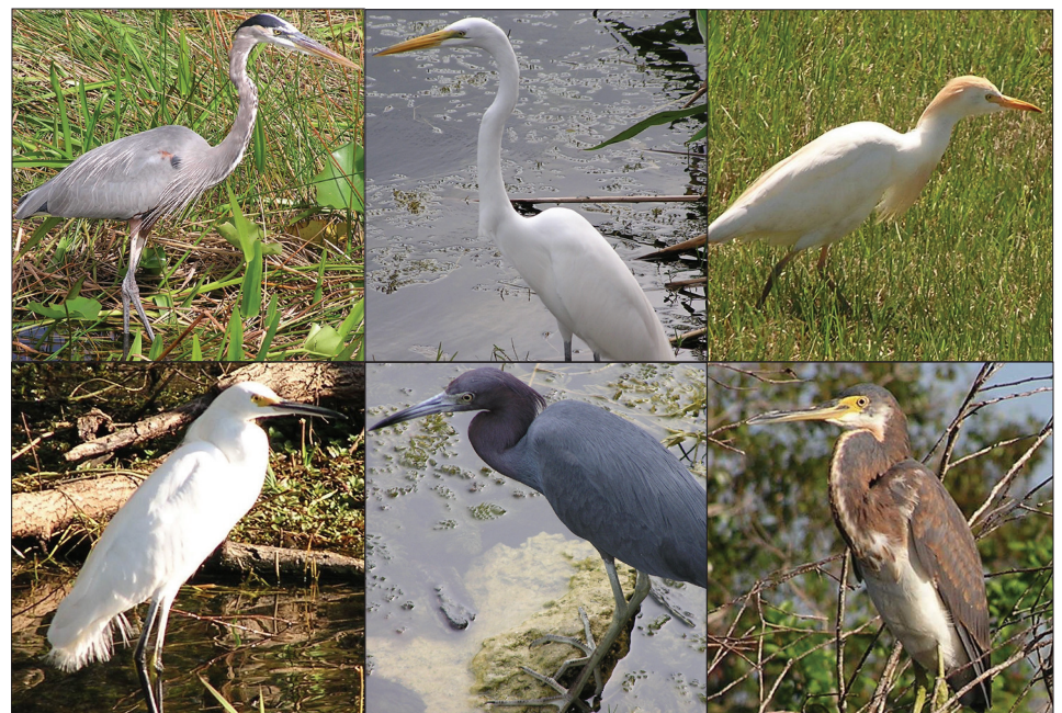
Wading birds of Big Cypress National Preserve. Top (left to right) great blue heron, great egret and cattle egret. Bottom (left to right) snowy egret, little blue heron and tricolored heron.