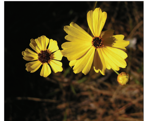
Yellow tickseed ( Coreopsis leavenworthii ) highlights several prairies along the route.

Upper Wagonwheel Road, north of Concho Billie, marks the north side of the loop. As you turn west you follow a different canal with an abundance of aquatic plants as well as the presence of tall grasses like the common reed ( Phragmites australis ). This grass is native to Florida and provides cover to wildlife. Stop a moment and listen. What do you hear? Bird calls are often heard before the birds are seen. Common moorhens