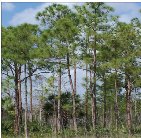
Slash pines tower over a cabbage palm.

The sea of sawgrass gives rise to islands of palm trees. The cabbage palm ( Sabal palmetto ) towers over the grass reaching heights of 80 feet. This palm is the Florida state tree, an award well deserved. There are a number of uses for this tree. Humans eat hearts of palm, and American Indians harvest fronds for roof construction. The palm is not valued solely for its uses, as its beauty is appreciated by many.