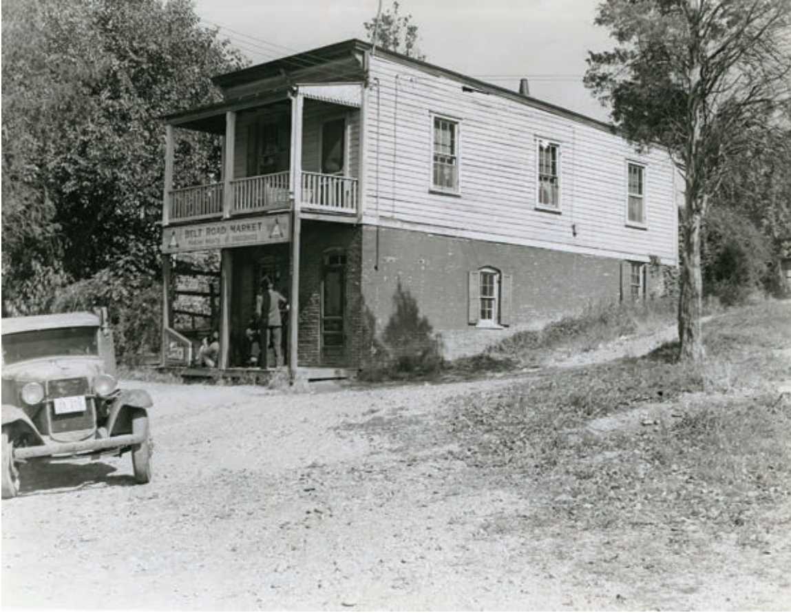
Figure 10: Belt Road Market, early twentieth century.