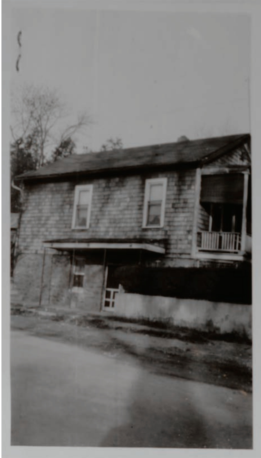
Figure 16: Charles Burgin’s home, from which he ran a lunch room, circa 1930s.