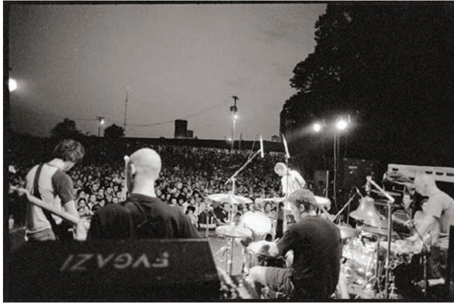
Figure 1: Fugazi at Fort Reno in July 2002.

continued: “When MacKaye looked around at the expensive neighborhood that surrounded him, that was a theatrical gesture, and it communicated certain things that words never could. . . I can still remember getting chills.” 3