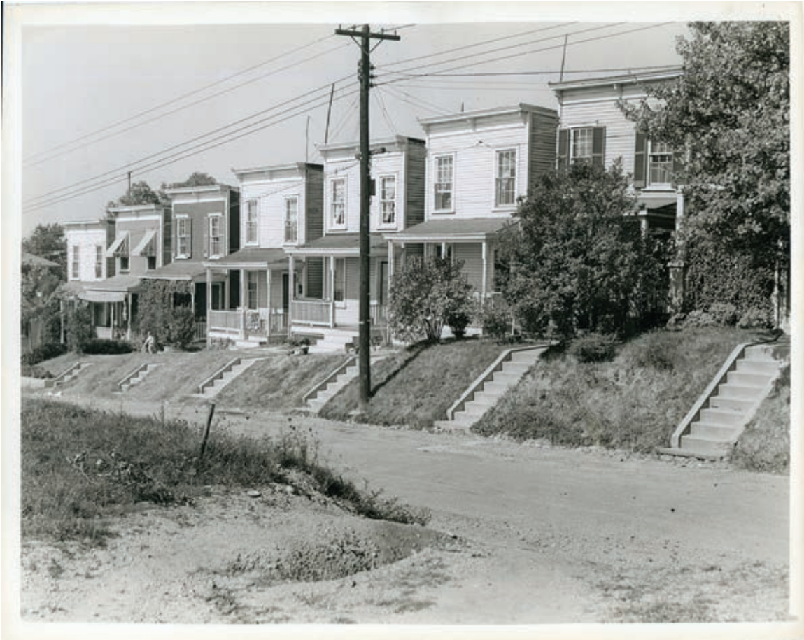
Figure 2: 3900 block of Davenport Street, early twentieth century.