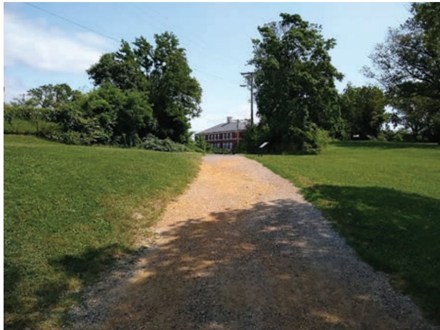
Figure 22: Present-day image of Fort Reno Park.