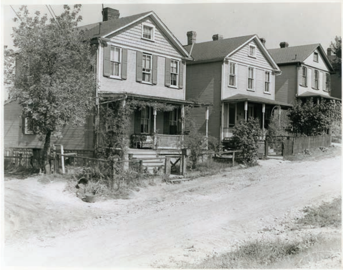
Figure 15: Houses on Ellicott Street, early twentieth century.