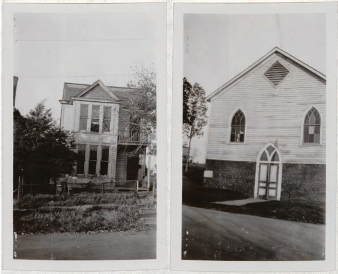
Figure 8: Mount Asbury Methodist Episcopal Church, circa 1930s.