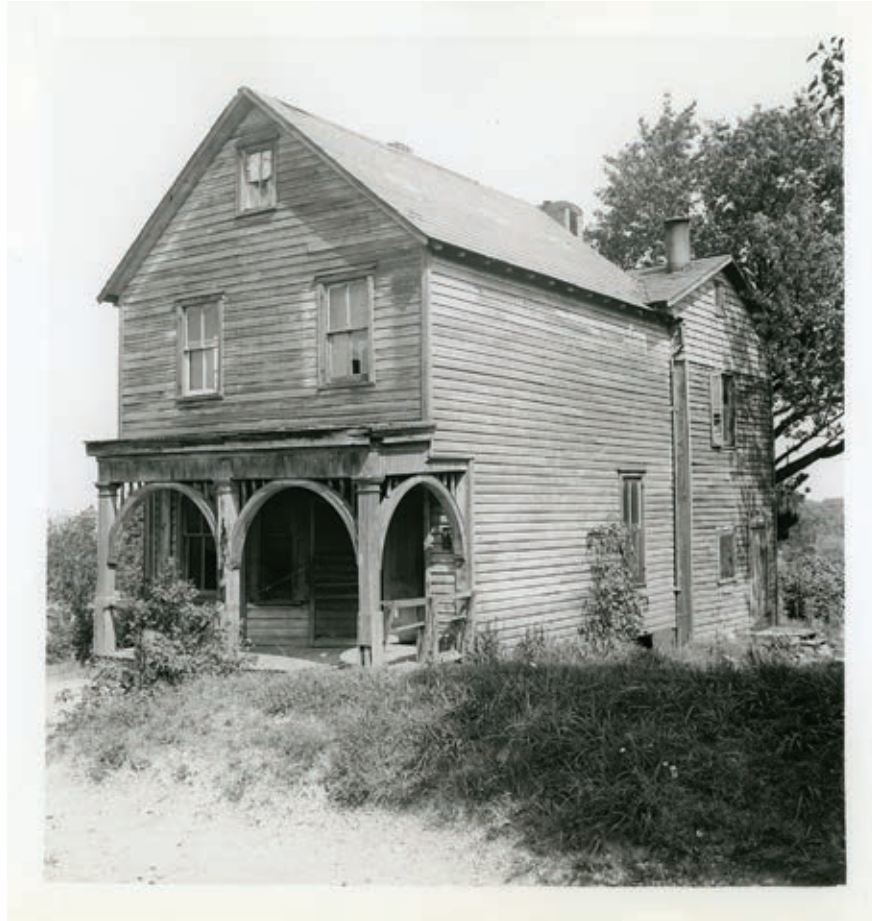
Figure 14: 3909 Emery Place, early twentieth century.

Rather, it seems that Reno residents knew they needed to publicize their efforts to improve their neighborhood’s public health and infrastructure because they understood that its existence was in jeopardy. Surely, the RCA took up its campaign of renovations to improve the lives of residents and the neighborhood in which they lived, but it seems that they did so with an eye to addressing the types of concerns that NSCA officials had cited as reasons for the neighborhood’s destruction. Just as the NSCA forwarded intelligence of its meetings to local papers, and thus informed the District’s population of its estimation of the problems in Reno and the reasons why Reno needed to be destroyed, the RCA took its case to the people, showcasing its efforts to improve community conditions. It seems that their efforts to raise public health standards and improve local infrastructure met with success: when the drumbeat resumed for Reno’s clearing in the 1920s, the arguments made by the NSCA, other local citizens’ associations and city officials desirous of converting Reno did not hinge on the public health concerns that had been the focus of anti-Reno agitation during the early years of the twentieth century.