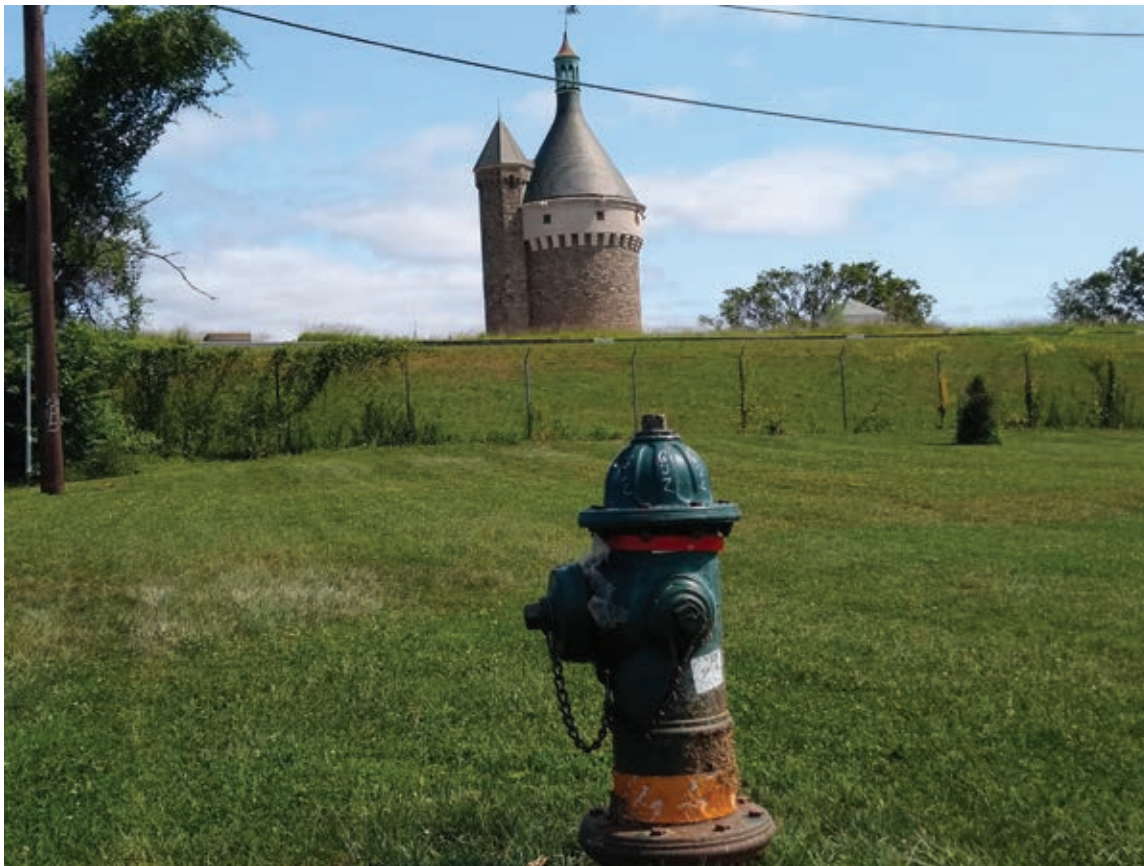
Figure 20: Present-day image of fire hydrant in Fort Reno Park.

neighborhood it originally served was destroyed, the Reno School can play an important role in efforts to interpret history of the area and serve as a forum for presenting new research related to Fort Reno. 467