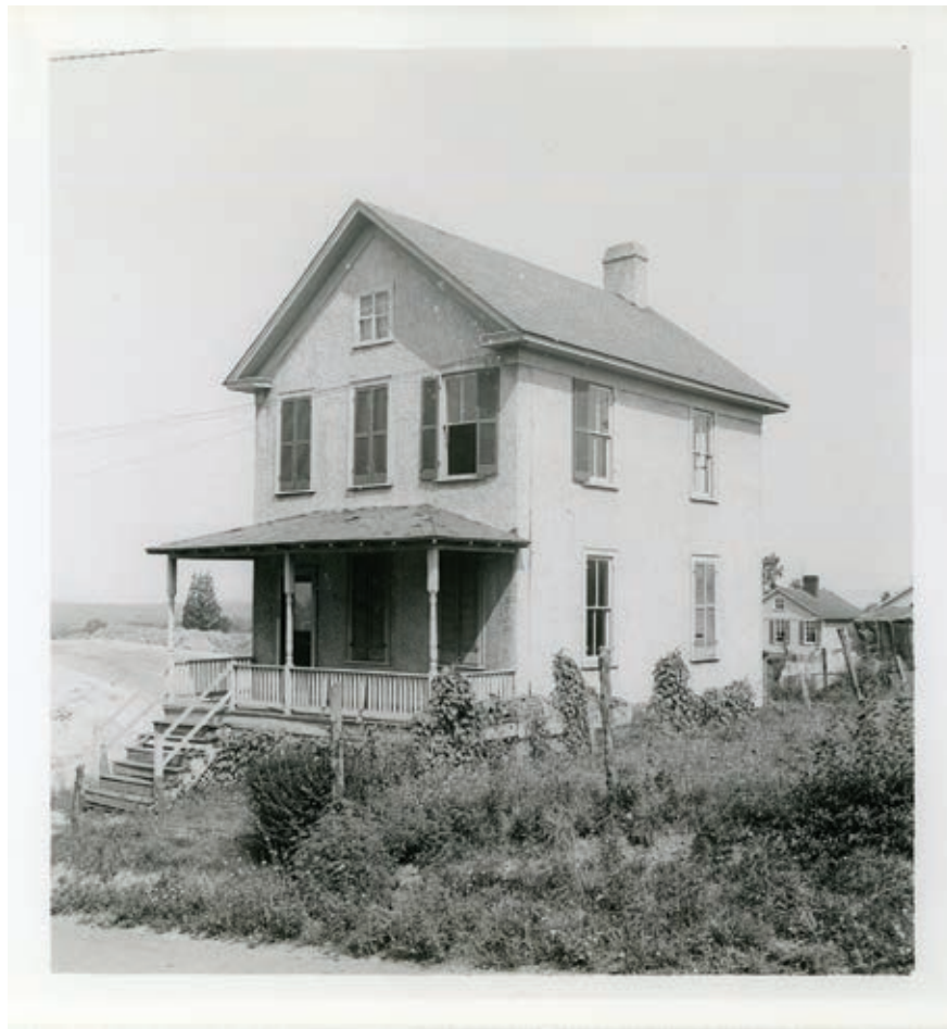
Figure 13: 3913 Donaldson Place, early twentieth century.

certainly the opening of the Jesse Lee Reno School was met with great fanfare in 1904, as detailed in the opening pages of this chapter. But this petition showcased local whites’ determination to keep the Black and white communities of Tenleytown separate; it hinted at dialogue between the races, but suggested cold, distant relations between them, local whites taking pains to show that they had sought the opinions of only the “best element” of the local Black community. 282 The concern for property values that the white representatives of Grant Road cited, moreover, were the same that justified the proliferation of white citizens’ associations and restrictive covenants in the early decades of the twentieth century as instruments for preventing African Americans from purchasing land in white neighborhoods. 283