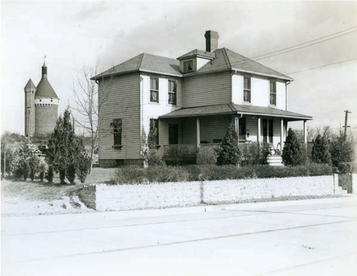
Figure 11: 3915 Chesapeake Street, early twentieth century.