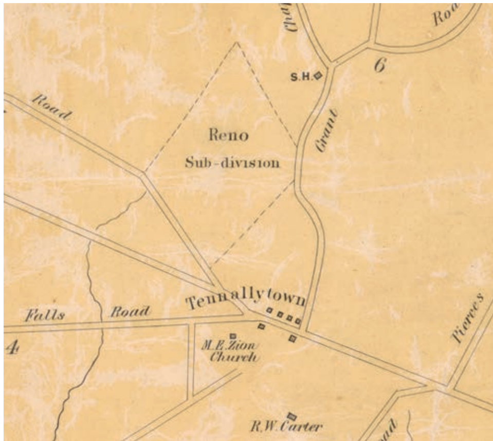
Figure 4: 1870 map of Reno Subdivision.

auction, including land in the Onion & Butts subdivision. 48 Apparently one of the heirs of Giles Dyer, named Giles F. Dyer, had purchased the land back from the Onion & Butts firm by mid-1870, as an advertisement placed in the Evening Star in September 1870 announced that Dyer “had purchased Reno City . . . and perfected title to the same.” Dyer offered those who had purchased lots from Onion & Butts the chance “to complete their title” by visiting him at his office on 15th Street. 49