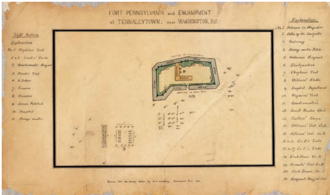
Figure 3: 1862 map of Fort Pennsylvania.

September 1862. Personnel stationed at the fort kept a watchful eye on the northwest approaches to the capital. Fort Reno proved sufficiently formidable that when in July of 1864 Jubal Early led a Confederate raid on Washington, DC, the Southern general was impressed by Reno's strong defenses and chose to direct his force's main effort against Fort Stevens, roughly three miles to the northeast. 23