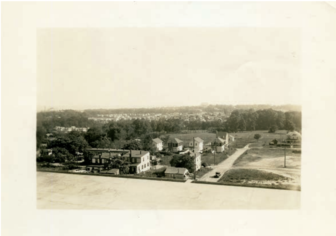
Figure 7: View south toward National Cathedral from Reno water tower, early twentieth century.

lived alongside white families on many of its streets. The neighborhood’s uneasy coexistence with local white communities, however, was reflected in the protests that accompanied the opening of the Reno School, two seemingly designed to keep Fort Reno’s Black population from spreading beyond its confines, and the third designed to accomplish Reno’s destruction altogether. Eventually, local whites were successful in their crusade to wipe Reno off the map, and the Reno School closed in 1950, having served fewer than ten students during its last years of operation. The story of Reno’s destruction will be told in the following chapter; the present chapter focuses on daily life in the neighborhood, from the last decades of the nineteenth century through the early decades of the twentieth century, during which time Fort Reno was—to use the words of two longtime members, Thornton Lewis and Samuel Hebron—a community of “law-abiding citizens, working men, well thought of” who sought “to live a higher and nobler life.” 103