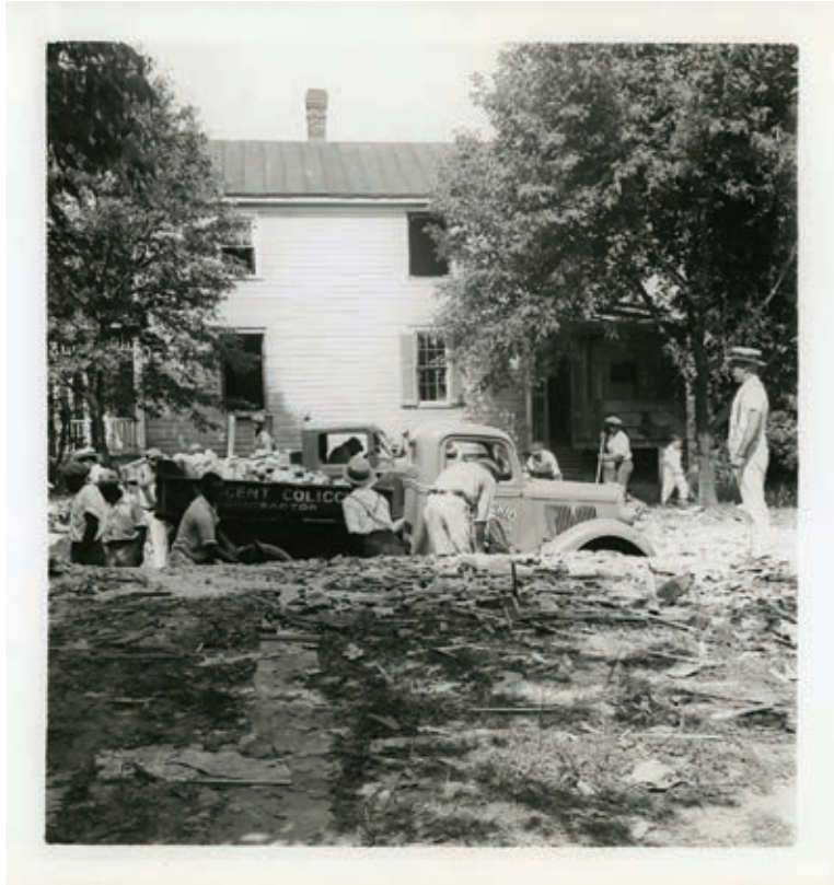
Figure 19: 1936 demolition of house on Emery Street.