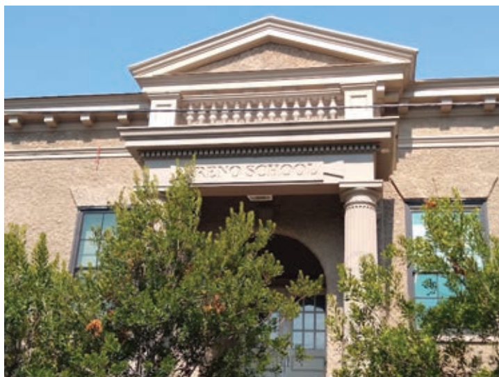
Figure 21: Present-day image of Fort Reno School.

less revealing about the everyday life of the Reno community on which much of the present study focuses. Goings-on in and around Reno frequently made their way into District newspapers, which have been a key resource used by this study. Contemporary newspaper databases have enabled the author of this study to locate hundreds of articles related to the neighborhood and its residents, but it is clear that more exist. One complication for researchers is that happenings in Reno often appeared in community reports on Tenleytown and Georgetown. Additionally, local reporters used multiple names to refer to the community over the years, including Fort Reno, Reno City, Fort Reno City, Reno Hill, Mount Reno, Reno heights, Reno subdivision, and Reno section; at least one newspaper report referred to the community as “Prospect Hill.” 471 The current study has located many articles focused on the neighborhood and its inhabitants, but there are surely additional items that have not yet been located, which can shed further light on community life in Fort Reno. Additional research into Union Army and other federal records from the Civil War period may shed light on the presence of African American laborers in and around Fort Reno during the wartime period, and perhaps prove that Black laborers did construct a makeshift settlement near the fort that served as the nucleus of the Fort Reno community.