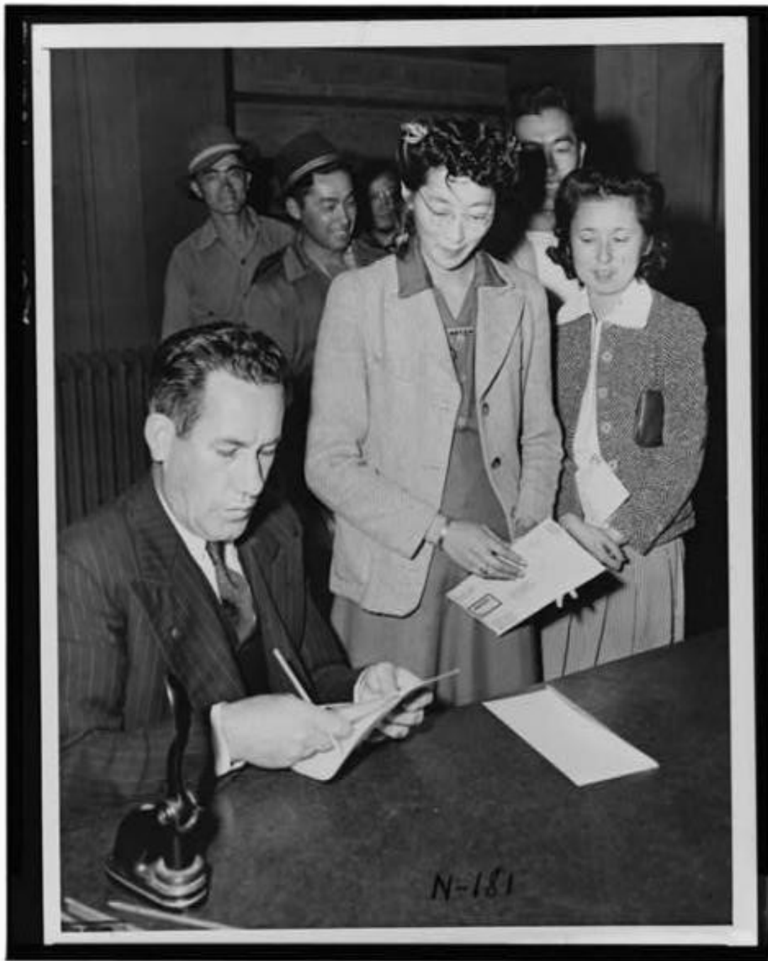
The city clerk of San Bruno, California accepts absentee ballots of Japanese American evacuees during a state election, 1942.