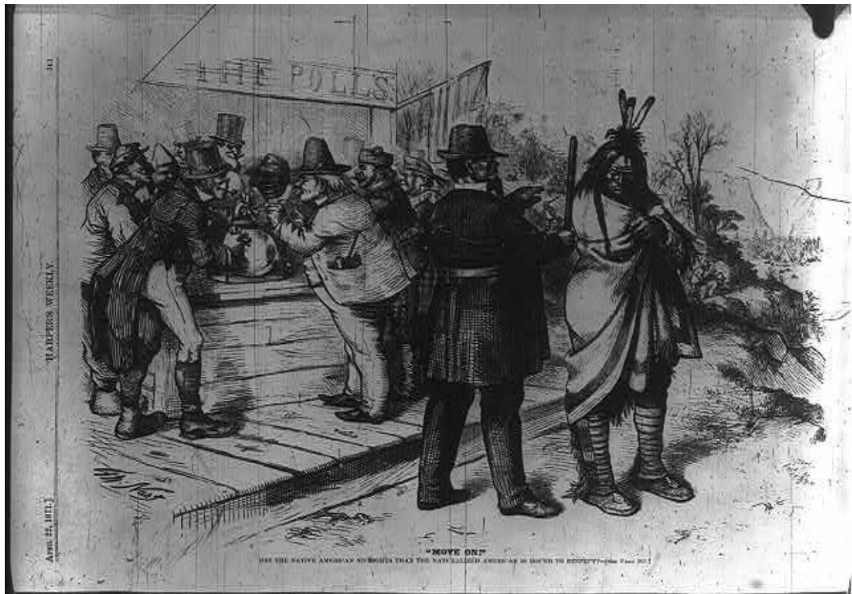
“‘Move on!’ Has the Native American no rights that the naturalized American is bound to respect?” A policeman ordering a Native man to “move on” away from a voting poll. From Harper’s Weekly, April 22, 1871.