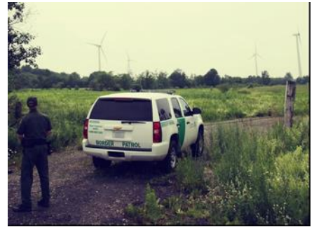
U.S. Border Patrol agents survey the international border in Vermont.

The drivers in both incidents are being prosecuted for human smuggling. The six undocumented Mexican nationals are pending removal proceedings in accordance with Tucson Sector guidelines.