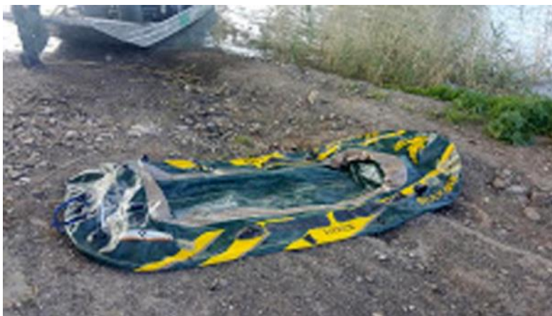
Border Patrol Agents rescued a suspected smuggler after the raft he used for his escape lost buoyancy.