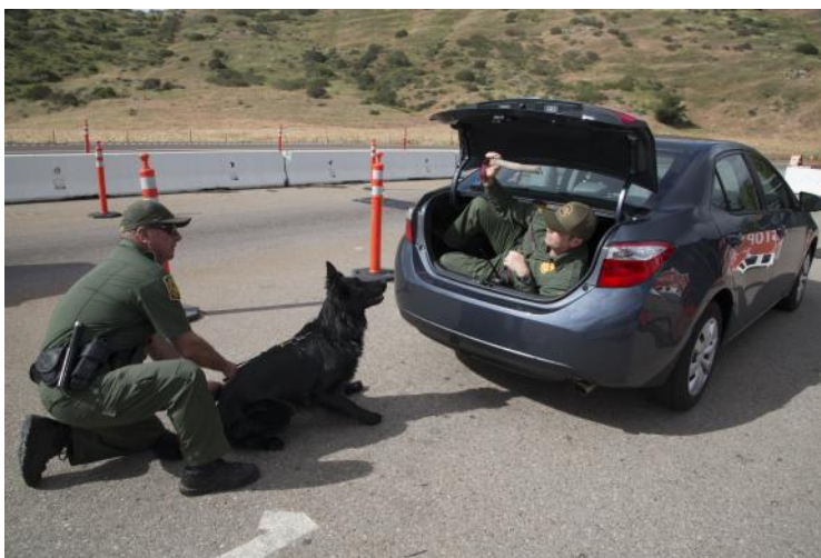
U.S. Border Patrol Agents conduct a simulation with a CBP canine alerting on a vehicle attempting to cross the border