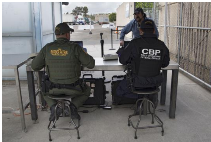
A CBP Officer works alongside a Border Patrol Agent at the Otay Mesa, San Diego border crossing.