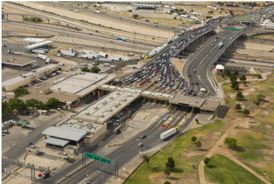
The Bridge of the Americas in El Paso Texas

Watch out for the word " not " since that makes the sentence have the opposite meaning.