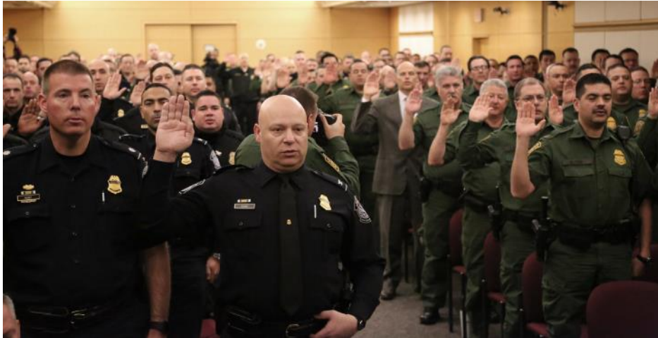
CBP Officers and Border Patrol Agents assisting with security for the 2017 Presidential Inauguration are sworn in at a ceremony in Washington, DC