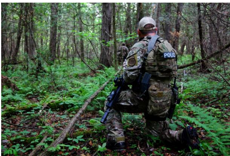
A BORTAC team member assists in a manhunt for escaped fugitives in the forest outside of Dannemora, N.Y.