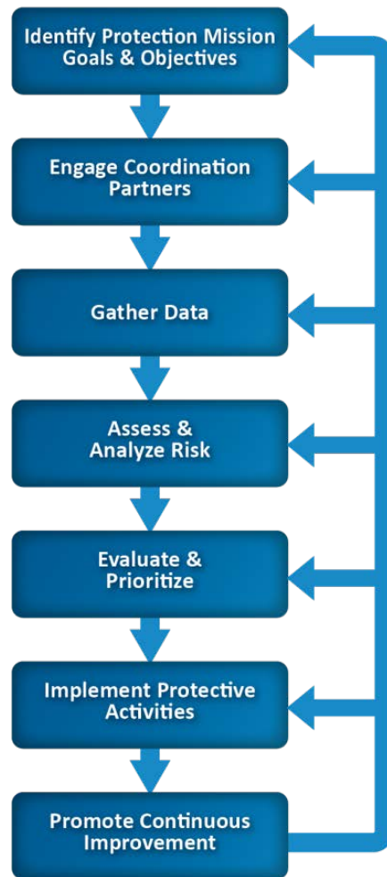
Figure 2: Steady-state Protection Process