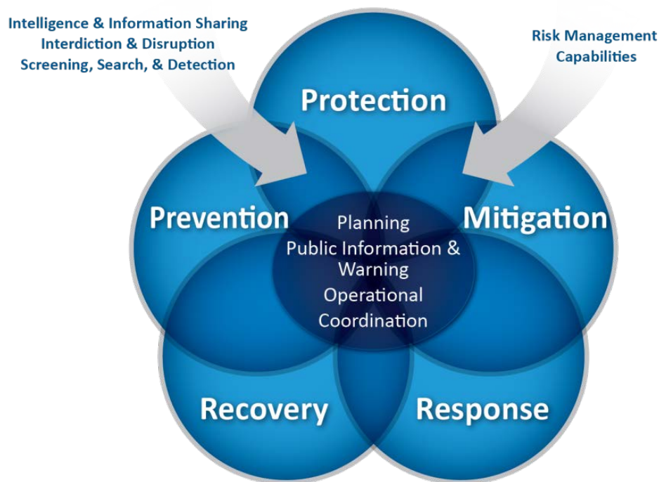
Figure 1: Protection and Integrated Core Capabilities

Collectively, the core capabilities for the Protection mission area provide the foundation for achieving the overarching critical objective for Protection: a homeland that is protected from terrorism and other hazards in a manner that allows American interests, aspirations, and way of life