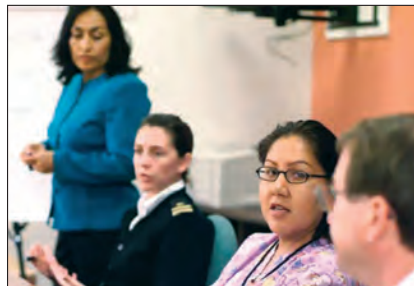
Indian Health Service staff