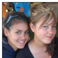
Sechelt (British Columbia) adolescents

Three behavioral factors commonly associated with overweight among children are: long hours of television viewing and other screen time, consuming sweetened drinks (such as sodas), and consuming fast food. The role of parents and caregivers is particularly important in helping children establish a lifestyle that includes healthful eating habits and regular physical activity. Parents need to encourage children to follow the “5-2-1-0” model to ensure a healthy weight: