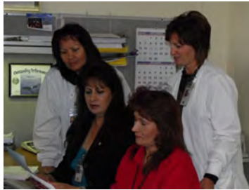
Medical nutrition therapy reimbursement team, IHS Turtle Mountain Comprehensive Healthcare Center