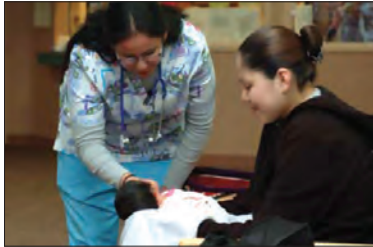
Post partum care