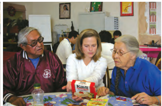
Top row: Prenatal care, IHS facility Second row, from left: IHS health care team; Postpartum care, IHS facility Third row, from left: Patient exam, Santa Fe IHS Hospital; Health care team, Wewoka Service Unit; Community nutrition lesson, Ohkay Owingeh Pueblo