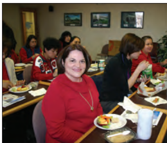
Healthy Heart worksite nutrition class