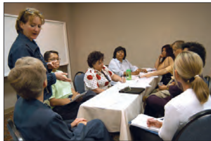
Diabetes regional meeting