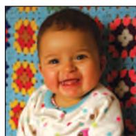
Sisseton-Wahpeton Oyate infant

Numerous studies appear to show a positive association between breastfeeding and lower rates of overweight among children. The protective effect appears to persist into older childhood. Research also indicates that the longer children have been breastfed, the less likely they are to become overweight. It is recommended that women breastfeed exclusively during the first 6 months and continue