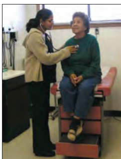
Patient exam, Santa Fe IHS Hospital