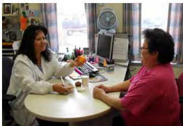
Medical nutrition therapy, IHS Turtle Mountain Comprehensive Healthcare Center