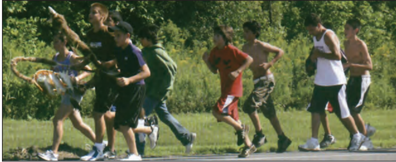
Six Nations Territory Unity Run

A recent analysis of CDC data on low-income, preschool-age children participating in federally funded health and nutrition programs showed that from 2003 through 2008 the rate of obesity remained stable among all groups except American Indian and Alaska Native children. In 2008, prevalence of obesity was highest among AI/AN (21.2 percent) and Hispanic (18.5 percent) children. Prevalence was lowest among non-Hispanic black (11.8 percent), Asian American and Pacific Islander (12.3 percent) and non-Hispanic white (12.6 percent) children. (Morbidity and Mortality Weekly Report, July 24, 2009, Vol. 58 (28), pp. 769–773)