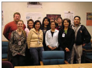
Northern Navajo Native Lifestyle Balance staff