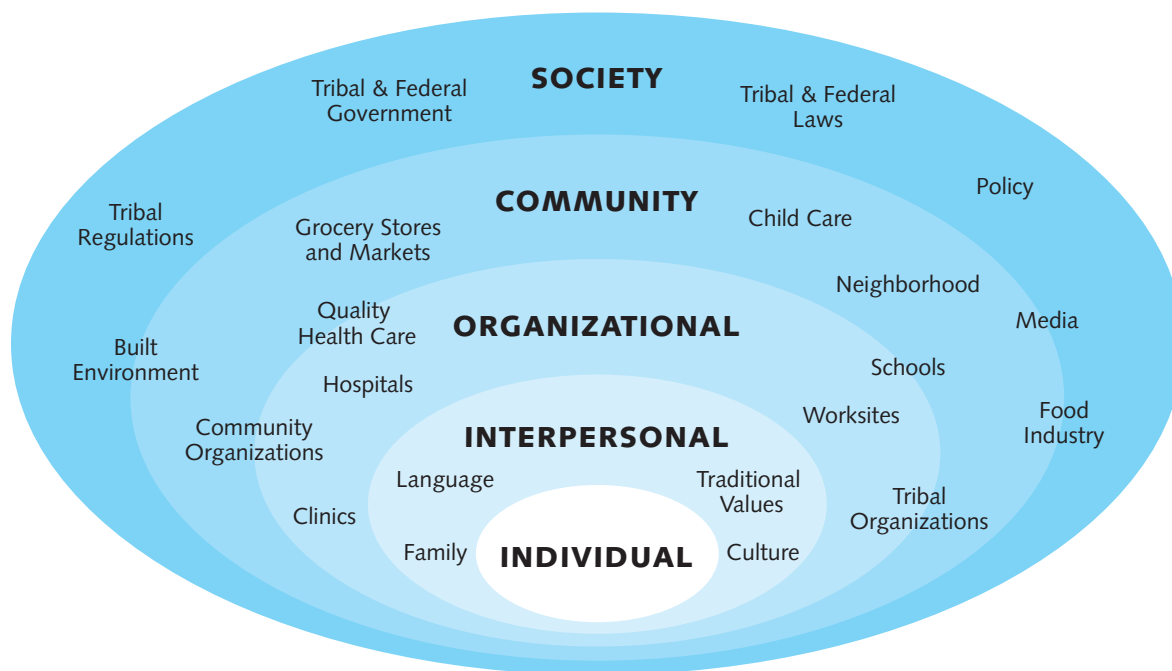
Figure 1. Harmony and Balance in Life: Applying the Social-Ecological Model in AI/AN Communities

Adapted from: Diabetes Care, November 2008, Vol. 31 (11), page 2217.