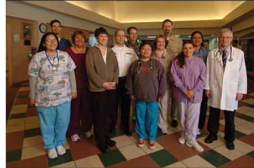
IHS health care team

Treatment of obesity and overweight is essential for preventing and treating diabetes, cardiovascular disease, and many other chronic conditions. These chronic diseases take a major toll on the lives of American Indians and Alaska Natives and divert essential funds from prevention and early intervention. Weight loss improves control of blood glucose, blood pressure, abnormal cholesterol and lipids; it reduces risk of morbidity and mortality, and it lowers medical costs. Health care system changes and reimbursement for services are needed to achieve comprehensive and effective primary health care services for healthy weight management.