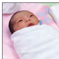
Indian health facility newborn

Since the risk for obesity begins as early as the perinatal period, taking action while the baby is in utero (in the womb) is essential. This means women must plan their pregnancies and prepare for them by starting off at a healthy weight. Women with diabetes must be in good glycemic (blood glucose) control before they conceive and throughout their pregnancy. The possibility of the pregnant mother’s food insecurity must be addressed to ensure healthy weight gain. These strategies, plus smoking cessation, can help to prevent low birth weight and high birth weight, key risk factors for obesity later on.