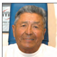
White Mountain Apache elder

Weight bias may marginalize children and youth who are considered to be obese by other youth and teachers and may place them at risk for teasing and bullying. Efforts need to address this bias and the impact of teasing and bullying on the mental health of children and youth. Weight-related stigma and obesity have been found to co-occur with depression, low self-esteem, and suicidal thought.