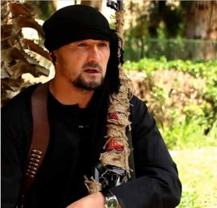
Colonel Gulmurod Khalimov of Tajikistan's OMON, pictured as an ISIL leader in Syria

prayer group will be aware of the activities of other members or the connection to Syria. 40 A significant number of these radicalized fighters, however, travel directly from Russian territory, which demonstrates a major radicalization factor for Central Asian states—the difficult working conditions and religious and ethnic persecution faced by the Central Asian diaspora within Russian territory. 41 Separated from their home communities, families, and local imams, and with little or no support from their home governments, it is