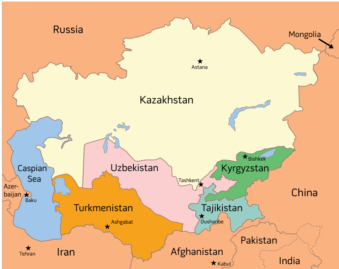
The Five Central Asian States

and civil and religious liberties? If, on the other hand, the United States does press Central Asian countries for reform in these areas by denying or conditioning security assistance, will Russia simply fill the gap, damaging and perhaps removing U.S. influence in the region?