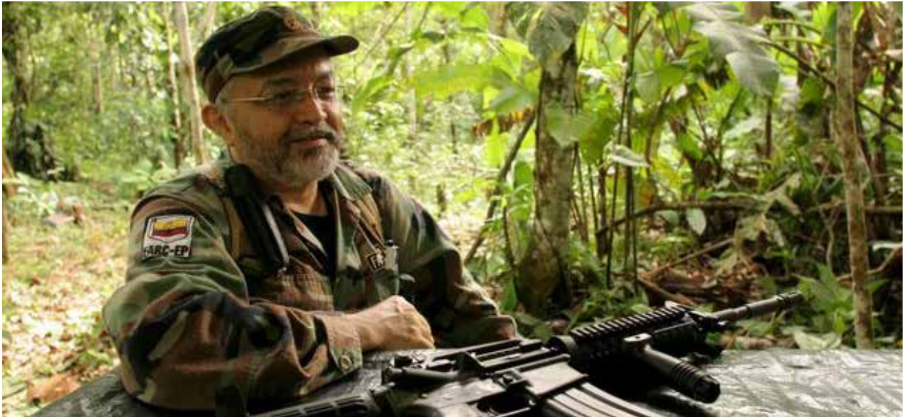
Figure 4. The death of Raul Reyes in 2008, seen here in his jungle hideout, marked the first death of a FARC Secretariat member at the hands of the Colombian military. The subsequent death of a number of other senior FARC guerillas, including longtime FARC Supreme Leader Manuel Marulanda (by heart attack), may have contributed to the group's decision to seek a peace accord with the Colombian government.

The government's military superiority and the FARC's weakness provide more promising expectations for peace than the last attempt at truce in 1999–2002. The FARC leadership may realize that the military advantage enjoyed by the post–Plan Colombia security forces—a professionalized military force equipped with modern weaponry and a newfound legitimacy that resulted from respect for human rights—will be tough to defeat. As of December 2012, the FARC has been reduced to about 9,000 fighters, less than half its peak. The FARC lost the relative political acceptance they may have had in the eyes of Colombians in the 1960s and 1970s as they fought against an elite and corrupt central government. 28 Now, aligned with narcotics traffickers and guilty of dozens of horrific massacres, the FARC alienated themselves from the common citizen in Colombia and lost the legitimacy that is so important in modern warfare. As one observer summarized, the FARC's unscrupulous tactics of cocaine trafficking, kidnapping civilians for ransom, and conscripting child soldiers have made it