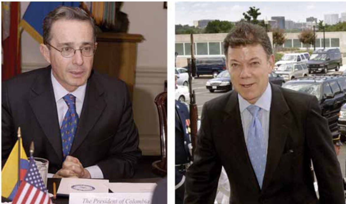
Figure 8. Colombian Presidents Álvaro Uribe (2002–2008) and Juan Manuel Santos (2008–present) disagree about the proper route toward peace with Colombian insurgent groups like the FARC.

Former President Uribe responded even more vociferously, calling the recent peace talk efforts a “slap in the face to democracy.” 59