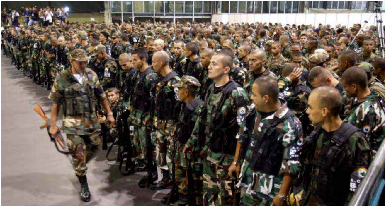
Figure 5. The demobilization of many members of the United Self-Defense Forces of Colombia (AUC) from 2003 to 2006 (such as this group from the Bloque Cacique Nutibara near Medellin in November 2003) removed a contentious obstacle to peace. However, DDR (demobilization, disarmament, and reintegration) programs in Colombia have had (to date) only limited success.

very powerful incentive for them to renounce violence, lay down their arms, and join the peace effort. 38