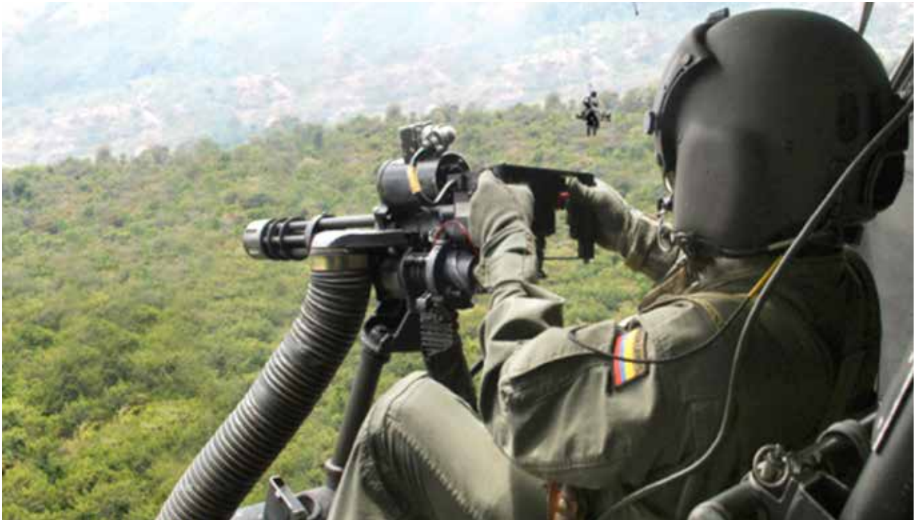
Figure 3. U.S. military assistance through the $8 billion aid package known as Plan Colombia provided important advantages to the Colombian military such as the rapid airlift capacity available provided by this Blackhawk helicopter. The Colombian Army soldier in the foreground is a member of the fast reaction force (called FUDRA in Spanish).

majority of which was directed to the Colombian police and military. 21