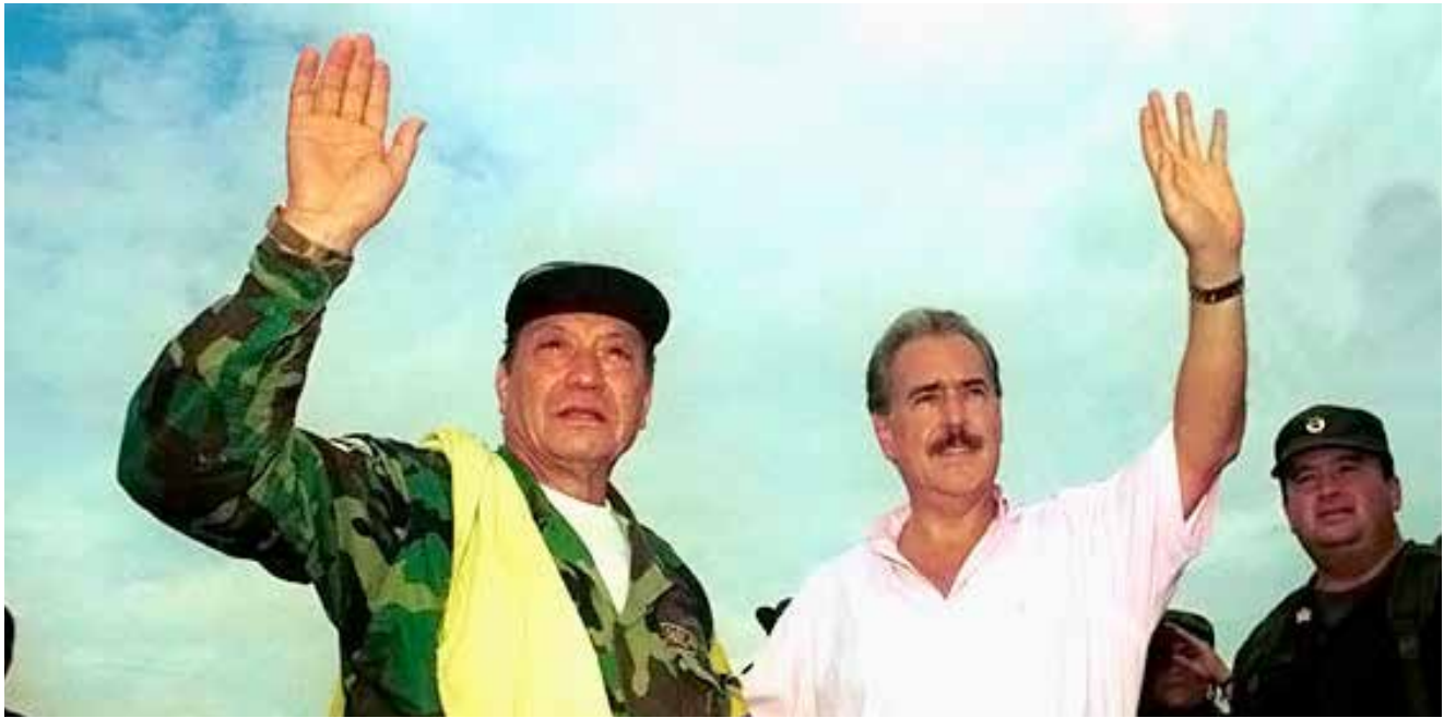
Figure 2. FARC Supreme Commander Manuel “Sure Shot” Marulanda and Colombian President Carlos Pastrana during peace talks in 1998. Pastrana made significant concessions to the FARC to entice them to negotiate a peaceful solution to the conflict, not the least of which was a demilitarized zone in southern Colombia in which no Colombian military units would operate. The peace talks collapsed as a result of ongoing guerilla attacks and mutual suspicions.

policymakers in Washington warned that the Colombian government was at risk of collapse. 20