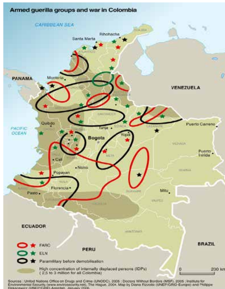
Figure 1. Area of Insurgent and Internally Displaced Persons (IDP) in Colombia in 2005–2006