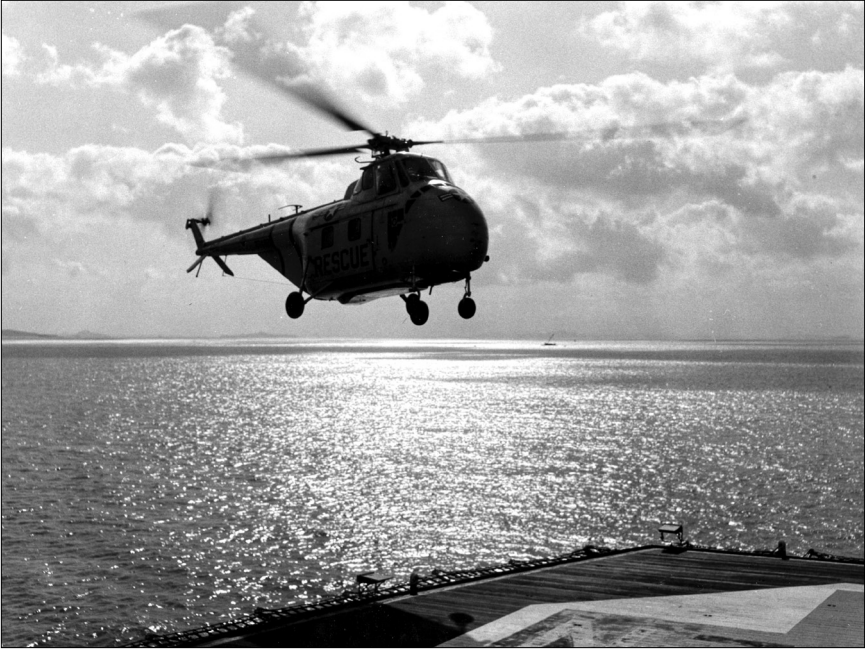
An H-19 helicopter from the 2157th ARS comes in for a landing on the deck of a naval hospital ship.

forty sorties, helicopters had been fired upon, resulting in two aircraft lost and two damaged. (Aircraft categorized as damaged were most likely those that required a time out of commission; lesser damage that allowed the aircraft to continue flying operationally was commonplace.) By the end of February 1952, two new H-19As had arrived, and four more came in March, boosting Detachment 1's H-19 strength to eight aircraft, the highest number of ARSvc H-19s available in Korea at any time during the war.