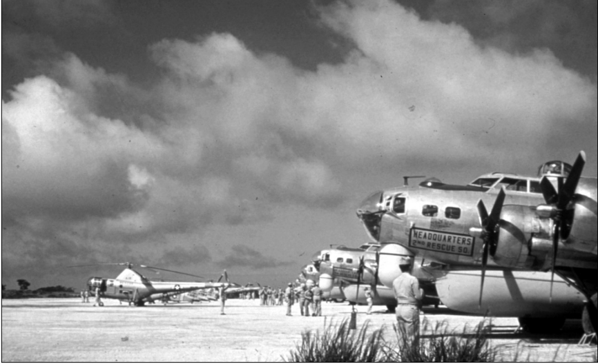
Aircraft of the 2d ARS are lined up during an inspection at Clark AFB in the Philippines.

duties. The Navy joined the Marine Corps, however, in operating the HO3S-1 rotary-wing aircraft over Korea and the surrounding waters, and this served as the primary vehicle used to recover downed naval aviators. Since naval aircraft normally went down relatively close to a carrier, short-range helicopters were sufficient for the Navy's rescue needs. The 3d ARS used its H-5 and H-19 helicopters mainly for aircrew rescue over land rather than using them for water pickups.*