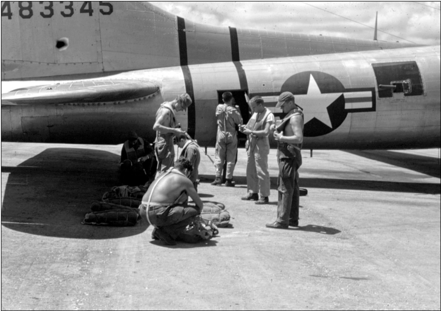
ARSvc personnel preparing to embark on a B-17 search mission during the Korean War.

hovering above the jungle and pulling up a downed pilot on its hoist, while propeller-driven A-1E fighters circled the helicopter and laid down protective firepower, became widely recognized. As in Korea from 1950 to 1953, in Southeast Asia daring helicopter rescues comprised both a powerful and highly favorable element of the American understanding and collective memory of an otherwise unpopular war.