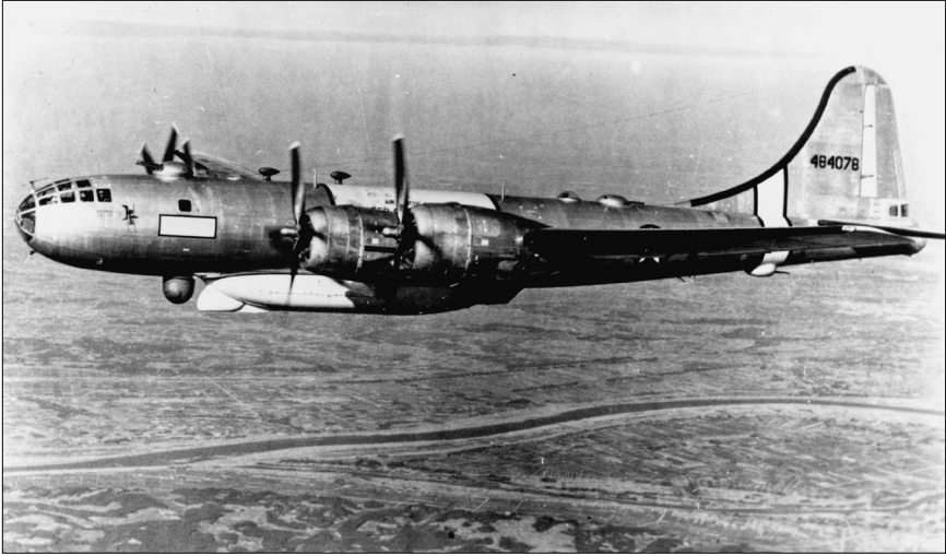
The SB-29 also carried a sizable lifeboat.

The problem was that one end of the parachute bag remained open, which allowed rainwater to enter. On one mission, when the SB-29 dropped its lifeboat, the wet parachute failed to open because it had frozen solid at high altitude. Based on the Air Material Command's assessment that water entered the A-3 boat only when the aircraft was on the ground, not during flight, in March 1951 3d ARS revised its procedures to permit securing the lifeboat to the belly of the SB-29 just before takeoff. At the end of a mission, the boat would be detached and stored until the next flight, thus eliminating all possibility that the boat would take on rainwater while on the ground.