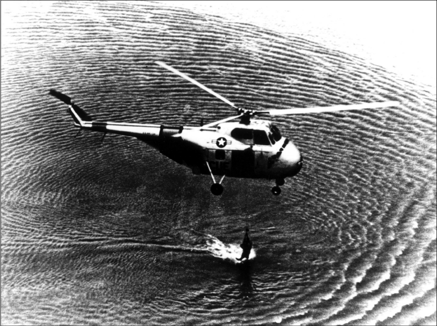
A 3d ARG H-19 hoists a downed airman to safety.

ed more than 300 individuals during three years of war in Korea. Perhaps equally important, the capabilities of the amphibians and the men who flew them boosted the morale of combat pilots and aircrews who well understood that if they went down over water for any reason, every effort would be made to bring them home. As the Commander, Marine Fighter Squadron 212, stated after the rescue of one of his pilots in early 1951,