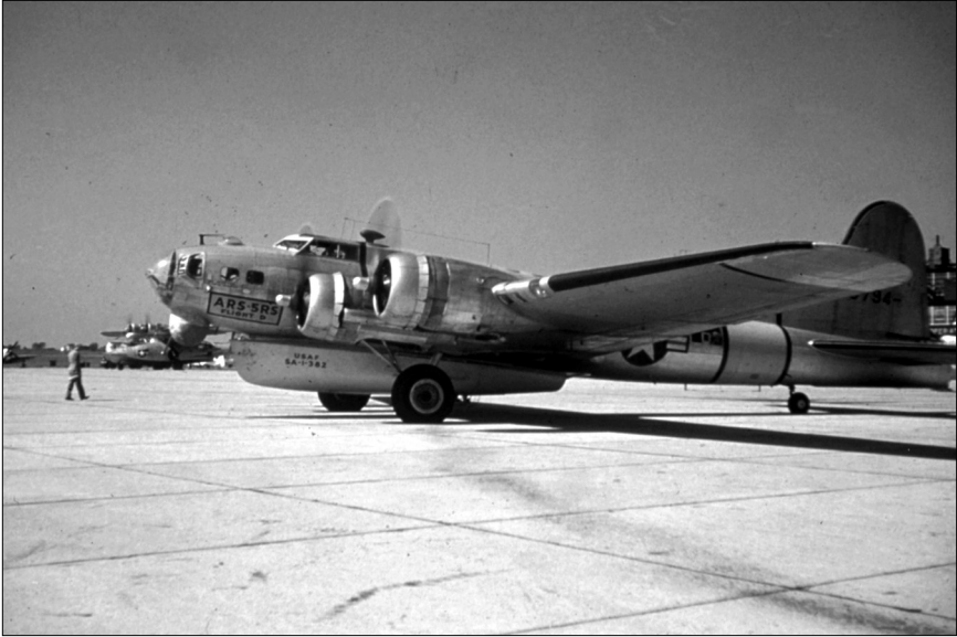
A lifeboat can be seen fitted to the underside of this SB-17G.

navigator, one radar operator, one flight engineer/top turret gunner, one radio operator, two waist scanner/gunners, and one tail scanner/gunner.