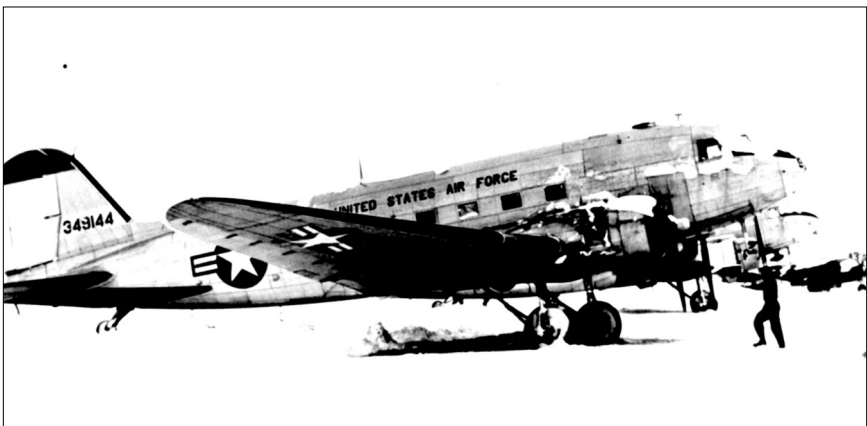
A rescue version of the Douglas C-47 provided myriad services for the ARSvc.

In April 1951, Detachment F's SC-47 flew seventy-one sorties, an unusually high number due in part to the diversion of other detachment aircraft to classified sorties. That month, the SC-47's work included providing escort for a distressed fighter; overwater escort for liaison aircraft and for a helicopter