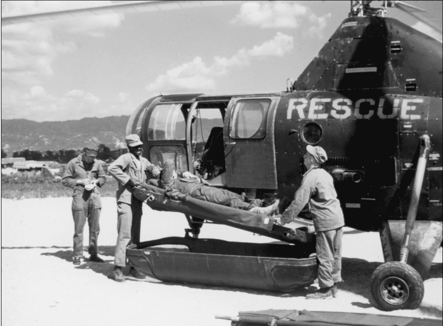
Rescue personnel load an injured servicemember into the H-5 helicopter's outboard capsule before transferring him to a medical facility.

The soldier we were to pick up was so critically wounded and in such a state of shock that the medic who accompanied me gave him little chance for survival. At any rate, we placed him in the H-5's outside capsule, and the medic started to give him plasma. Time meant everything for the wounded kid—and I might mention it was about 20 degrees below zero at the time. I had the engine going and was ready to take off. The medic ran his blood tube up through the top half of the capsule and knelt on the floor of the helicopter, holding the blood container outside of the ship, so the kid inside the capsule would get it en route. Just how that medical man stood the freezing flight I will never know. There he was, leaning out of the ship and holding that blood in his hand. When we finally got back to the aid station his hands were frozen. But so far as I know he saved the wounded boy's life.