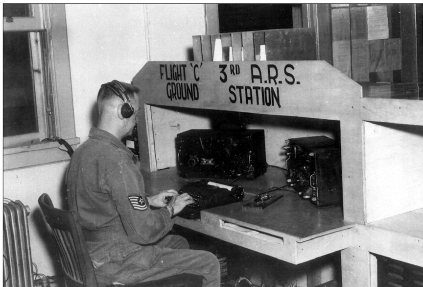
A sergeant transmits information to the rescue aircraft assigned to the 3d ARS's Flight C.

helicopter into enemy territory during the war, flying to within twenty-six miles of the Chinese city of Antung. Before dawn on March 27, 1953, a 3d ARS SA-16 escorted the H-19 from Cho-do to the vicinity of Ch'olsan, North Korea. While the SA-16 orbited offshore at low altitude, the H-19 searched for a downed British exchange pilot. The amphibian then escorted the helicopter back to Cho-do. Unfortunately, the pilot was not found; likely it was RAF Sqdn. Ldr. Graham S. Hulse who had been downed two weeks earlier after he and another F-86 pilot shared the credit for destroying a MiG in aerial combat. FAF intelligence had probably made contact with Hulse or with friendly guerrillas in his vicinity. As retired Maj. Robert F. Sullivan, the H-19 copilot, recalled, if "things had gotten hairy, we could've gone down in the weeds and probably escaped, but the SA-16 would have been extremely vulnerable to any enemy aircraft looking for a kill." Indeed, things had gotten hairy; the H-19 crew had unknowingly flown into an area of enemy troop concentrations and received intense ground fire.