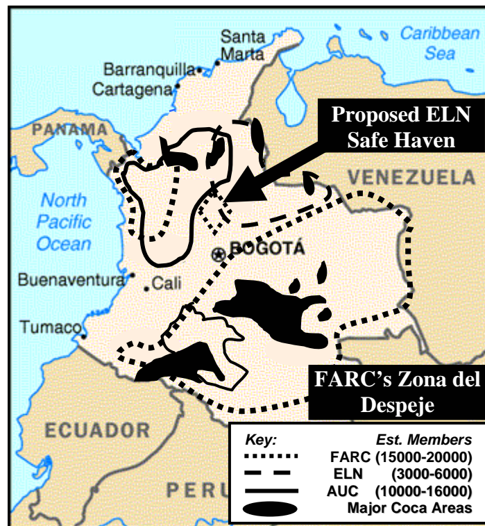
Figure 1. Areas of Greatest Enemy Activity in 2001 1