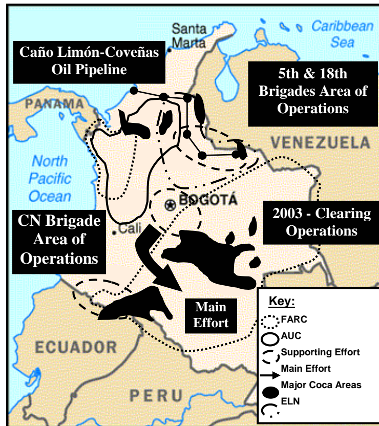
Figure 3. Plan Patriota 51

Meanwhile, in Arauca, the U.S. training of the Colombian 5th Mobile and 18th Infantry Brigades showed dramatic results defending the Caño Limon Oil Pipeline (see Figure 3). Primarily the ELN, but also the FARC, attacked the pipeline a record 170 times in 2001, shutting-down oil-flow all year, with the spills causing an environmental nightmare. Fortunately, throughout 2003, the narco-terrorists were under pressure and only able to muster "...below two dozen..." attacks. 50