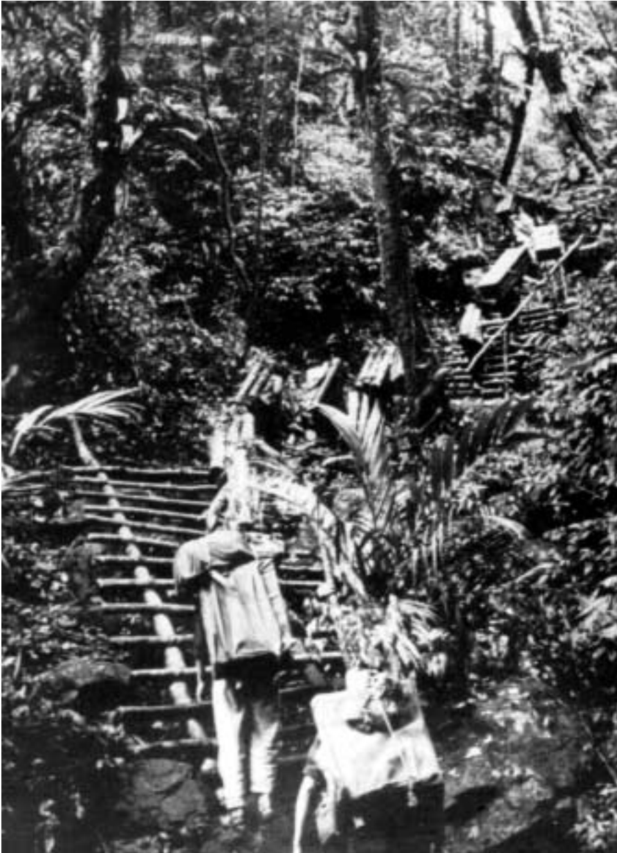
Porters Transporting Supplies

Porters are seen carrying supplies along one of the jungle footpaths that made up the Ho Chi Minh Trail.