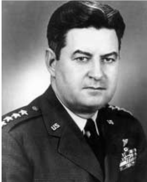
Gen Curtis E. LeMay

General LeMay became chief of staff of the USAF in the early 1960s during America's initial involvement in Southeast Asia.