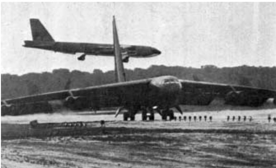
B-52D and B-52G

Arguably, the most significant B-52s in Vietnam were the D models. The Seattle plant built 101 Ds and the Wichita plant 69, the first flying on 4 June 1956. With US involvement in Vietnam growing by 1965, USAF officials initiated the $16-million "Hi-Density" or "Big Belly" modification program, which re-configured Ds and provided the United States with the first bomber able to carry out massive strategic missions over the North, even though this would not occur for nearly seven years.