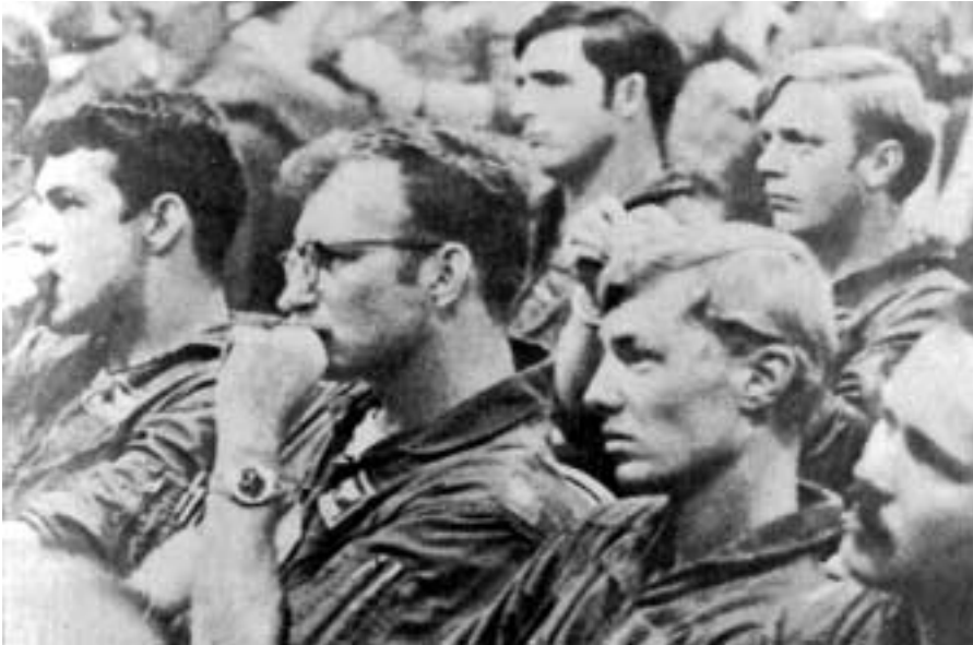
Crew Members in Linebacker II

B-52 crew members during a briefing early in Linebacker II