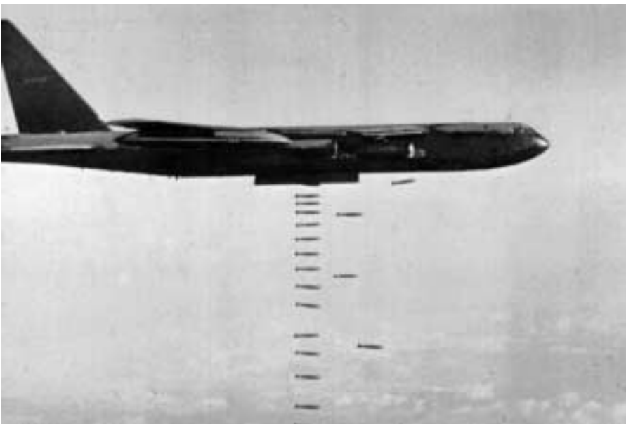
B-52D Dropping a Load on the Enemy

These definitions and their core components are not completely new. Following World War I, two airpower prophets—Douhet and Mitchell—wrote and spoke extensively on how airplanes should be used in war and how they would become the new primary military weapon. Douhet in The Command of the Air and Mitchell in Winged Defense and Our Air Force called on their nations to develop separate military air services and build vast armadas of bombers and fighters designed to take the war beyond the battlefield to the enemy's heartland. These theories—born out of a desire to avoid a repeat of the bloody and costly trench and ground combat of World War I—hypothesized