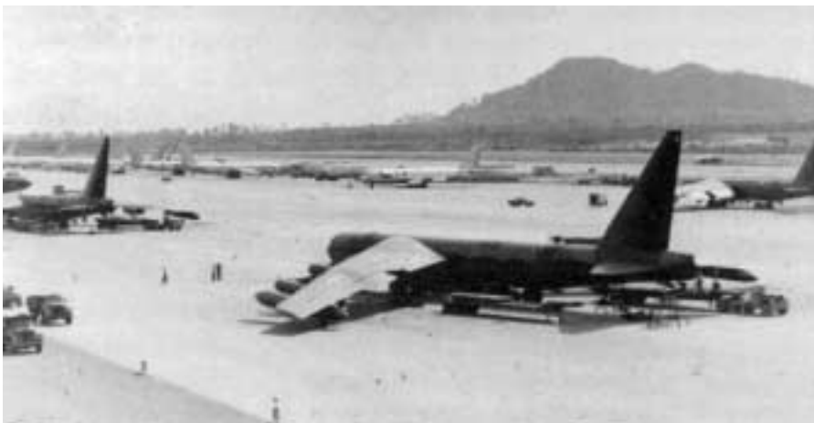
B-52Ds at U Tapao Royal Thai Air Base, Thailand

The USAF selected the Ds for modification for several important reasons. There were only 82 Fs, and they were running out of flying time. The Fs had no reserve capability and could barely fly the ever-increasing monthly sortie requirements of