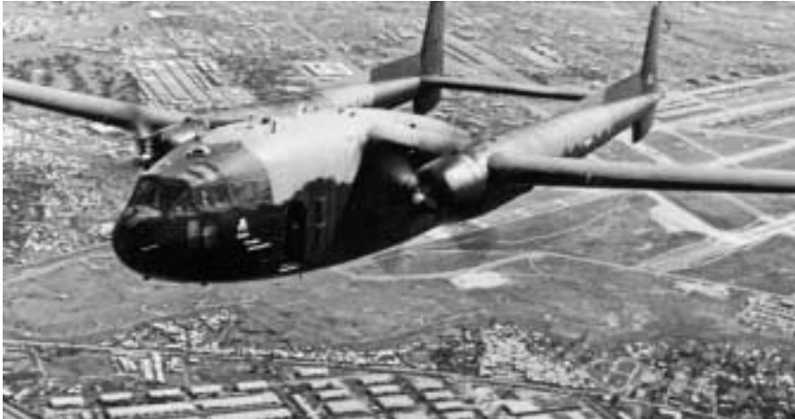
AC-119G over Tan Son Nhut Air Base, RVN

The gunship was a key weapon used to stop enemy infiltration along the Ho Chi Minh Trail.