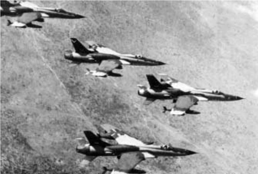
F-105 Thunderchiefs over Thailand

Thuds—such as these flying over Thailand—were used to bomb enemy bridges in the North and troop concentrations in the South during Rolling Thunder 1965–68. One specialized version was developed for defense suppression.