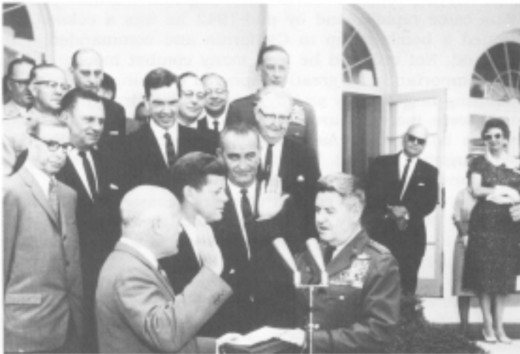
Swearing-in ceremony for General LeMay as chief of staff of the Air Force

As vice chief of staff of the Air Force from 1957 until 1961, he was able to direct the missile and military space program. General LeMay concluded his military career as the chief of staff of the