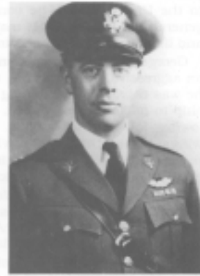
Capt George C. Kenney

Canadian-born George Churchill "Little George" Kenney (1889-1977) studied civil engineering at the Massachusetts Institute of Technology for three years before leaving to take a job with a Canadian railroad. In four years he was president of an engineering company.