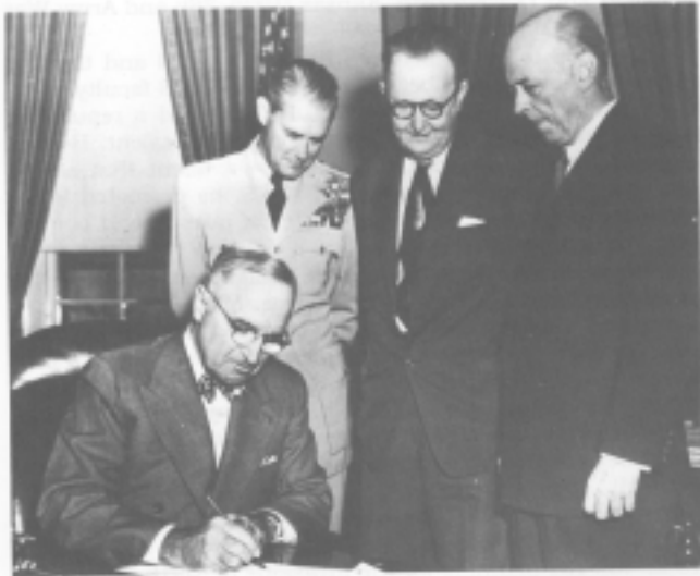
Gen Hoyt S. Vandenberg witnesses President Harry S Truman sign into law the bill creating the Departments of Defense and Air Force.

General Marshall selected Vandenberg to command the Ninth Air Force-with some 400,000 men, the largest Air Force during the war. He directed air support for Gen Omar Bradley and Gen George Patton in the drive across Europe. In 19 months, the Ninth flew almost 400,000 missions, lost fewer than 3,000 planes, and destroyed 4,000 German planes in the air and on the ground (plus an unconfirmed 3,000 more enemy aircraft). On Eisenhower's recommendation, Vandenberg was promoted to lieutenant general.