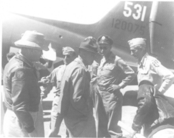
General Chennault (front left) greets General Stilwell (front center) at Kweilin Airbase, China, 15 November 1944.

Appropriately, the street that is home to ACTS's descendants the Air Force's professional military education schools at Maxwell Air Force Base, Alabama-is named Chennault Circle.