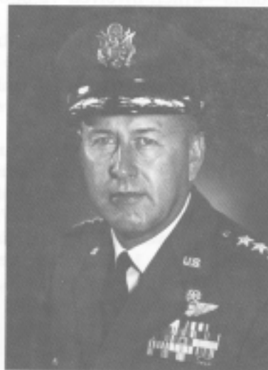
Gen Thomas S. Power

He then administered the Civilian Conservation Corps in New Hampshire. In 1934 he flew the airmail when the task was temporarily assigned to the Air Corps. From 1935 until 1938 Captain Power flew with a bomb squadron in the Philip- pines. In 1940 he completed the Air Corps Tactical School at Maxwell Field.