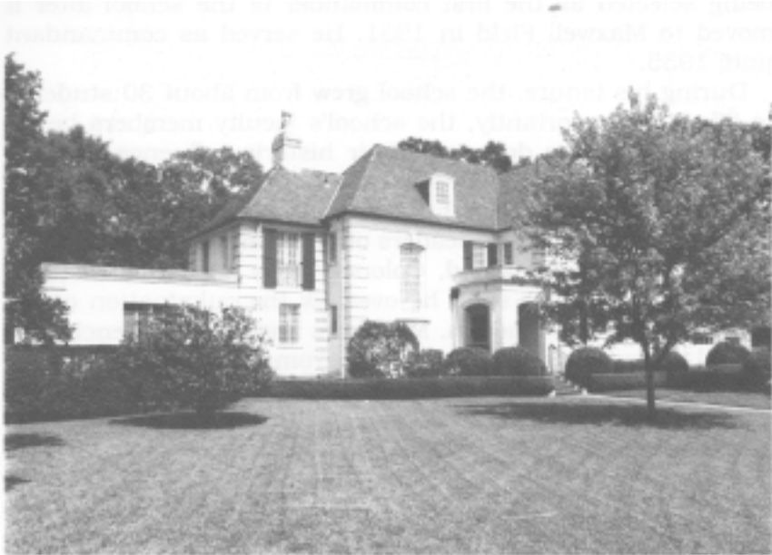
Curry House at Maxwell AFB