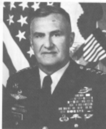
Gen Henry Shelton, chairman, Joint Chiefs of Staff

He served two tours in Vietnam: from 1966-67 as a Green Beret or Special Forces platoon leader and 1969-70 as an intelligence and operations officer.