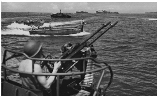
From a "PT": This scene is from one of our PT boats. In the foreground is an aerial gunner, and transports and landing craft, loaded with Marines and supplies, are in the background at Empress Augusta Bay, Bougainville Island (Headquarters No. 65,267, U.S. Marine Corps).