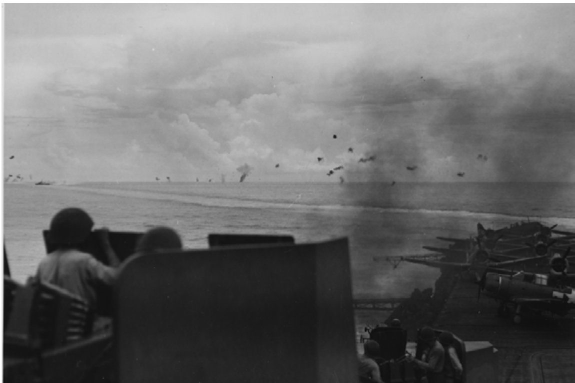
Japanese air attack on the USS Essex and task force during raid on Rabaul, New Britain. A withering blanket of anti-aircraft fire meets the Japanese planes (11 November 1943).