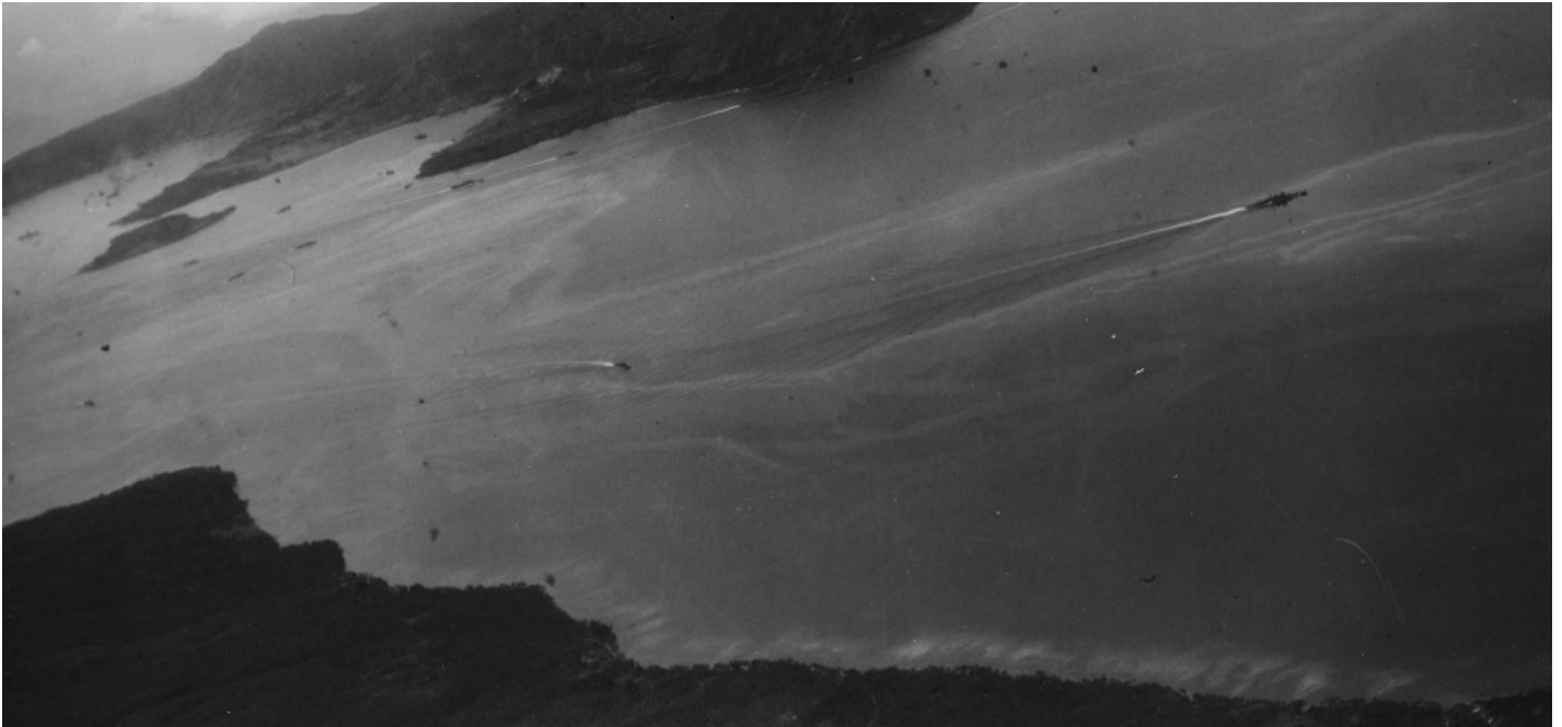
U.S. aerial raid on Rabaul. Pictures taken by a plane from the USS Saratoga (CV 3) showing ships in harbor maneuvering under attack. Alt. var. F.L. 10", time 1120. Raid made by Air Group 12 (USS Saratoga) and Air Group 23 (USS Princeton—CVL 23) (Bu Aer 89105, 5 November 1943).