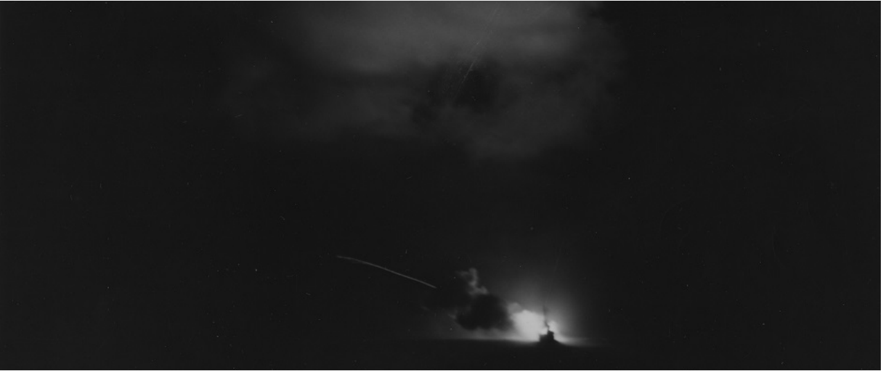
Star shells illuminating the night during the surface battle off the west coast of Bougainville, Solomon Islands. As seen from the USS Columbia (CL 56) (BuAer 203232, 2 November 1943).