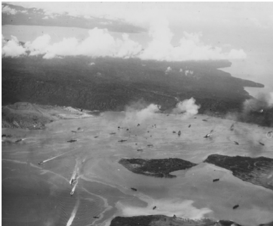
U.S. aerial raid on Rabaul. Pictures taken by a plane from the USS Saratoga (CV 3) showing ships in harbor maneuvering under attack. Alt. var. F.L. 10", time 1120. Raid made by Air Group 12 (USS Saratoga) and Air Group 23 (USS Princeton—CVL23) (Bu Aer 89105, 5 November 1943).