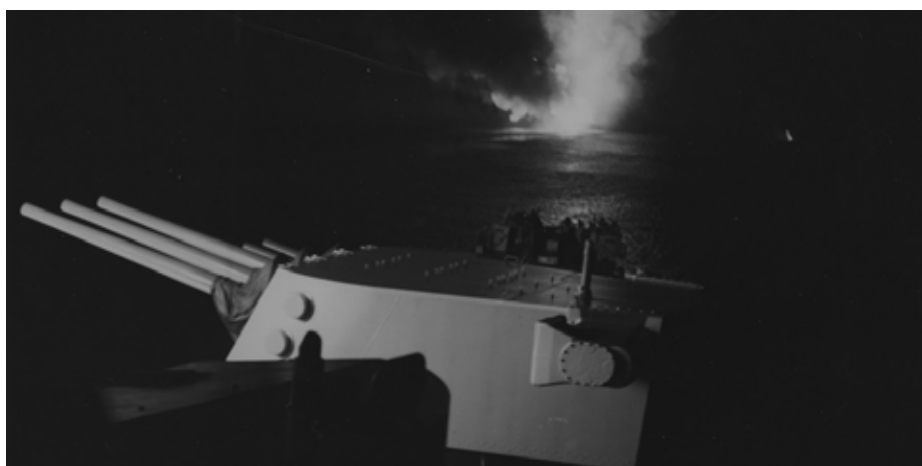
Night bombardment of the Buka airfield, Buka Island, Solomon Islands, by a U.S. task force, Taken aboard the USS Columbia (CL 56) (BuAer 203223, 1 November 1943).