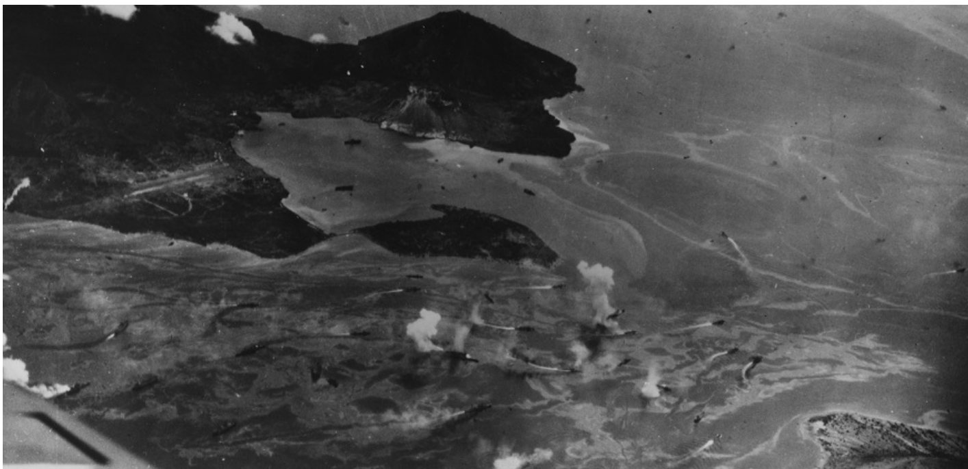
U.S. aerial raid on Rabaul. Pictures taken by a plane from the USS Saratoga (CV 3) showing ships in harbor maneuvering under attack. Alt. car. F.L. 10", time 1120. Air Group 12 (USS Saratoga) and Air Group 23 (USS Princeton—CVL 23) (Bu Aer 89096, 5 November 1943).