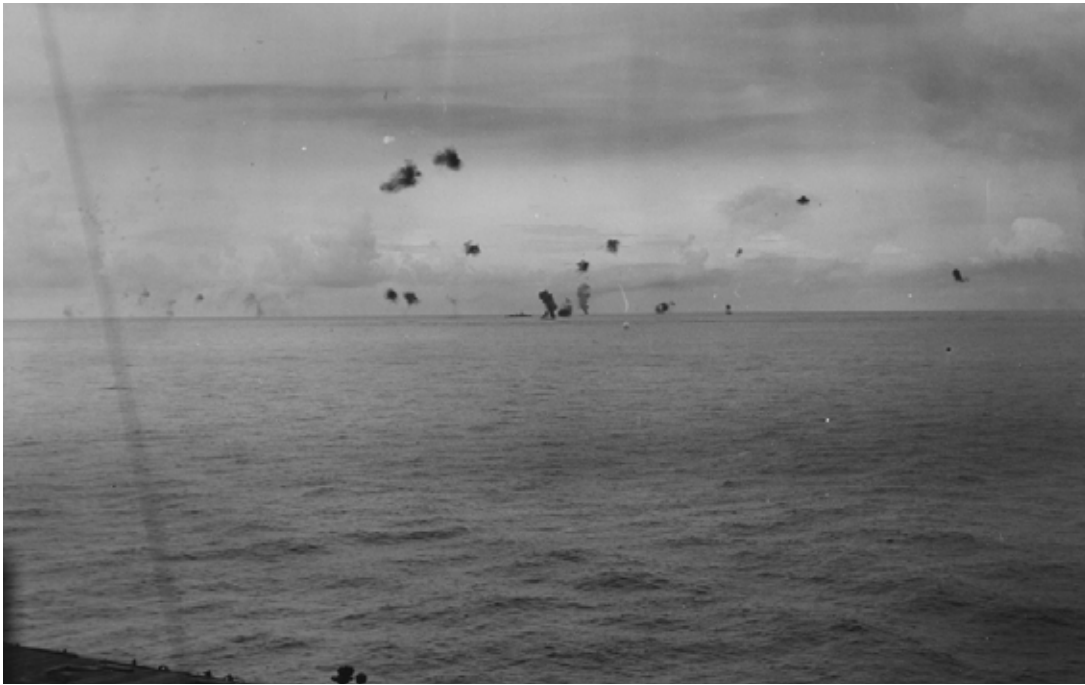
Japanese air attack on the USS Essex and task force during raid on Rabaul, New Britain (Bu Aer 206610, 11 November 1943).