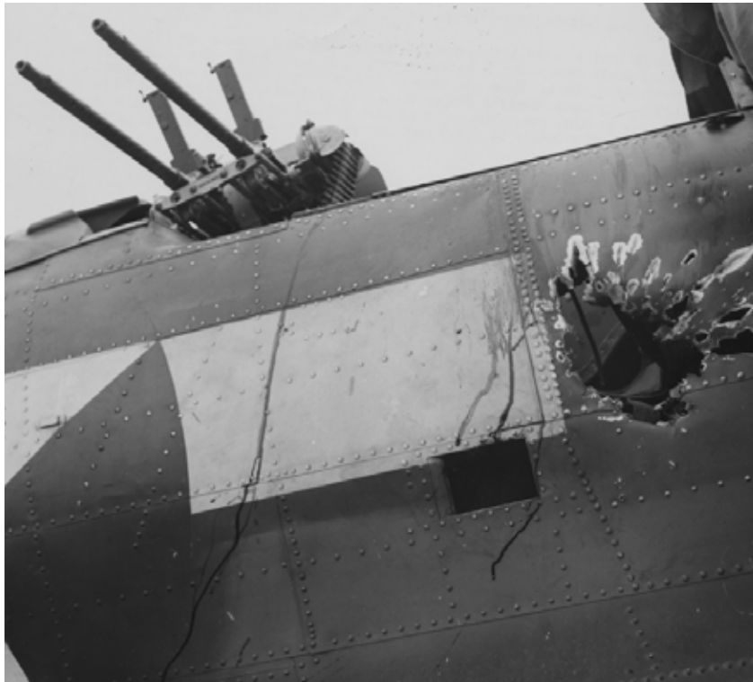
This hole cost a man's life: The gunner in this Navy bomber was killed by a 20 mm. shell from a Japanese Zero during the U.S. Navy task force raid on Rabaul on 5 November 1943. Upon the plane's return to the aircraft carrier USS Saratoga, the dead gunner's finger was still clasped on the trigger of his .50 caliber machine gun. The Saratoga also participated in the second Navy raid on Rabaul on 11 November 1943 and saw action in the bloody taking of Tarawa (W-SAC-PA-5-44094-TR-7181, 16 December 1943).