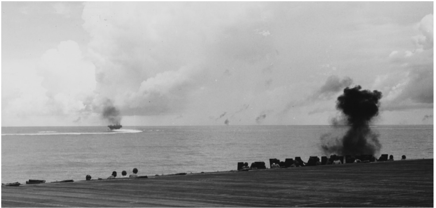
Japanese air attack on the USS Essex and task force during raid on Rabaul, New Britain. A pillar of smoke marks the watery grave of a Japanese Zero, shot down along with 68 other enemy planes (Bu Aer 206616, 11 November 1943).