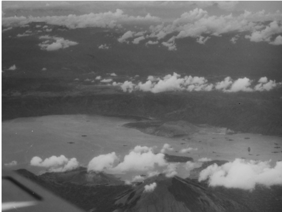
U.S. aerial raid on Rabaul, New Britain by Air Group 12 USS Saratoga (CV 3) and Air Group 23, USS Princeton (CVL 23). Alt. var.; F.L. 10", time 1120 (Bu Aer 204662, 5 November 1943).