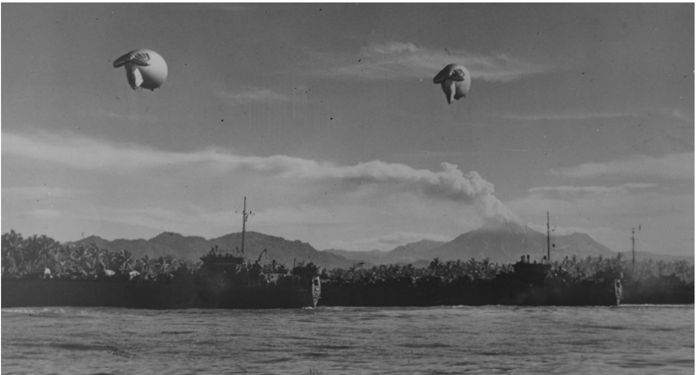
Landing operations at Bougainville in the Solomon Islands. A pair of barrage balloons float lazily in the air over several LST's unloading supplies for American forces that have been pushing the Japanese back into the jungle. The balloons protect the landing craft from low-level attacks by Japanese planes. Far in the distance, the smoking crater of Bagana, an active volcano, can be seen (Bu Aer 201995, 22 November 1943).