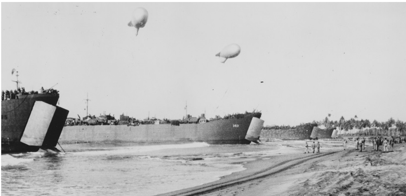
Putting men and supplies ashore at Empress Augusta Bay, Bougainville Island, to reinforce beachhead established 1 November 1943 by the Marines. General view of beach (Bu Aer 202486, 6 November 1943).