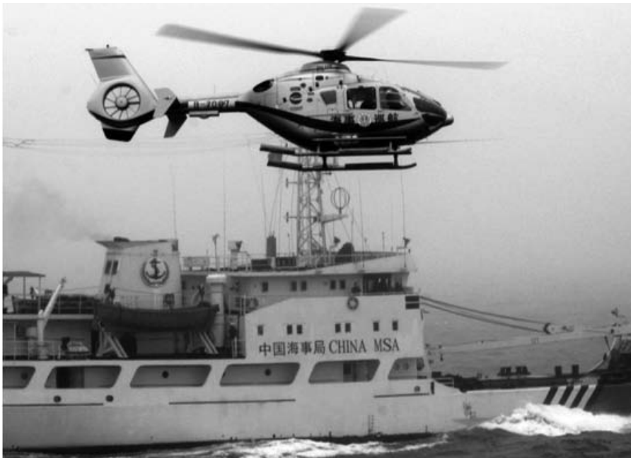
Photo 7. Search and rescue is a major mission of the MSA and aviation assets are now a development priority for MSA and Chinese civil maritime agencies more generally. However, deck aviation is still a relatively new concept for Chinese civil maritime authorities.

China's maritime rescue service has come a long way in a short time. In 1999, the MSA was faced with a Titanic -like tragedy when the ferry Dashun went down in bad weather just a few miles offshore in the Yellow Sea. Out of 304 passengers and crew, there were just twenty-two survivors. 55 The accident, a major national tragedy, helped to galvanize efforts to establish a much more vigorous maritime rescue service. As Captain Bernard