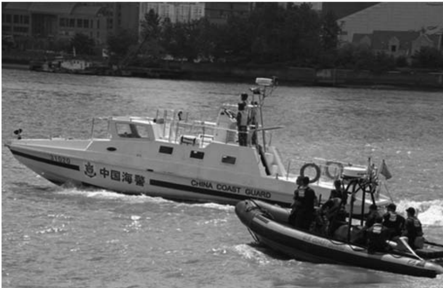
Photo 21. The crew from the U.S. Coast Guard Cutter Boutwell trains with the China Coast Guard in Shanghai during August 2007. Boutwell visited China as U.S. Coast Guard representatives for the North Pacific Coast Guard Forum. This forum was developed to increase international maritime safety and security in the North Pacific and has evolved to become the most developed international organization focused on maritime security in the vital East Asian region.

Search and rescue cooperation has been quite successful—an achievement that can be measured in lives saved. In 2007, the USCG's Amver reporting system, which assists in rescue coordination across the globe by exchanging data on participating vessels near ships in distress, proved crucial to major rescues of Chinese sailors on two occasions. In March, Unicorn Ace , with a crew of nineteen Chinese citizens, sank in the South China Sea. The Hong Kong Rescue Service, querying the USCG Amver system, identified and vectored in a nearby freighter, which rescued eleven of the crew. Even more dramatically, in July the vessel Haitong 7 , crewed by twenty-