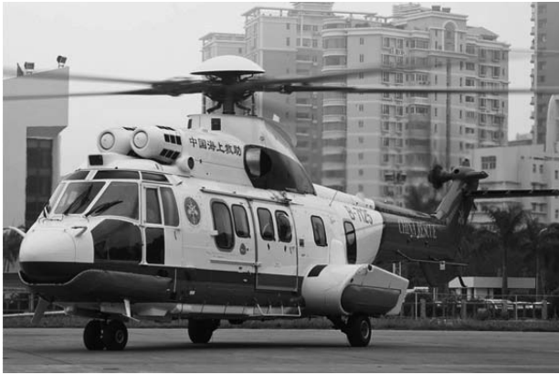
Photo 17. China Rescue and Salvage Bureau of the MSA accepted two Eurocopter EC225s into service in 2007. Further development of aviation forces by China's civil maritime agencies appears to be a priority.

This study has given priority to offering an objective and detailed rendering of the current statuses of various Chinese coast guard entities, primarily because no such rendering yet exists in the English language. Still, it is important to lay a foundation for explaining the central phenomenon at issue: China's relative weakness in coast guard capacities. Three related explanations are examined below: modernization processes, economic issues, and finally, institutional structural issues. No doubt these differ-