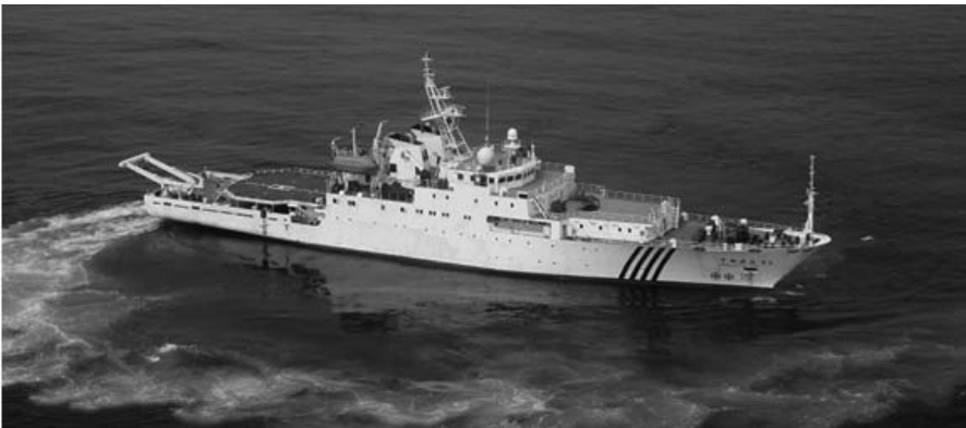
Photo 12. Haijian 83 is the largest and most advanced cutter of the CMS. The launch of several new cutters for the CMS over the last decade suggests that the CMS has a certain priority among China's maritime enforcement agencies.

largest cutter, at ninety-eight meters; this 3,400-ton vessel, built at Jiangnan shipyard, is said to have cost about US$22 million and is assigned a helicopter. 97