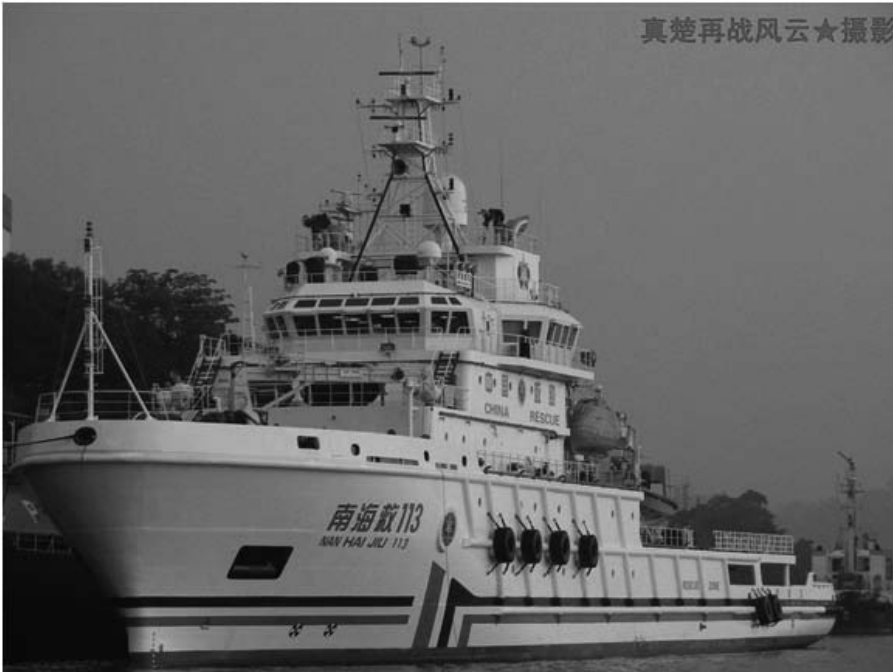
Photo 24. Nanhai Jiu 113 of the Rescue and Salvage Bureau of the MSA will serve off the coast of southern China and is one of several new vessels that the MSA has developed in the last decade.

At least three possible strategic implications can be drawn from the foregoing analysis. Most obviously, stronger Chinese coast guard entities will no doubt serve to strengthen China's extensive maritime claims. More and better ships and aircraft at Beijing's disposal will likely increase its confidence in maritime disputes with its neighbors. As stated clearly in the Ningbo Academy study, China will continue to "build up its military maritime power, developing the power to safeguard its national territorial and maritime rights and interests." 139 Yet there is also the practical consideration that "relying on the navy . . . makes it easier for certain other countries to use the excuse of 'the China threat theory.'" 140