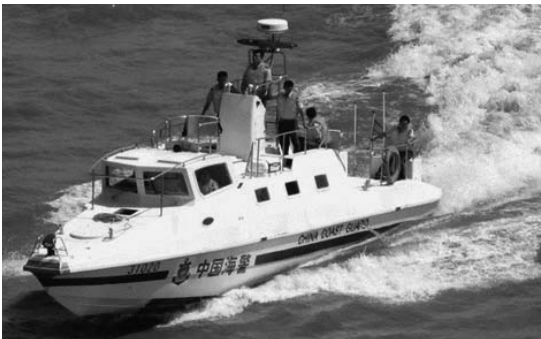
Photo 3. A small patrol boat in service with the China Coast Guard. Chinese civil maritime authorities have lacked for an adequate motor surfboat for rescue operations and have apparently considered purchases from abroad to fill this requirement.

advanced software to create a high degree of fidelity comparable to simulators in use in the West.