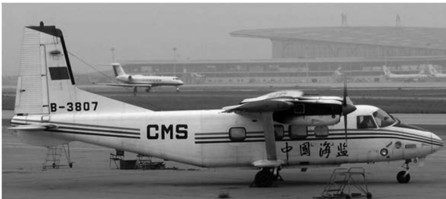
Photo 14. A Y-12 aircraft of the CMS. It seems China's civil maritime agencies are generally lacking in sufficient numbers of fixed-wing aircraft, inhibiting long-range search and rescue operations, for example. That the CMS operates fixed-wing aircraft is again symbolic of the priority that the CMS enjoys among the civil maritime authorities.

regular patrols of the southern part of the South China Sea in 2007. 102 In aggregate, the CMS reported, in the period 2001–2007, fifteen thousand instances of illegal activities were detected in China's EEZ, of which about ten thousand were apparently prosecuted. According to one 2006 report, the SOA is already closely collaborating with the China BCD in the Gulf of Tonkin (Beibu Wan) area and is looking to do so elsewhere as well. 103 SOA sources candidly describe close coordination with the Chinese military. 104 Indeed, during a public statement in October 2008, CMS deputy director Sun Shuxian declared that "the [CMS] force will be upgraded to a reserve unit under the navy, a move which will make it better armed during patrols. . . . [T]he current defensive strength of CMS is inadequate." 105 A similar message emerges from a September 2009 Chinese report that documented multiple interactions between the SOA and American surveillance vessels.