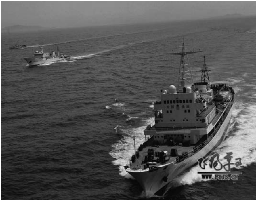
Photo 25. Fisheries Law Enforcement Command vessel 311 exercises with other FLEC vessels. FLEC 311 is China's largest fisheries management vessel and was dispatched to patrol the South China Sea when tensions arose in the area during mid-2009. It is expected that the FLEC will receive additional large cutters in the near future. FLEC 311 served formerly with the PLA Navy.

A third strategic implication may be even more important—that coast guards represent a distinctively different form of power than do navies. As explained by the authors of the Ningbo Academy study, “Naturally, in the course of the struggle for national interests, contradictions are inevitable. The real question is what means are used to settle these disputes. Giving full play to the government’s capabilities, deploying the navy cautiously and strenuously trying to limit the conflict’s scope to among the civil maritime authorities, can avoid a resort to escalation of the crisis.”