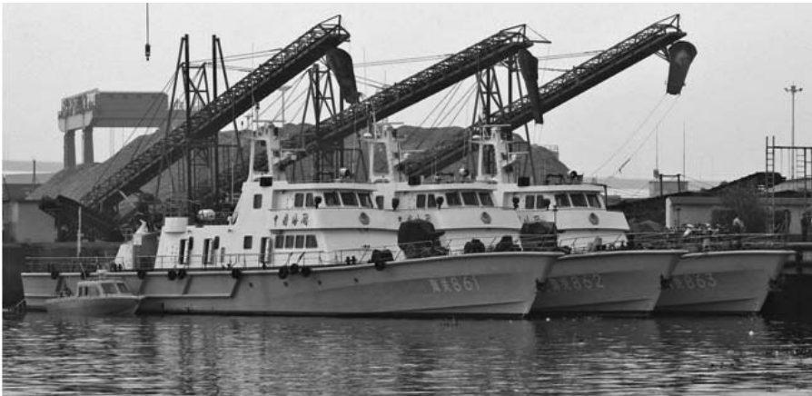
Photo 11. China's Customs Agency operates a fleet of small cutters that focuses on maritime anti-smuggling operations.

According to the China Customs 2007 annual report, the GAC represents “the competent antismuggling authority of the Chinese government, which takes up most, if not all, of the responsibility for combating smuggling.” 82 The significant smuggling cases prosecuted by the GAC in 2007 were reported to number 1,190, involving more than US$1 billion, up 4.3 percent from the previous year. Among these cases were some 356 major drug busts, which netted almost five hundred kilograms of assorted illegal drugs. 83 It is not clear what percentage of these interdiction activities occurred in the maritime sphere, but some preliminary evidence suggests that a portion of China's drug trade does take place in seaborne vessels. Thus a 2007 article in the journal of the Fujian Police Senior Academy Journal suggested, “In the last few years, criminals with drugs passing through the port of Xiamen's water transport routes have been using fishing vessels to smuggle drugs.” 84 Similar concerns about maritime drug enforcement have been noted