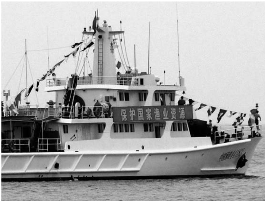
Photo 9. FLEC cutter 44183 on patrol. Compared to other maritime enforcement agencies the fisheries enforcement command has not received equivalent resources, at least to this point, and may also be significantly undermanned. The large poster on the ship reads, "Protect National Fisheries Resources." As for many countries, fisheries conservation efforts have proved to be an extremely challenging task for the Chinese government.

As have fisheries all over the globe, the Chinese fishing industry has been plagued in the last decade by the environmental devastation wrought by overfishing. While growth in aquaculture has mitigated this crisis to some extent, fishermen all along the Chinese coast have experienced a difficult transition. As one Chinese study recently opined, "The fact is obvious that the development of our nation's fishing industry has reached an extremely important juncture. Most—if not all—of the fisheries have been fully exploited, and many are already exhausted." 67 Another published study further reveals the scope of the problem. Since the 1960s, fish species in the Beibu Gulf area of the South China Sea have declined from 487 to 238. Stock density reached its lowest level in 1998, at just 16.7 percent of that of 1962; fish stocks have recovered somewhat since. 68