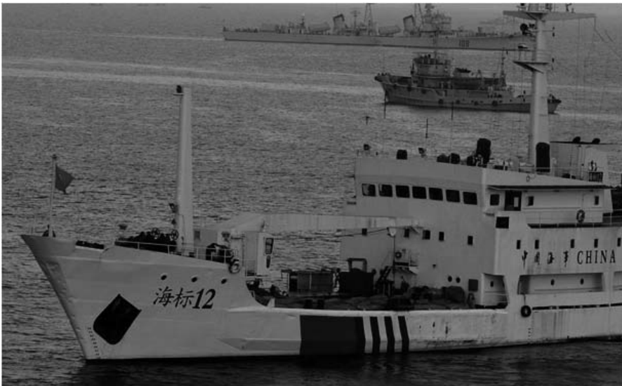
Photo 15. A buoy tender of the MSA operates in close proximity to two PLA Navy vessels. Maintaining aids to navigation along China's busy coasts is a major mission of the MSA.

Among coast guard-like entities, it is natural and proper to consider how roles and missions, not to mention resources, are allocated between coast guard forces, on the one hand, and navies, on the other. Sea-power theorist Geoffrey Till explains that although overlap is inevitable and logical, there is a spectrum of coast guard models, entailing different kinds of relationships with national navies. Till observes, "With the widening of the concept of security, accelerated perhaps by the events of 11 September, the extent