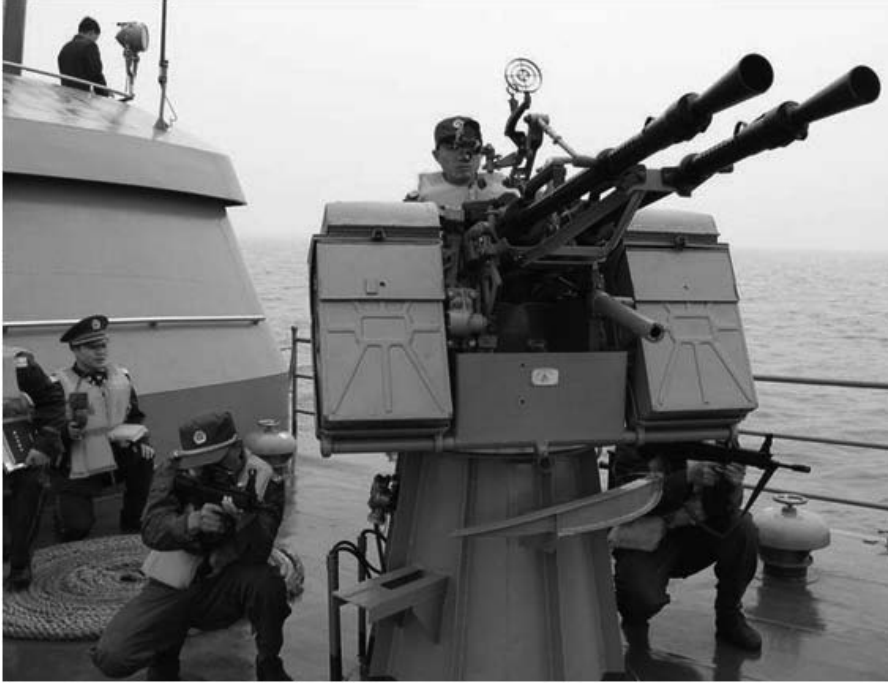
Photo 4. Ministry of Public Security forces on a China Coast Guard cutter participate in a drill. Most of China's other civil maritime agencies are unarmed. This has caused some consternation, for example, when Fisheries Law Enforcement Command vessels are lacking deterrence or enforcement capabilities.