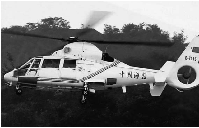
Photo 13. A helicopter operated by China Maritime Surveillance. This is a type Z-9 design that is used widely among China's armed forces.

According to another report, the SOA was directed by China's State Council to initiate patrols of the East China Sea in 2006. This elevated surveillance activity apparently involved daily patrols by four aircraft and six ships, operated by the SOA. 101 A 2009 report suggests that the CMS initiated