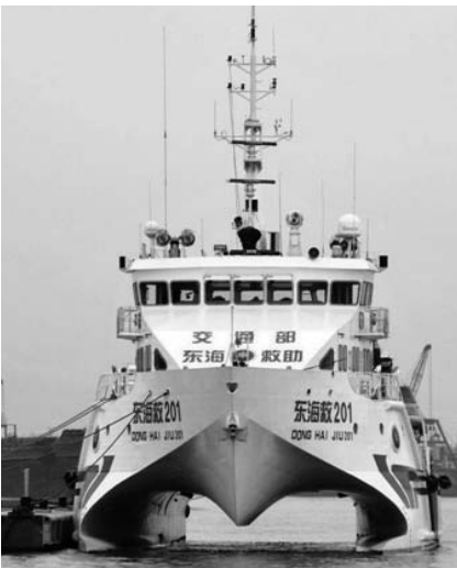
Photo 6. This catamaran, Donghai Jiu 201, serves with the Rescue and Salvage Bureau of the China Maritime Safety Administration. Catamarans are in wide use now as ferries and also with the PLA Navy.

commercial ferry designs. 48 The MSA has notably lacked small motor surfboats and may have recently purchased some from the United Kingdom. 49 However, attention to smaller cutters is evident in the 2008 launch at Wuhan of a new forty-meter design, optimized for Yangtze River rescue operations. 50