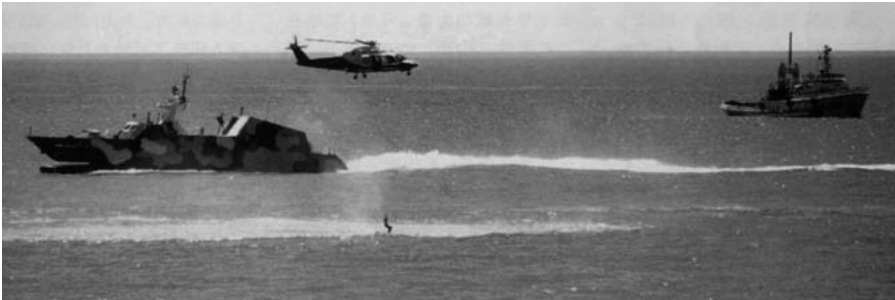
Photo 16. In July 2009, the first-ever major search and rescue exercise involving significant naval units and civil maritime entities (twenty-five vessels and thirteen agencies) reportedly took place in the Pearl River Delta of southern China.

publication describing the exercise notes that China has set up a new and robust search and rescue system but laments that the military regions are not well integrated into that structure—a problem suggesting the need for further such exercises. 118