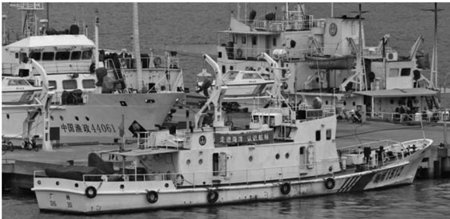
Photo 18. Two small cutters from the MSA (foreground and right), are shown berthed across from a cutter from the FLEC. There is some coordination among Chinese civil maritime authorities, but it is also clear that Chinese maritime analysts perceive some problems in getting the disparate agencies involved to work in concert to serve China’s maritime interests.

A final explanation has been a recurrent theme of this paper and is the central theme of the important Ningbo Academy study of 2007—that the balkanization of maritime enforcement entities in China has severely inhibited the coherent development of Chinese coast guard entities. 127 The dragons duplicate one another in certain functions, fail to