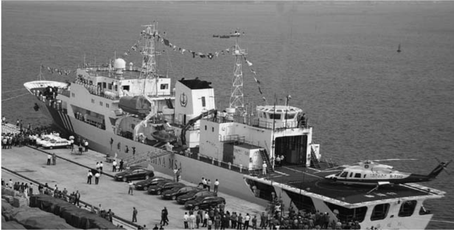
Photo 5. The large cutter Haixun 11 of the MSA was commissioned in September 2009 in Qingdao. In terms of resources and personnel, the MSA, which is part of the Transportation Ministry, appears to be the most influential among China's civil maritime agencies. (China Defense Forum)

continuous months on board, then one month ashore. Crew members are thus at sea about eight months per year. 47