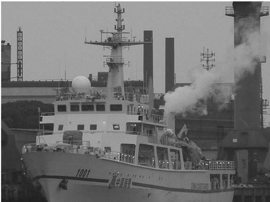
Photo 1. This 1,000-ton Type 718 cutter, Haijing 1001, serves with the China Coast Guard of the Ministry of Public Security. This ship, launched in 2006, has a single 37 mm deck gun. This is the China Coast Guard's most modern vessel. (China Defense Forum)

A current workhorse of the Maritime Police fleet is the Seal (海豹) HP1500-2, a high-speed patrol craft. These small vessels are capable of fifty-two knots, have a range of 250 km, and require a crew of six to eight personnel. Their intended missions include escort, on-the-water marine inspections, and search and rescue. The new standard small cutter for the Maritime Police is the Type 218. This design is forty-one meters in length; has a beam of 6.2 meters; displaces 130 tons; develops a top speed of twenty-nine knots; carries a crew of twenty-three; and mounts a single, 14.5 mm machine gun. A large Type 718 patrol cutter for the Maritime Police was apparently launched in 2006. It displaces 1,500 tons, and has a length of one hundred meters, a helicopter landing platform, and a 37 mm cannon. The Maritime Police also recently took possession of two older People's Liberation Army (PLA) Navy Jianghu frigates, after they had been overhauled and renamed Haijing (海警) 1002 and Haijing (海警) 1003. At this time, the Maritime Police has no aviation assets. 30