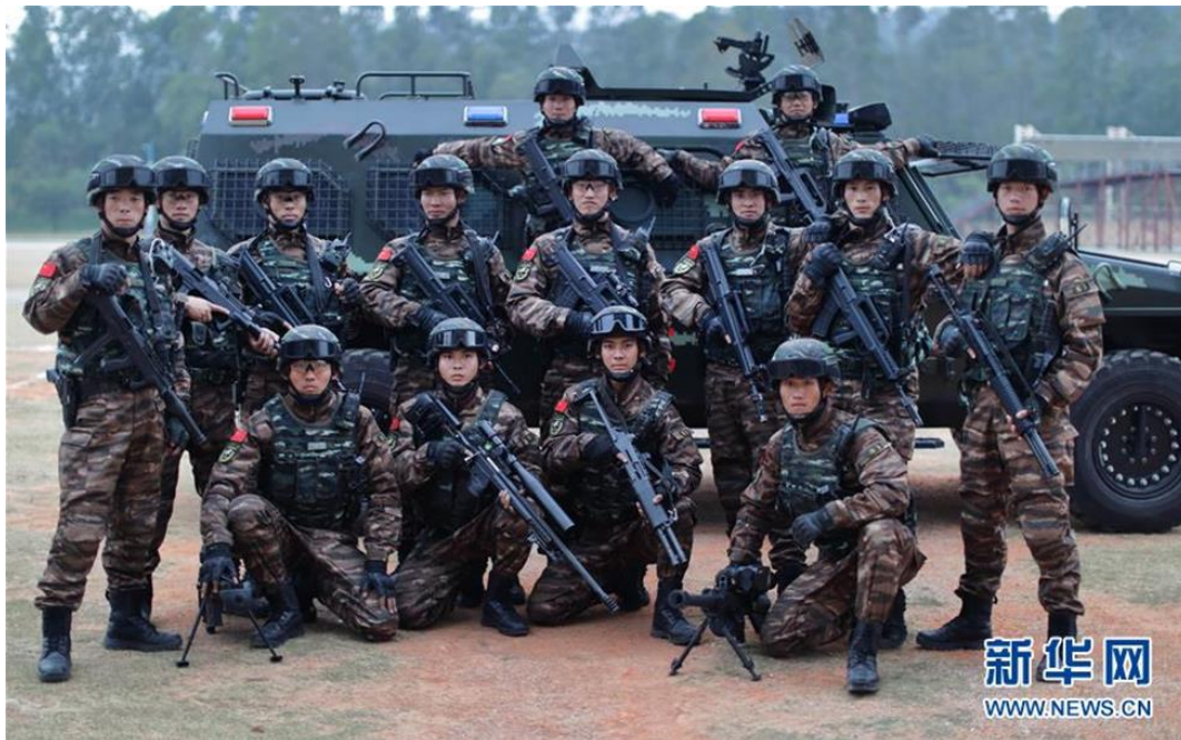
Exhibit 4. Members of the PAP “Snow Leopards” pose for a photo following a training exercise. 56

geographic boundary. 51 Both are large rapid reaction forces with mixed capabilities that can be deployed in major contingencies. Most relevant to a Taiwan scenario is the Second Mobile Contingent, whose headquarters is in Fuzhou (but subordinate units are scattered across southern China). This organization has two SOF detachments, one of which is believed to be the Snow Leopards commando unit (雪豹突击队). Founded in 2002, the Snow Leopards were based in Beijing but moved to Guangzhou as part of the restructuring. 52 The unit focuses on counterterrorism and hostage rescue, and includes assault, reconnaissance, explosive ordnance disposal, and sniper teams. 53 Its members possess standard equipment for “close-range fire strikes,” including pistols and assault rifles, while some also operate crossbows, submachine guns, and heavy machine guns. 54 Its location, internal composition, and equipment would make it applicable to some aspects of a Taiwan contingency, including protecting critical infrastructure within China from sabotage and even conducting “political rendition”-type operations in Taiwan. 55