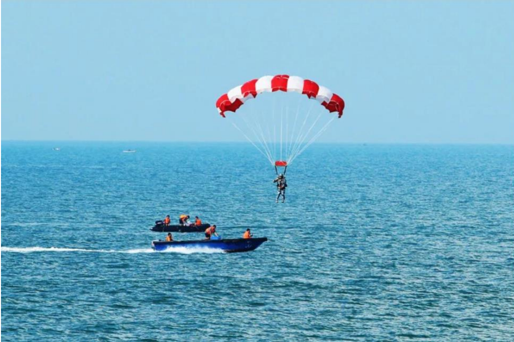
Exhibit 2. A member of the PLA Air Force “Thunder Gods” SOF brigade participates in a water-landing parachute drill. 30