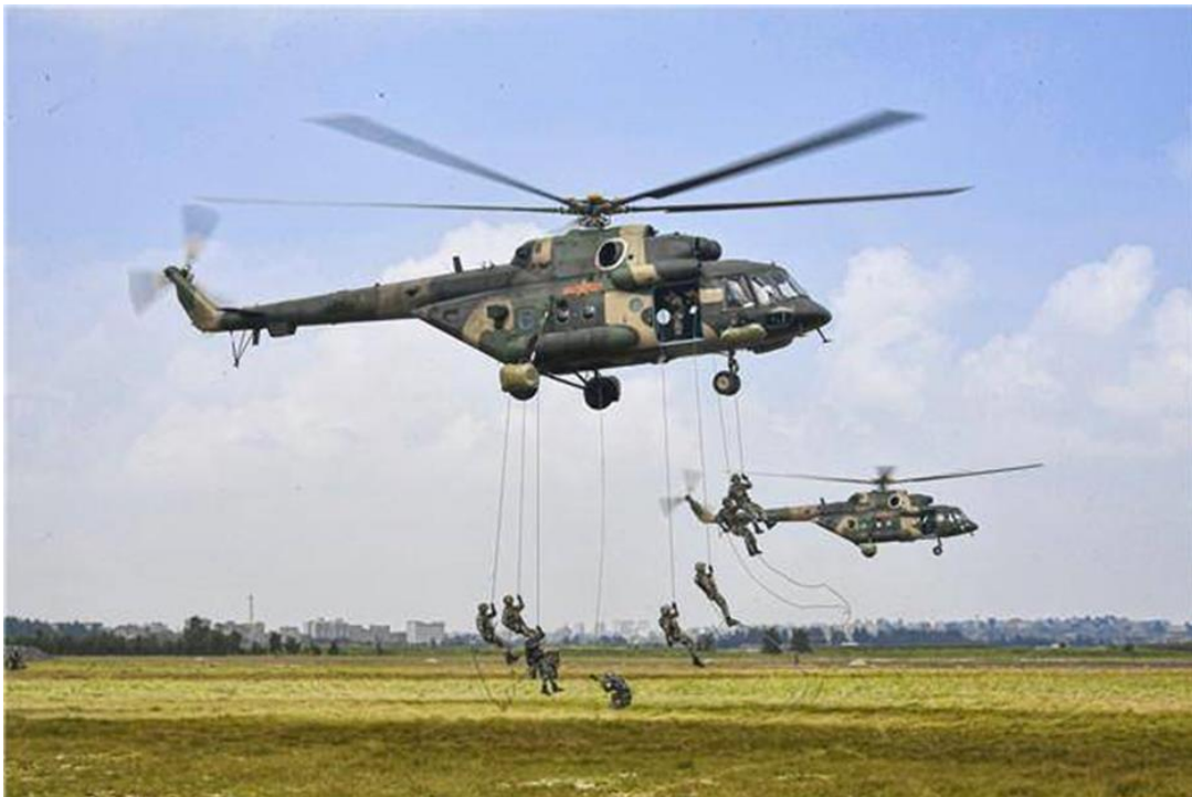
Exhibit 1. Members of the PLAA's "Flying Dragons of the East" conduct an air assault exercise. 5

The PLA has worked steadily over the last decade to ready SOF for an island landing scenario by refining doctrine, bolstering capabilities, and improving training. However, there are several variables that will influence these units' performance, including their technical proficiency and potential greater use of unmanned systems, which could replace humans in some roles but increase technical proficiency requirements; degree of jointness, including the need for larger and more frequent exercises with non-SOF units and continued reforms to joint command structures at and below the theater level; and the degree to which commanders try to micromanage SOF activities on the battlefield, which could lead to suboptimal results if those forces hesitate to act without explicit approval. The Taiwan and U.S. defense establishments should work to evaluate these challenges and weaknesses and determine whether plans for Taiwan's defense adequately consider PLA SOF.