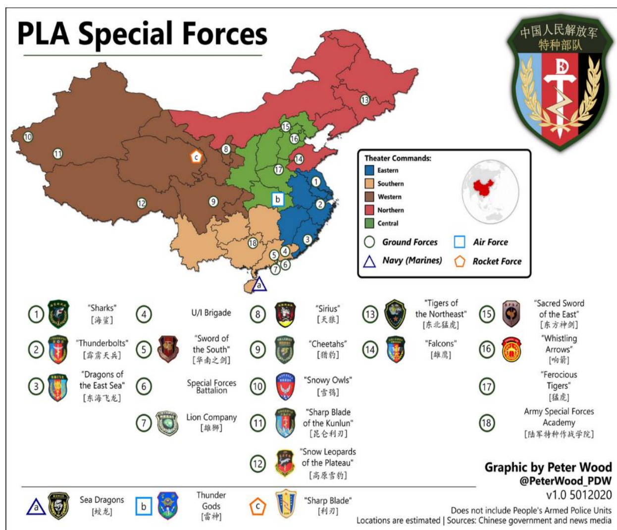
Exhibit 3. PLA Special Forces Units and Locations 35

seaboard in Hubei province. In addition, reconnaissance battalions assigned to the PLAA Group Armies and PLAN Marine Corps brigades are not explicitly designated as SOF but may also carry out special warfare missions in a Taiwan scenario. 34