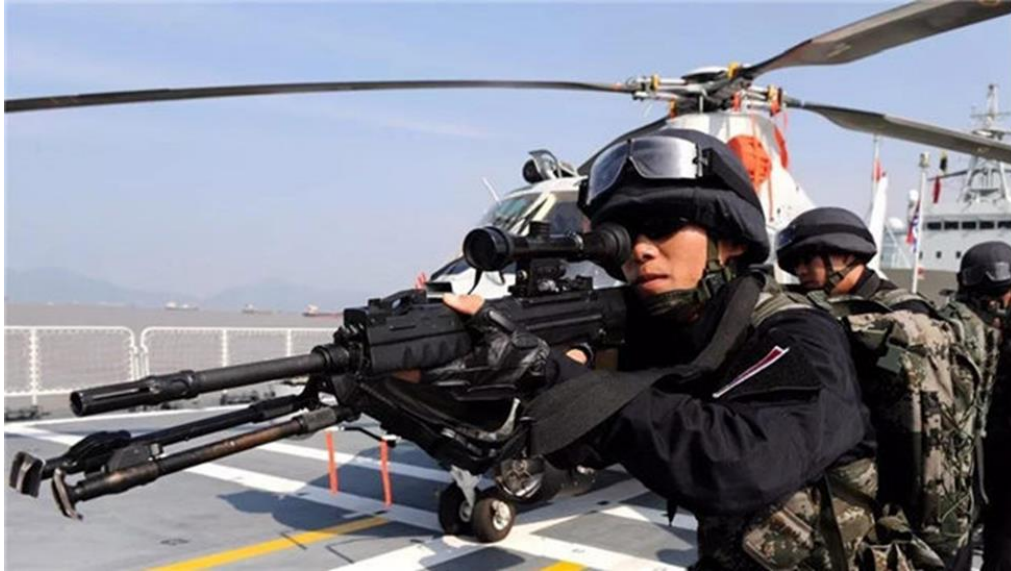
Exhibit 5. Sniper affiliated with the PLAN “Sea Dragons” conducts a shooting drill. 66

SOF units have also demonstrated rapid extraction capabilities across multiple domains. In 2017 footage, PLAN Marine Corps frogmen practiced a diver extraction method where they boarded a passing motorized rigid inflatable boat from the water, while a 2020 image showed the Thunder Gods apparently practicing a rapid extraction using a helicopter rope suspension technique. 67 Other extraction training undertaken during combat search and rescue drills focuses on coordination between fire support elements to cover forces exfiltrating by truck. 68