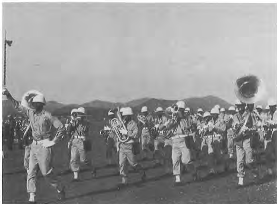
24TH INFANTRY BAND, GIFU, JAPAN, 1947

grades would have a direct bearing on the progress of the Army's new racial policy.