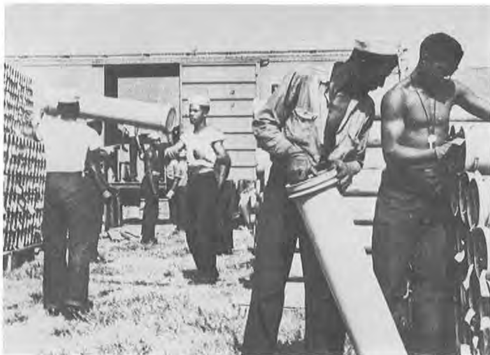
LABORERS AT NAVAL AMMUNITION DEPOT. Sailors passing 5-inch canisters, St. Julien's Creek, Virginia.

ment. Under pressure to provide more stewards to serve the officers whose number multiplied in the early months of the war, recruiters had netted all the men they could for that separate duty. Often recruiters took in many as stewards who were equipped by education and training for better jobs, and when these men were immediately put into uniforms and trained on the job at local naval stations the result was often dismaying. The Navy thus received poor service as well as unwelcome publicity for maintaining a segregated servants' branch. In an effort to standardize the training of messmen, the Bureau of Naval Personnel established a stewards school in the spring of 1943 at Norfolk and later one at Bainbridge, Maryland. The change in training did little to improve the standards of the service and much to intensify the feeling of isolation among many stewards.