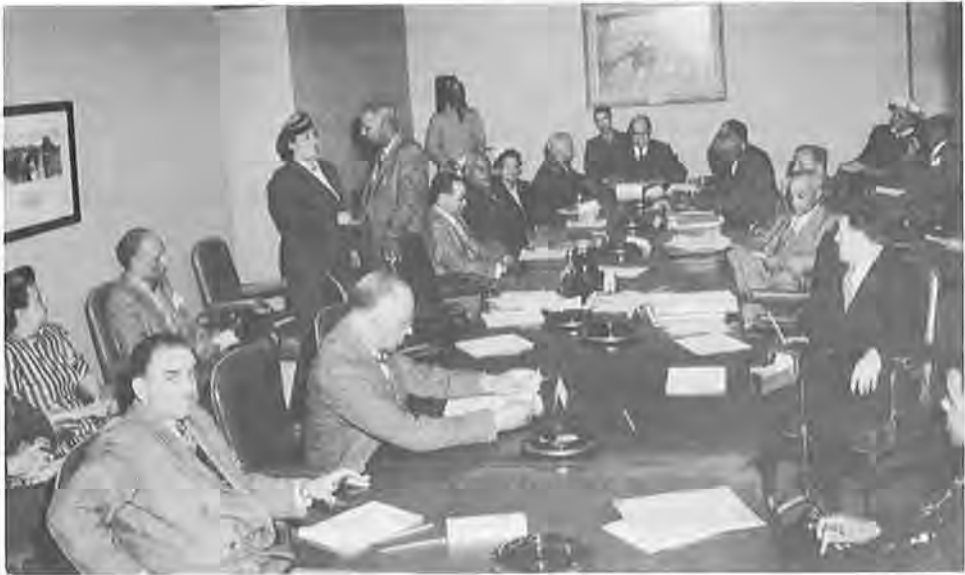
NATIONAL DEFENSE CONFERENCE ON NEGRO AFFAIRS. Conferees prepare to meet with the press, 26 April 1948.

with sixteen photographs picturing blacks and whites being trained together and working side by side. 46