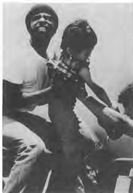
AMERICAN SAILORS help evacuate Vietnamese child.

This greater number of less gifted white servicemen had been spread thinly throughout the services' thousands of white units where they caused no particular problem. The lesser number of Negroes with low aptitude, however, were concentrated in the relatively few black units, creating a serious handicap to efficient performance. Conversely, the contribution of talented black servicemen was largely negated by their frequent assignment to units with too many low-scoring men. Small units composed in the main of black specialists, such as the black artillery and armor units that served in the European theater during World War II, served with distinction, but these units were special cases where the effect of segregation was tempered by the special qualifications of the carefully chosen men. Segregation and not mental aptitude was the key to the poor performance of the large black units in World War II.