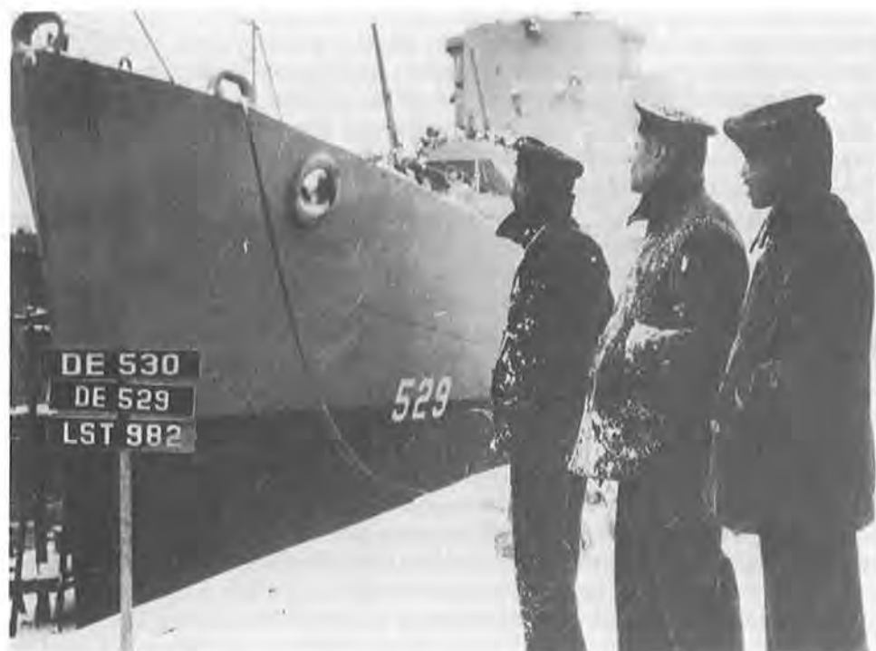
USS MASON. Sailors look over their new ship.

Although both ships continued to operate with black crews well into 1945, the Mason on escort duty in the Atlantic, only four other segregated patrol craft were added to the fleet during the war. 64 The Mason passed its shakedown cruise test, but the Bureau of Naval Personnel was not satisfied with the crew. The black petty officers had proved competent in their ratings and interested in their work, but bureau observers agreed that the rated men in general were unable to maintain discipline. The nonrated men tended to lack respect for the petty officers, who showed some disinclination to put their men on report. The Special Programs Unit admitted the truth of these charges but argued that the experiment only proved what the Navy already knew: black sailors did not respond well when assigned to all-black organizations under white officers. 65 On the other hand, the experiment demonstrated that the Navy possessed a reservoir of able seamen who were not being efficiently employed, and—an unexpected dividend from the presence of white noncommissioned officers—that integration worked on board ship. The white petty officers messed, worked, and slept with their men in the close contact inevitable aboard small ships, with no sign of racial friction.