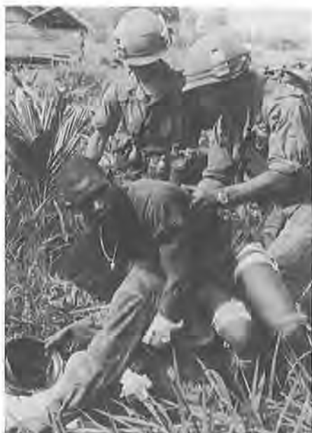
BOOBY TRAP VICTIM from Company B, 47th Infantry, resting on buddy's back, awaits evacuation.

Segregation officially ended in the active armed forces with the announcement of the Secretary of Defense in 1954 that the last all-black unit had been disbanded. In the little more than six years after President Truman's order, some quarter of a million blacks had been intermingled with whites in the nation's military units worldwide. These changes ushered in a brief era of good feeling during which the services and the civil rights advocates tended to overlook some forms of discrimination that persisted within the services. This tendency became even stronger in the early 1960's when the discrimination suffered by black servicemen in local communities dramatized the relative effectiveness of the equal treatment and opportunity policies on military installations. In July 1963, in the wake of another presidential investigation of racial