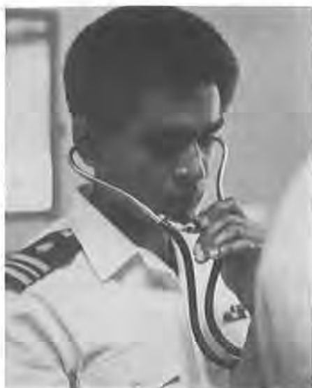
MEDICAL EXAMINATION. Navy doctor on duty, Yokosuka, Japan.