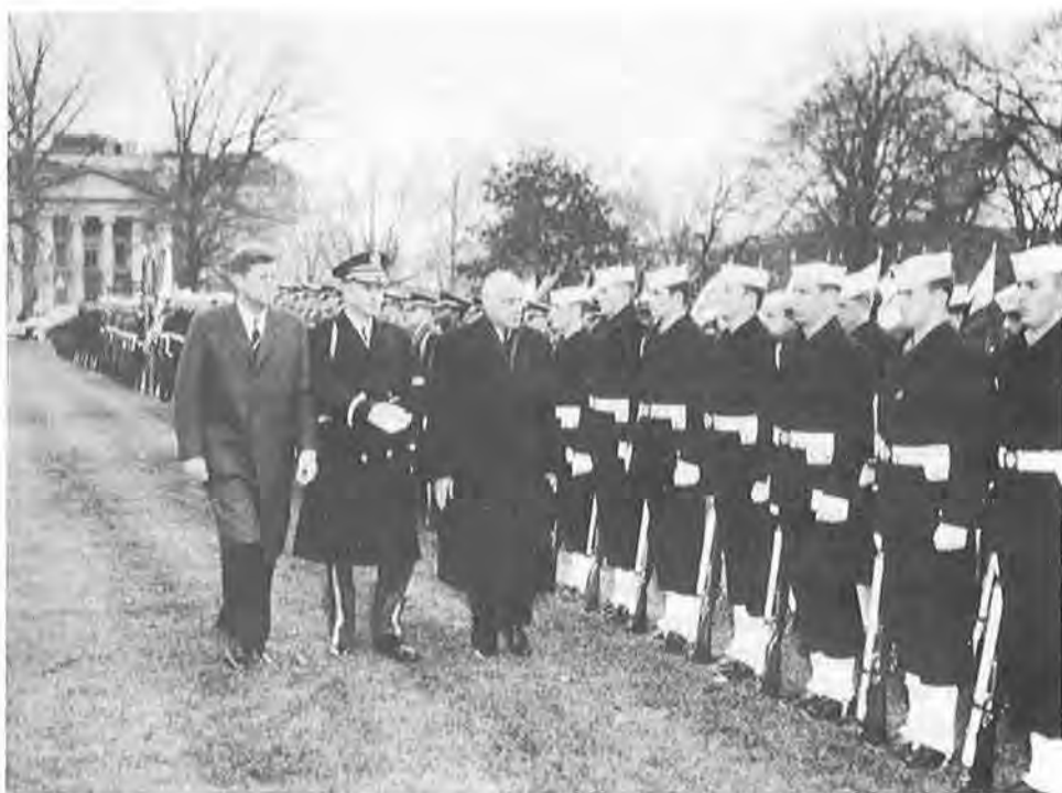
PRESIDENT KENNEDY AND PRESIDENT ALESSANDRI OF CHILE review an all-white honor guard unit, White House, 1962.

elaborated on the incident during his first cabinet meeting, asking each department head to analyze the minority employment situation in his own department. He was also upset to see "few, if any" black honor guardsmen in the units that greeted visiting Ghanaian President Kwame Nkrumah on 13 March, an observation not lost on Secretary McNamara. "Would it be possible," the new defense chief asked his manpower assistant, "to introduce into these units a reasonable number of negro personnel?" 33 An immediate survey revealed that Negroes accounted for 14 percent of the Air Force honor unit, 8 percent of the Army's, and 2.2 percent of the Marines Corps'. The 100-man naval unit had no black members. 34