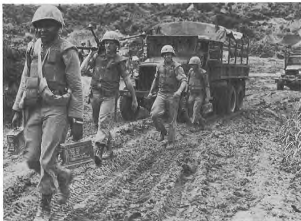
MARINE REINFORCEMENTS. A light machine gun squad of 3d Battalion, 1st Marines, arrives during the battle for "Boulder City."