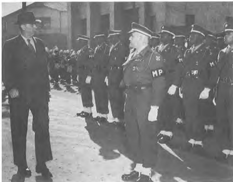
SECRETARY ROYALL REVIEWS MILITARY POLICE, Yokohama, Japan, 1949.

provisions of Circular 124, Negroes had already achieved equal treatment and opportunity in the Army. His job, therefore, was relatively simple. He had to defend Army policy against outside attack and make sure it was applied uniformly throughout the service. His stand marked one of the last attempts by a major federal official to support a racially separate but equal system before the principle was finally struck down by the Supreme Court in Brown v. Board of Education .