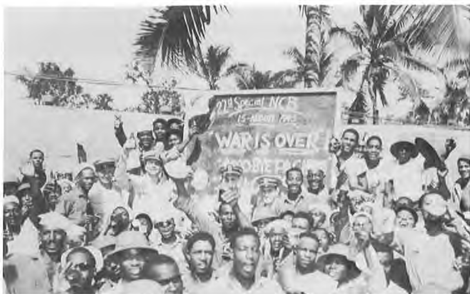
THE 22D SPECIAL CONSTRUCTION BATTALION CELEBRATES V-J DAY

representative, was visiting the Navy's continental installations, prodding commanders and converting them to the new policy. 137