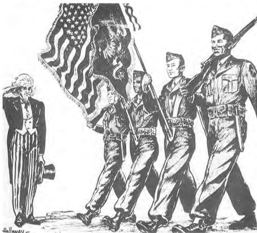
"NO LONGER A DREAM." The Pittsburgh Courier's reaction to the services' agreements with the Fahy Committee, May 20, 1950.

low scorers it continued to reenlist men scoring less than seventy. 143 But by July even the test score for first-time enlistment into the Army had declined to seventy because men were needed for the Korean War. The law required that whenever Selective Service began drafting men the Army would automatically lower its enlistment standards to seventy. Thus, despite the committee's recommendations, the concentration of low-scoring Negroes in the lower grades continued to increase, creating an even greater pool of men incapable of assignment to the schools and specialties open without regard to race.