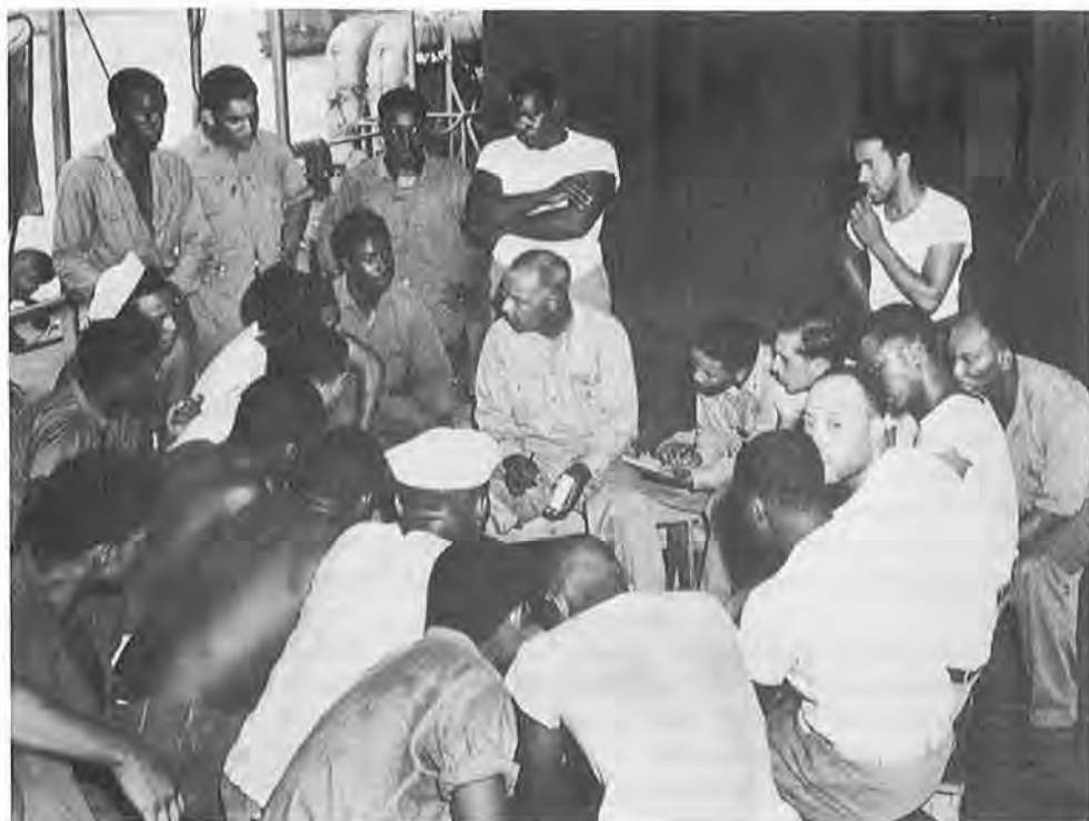
GRANGER INTERVIEWING SAILORS on inspection tour in the Pacific.

programs before they were assigned to units with substantial numbers of Negroes. 60