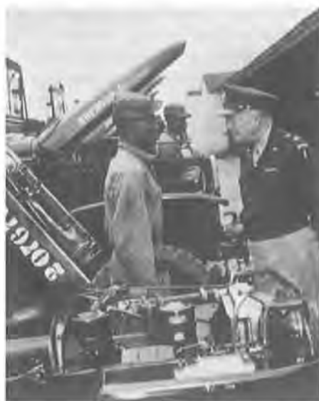
INSPECTION BY THE CHIEF OF STAFF. General Dwight D. Eisenhower talks with a soldier of the 25th Combat Team Motor Pool during a tour of Fort Benning, Georgia, 1947.

In general, the Negro is less well educated . . . and if you make a complete amalgamation, what you are going to have is in every company the Negro is going to be relegated to the minor jobs, and he is never going to get his promotion to such grades as technical sergeant, master sergeant, and so on, because the competition is too tough. If, on the