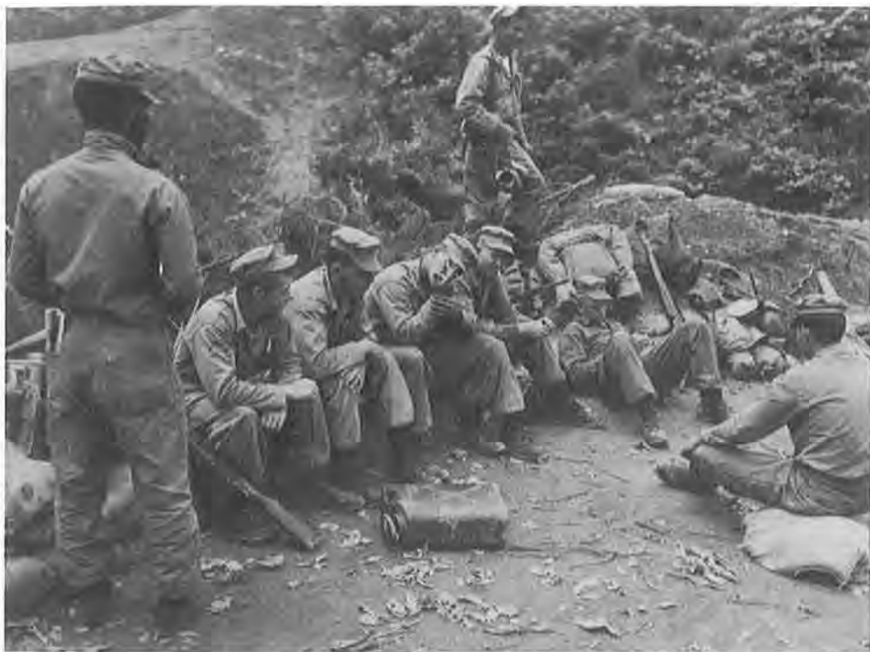
MARINES ON THE KANSAS LINE, KOREA. Men of the 1st Marines await word to move out.

order in some detail on 18 December, and although his comments were addressed to the commanders in the Fleet Marine Force, they were also forwarded to various commands in the support establishment that still retained all-black units. The order indicated that the practices now so commonplace in Korea were about to become the rule in the United States. 15 Some six months later the commandant informed the Chief of Naval Personnel that the Marine Corps had no segregated units and while integration had been gradual "it was believed to be an accomplished fact at this time." 16