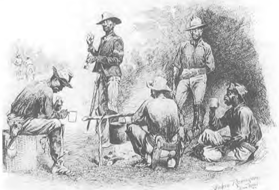
BUFFALO SOLDIERS. ( Frederick Remington's 1888 sketch. )

black reenlistment in combat or technical specialties had never been barred, a few black gunner's mates, torpedomen, machinist mates, and the like continued to serve in the 1930's.