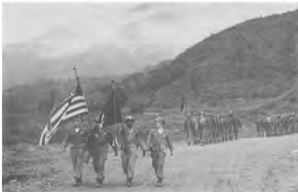
COLOR GUARD, 160TH INFANTRY, KOREA, 1952.

Since the Army was just 12 percent Negro in September 1951, it should have been possible to solve Ridgway's problem of black overstrength simply by distributing black soldiers evenly throughout the Army. But this solution was frustrated by the segregation still in force in other commands. Organized black units in the United States were small and few in number, and black recruits who could not be used in them were shipped as replacements to the overseas commands, principally in the Far East and Europe. 68 Consequently, Ridgway's problem was not an isolated one; his European counterpart was operating a largely segregated command almost 13 percent black. The Army could not prevent black overstrengths so long as Negroes were ordered into the quota-free service by color-blind draft boards, but it could equalize the overstrength by integrating its forces all over the world.