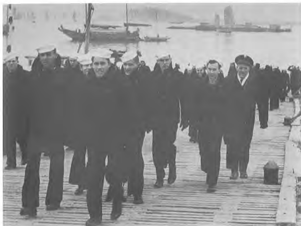
SHORE LEAVE IN KOREA. Men of the USS Topeka land in Inch'on, 1948.

the limitation of funds. 8 Even as he spoke, at least some black sailors were being trained in almost all naval ratings and were serving throughout the fleet, on planes and in submarines, working and living with whites. The signs pointed to a new day for Negroes in the Navy.