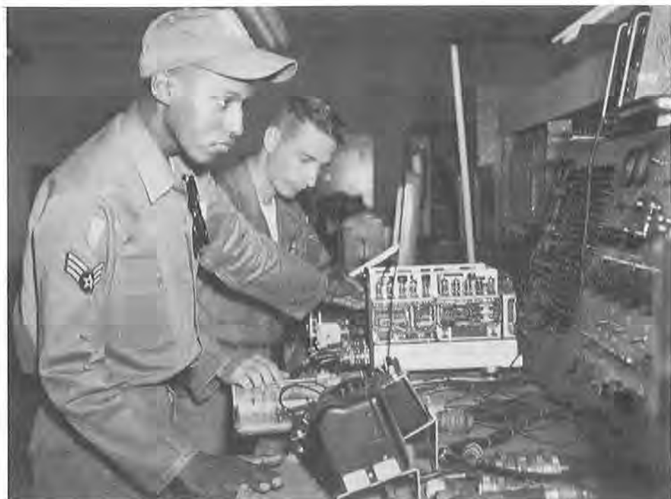
AUTO PILOT SHOP. Airmen check out equipment, Biggs Air Force Base, Texas.

long after the services had integrated their active forces and seemed to be moving toward a similar policy for the guard, doubts about federal authority over a peacetime guard appeared. The National Guard Bureau disputed the 1949 opinion of its legal counsel and the more recent one from the Defense Department and stressed the political implications of forcing integration; a bureau spokesman asserted that "an ultimatum to a governor that he must commit political suicide in order to obtain federal support for his National Guard will be rejected." Moreover, if federal officials insisted on integration, the bureau foresaw a deterioration of guard units to the detriment of national security. 47