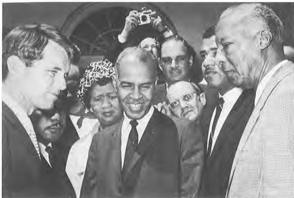
CIVIL RIGHTS LEADERS AT THE WHITE HOUSE. Attorney General Robert F. Kennedy poses with (from left) Martin Luther King, Jr., Roy Wilkins, Whitney M. Young, Jr., and A. Philip Randolph.

run. 7 Congressman Charles C. Diggs, Jr., did not share this hope. Citing numerous examples for the President of discrimination against black servicemen, he charged that, far from influencing local communities to change, commanders actually cooperated in discrimination by punishing or otherwise identifying protesting servicemen as troublemakers. 8