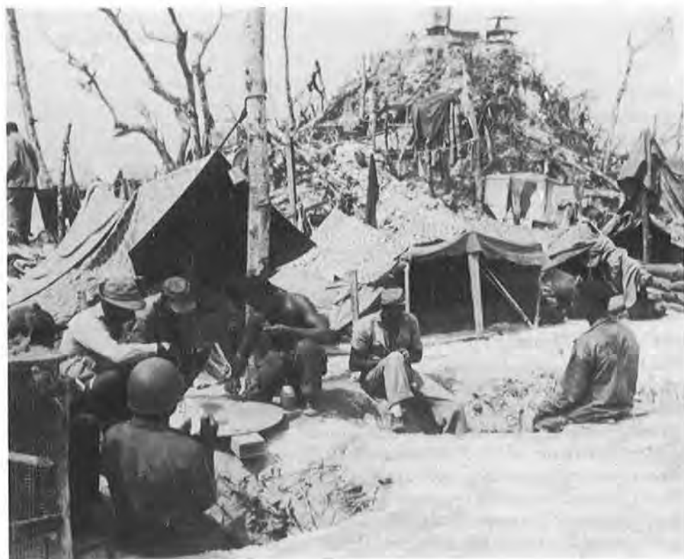
MEDICAL ATTENDANTS AT REST, PELELIU, OCTOBER, 1944

Messman's Branch along the lines of the Navy's Steward's Branch. 23 In authorizing the new branch, which was quickly redesignated the Steward's Branch to conform to the Navy model, Secretary Knox specified that the members must volunteer for such duty. Yet the corps, under pressure to produce large numbers of stewards in the early months of the war, showed so little faith in the volunteer system that Marine recruiters were urged to induce half of all black recruits to sign on as stewards. 24 Original plans called for the assignment of one steward for every six officers, but the lack of volunteers and the needs of the corps quickly caused this estimate to be scaled down. 25 By 5 July 1944 the Steward's Branch