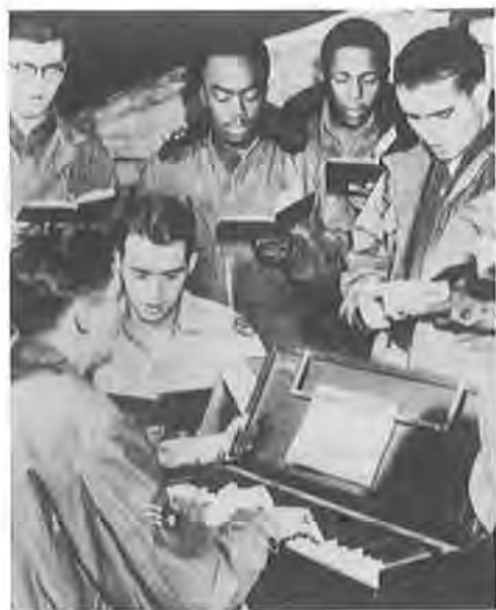
MUSIC MAKERS of the U.S. Far East Air Force prepare to celebrate Christmas, Korea, 1950.