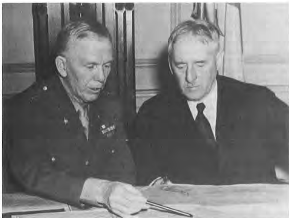
GENERAL MARSHALL AND SECRETARY STIMSON