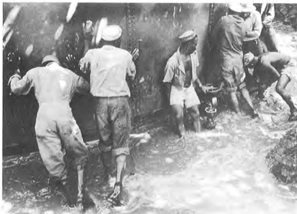
SEABEES IN THE SOUTH PACIFIC righting an undermined water tank.

supply depots, at air stations, and at section bases, 53 concentrated in large all-black groups and sometimes commanded by incompetent white officers. 54 While some billets existed in practically every important rating for graduates of the segregated specialty schools, these jobs were so few that black specialists were often assigned instead to unskilled laboring jobs. 55 Some of these men were among the best educated Negroes in the Navy, natural leaders capable of articulating their dissatisfaction. They resented being barred from the fighting, and their resentment, spreading through the thousands of Negroes in the shore establishment, was a prime cause of racial tension.