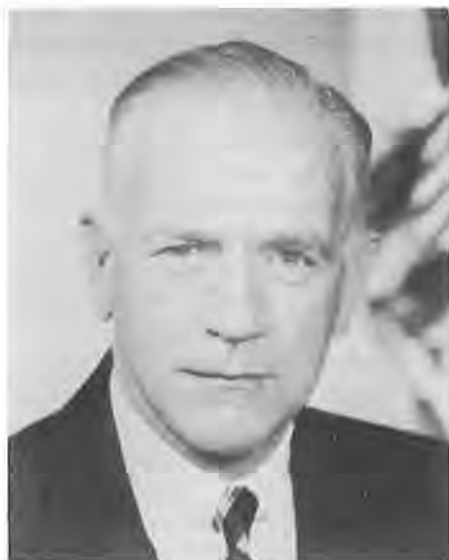
SECRETARY OF THE ARMY GRAY

must eliminate racial discrimination, not promote racial integration. In their meeting on 27 December Fahy was able to convince Gray that the former was impossible without the latter. According to Kenworthy, Gray demonstrated an "open and unbiased" view of the problem throughout all discussions. 115