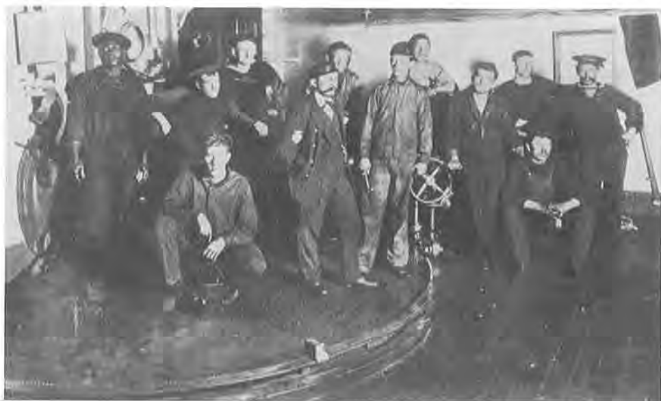
GUNNER'S GANG ON THE USS MAINE