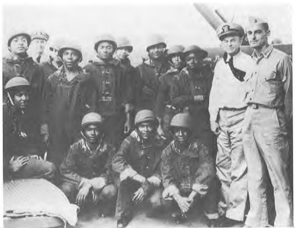
MESSMEN VOLUNTEER AS GUNNERS, Pacific task force , July 1942.

some special assignments that could be worked out for the Negro that "would not inject into the whole personnel of the Navy the race question." 22