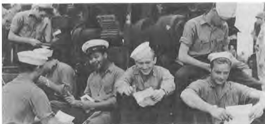
CREW MEMBERS OF USS ARGONAUT relax and read mail, Pearl Harbor, 1942.

Demonstrating changing social attitudes and also reflecting the compromise solution suggested by the President in June, Addison Walker's minority report recommended that a limited number of Negroes be enlisted for general duty "on some type of patrol or other small vessel assigned to a particular yard or station." While the enlistments could frankly be labeled experiments, Walker argued that such a step would mute black criticism by promoting Negroes out of the servant class. The program would also provide valuable data in case the Navy was later directed to accept Negroes through Selective Service. Reasoning that a man's right to fight for his country was probably more fundamental than his right to vote, Walker insisted that the drive for the rights and privileges of black citizens was a social force that could not be ignored by the Navy. Indeed, he added, "the reconciliation of social friction within our own country" should be a special concern of the armed forces in wartime. 14