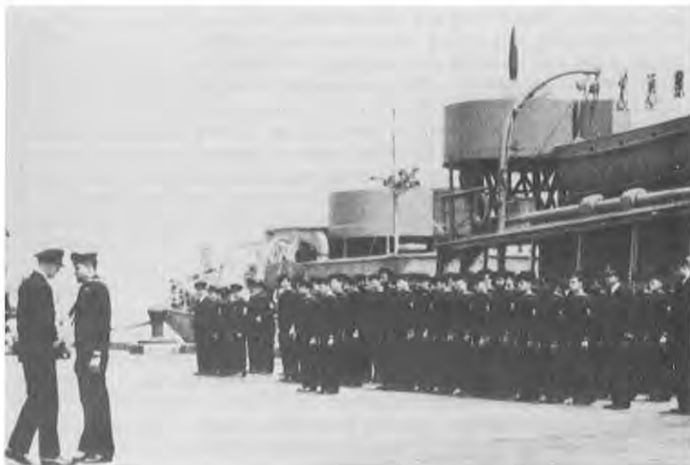
COMMANDER SKINNER AND CREW OF THE USS SEA CLOUD. Skinner officiates at awards ceremony.

black officers into the local white officers' club, and he saw to it that when his men were temporarily detached for shore patrol duty they would go in integrated teams. Again, all these arrangements were without sign of racial incident. 59