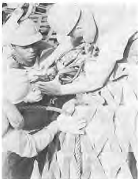
SUPPLYING THE SEVENTH FLEET. USS Procyon crewmen rig netload of supplies for a warship.