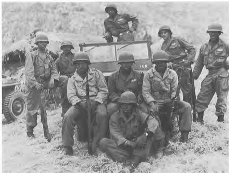
SURVIVORS OF AN INTELLIGENCE AND RECONNAISSANCE PLATOON, 24th Infantry, Korea, May 1951.

share the onus of its failure. The inspector general therefore again recommended retaining the 24th, assigning additional officers and noncommissioned officers to black units with low test averages, and continuing the integration of the Eighth Army. 30