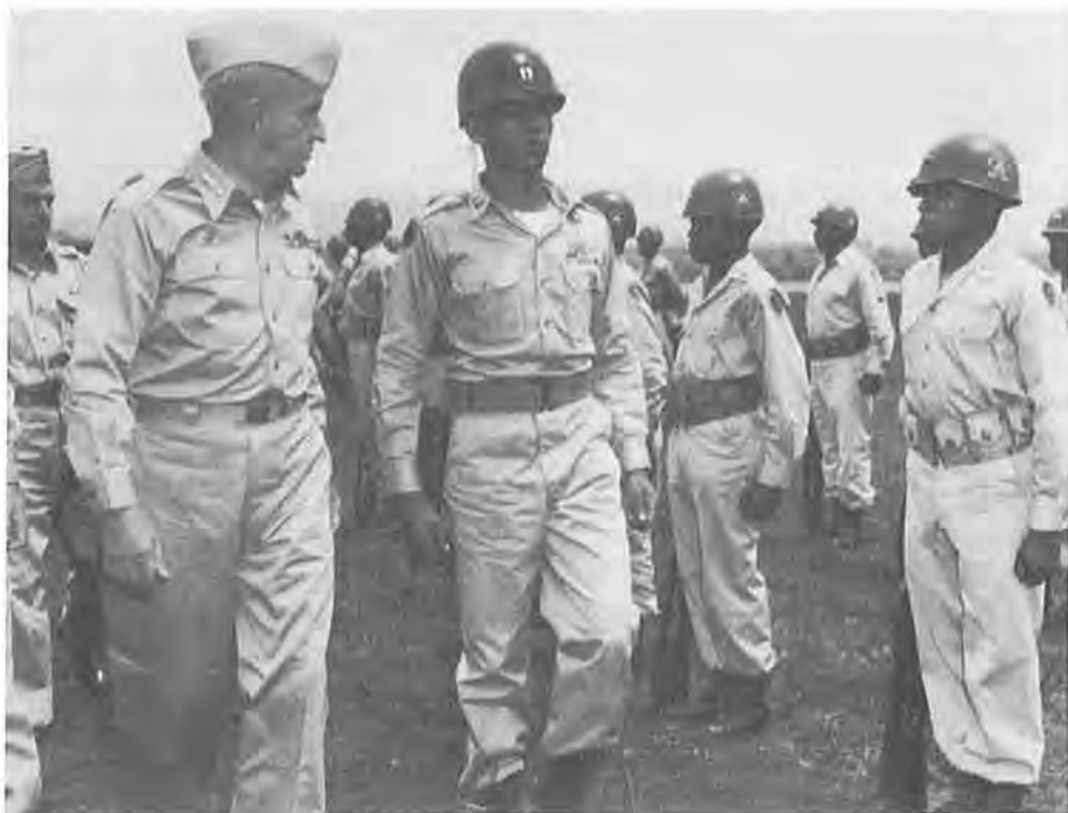
GENERAL EICHELBERGER, EIGHTH ARMY COMMANDER, inspects 24th Infantry troops, Camp Majestic, Japan, June 1947.

variation of the "Catch-22" theme, he suggested that before any black battalion was assigned to a large combat unit, the effect of such an assignment on the larger unit's combat efficiency would first have to be studied. Finally, he questioned the desirability of having a black unit assume the history of a white unit; evidently he did not realize that the intention was to assign a black unit with its black history to the division. 68