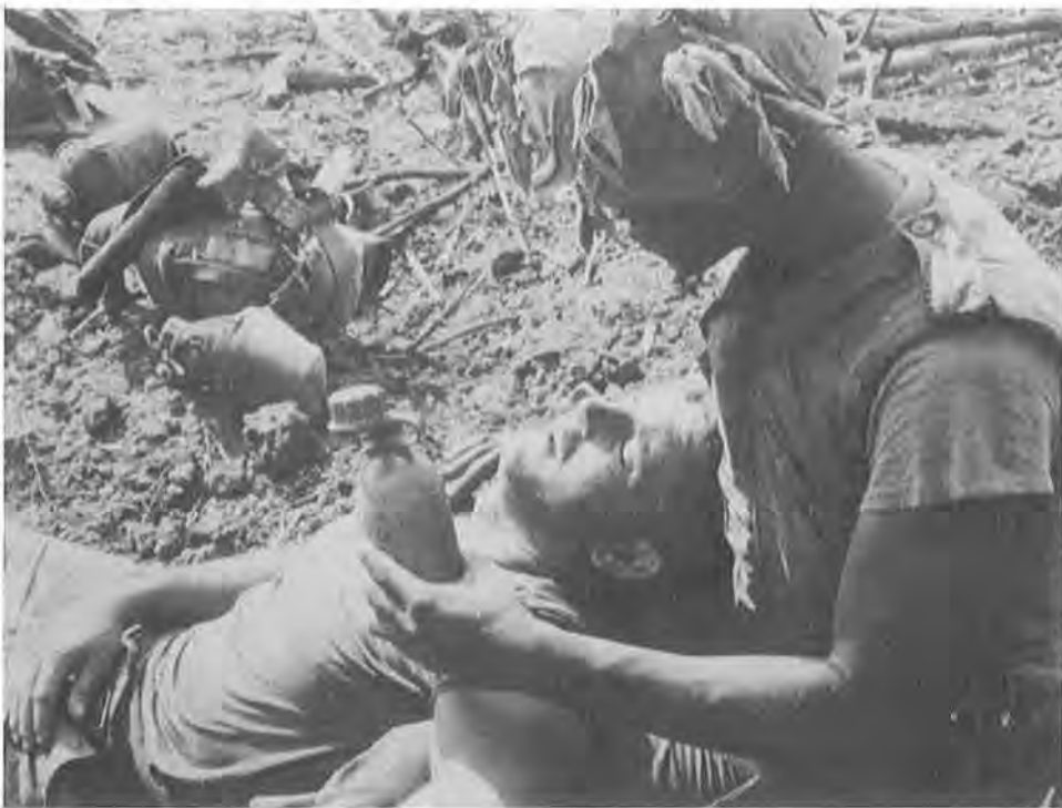
FIRST AID. Soldier of the 23d Infantry gives water to heat stroke victim during "Operation Wahiawa," Vietnam.

The result of these directives was spectacular. By June 1968 the ratio of off-base housing units carried on military referral listings—that is, apartment and trailer court units with open housing policies assured in writing by the owner or certified by the local commander—rose to some 83 percent of all available off-base housing for a gain of 247,000 units over the 1967 inventory. 96 In the suburban Washington area alone, the number of housing units opened to all servicemen rose more than 300 percent in 120 days—from 15,000 to more than 50,000 units. 97 By the end of 1968 some 1.17 million rental units, 93 percent of all those identified in the 1967 survey, were open to all servicemen. 98 Still, these impressive gains did not signal the end of housing discrimination for black servicemen. The various Defense Department sanctions excluded dwellings for four families or less, and the evidence suggests that the original and hastily compiled off-base census on which all the open housing gains were measured had ignored some particularly intransigent landlords in larger apartment houses and operators of trailer courts on the grounds that their continued refusal to