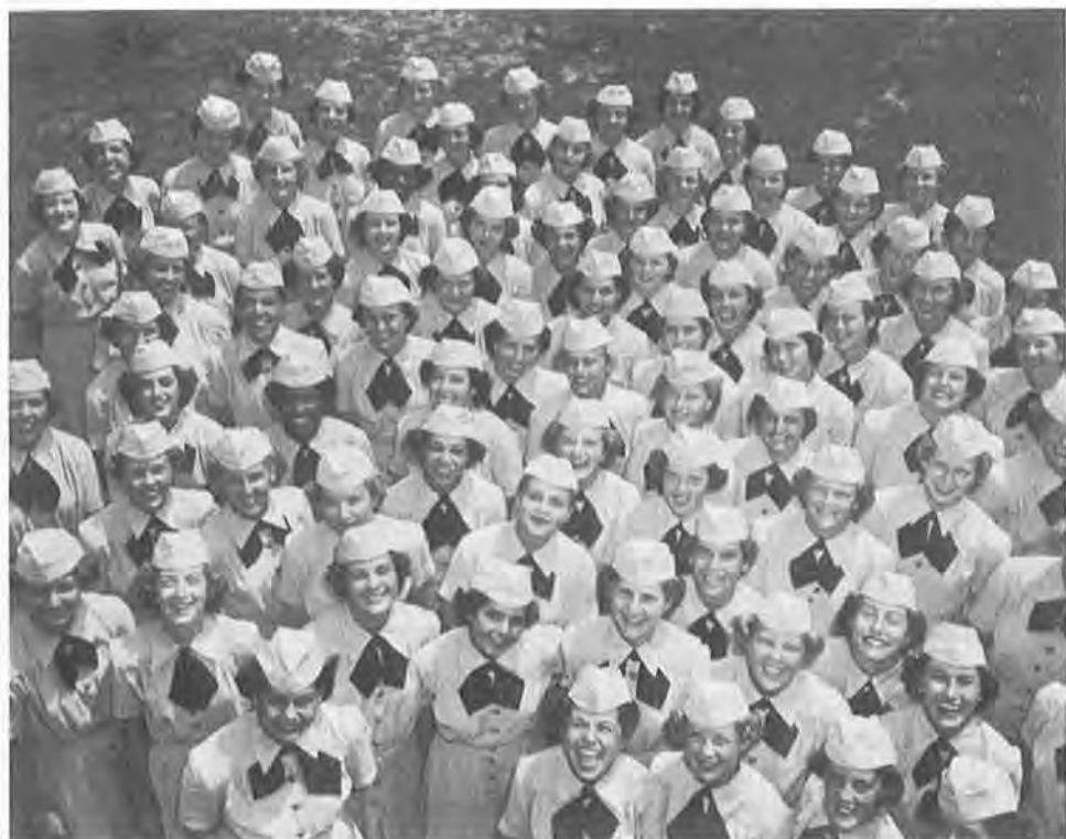
WAVE RECRUITS, Naval Training Center, Bainbridge, Maryland, 1953.

and protest in an era of aroused racial pride was the fact that servants' duties fell almost exclusively on nonwhite Americans. That these duties were popular—the 80 percent reenlistment rate in the Steward's Branch continued throughout the decade and the transfer rate into the branch almost equaled the transfer out—was disregarded by many of the more articulate spokesmen, who considered the branch an insult to the black public. As Congressman Powell informed the Navy in 1953, "no one is interested in today's world in fighting communism with a frying pan or shoe polish." 100 Although statistics showed