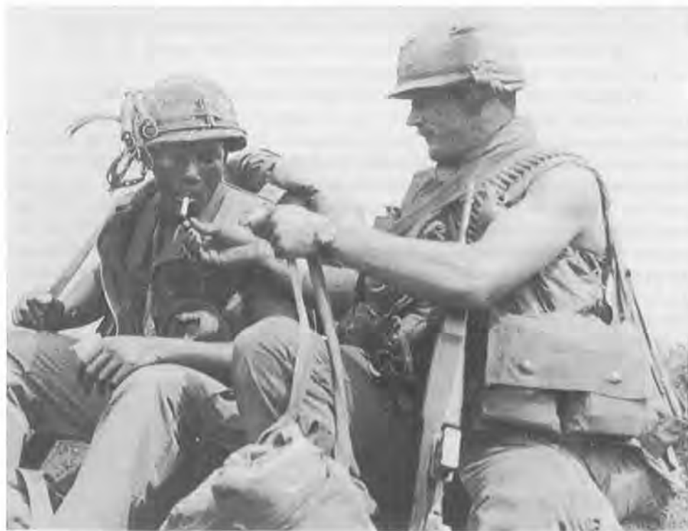
CAMARADERIE. A soldier of Company C, 7th Infantry, lights a cigarette for a marine from D Company, 26th Marines, during "Operation Pegasus" near Khe Sanh.

this stuff about 'niggers'. I had a colored buddy in Korea, and I want to tell you he was all right." 8