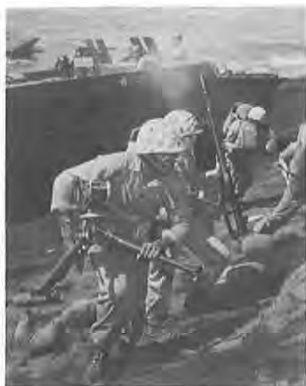
TRAINING EXERCISES on Iwo Jima, March 1954.

Corps, and education standards for such duty were considerably lower than those for the rest of the service. Everyone understood this, and beyond the stigma many young people felt was attached to such duties, many Negroes particularly resented the fact that while the branch was officially open to all, somehow none of the less gifted whites ever joined. Stewards were acquired either by recruiting new marines with stewards-duty-only contracts or by accepting volunteers from the general service. The evidence suggests that there was truth in the commonly held assumption among stewards that when a need for more stewards arose, "volunteers" were secured by tampering with the classification test scores of men in the general service. 26