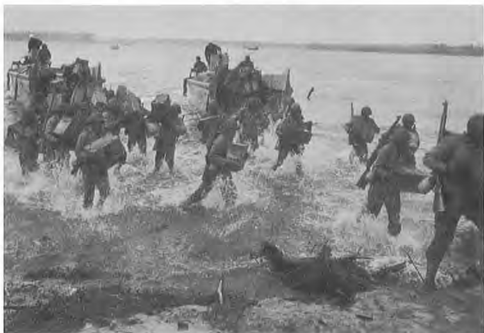
SHORE PARTY IN TRAINING, CAMP LEJEUNE, 1942

thoroughly knew their [Negroes'] individual and racial characteristics and temperaments," and Negroes should be assigned to work they preferred.