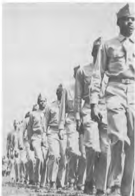
SQUADRON F, 318TH AAF BATTALION, in review, Lockbourne Air Force Base, Ohio, 1947.

surplus of "marginal individuals," men who could not be trained economically for the various skills needed." He argued that this theoretical surplus of Negroes was "potentially parasitic" and threatened the command's mission. 36