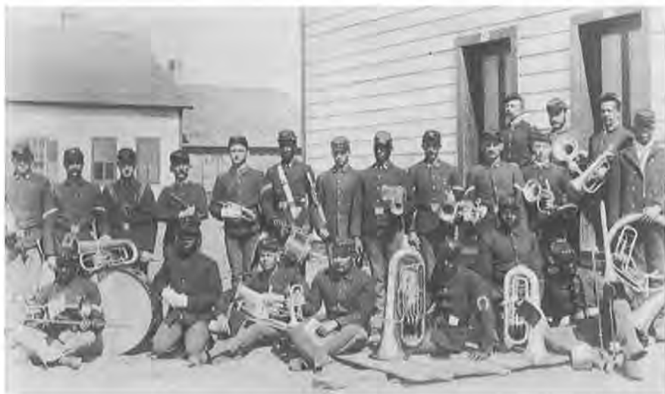
INTEGRATION IN THE ARMY OF 1888. The Army Band at Fort Duchesne, Utah, composed of soldiers from the black 9th Cavalry and the white 21st Infantry.

Pittsburgh Courier , the largest and one of the most influential of the nation's black papers, called upon the President to open the services to Negroes and organized the Committee for Negro Participation in the National Defense Program. These moves led to an extensive lobbying effort that in time spread to many other newspapers and local civil rights groups. The black press and its satellites also attracted the support of several national organizations that were promoting preparedness for war, and these groups, in turn, began to demand equal treatment and opportunity in the armed forces. 21