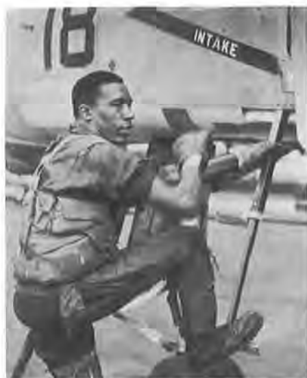
COLONEL PETERSEN (1968 photograph).

assignment. Henceforth, he ordered, half the volunteers accepted for stewards duty would be white. 31