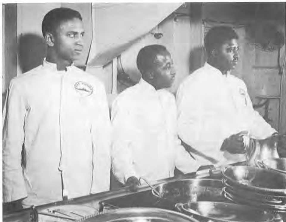
MESS ATTENDANTS, USS WISCONSIN, 1953

for stewards. This separation in turn explained the steward's usual failure to transfer to branches in the regular command channels. Since there were no minimum standards for the branch, it followed that most of its noncommissioned officers remained unqualified to exercise military command over personnel other than their branch subordinates. Lack of command responsibility was also present in a number of other branches not directly concerned with the operation of ships. It was not the result of race prejudice, therefore, but of standards for enlistment and types of duties performed. Nor was the steward's frequent physical separation based on race; berthing was arranged by department and function aboard large vessels. Separation did not exist on smaller ships. Messmen were usually berthed with other men of the supply department, including bakers and storekeepers. Chief stewards, however, as Under Secretary Kimball later explained, had not been required to meet the military qualifications for chief petty officer, and therefore it was "considered improper that they should be accorded the same messing, berthing, club facilities, and other privileges reserved for the highest enlisted grade of the Navy." 18 Stewards of the lower ranks received the same chance for advancement as members of other enlisted branches, but to grant them command responsibility would necessitate