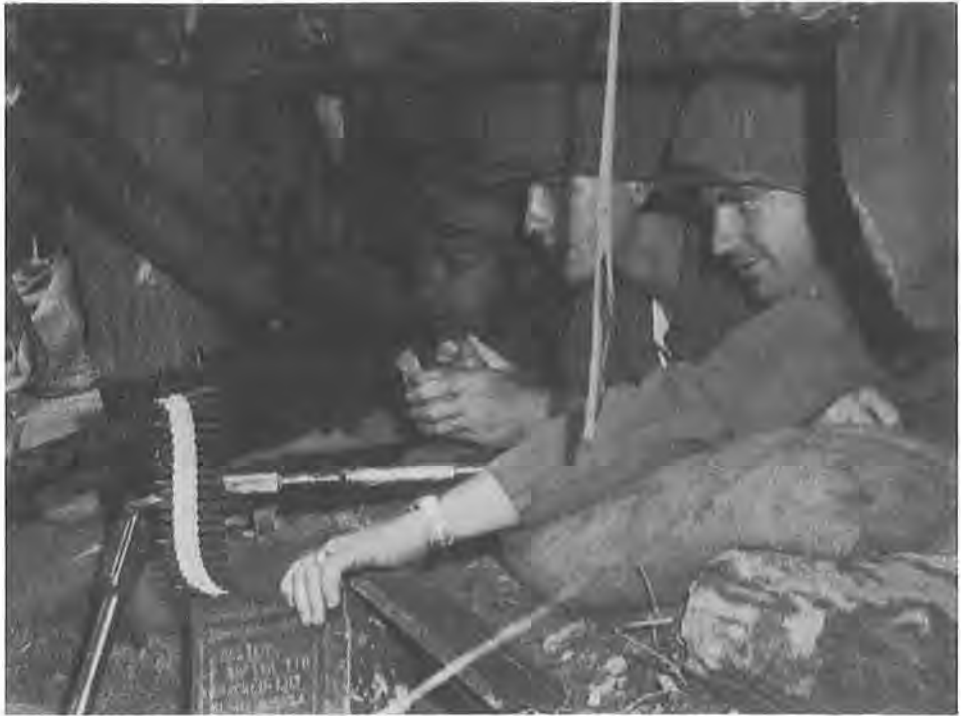
MACHINE GUNNERS OF COMPANY L, 14TH INFANTRY, Hill 931, Korea, September 1952.

delay was the continued shipment of black troops to the Far East in excess of the prescribed percentage. During the integration period the percentage of black replacements averaged between 12.6 and 15 percent and occasionally rose above 15 percent. 60 Ridgway finally got permission from Washington to raise the ratio of black soldiers in his combat infantry units to 12 percent, and further relief could be expected in the coming months when the two National Guard divisions began integrating. 61 Still, in October 1951 the proportion of Negroes in the Eighth Army had risen to 17.6 percent, and the flow of black troops to the Far East continued unabated, threatening the success of the integration program. Ridgway repeatedly appealed for relief, having been warned by his G-1 that future black replacements must not exceed 10 percent if the integration program was to continue successfully. 62