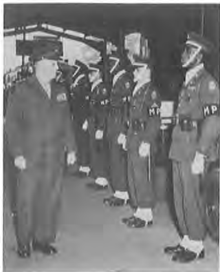
GENERAL HUEBNER inspects the 529th Military Police Company, Giessen, Germany, 1948.

effort to close the educational and training gap between black and white troops. 20 Of course, there were other ways to close the gap, and on occasion the Army had taken the more positive and difficult approach of upgrading its substandard black troops by giving them extra training. Although rarely so recognized, the Army's long record of providing remedial academic and technical training easily qualified it as one of the nation's major social engineers.