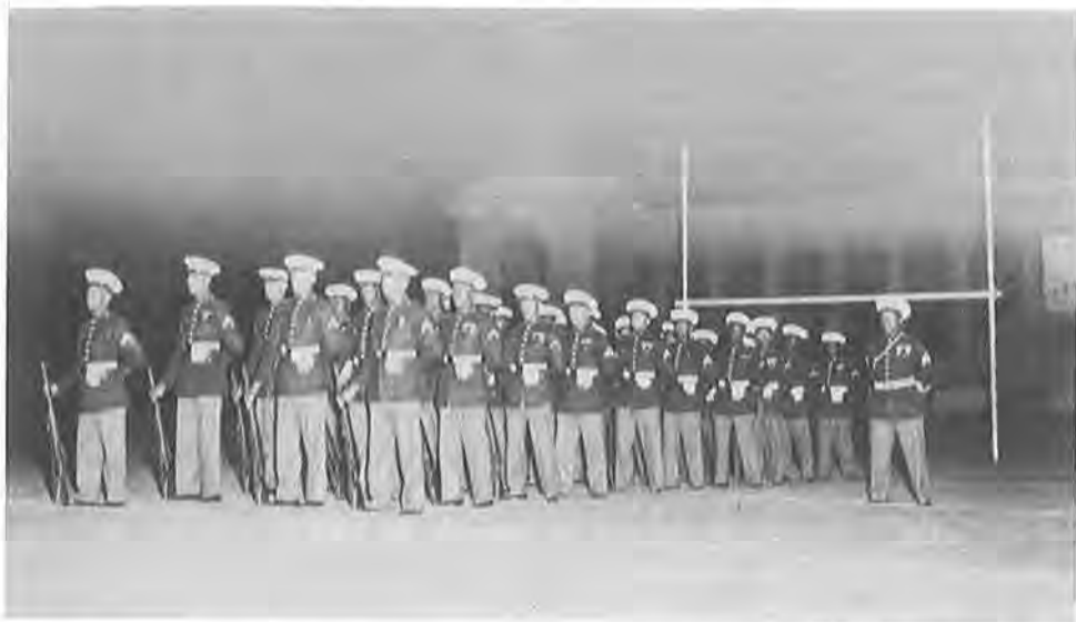
1ST MARINE DIVISION DRILL TEAM ON EXHIBITION at San Diego's Balboa Stadium , 1949.

mission, civil rights spokesmen might well ask, especially given the evidence to the contrary in the Navy? In view of the President's order, how could the corps justify the proliferation of very small black units that severely restricted the spread of occupational opportunities for Negroes?