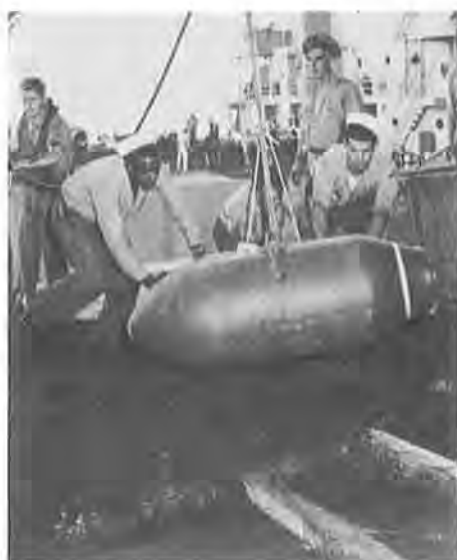
REARMING AT SEA. Ordnancemen at work on the deck of the USS Philippine Sea, off Korea, October 1950.

The Navy's poor reputation in the black community centered on the continued existence of the racially separate servants' branch, in the eyes of many the symbol of the service's racial exclusiveness. The Steward's Branch remained predominantly black. In 1949 it had 10,499 Negroes, 4,707 Filipinos, 741 other nonwhites, and 1 white man. Chief stewards continued to be denied the grade of chief petty officer, on the grounds that since stewards were not authorized to exercise military command over others than stewards because of their lack of military training, chief stewards were not chiefs in the military sense of the word. This difference in authority also explained, as the Chief of Naval Personnel put it, why as a general rule chief stewards were not quartered with other