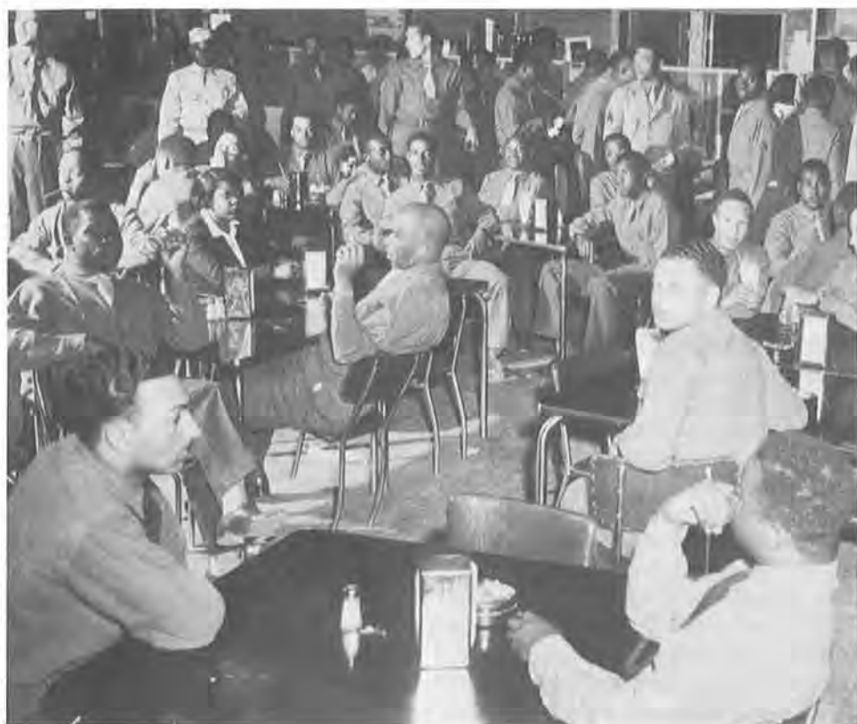
SERVICE CLUB, FORT HUACHUCA

Secretary McCloy as chairman. 44 Caught in the cross fire of black demands and Army traditions, the committee contented itself at first with collecting information on the racial situation and acting as a clearinghouse for recommendations on the employment of black troops. 45