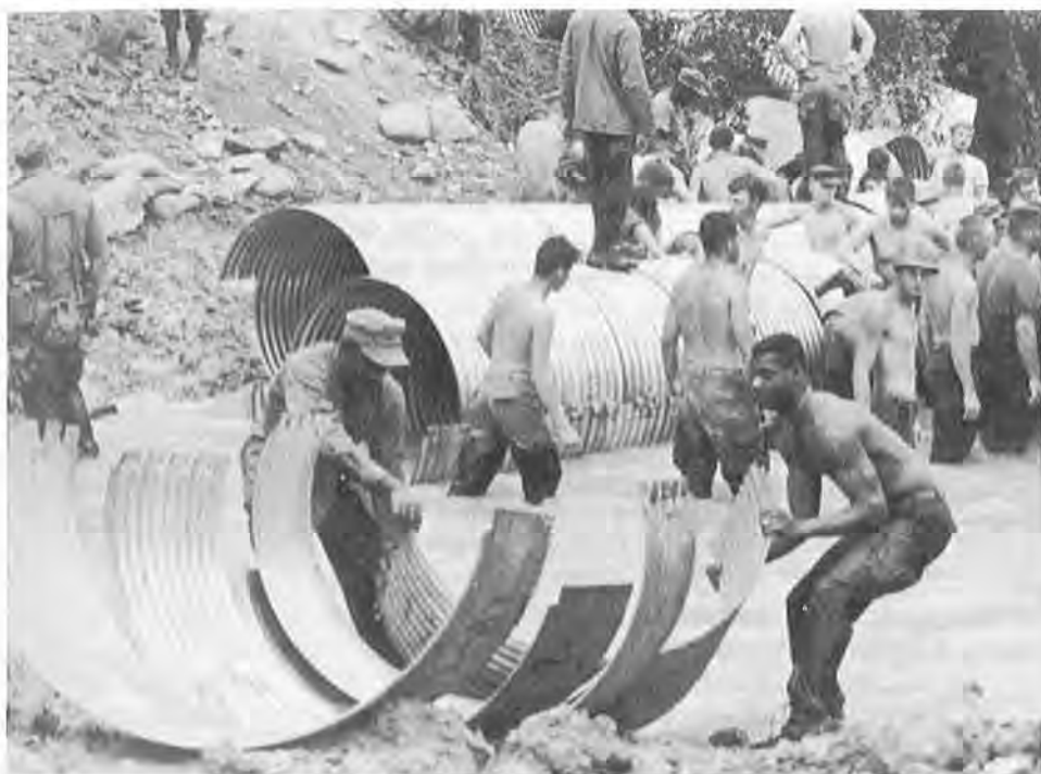
MARINE ENGINEERS IN VIETNAM. Men of the 11th Engineer Battalion move culverts into place in a mountain stream during "Operation Pegasus."

Army, the Fahy Committee used the failure to train and use eligible Negroes in unfilled jobs to convince senior officials that military efficiency demanded the progressive integration of its black soldiers, beginning with those men eligible for specialist duties. The final demonstration of the connection between efficiency and integration came from those harried commanders who, trying against overwhelming odds to fight a war in Korea with segregated units, finally began integrating their forces. They found that their black soldiers fought better in integrated units.