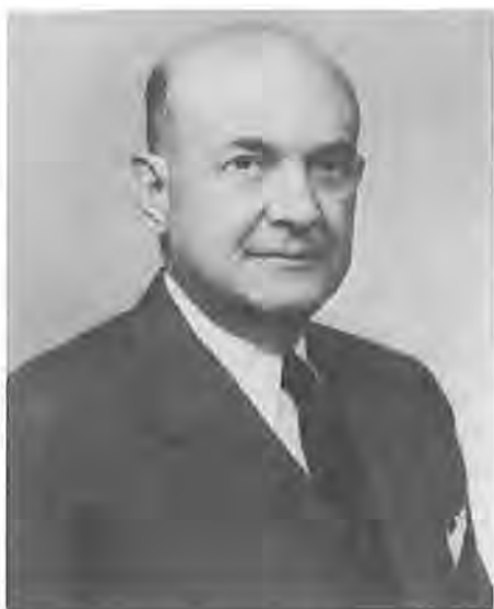
SECRETARY OF DEFENSE JOHNSON

If such was his motive, the secretary was taking a chance. Announcing his directive to the press transformed what could have been an innocuous, private reaffirmation of the department's pledge of equal treatment and opportunity into a public exercise in military policymaking. The Secretary of Defense in effect committed himself to a public review of the services' racial practices. In this sense the responses he elicited from the Army and Navy were a disappointment. Both services contented themselves with an outline of their current policies and ignored the secretary's request for future plans. The Army offered statistics to prove that its present program guaranteed equal opportunity, while the Navy concluded that its practices and procedures revealed "no in-