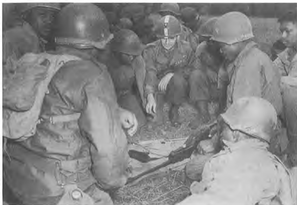
VOLUNTEERS FOR COMBAT IN TRAINING, 47th Reinforcement Depot, February 1945.

12th Army Group, and all saw action with a total of eleven divisions in the First and Seventh Armies.