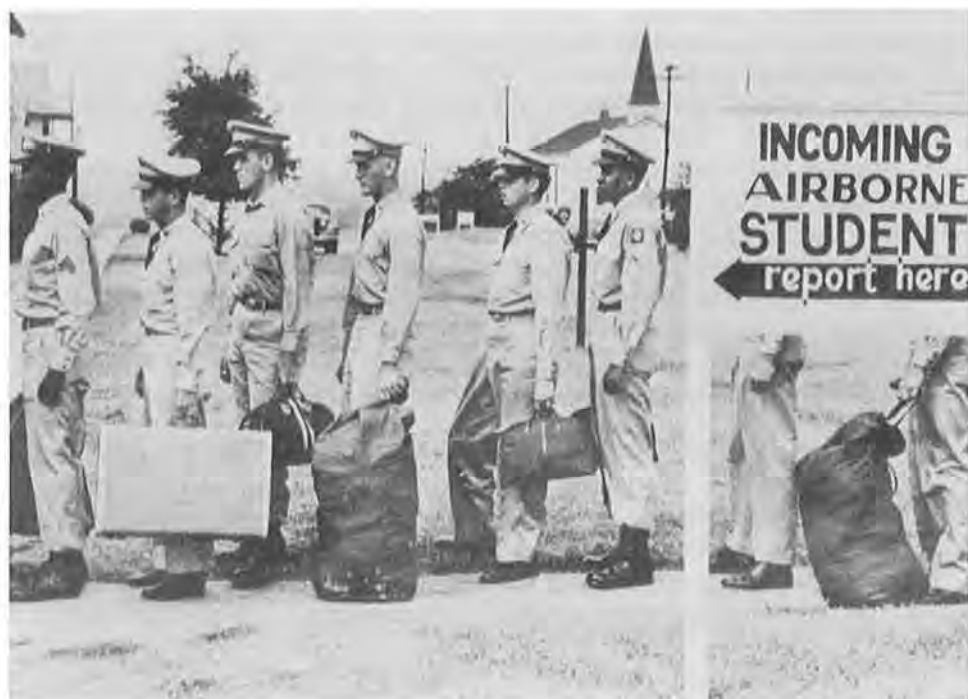
ARMY SPECIALISTS REPORT FOR AIRBORNE TRAINING, Fort Bragg, North Carolina, 1948.

expected to remain in the service for a considerable period of time. Manpower and budget limitations precluded a fully manned and trained general reserve, but new units for the four continental divisions, which were in varying stages of readiness, were authorized. 95