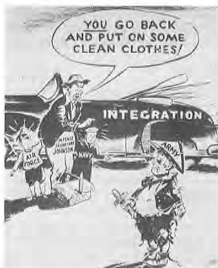
PRESS NOTICE. Rejection of the Army's second proposal as seen by the Afro-American, June 14, 1949.

But the Army received no such specific instruction. Although Johnson rejected the Army's second reply and demanded another based on a careful consideration of the Fahy Committee's recommendations, 70 he deleted Lanham's demand for immediate steps toward providing equal opportunity. Johnson's rejection of Lanham's proposal—a tacit rejection of the committee's basic premise as well—did not necessarily indicate a shift in Johnson's position, but it did establish a basis for future rivalry between the secretary and the committee. Until now Johnson and the committee, through the medium of the Personnel Policy Board, had worked in an informal partnership whose fruitfulness was readily apparent in the development of acceptable Navy and Air Force programs and in Johnson's rejection of the Army's inadequate responses. But this