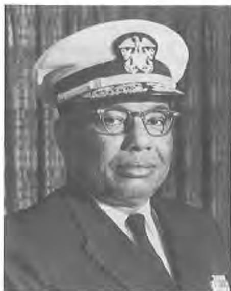
ADMIRAL GRAVELY (1973 portrait).

opportunity would remain very much a matter of numbers and percentages. In an era when a premium would be placed on the size of minority membership, the palm would go to the other services. "The blunt fact is," Granger reminded the Secretary of the Navy in 1954, "that as a general rule the most aspiring Negro youth are apt to have the least interest in a Navy career, chiefly because the Army and Air Force have up to now captured the spotlight." 101 A decade later the statement still held.