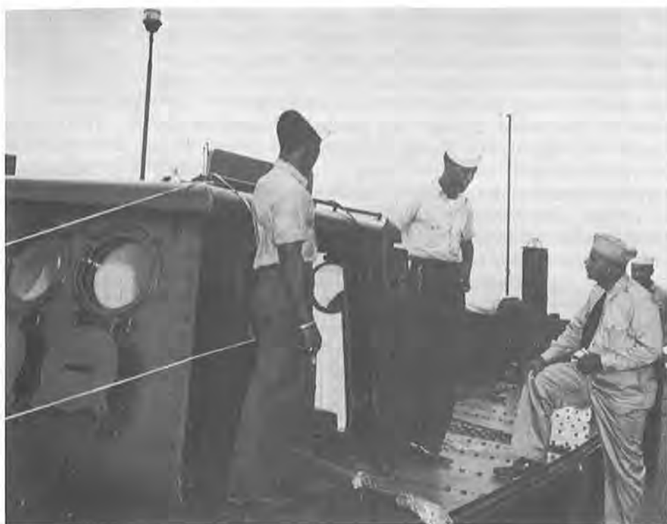
GRANGER WITH CREWMEN OF A NAVAL YARD CRAFT

provision would be made for enlistment of black regulars, the committee's integration recommendations lacked substance. Secretary Forrestal must have been aware of these omissions, but he ignored them. Perhaps the problem of the Negro in the postwar Navy seemed remote during this last, climactic summer of the war.