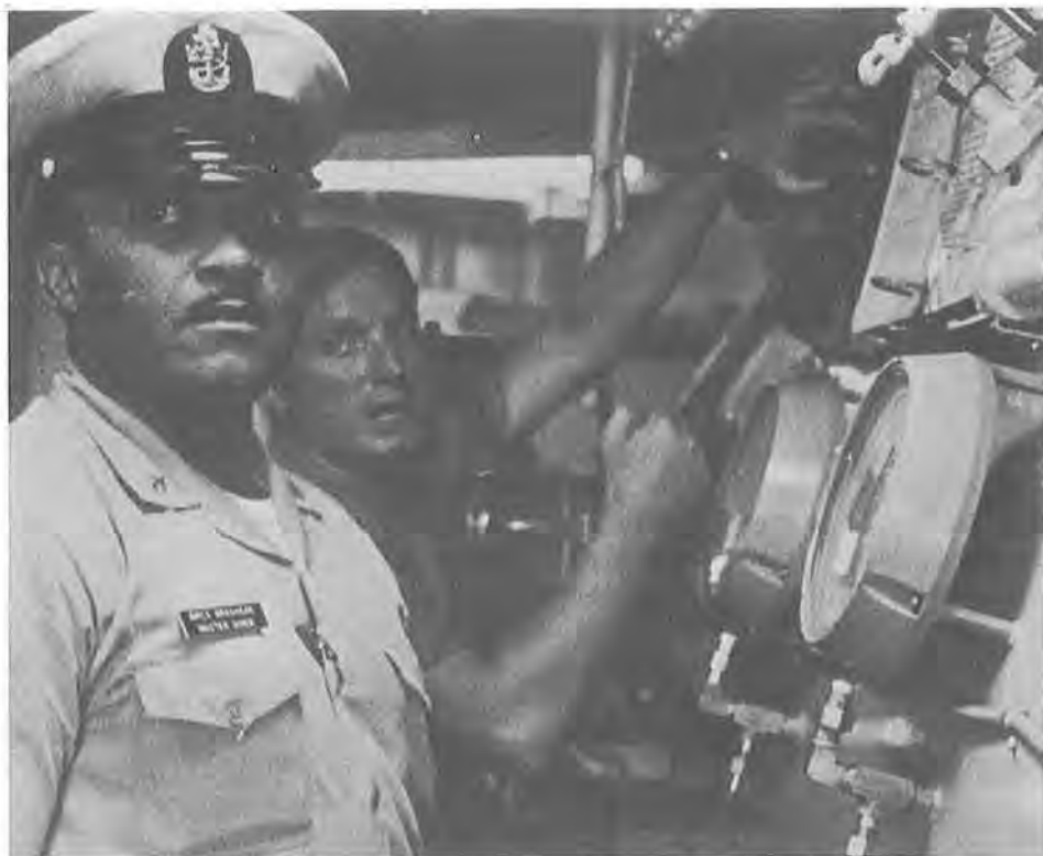
SUBMARINE TENDER DUTY. A senior chief boatswain mate and master diver at his station on the USS Hunley.