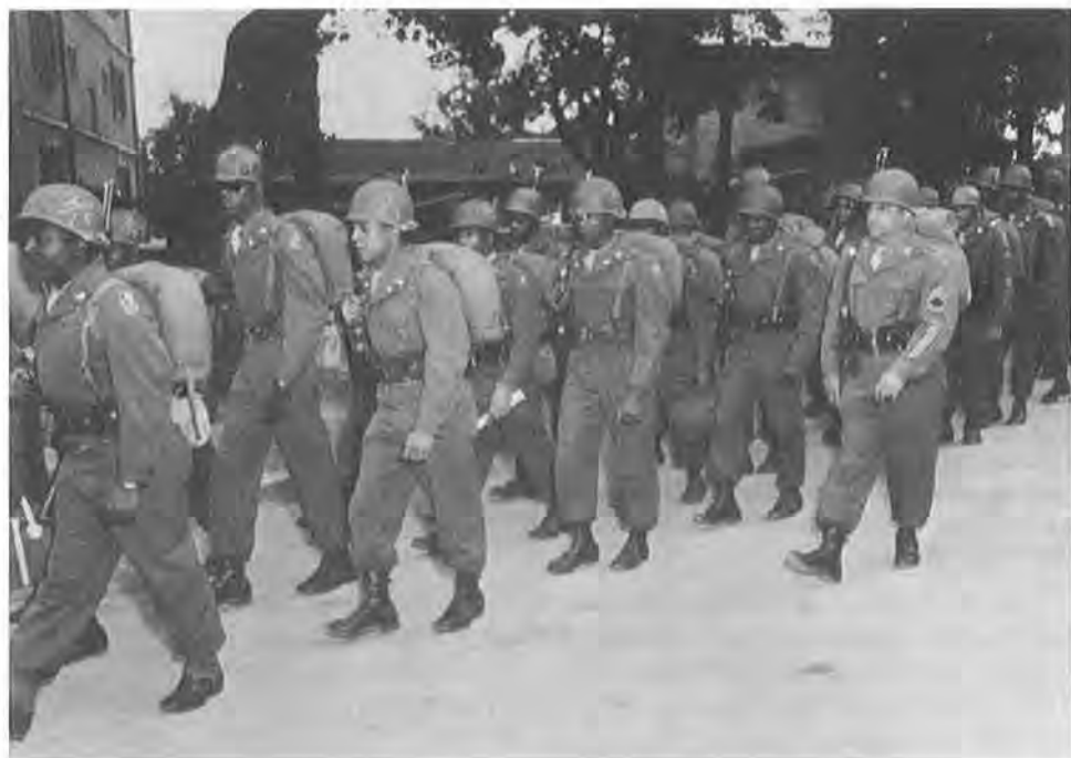
REPORTING TO KITZINGEN. Men of Company B, 371st Infantry Battalion, arrive for refresher course in basic military training.

quickly produced some impressive statistics. Thousands of soldiers—at the peak in 1950 more than 62 percent of all Negroes in the command—were enrolled in the military training course at Kitzingen or in on-duty educational programs organized in over two-thirds of the black companies throughout the command. By June 1950 the program had over 2,900 students and 200 instructors. A year later, the European commander estimated that since the program began some 1,169 Negroes had completed fifth grade in his schools, 2,150 had finished grade school, and 418 had passed the high school equivalency test. 28 The experiment had a practical and long-lasting effect on the Army. For example, in 1950 a sampling of three black units showed that after undergoing training at Kitzingen and in their own units the men scored an average of twenty points higher in Army classification tests. According to a 1950 European Command estimate, the command's education program was producing some of the finest trained black troops in the Army.