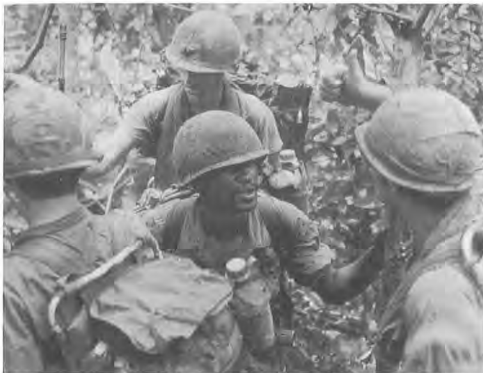
LISTENING TO THE SQUAD LEADER. Men of Company D, 21st Infantry, prepare to move out, Quang Tin Province, Vietnam.

Two pressing needs, and obviously interrelated ones, were to attract a greater number of young blacks to a military career and improve the status of Negroes already in uniform. These were not easy, short-term tasks. In the first place the Negro, ironically in view of the services' now genuine desire to have him, was no longer so interested in joining. As explained by Defense Department civil rights officials, the past attitudes and practices of the services, especially the treatment of Negroes during World War II, had created among black opinion-makers an indifference toward the services as a vocation. 40 Lacking encouragement from parents, teachers, and peers, black youths were increasingly reluctant to consider a military career. For their part the services tried to counter this attitude with an energetic public relations program. 41 Encouraged by the department's civil