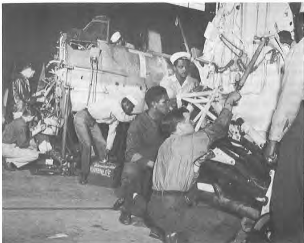
SPECIALISTS REPAIR AIRCRAFT, Naval Air Station, Seattle, Washington, 1945.

prison. The authorities also recommended that several of the white marines involved be court-martialed. These men too were convicted of various offenses and sentenced. 120 Walter White went to Guam to investigate the matter and appeared as a principal witness before the Marine Court of Inquiry. There he pieced together for officials the long history of discrimination suffered by men of the base company. This situation, combined with poor leadership in the unit, he believed, caused the trouble. His efforts and those of other civil rights advocates led to the release of the black sailors in early 1946. 121