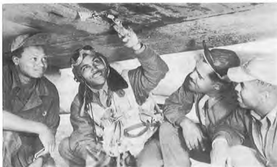
DAMAGE INSPECTION. A squadron operations officer of the 332d Fighter Group points out a cannon hole to ground crew, Italy, 1945.

eventually mean the mass transfer of high-scoring Negroes to the Air Forces, thus depriving the Service and Ground Forces of their proportionate share. Although the Secretary of War approved the Air Forces proposal, the change came too late to affect the shortage of black pilots and specialists before the end of the war.