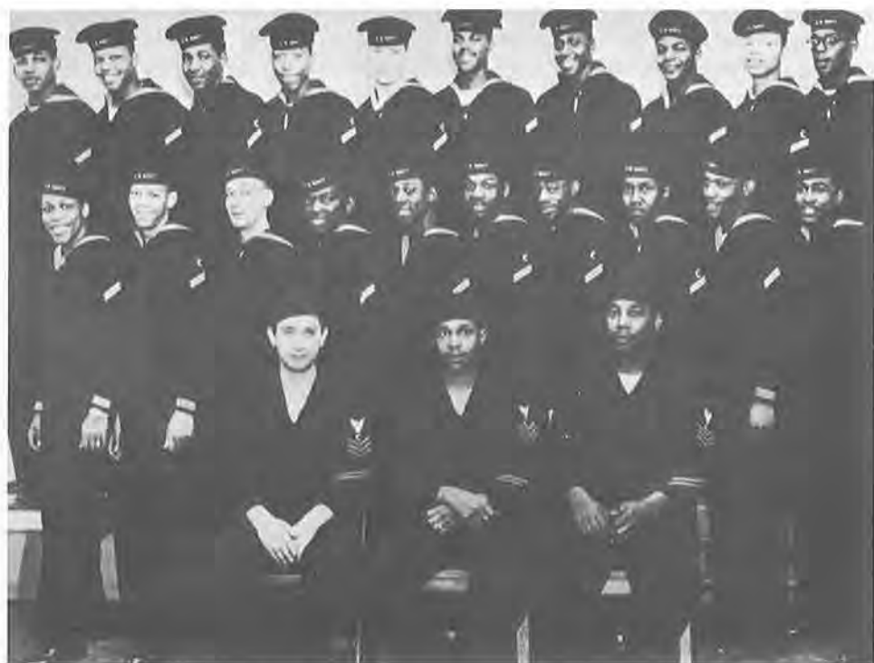
INTEGRATED STEWARDS CLASS GRADUATES, GREAT LAKES, 1953

Deputy Chief of Naval Personnel and composed of representatives of the other bureaus. When he received this committee's views, Holloway promised to take "definite administrative action." 93