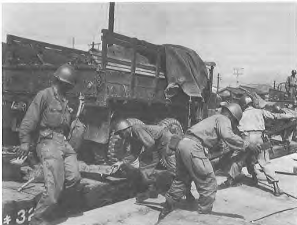
25TH DIVISION TROOPS UNLOAD TRUCKS AND EQUIPMENT at Sasebo Railway Station, Japan, for transport to Korea, 1950.

example, concluded in 1949 that, while the race of an individual was not a factor in determining eligibility for a mission assignment, the attitude of certain countries (he was referring to certain Latin American countries) made it advisable to inform the host country of the race of the prospective applicant. For a host country to reject a Negro was undesirable, he concluded, but for a Negro to be assigned to a country that did not welcome him would be embarrassing to both countries. 34 When the chief of the military mission in Turkey asked the Army staff in 1951 to reconsider assigning black soldiers to Turkey because of the attitude of the Turks, the Army canceled the assignment. 35