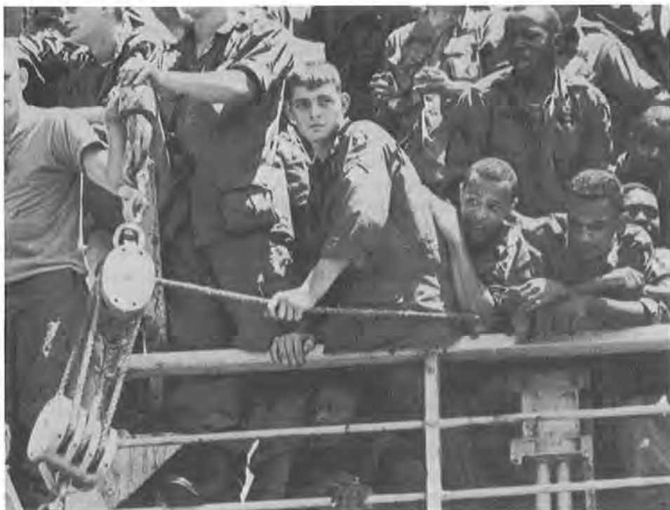
ARRIVING IN VIETNAM. 101st Airborne Division troops aboard the USNS General Le Roy Eltinge .