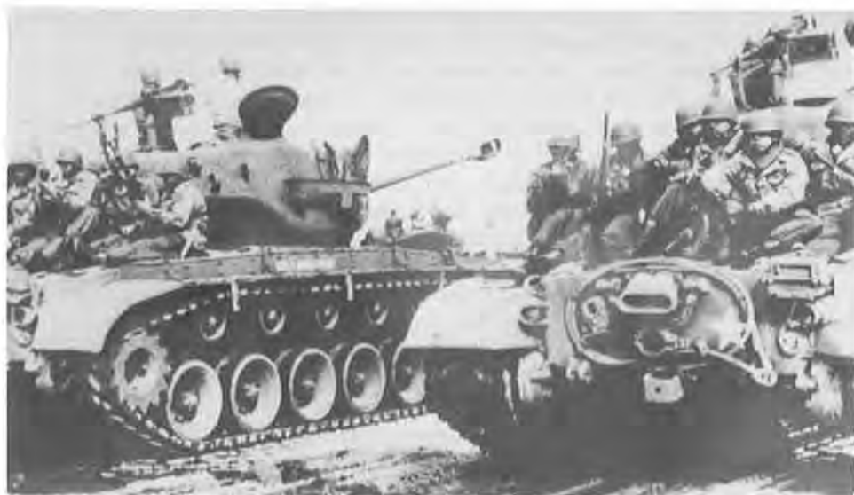
MP'S HITCH A RIDE ON ARMY TANKS, AUGSBURG, GERMANY, 1949