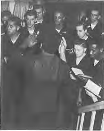
CHRISTMAS IN KOREA, 1950

recruiting them when it seemed likely that the Secretary of Defense would refuse the request. 68