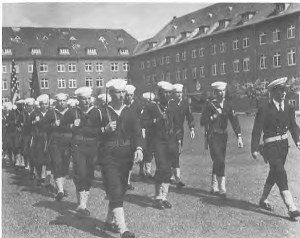
NAVAL UNIT PASSES IN REVIEW, Naval Advanced Base, Bremerhaven, Germany, 1949.

Recruiters had similar problems in the enlistment of Negroes for general service. Viewed from a different perspective, even the complaints and demands of black citizens, at flood tide during the war, now merely trickled into the secretary's office, reflecting, it could be argued, a growing indifference. That such unwillingness to enlist, as Lester Granger put it, should occur on the heels of a widely publicized promise of racial equality in the service was ironic. The Navy was beginning to welcome the Negro, but the Negro no longer seemed interested in joining. 52