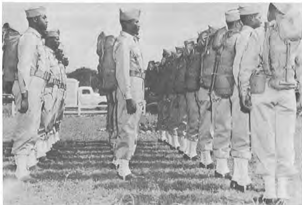
SERGEANT DRESSING THE LINE. Aviation squadron standing inspection, 1943.

Corps faced strong opposition when both the civil rights advocates and the rest of the Army attacked this exclusion. The civil rights organizations wanted a place for Negroes in the glamorous Air Corps, but even more to the point the other arms and services wanted this large branch of the Army to absorb its fair share of black recruits, thus relieving the rest of a disproportionate burden.