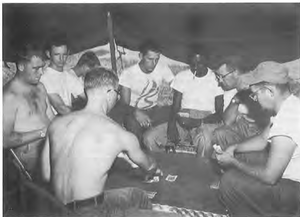
USAF GROUND CREW, TAN SON NHUT AIR BASE, VIETNAM, relaxes over cards in the alert tent.

satisfaction with the pace of reform. Certainly no one equated the importance of on-base discrimination with the blatant off-base discrimination that had captured everyone's attention. In fact, problems as potentially explosive as the discrimination in the administration of military justice were all but ignored during the 1960's. 79