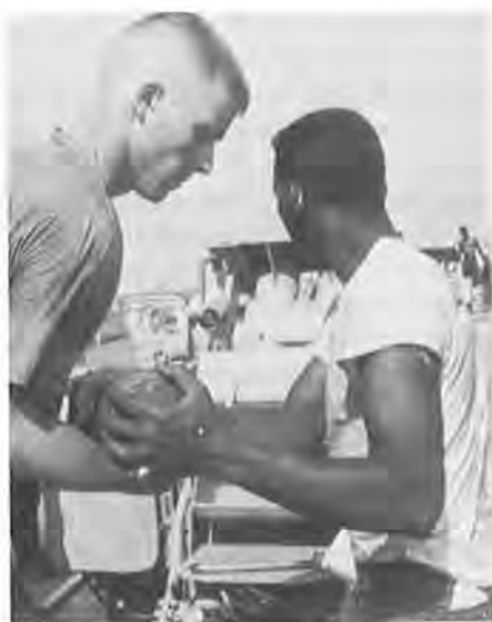
LOADING A ROCKET LAUNCHER. Crewmen of the USS Carronade participating in a coordinated gunfire support action near Chu Lai, Vietnam.

The Gillem Board Report would hardly be classified as progressive by later standards; its provisions for reducing the size of black units and integrating a small number of black specialists were, in a way, an effort to make segregation less wasteful. Nevertheless, with all its shortcomings, this postwar policy contained the germ of integration. It committed the Army and Air Force to total integration as a long-range objective, and, more important, it made permanent the wartime policy of allotting 10 percent of the Army's strength to Negroes. Later branded by the civil rights spokesmen as an instrument for limiting black enlistment, the racial quota committed the Army and its offspring, the Air Force, not only to maintaining at least 10 percent black strength but also to assigning black servicemen to all branches and all job categories, thereby