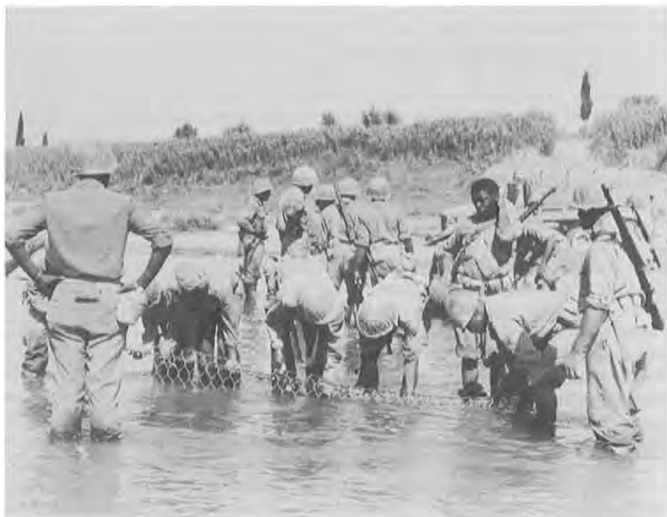
92D DIVISION ENGINEERS PREPARE A FORD FOR ARNO RIVER TRAFFIC

in the 25th Infantry, singled out the "continuous dissension and suspicion characterizing the relations between white and colored officers of the division." All tended to stress what they considered inadequate jungle training, and, like many white observers, they all agreed the combat period was too brief to demonstrate the division's developing ability. 40