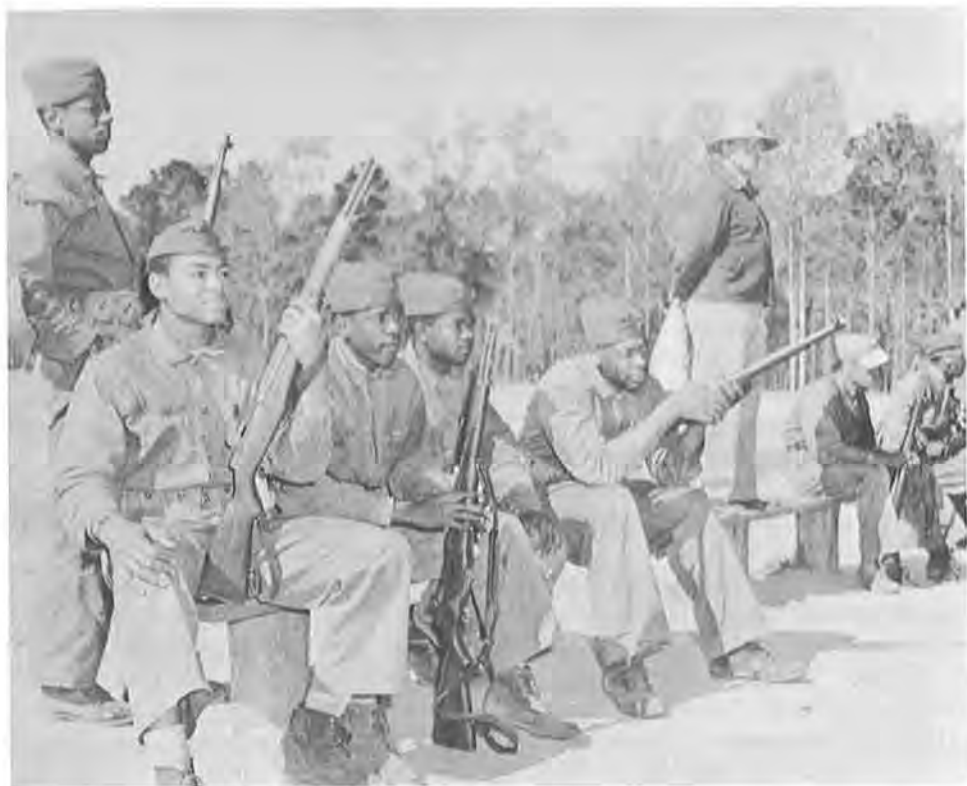
MARINES OF THE 51ST DEFENSE BATTALION await turn on rifle range, Montford Point, 1942.

The enlistment process proved difficult. The commandant reported that despite predictions of black educators to the contrary the corps had netted only sixty-three black recruits capable of passing the entrance examinations during the first three weeks of recruitment. 14 As late as 29 October the Director of Plans and Policies was reporting that only 647 of the scheduled 1,200 men (the final strength figure decided upon for the all-black unit) had been enlisted. He blamed the occupational qualifications for the delay, adding that it was doubtful "if even white recruits" could be procured under such strictures. The commandant approved his plan for enlisting Negroes without specific qualifications and instituting a modified form of specialist training. Black marines would not be sent to specialist schools "unless there is a colored school available," but instead Marine instructors would be sent to teach in the black camp. 15 In the end many of these first black specialists received their training in nearby Army installations.