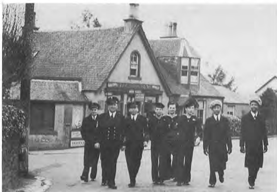
SHORE LEAVE IN SCOTLAND. ( The distinctive uniform of the Coast Guard steward is shown. )

beach patrol operations. Organized in 1942 as outposts and lookouts against possible enemy infiltration of the nation's extensive coastlines, the patrols employed more than 11 percent of all the Coast Guard's enlisted men. This large group included a number of horse and dog patrols employing only black guardsmen. 53 In all, some 2,400 black Coast Guardsmen served in the shore establishment.