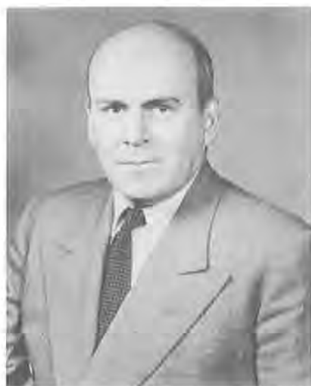
ASSISTANT SECRETARY MCCLOY

humiliations black soldiers suffered in the community outside the limits of the base. 17 One particularly telling example of such discrimination that circulated in the black press in 1945 described German prisoners of war being fed in a railroad restaurant while their black Army guards were forced to eat outside. But such discrimination toward black servicemen was hardly unique, and the civil rights advocates were quick to point to the connection between such practices and low morale and performance. For them there was but one answer to such discrimination: all men must be treated as individuals and guaranteed equal treatment and opportunity in the services. In a word, the armed forces must integrate. They pointed with pride to the success of those black soldiers who served in in-