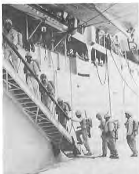
TRAINING EXERCISES. Black Marine unit boards ship at Morehead City, North Carolina, 1949.

But these reforms, which did very little for a very few men, scarcely dented the Marine Corps' racial policy. Corps officials were still firmly committed to strict segregation in 1948, and change seemed very distant. Any substantial modification in racial policy would require a revolution against Marine tradition, a movement dictated by higher civilian authority or touched off by an overwhelming military need.