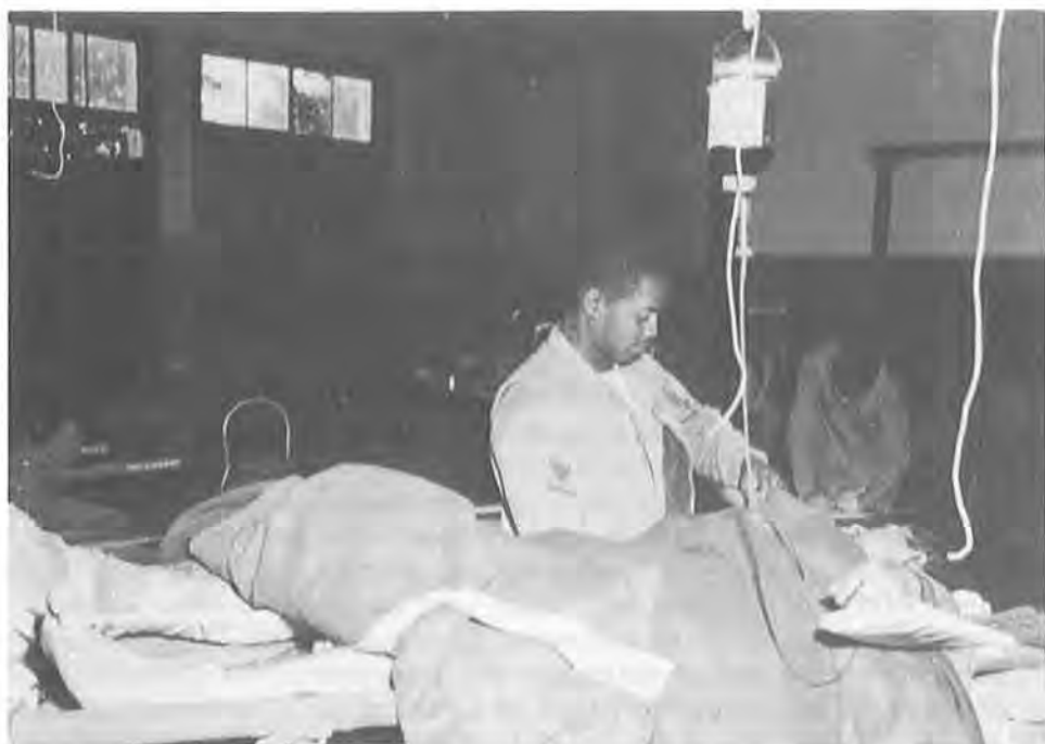
NAVY CORPSMAN IN KOREA attends wounded from the 1st Marine Division, 1950.