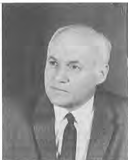
ASSISTANT SECRETARY ZUCKERT

Zuckert also deleted several clauses in the supplementary letter to Air Force commanders that was to accompany and explain the order. These clauses had listed possible exemptions from the new order: one made it possible to retain a man in a black unit if he was one of the "key personnel" considered necessary for the successful functioning of a black unit, and the other allowed the local commander to keep those Negroes he deemed "best suited" for continued assignment to black units. The free reassignment of all eligible Negroes, particularly the well-qualified, was essential to the eventual dissolution of the all-black units. The Fahy Committee had objected to these provisions and considered it important for the Air Force to delete them, 21 but the matter was not raised during the committee hearings. There is evidence that the deletions were actually requested by the Secretary of Defense's Personnel Policy Board, whose influence in the integration of the Air Force is often overlooked. 22