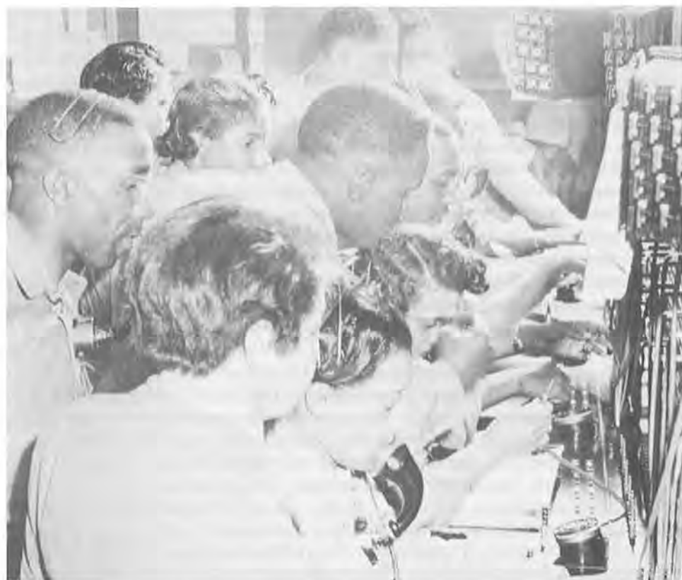
WAAC REPLACEMENTS training at Fort Huachuca, December 1942.

The segregationists attacked integration of the officer candidate schools for the obvious reasons. A group of Florida congressmen, for example, protested to the Army against the establishment of an integrated Air Corps school at Miami Beach. The War Department received numerous complaints when living quarters at the schools were integrated. The president of the White Supremacy League complained that young white candidates at Fort Benning "have to eat and sleep with Negro candidates," calling it "the most damnable outrage that was ever perpetrated on the youth of the South." To all such complaints the War Department answered that separation was not always possible because of the small number of Negroes involved. 96