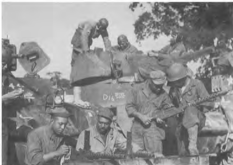
TANKERS OF THE 761ST MEDIUM TANK BATTALION prepare for action in the European theater, August 1944.

schools. 87 The War Department ignored the subject of race when it established the officer candidate schools in 1941. "The basic and predominating consideration governing selections to OCS," The Adjutant General announced, would be "outstanding qualities of leadership as demonstrated by actual services in the Army." 88 General Davis, who participated in the planning conferences, reasoned that integrated training would be vital for the cooperation that would be necessary in battle. He agreed with the War Department's silence on race, adding, "you can't have Negro, white, or Jewish officers, you've got to have American officers." 89