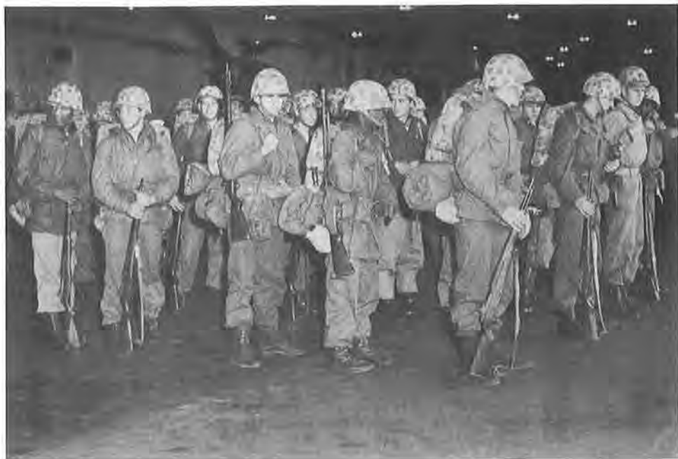
MARINES FROM CAMP LEJEUNE ON THE USS VALLEY FORGE for training exercises , 1958.

stewards to instruct members of the branch in the latest techniques of cooking and baking, supervision, and management. 29 In August 1954 the commandant established an advanced twelve-week course for stewards based on the Navy's successful system.