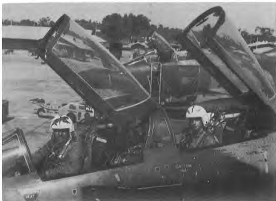
FIGHTER PILOTS ON THE LINE. Col. Daniel (Chappie) James, Jr., commander of an F-4 jet, and his pilot readying for takeoff from a field in Thailand.

measures, utilizing in the cause their command-community relations committees. Consisting of base officials and local business and community leaders, these committees had originally been organized by the services to improve relations between the base and town. Henceforth, they would become the means by which the local commanders might introduce measures to secure equal treatment for servicemen. 6