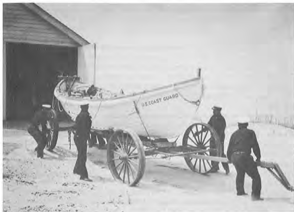
CREWMEN OF USCG LIFEBOAT STATION, PEA ISLAND, NORTH CAROLINA, ready surfboat for launching.

facilities were of sufficient moment to overcome the sentiment against significant racial change, which was kept to a minimum. Judged strictly in terms of keeping racial harmony, the corps policy must be considered a success. Ironically this very success prevented any modification of that policy during the war.