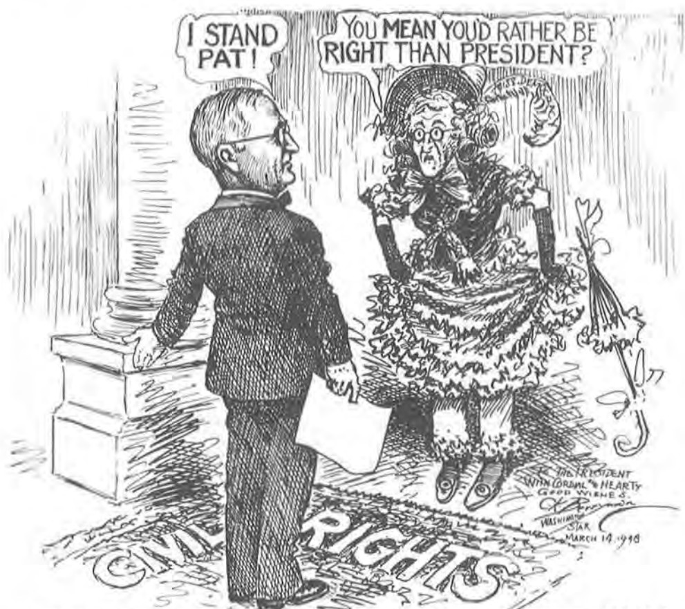
TRUMAN'S CIVIL RIGHTS CAMPAIGN as seen by Washington Star cartoonist Clifford K. Berryman, March 14, 1948.

military training. These he considered too vital to the nation's defense to risk grounding on the shoals of racial controversy. For the time being at least, integration of the armed forces would have to be played down, and any civil rights progress in the Department of Defense would have to depend on the persuasiveness of James Forrestal.