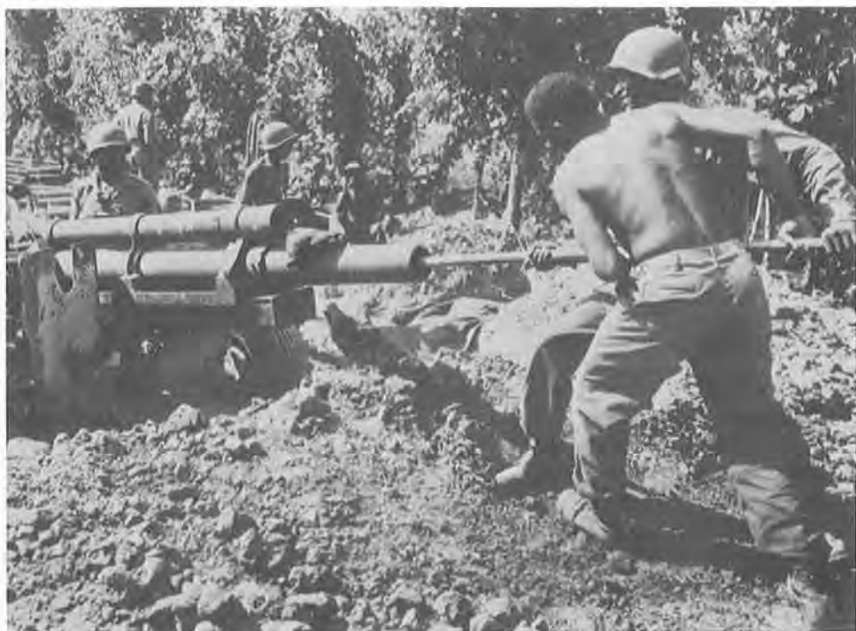
GUN CREW OF BATTERY B, 598th FIELD ARTILLERY, moving into position near the Arno River, Italy, September 1944.

Baker had established a separate training school for black officer candidates at Fort Des Moines, Iowa, with disappointing results. To fill its quotas the school had been forced to lower its entrance standards, and each month an arbitrary number of black officer candidates were selected and graduated with little regard for their qualifications. Many World War I commanders agreed that the black officers produced by the school proved inadequate as troop commanders, and postwar staff studies generally opposed the future use of black officers. Should the Army be forced to accept black officers in the future, these commanders generally agreed, they should be trained along with whites. 85