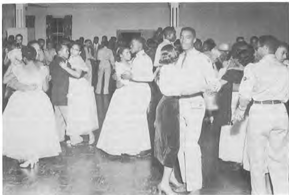
SPRING FORMAL DANCE, FORT GEORGE G. MEADE, MARYLAND, 1952

Information. 45 These officers decided that "if the Secretary of the Army so orders," the Army could activate an experimental unit in the 3d Infantry Division at Camp Campbell, Kentucky. The troops, 10 percent of them black, would be drawn from all parts of the country and include ten black officers, none above the rank of major. The unit would be carefully monitored by the Army staff, and its commander would report on problems encountered after a year's trial.