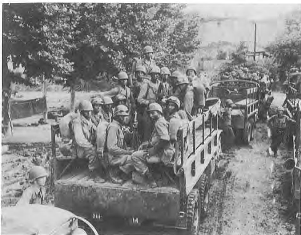
MOVING UP. 25th Division infantrymen head for the front, Korea, July 1950.

The effect of these increases on a segregated army was tremendous. By April 1951, black units throughout the Army were reporting large overstrengths, some as much as 60 percent over their authorized organization tables. Overstrength was particularly evident in the combat arms because of the steady increase in the number of black soldiers with combat occupational specialties. Largely assigned to service units during World War II—only 22 percent, about half the white percentage, were in combat units—Negroes after the war were assigned in ever-increasing numbers to combat occupational specialties in keeping with the Gillem Board recommendation that they be trained in all branches of the service. By 1950 some 30 percent of all black soldiers were in combat units, and by June 1951 they were being assigned to the combat branches in approximately the same percentage as white soldiers, 41 percent. 6