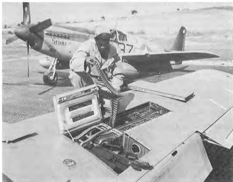
CHECKING AMMUNITION. An armorer in the 332d Fighter Group inspects the P-51 Mustang, Italy, 1945.

occupational specialty as against 92.7 percent of whites, but the number of Negroes in radar, aviation specialist, wire communications, and other highly specialized skills required to support a tactical air unit was small and far below the percentage of whites. The Air Force argued that since Negroes were assigned to black units and since there was only one black tactical unit, there was little need for Negroes with these special skills.