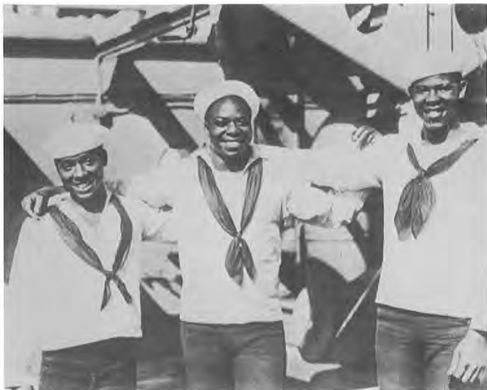
MESS ATTENDANTS, USS BUSHNELL, 1918

venereal disease but were engaged in preparing and serving food. Leaders within the branch itself, although selected on the basis of recommendations from superiors, examinations, and seniority, were often poor performers. Relations between the individual steward and the outfit to which he was assigned were often marked by personal conflicts and other difficulties. Consequently, while stewards eagerly joined the branch in the Regular Navy, the incidence of disciplinary problems among them was high. The branch naturally earned the opprobrium of civil rights groups, who were sensitive not only to the discrimination of a separate branch for minorities but also to the unfavorable image these men created of Negroes in the service. 17