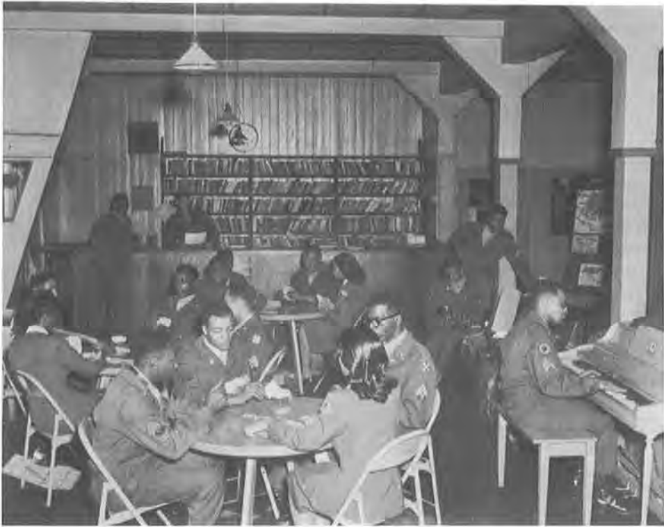
BRIDGE PLAYERS, SEAVIEW SERVICE CLUB, TOKYO, JAPAN, 1948

the number and variety of black units that could be formed and consequently the number and variety of jobs available to Negroes. Further, it restricted the openings for Negroes in the Army's training schools.