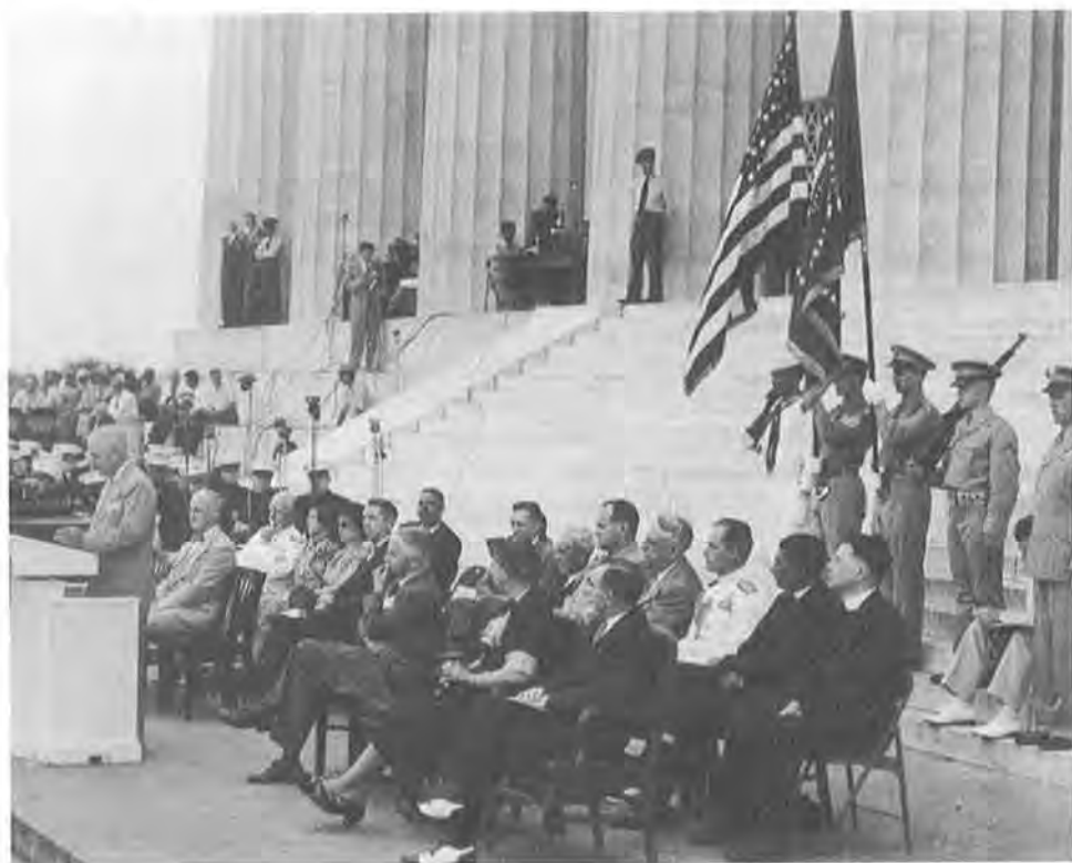
PRESIDENT TRUMAN ADDRESSING THE NAACP CONVENTION, Lincoln Memorial, Washington, D.C., June 1947. Seated at the President's left are Walter White, Eleanor Roosevelt, and Senator Wayne Morse; visible in the rear row are Admiral of the Fleet Chester W. Nimitz, Attorney General Tom C. Clark, and Chief Justice Fred M. Vinson.