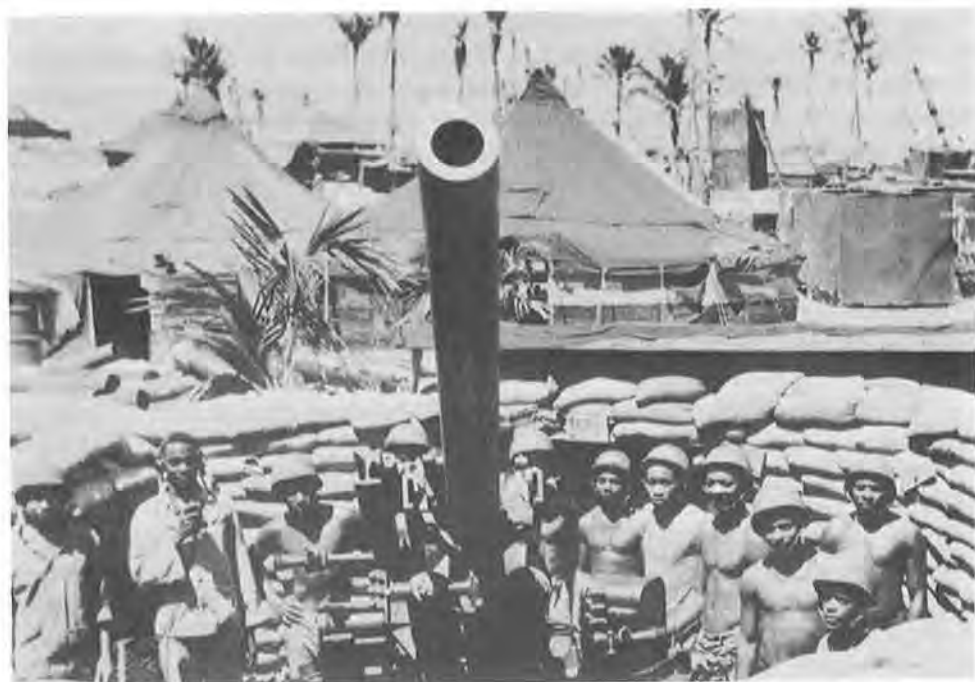
GUN CREW OF THE 52D DEFENSE BATTALION on duty, Central Pacific, 1945.

eighteen white defense battalions were subsequently reorganized as antiaircraft artillery battalions for use with amphibious groups in the forward areas. While the two black units were similarly reorganized, only they and one of the white units retained the title of defense battalion. Their deployment was also different. The policy of self-contained, segregated service was, in the case of a large combat unit, best followed in the rear areas, and the two black battalions were assigned to routine garrison duties in the backwaters of the theater, the 51st at Eniwetok in the Marshalls, the 52d at Guam. The latter unit saw nearly half its combat-trained men detailed to work as stevedores. It was not surprising that the morale in both units suffered. 31