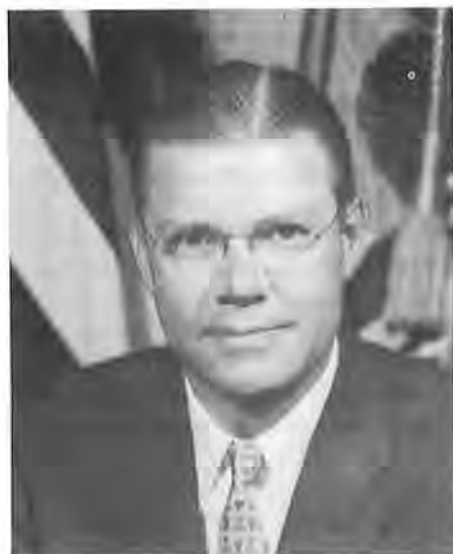
SECRETARY OF DEFENSE MCNAMARA

Such restrictions could not last much longer. Given the civil rights temper of the times—1963 witnessed the mammoth march on Washington, the introduction of President Kennedy's civil rights bill, and the landmark directive of the Secretary of Defense on equal opportunity in the armed forces—a total prohibition on servicemen's participation in demonstrations appeared more and more incongruous. Finally, on 16 July 1963, McNamara relaxed the department's policy. Still declaring such participation inappropriate and unnecessary for servicemen in view of their "special obligations of citizenship," he nevertheless lifted the ban on military participation in demonstrations, provided that the uniform was not worn; such ac-