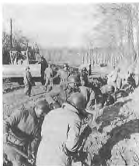
ROAD REPAIRMEN, Company A, 279th Engineer Battalion, near Rimberg, Germany, December 1944.

when properly trained and motivated and treated with fairness, blacks, like whites, performed with bravery and distinction in combat. Finally, the experiment successfully attacked one of the traditionalists' shibboleths, that close association of the races in Army units would cause social dissension.