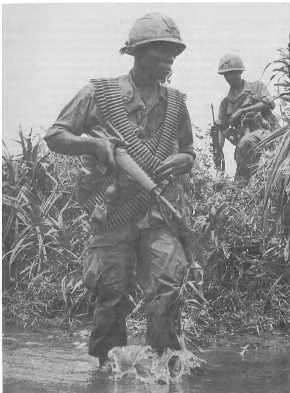
VIETNAM PATROL. Men of the 35th Infantry advance during "Operation Baker."