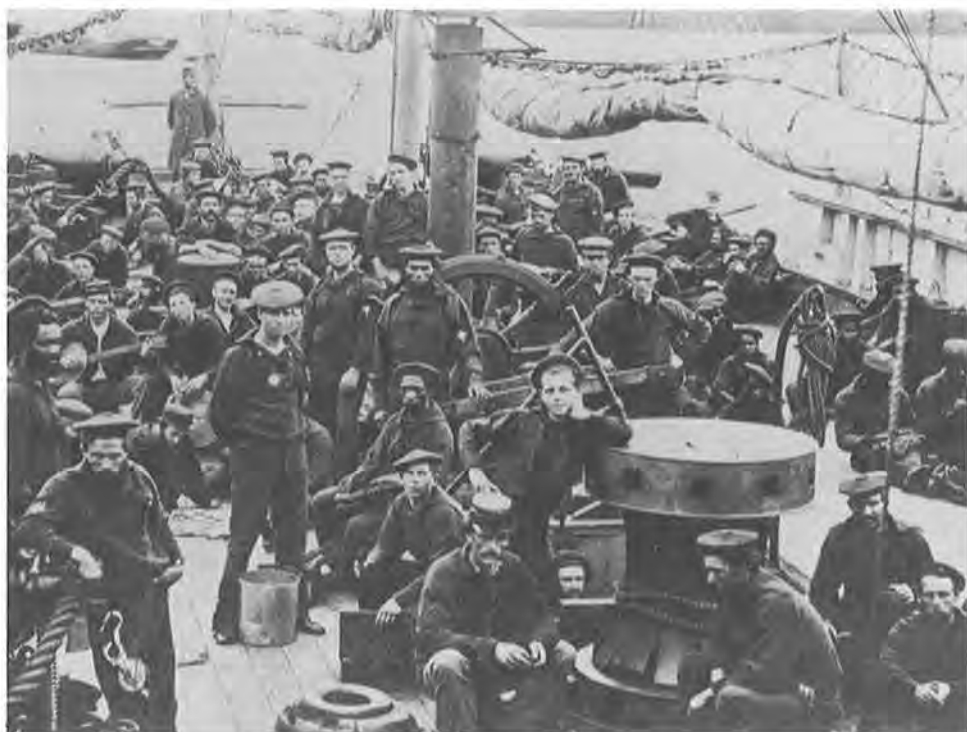
CREWMEN OF THE USS MIAMI DURING THE CIVIL WAR

after 1900. Paralleling the rise of Jim Crow and legalized segregation in much of America was the cutback in the number of black sailors, who by 1909 were mostly in the galley and the engine room. In contrast to their high percentage of the ranks in the Civil War and Spanish-American War, only 6,750 black sailors, including twenty-four women reservists (yeomanettes), served in World War I; they constituted 1.2 percent of the Navy's total enlistment. 4 Their service was limited chiefly to mess duty and coal passing, the latter becoming increasingly rare as the fleet changed from coal to oil.