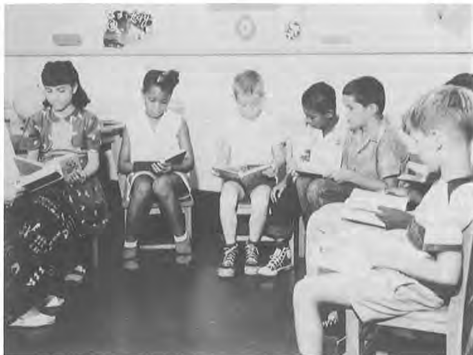
READING CLASS IN THE MILITARY DEPENDENTS SCHOOL, Yokohama, Japan, 1955.

the St. Mary's County, Maryland, school board. 85 A lease for the temporary use of buildings by local authorities for segregated schools on the grounds of the New Orleans Naval Air Station was allowed to run on until 1959 because of technicalities in the lease, but not, however, without considerable public comment. 86