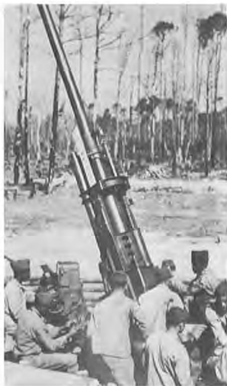
MARINE ARTILLERY TEAM. Men of the 51st Defense Battalion in training at Montford Point with 90-mm. antiaircraft gun.