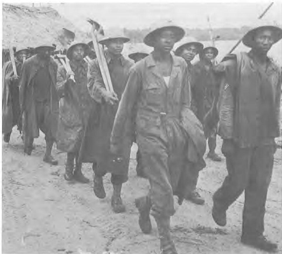
ENGINEER CONSTRUCTION TROOPS IN LIBERIA, JULY 1942

making room for more black inductees by forcing its arms and services to create more black units. Again the cost to efficiency was high.