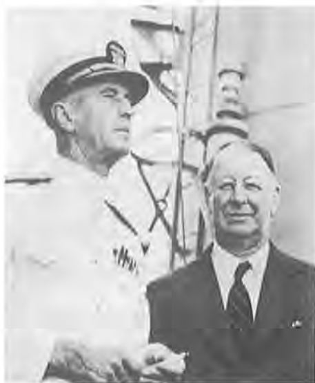
ADMIRAL KING AND SECRETARY KNOX on the USS Augusta .

Knox that integration of the Navy was an impractical step in wartime, but where Knox saw exclusion from general service as the alternative to integration Roosevelt sought a compromise. He suggested that the Navy "make a beginning" by putting some "good Negro bands" aboard battleships. Under such intimate living conditions white and black would learn to know and respect each other, and "then we can move on from there." 11 In effect the President was trying to lead the Navy toward a policy similar to that announced by the Army in 1940. While his suggestion about musicians was ignored by Secretary Knox, the search for a middle way between exclusion and integration had begun.