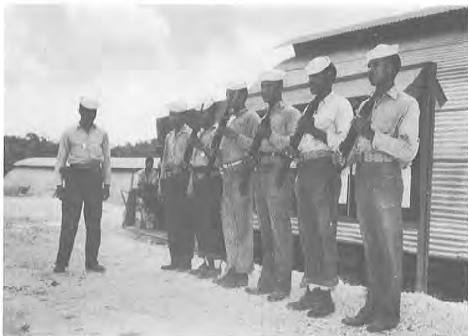
SECURITY WATCH IN THE MARIANAS. Ratings of these men guarding an ammunition depot include boatswain, second class, seaman, first class, and fireman, first class.

qualifications of these officers were to be kept under constant review. In December he singled out the commands in the Pacific area, which had a heavy concentration of all-black base companies, calling for a reform in their employment and advancement of Negroes. 109