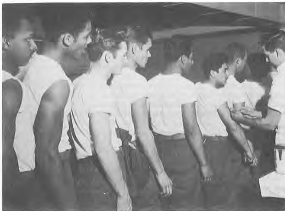
BROTHERS UNDER THE SKIN, inductees at Fort Sam Houston, Texas, 1953.

estimate was off by several months. The European Command's 94th Engineer Battalion, the last major all-black unit, was inactivated in November 1954, several weeks after the Secretary of Defense had announced the end of all segregated units. 96