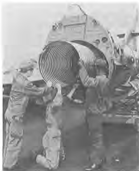
MAINTENANCE CREW, 462d Strategic Fighter Squadron, disassembles aft section of an F-84 Thunderstreak.

Without a doubt the new policy improved the Air Force's manpower efficiency, as the experience of the 3202d Installation Group illustrates. A segregated unit serving at Eglin Air Force Base, Florida, the 3202d was composed of an all-black heavy maintenance and construction squadron, a black maintenance repair and utilities squadron, and an all-white headquarters and headquarters squadron. This rigid segregation had caused considerable trouble for the unit's personnel section, which was forced to assign men on the basis of color rather than military occupational specialty. For example, a white airman with MOS 345, a truck driver, although assigned to the unit, could not be assigned to the heavy maintenance and construction squadron where his specialty was authorized but had to be assigned to