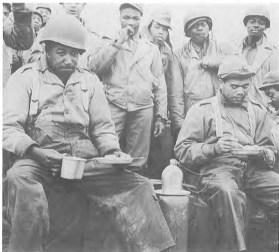
LABOR BATTALION TROOPS IN THE ALEUTIAN ISLANDS, MAY 1943. Stevedores pause for a hot meal at Massacre Bay.

recalcitrant of branches in accepting Negroes, the Air Corps had successfully exempted itself from the allotment of black troops in the 1940 mobilization plans. Black pilots could not be used, Maj. Gen. Henry H. Arnold, Chief of the Air Corps, explained, "since this would result in having Negro officers serving over white enlisted men. This would create an impossible social problem." 23 And this situation could not be avoided, since it would take several years to train black mechanics; meanwhile black pilots would have to work with white ground crews, often at distant bases outside their regular chain of command. The Air