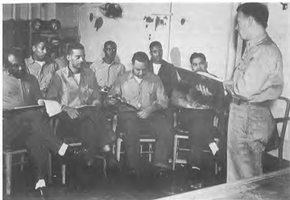
BROADENING SKILLS. Stewards on the USS Valley Forge volunteer for classes leading to advancement in other fields, Korea, 1950.

petty officers. 76 These distinctions were true also for stewards in the first, second, and third classes, a fact in their case symbolized by differences in uniform. Most of the thousands of black stewards continued to be recruited, trained, and employed exclusively in that branch, and thus for over half the Negroes—65 percent—in the 1949 Navy the chance for advancement was severely limited and the chance to qualify for a different job almost nonexistent.