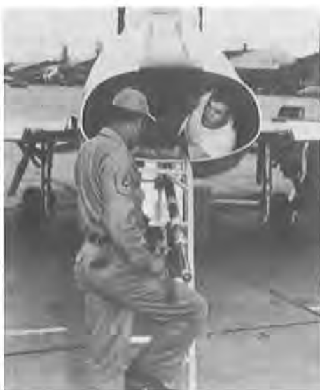
JET MECHANICS work on an F-100 Supersabre, Foster Air Force Base, Texas.

But this problem could not detract from what had been accomplished on the bases. Judged by the standards it set for itself before the Fahy Committee, the