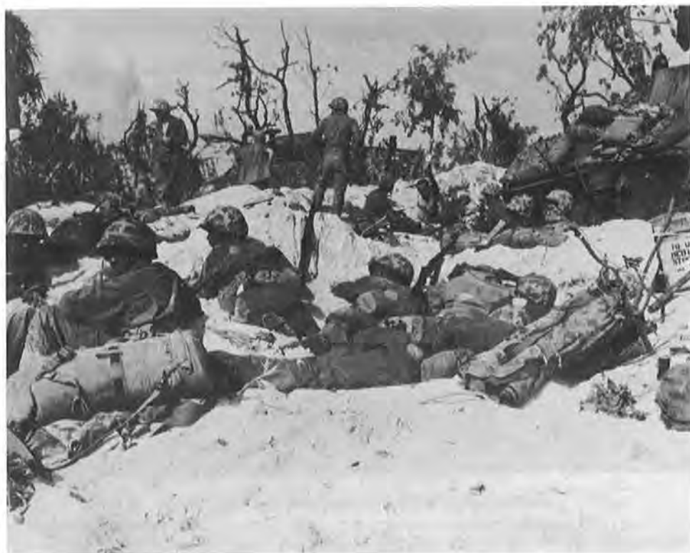
D-DAY ON PELELIU. Support troops participate in the landing of 1st Marine Division.

rank and color. Undeterred by a lack of personal experience with interracial command, he was led in the name of racial harmony to an unpopular conclusion. "It is essential," he told his commanders, "that in no case shall there be colored noncommissioned officers senior to white men in the same unit, and desirable that few, if any be of the same rank." 22 He was particularly concerned with the period when white instructors and noncommissioned officers were being phased out of black units. He wanted Negroes up for promotion to corporal transferred, before promotion, out of any unit that contained white corporals.