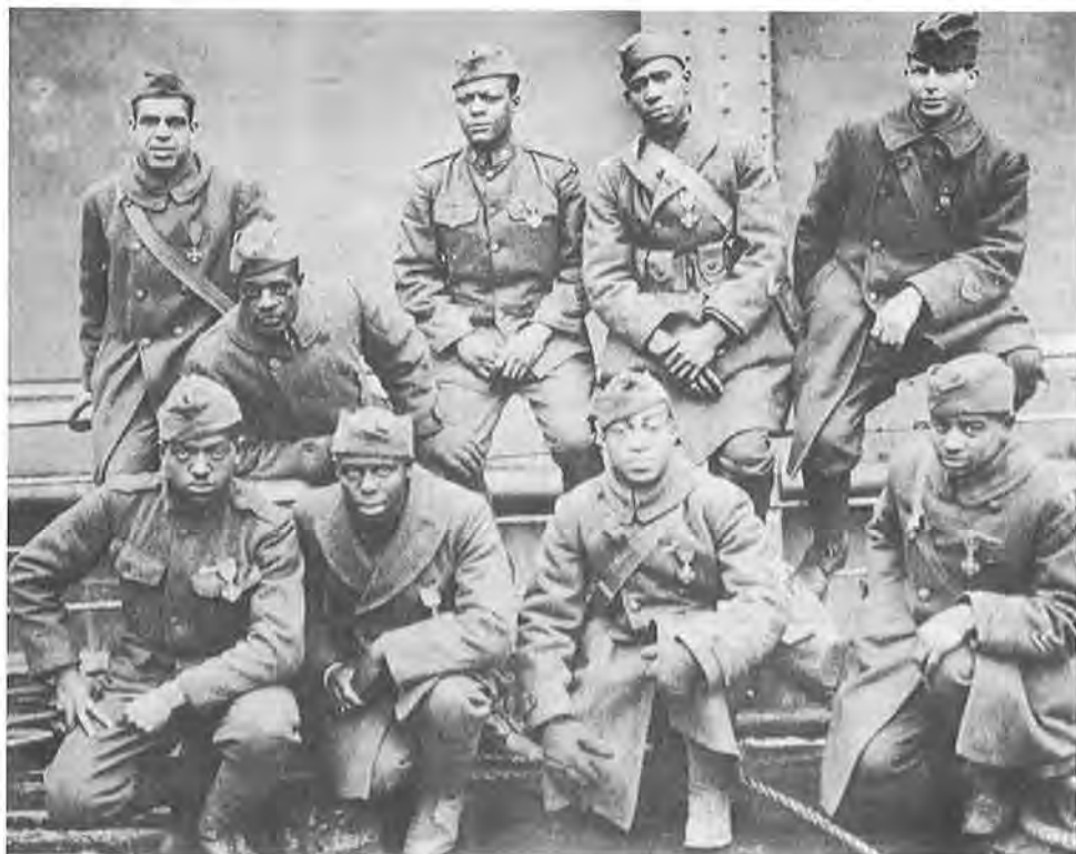
HEROES OF THE 369TH INFANTRY. Winners of the Croix de Guerre arrive in New York Harbor, February 1919.

of black conscripts was to be a principal factor in the separate decisions of the Army, Navy, and Marine Corps to integrate their units.