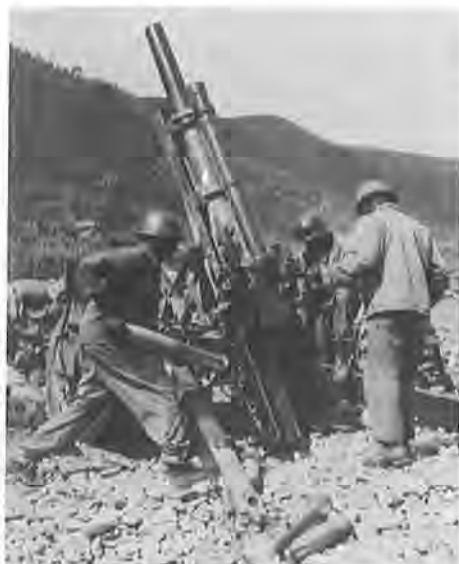
MEN OF BATTERY A, 159th Field Artillery Battalion, fire 105-mm. howitzer, Korea, August 1950.