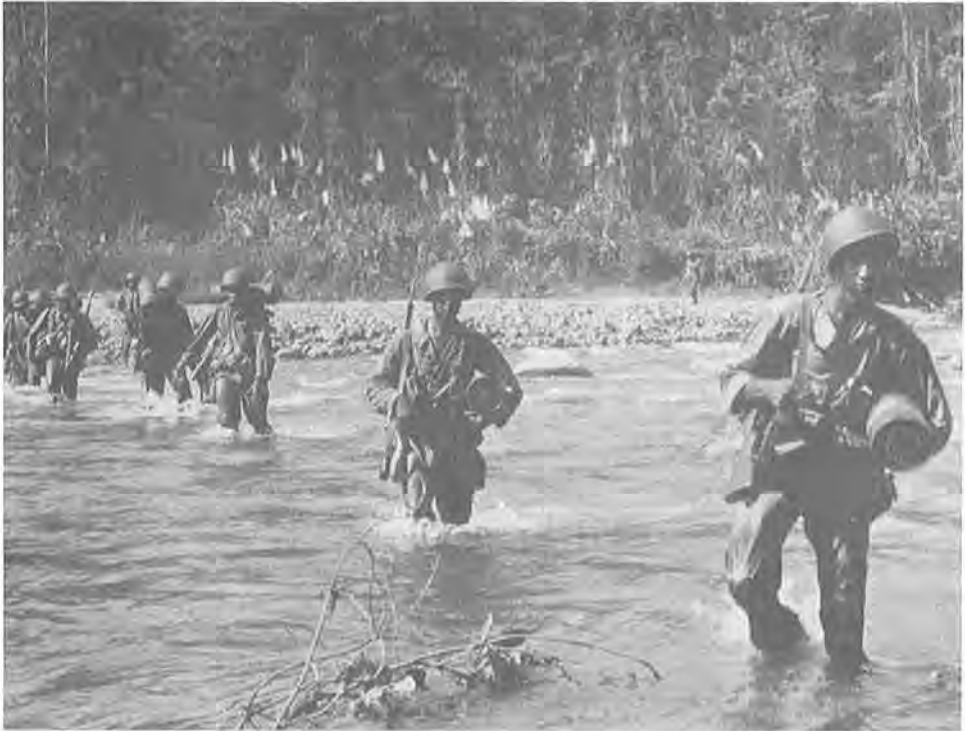
93D DIVISION TROOPS IN BOUGAINVILLE, APRIL 1944. Men, packing mortar shells, cross the West Branch Texas River.

units who had not received "excellent" or higher in their efficiency ratings would be replaced before the units were scheduled for overseas deployment. 75 Given the "if practicable" loophole, there was little chance that all the units would go overseas with "excellent" commanders.