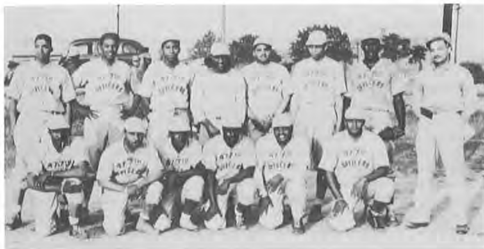
OFFICERS' SOFTBALL TEAM representing the 477th Composite Group, Godwin Field, Kentucky.

These changes flew in the face of the Gillem Board Report, for however slightly that document may have changed the Army's segregation policy, it did demand at least a modest response to the call for equal opportunity in training, assignment, and advancement. The board clearly looked to the command of black units by qualified black officers and the training of black airmen to serve as a cadre for any necessary expansion of black units in wartime. Certainly the conversion of black bomber pilots to fighters did not meet these modest demands. In its defense the Army Air Forces in effect pleaded that there were too many Negroes for its present force, now severely reduced in size and lacking planes and other equipment, and too many of the black troops lacked education for the variety of assignments recommended by the board.