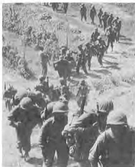
COMPANY I, 370TH INFANTRY, 92D DIVISION, advances through Cascina, Italy.

balance did not perform well, should be considered a failure of white leadership.