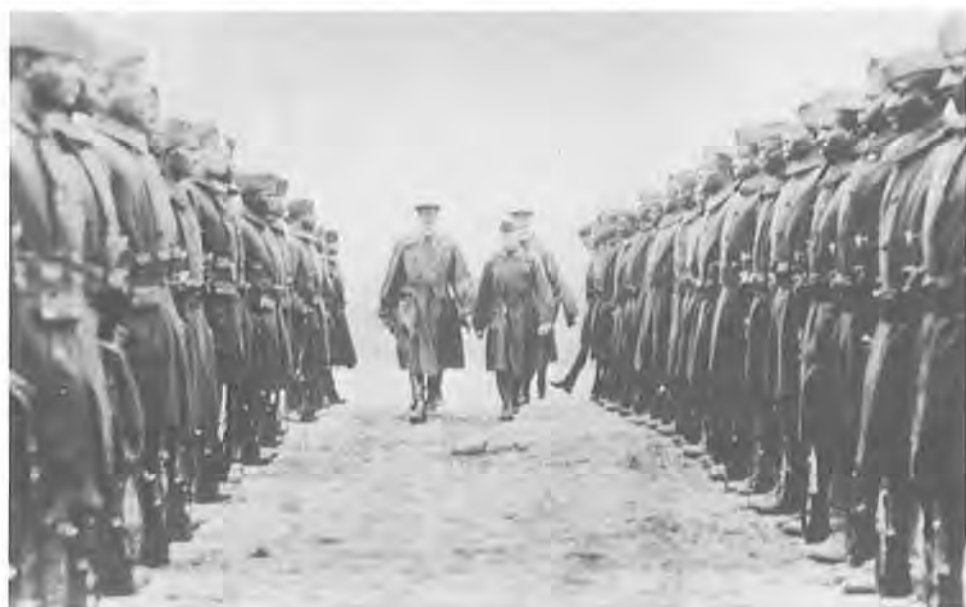
GENERAL PERSHING, AEF COMMANDER, INSPECTS TROOPS of the 802d (Colored) Pioneer Regiment in France, 1918.

in the House aimed at draftees . The Fish amendment passed the House by a margin of 121 to 99 and emerged intact from the House-Senate conference. The law finally read that in the selection and training of men and execution of the law "there shall be no discrimination against any person on account of race or color." 26