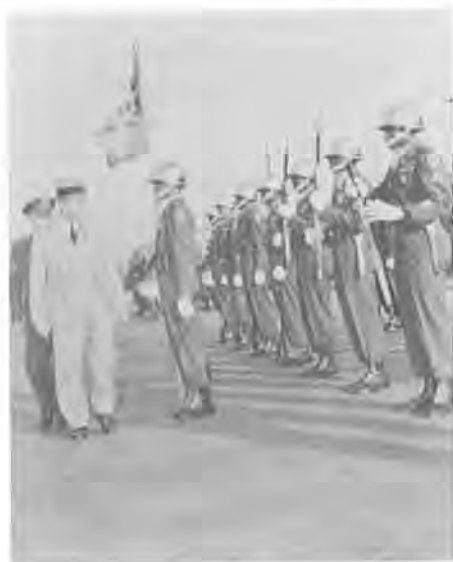
SECRETARY FORRESTAL, accompanied by General Huebner, inspects the 427th Army Band and the 777th EUCOM Honor Guard, Heidelberg, Germany, November 1948.