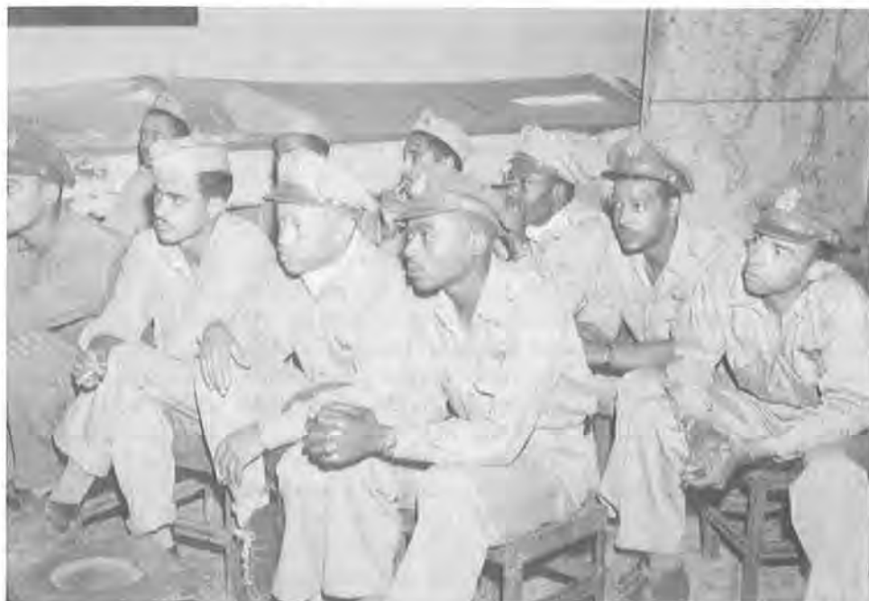
PILOTS OF THE 332D FIGHTER GROUP BEING BRIEFED for combat mission in Italy.

or else, in Judge Hastie's words, "not fly at all." 25 The 99th Fighter Squadron was organized at Tuskegee in 1941 and sent to the Mediterranean theater in April 1943. By then the all-black 332d Fighter Group with three additional fighter squadrons had been organized, and in 1944 it too was deployed to the Mediterranean.