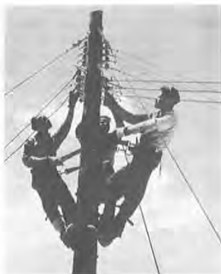
ELECTRICIAN MATES string power lines in the Central Pacific.

The Navy proceeded to assimilate the black volunteers along these lines, suffering few of the personnel problems that plagued the Army in the first months of the war. In contrast to the Army's chaotic situation, caused by the thousands of black recruits streaming in from Selective Service, the Navy's plans for its volunteers were disrupted only because qualified Negroes showed little inclination to flock to the Navy standard, and more than half of those who did were rejected. The Bureau of Naval Personnel 36 reported that during the first three weeks of recruitment only 1,261 Negroes volunteered for general service, and 58 percent of these had to be rejected for physical and other reasons. The Chief of Naval Personnel, Rear Adm. Randall Jacobs, was surprised at the small number of volunteers, a figure far below the planners' expectations, and his surprise turned to concern in the next months as the seventeen-year-old volunteer inductees, the primary target of the armed forces recruiters, continued to choose the Army over the Navy at a ratio of 10 to 1. 37 The Navy's personnel officials agreed that they had to attract their proper share of intelligent and able Negroes