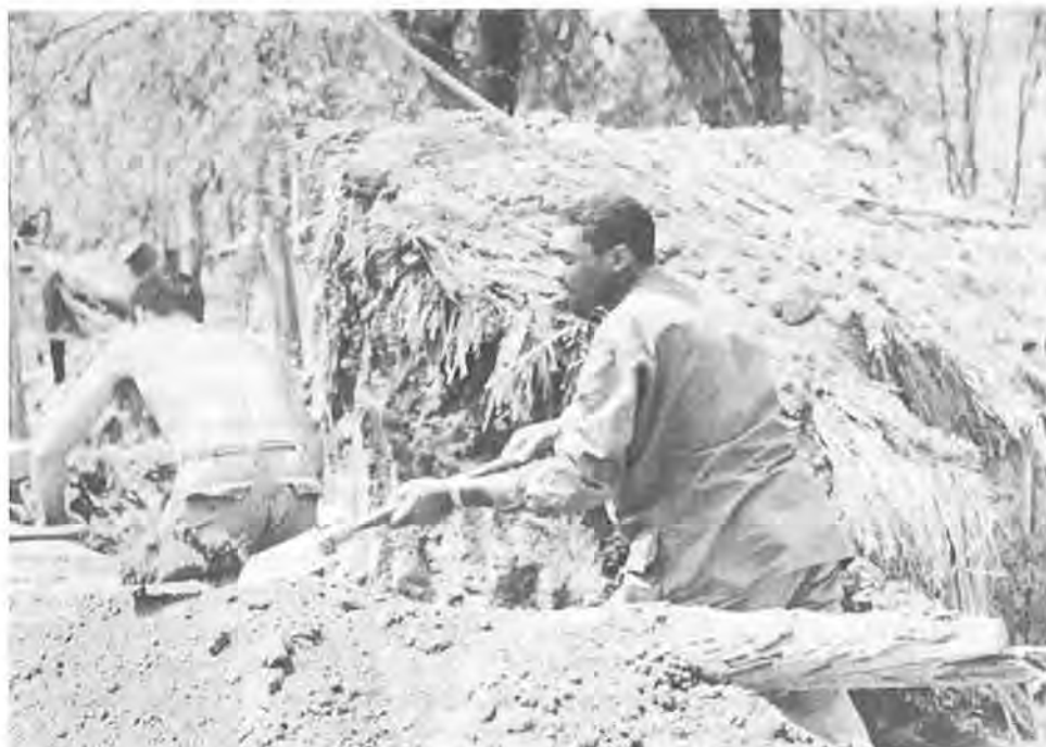
DIGGING IN. Men of M Company, 7th Marines, construct a defense bunker during "Operation Desoto," Vietnam.