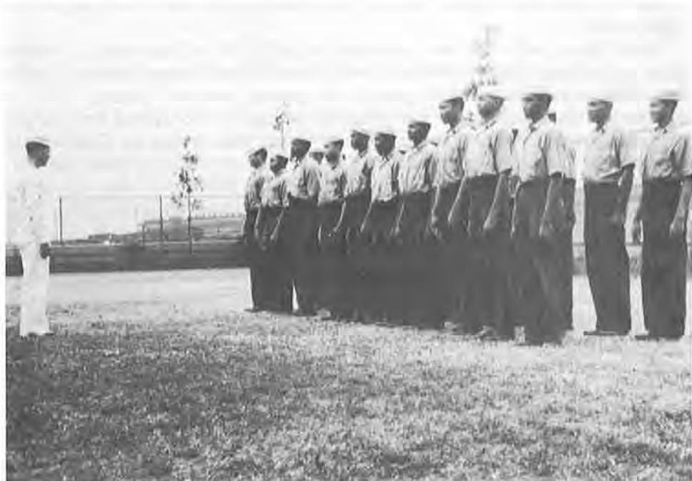
COAST GUARD RECRUITS at Manhattan Beach Training Station, New York.

small harbor craft. 36 They also served in the separate Steward's Branch, although it might be argued that the small size of most Coast Guard vessels integrated in fact men who were segregated in theory.