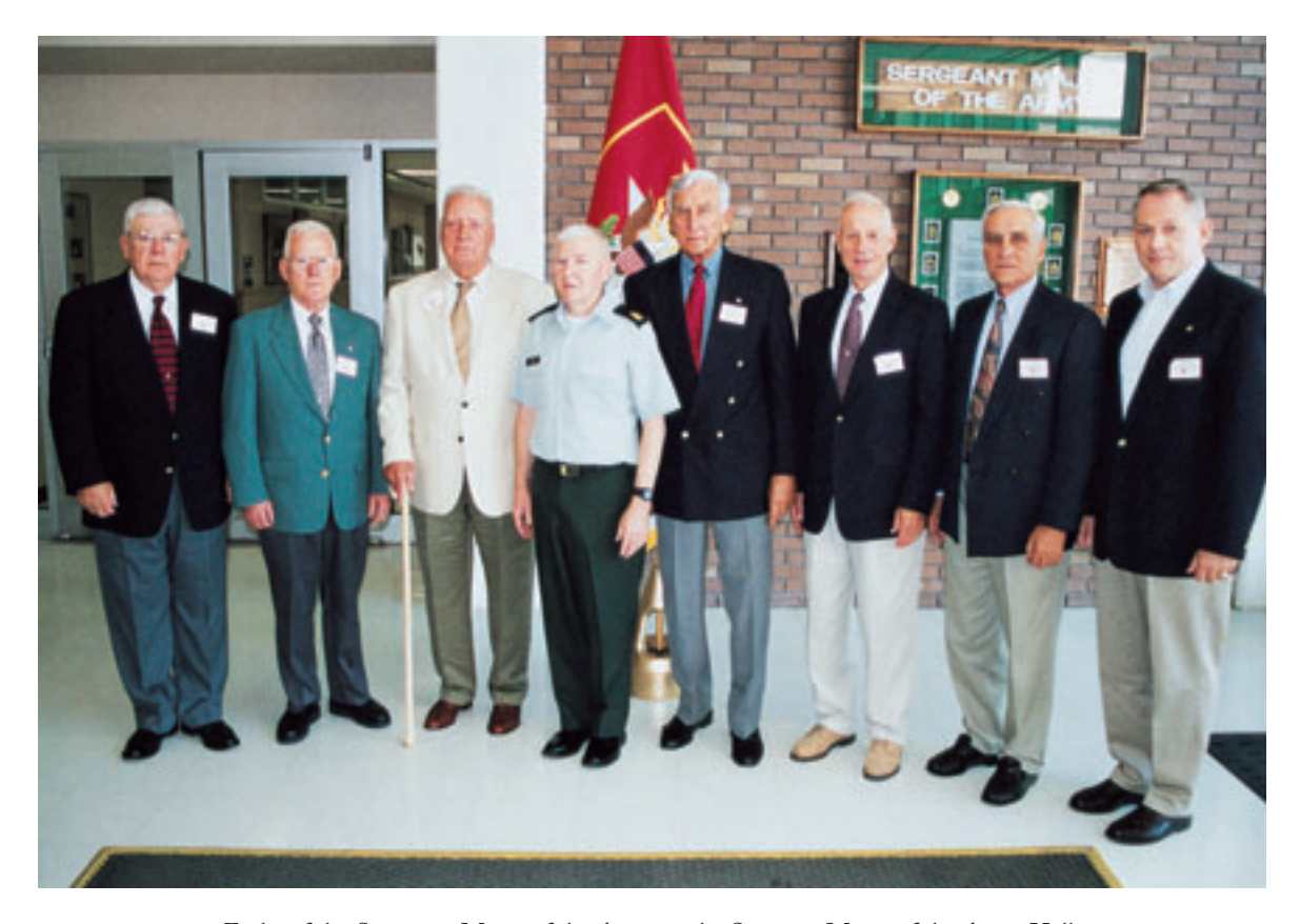
Eight of the Sergeants Major of the Army in the Sergeant Major of the Army Hall, U.S. Army Sergeants Major Academy, 2000

and involves a prestigious selection board of general officers and the incumbent SMA.