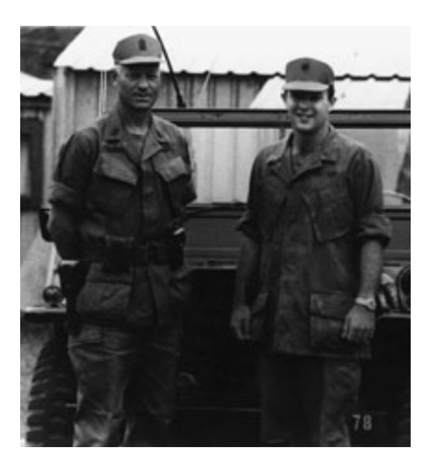
SMA Copeland Visits a Young Soldier.

out that directive. Although never established as policy or even communicated as a veiled threat, such attitudes often became discriminators when selecting NCOs for the post-Vietnam reduction in force.