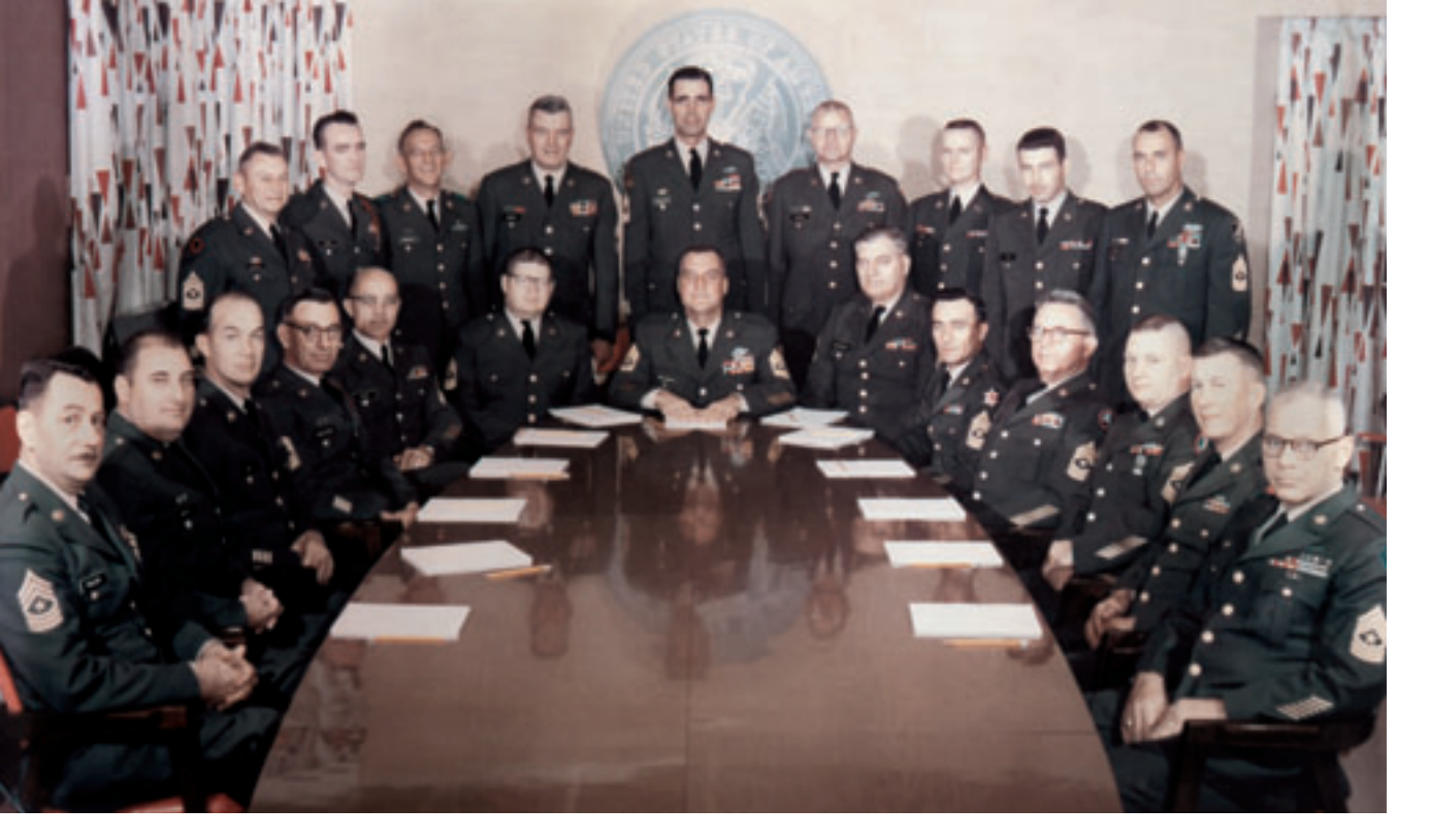
Attendees of the First Command Sergeants Major Conference, November 1966

he had gained the trust and confidence of the enlisted ranks. Consequently, most senior non-commissioned officers regarded the creation of the Office of Sergeant Major of the Army as "one of the finest things that had happened to the noncommissioned officer corps in recent memory."<sup>34</sup>