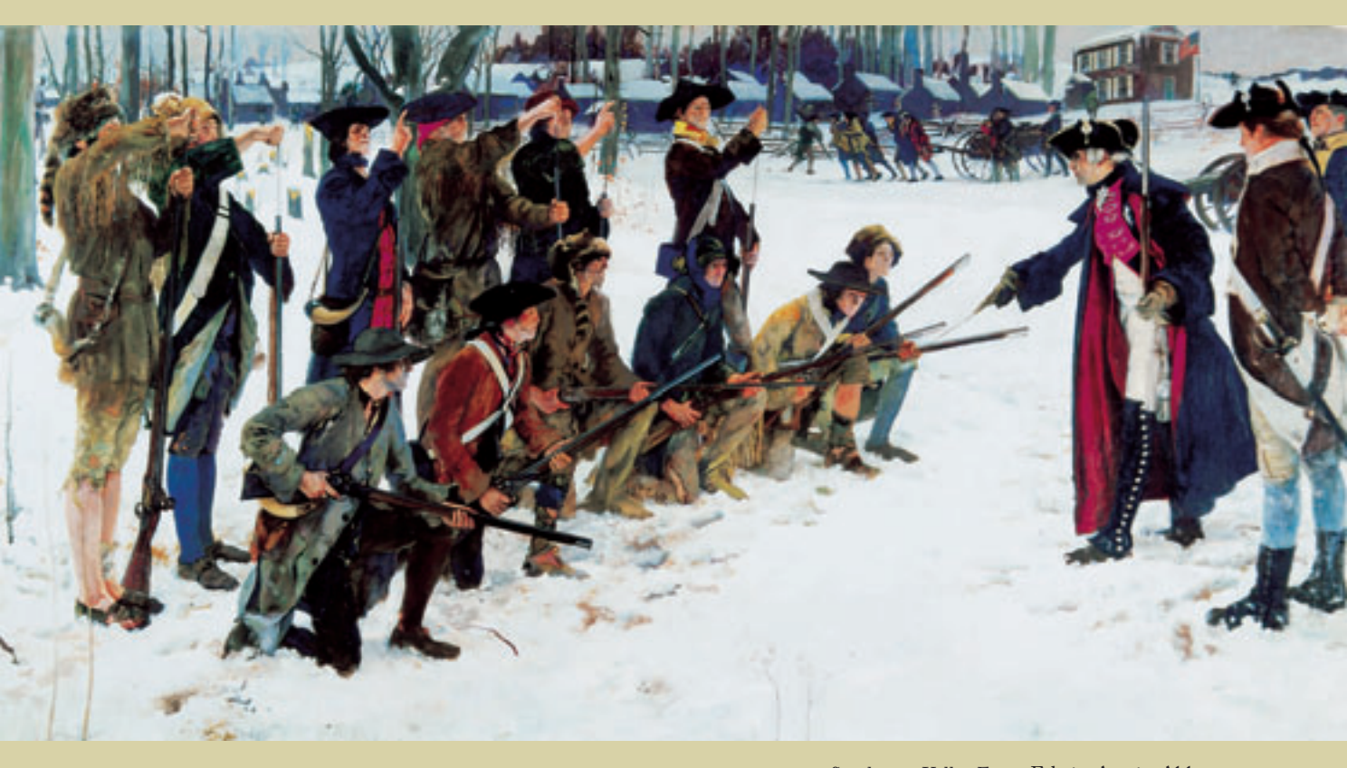
Steuben at Valley Forge, Edwin Austin Abbey