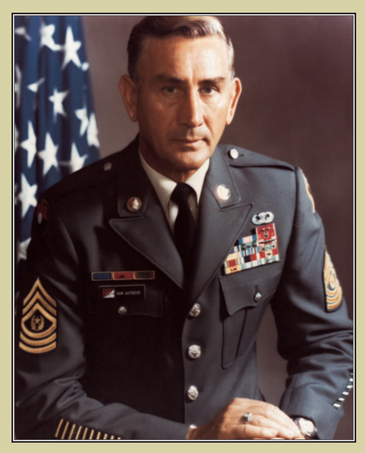
SMA Van Autreve