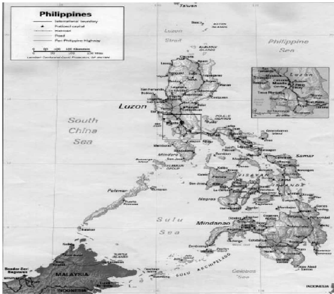
Figure 1. The Philippines